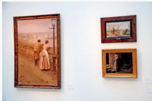
Fig. 6, Installation of Anders Zorn's Fisherman at St Ives, Cornwall , 1888 (left); Otto Hagborg's Interior of a Joinery at Pont Aven , c. 1886 (upper right); and Breton Woman Knitting in an Interior at Pont-Aven , 1883 (lower right). [larger image]

This clever curatorial play on the background colors of the installation and the atmosphere of the works themselves continues as the viewer exits the smaller exhibition rooms. In one marked transition, for example, the viewer leaves the intimacy of the red interior and emerges into a stark, white space that is dominated by scenes of mourning (Gustaf Theodor Wallén, The House of Mourning , 1892) and of quiet introspection (fig. 6). The cool colors of Anders Zorn's Fisherman at St-Ives, Cornwall (1888) and of Otto Hagborg's interior scenes at Pont Aven establish an emotional and psychological distance between the depicted figures and the viewer that is enhanced by the manner of their installation. These works also introduce another important theme of the exhibition, namely, the link between plein-airisme and both physical and intellectual interiority.