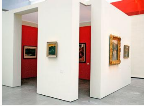
Fig. 5, View of one of the smaller exhibition rooms at the Palais des Beaux-Arts. [larger image]

This clever curatorial play on the background colors of the installation and the atmosphere of the works themselves continues as the viewer exits the smaller exhibition rooms. In one marked transition, for example, the viewer leaves the intimacy of the red interior and emerges into a stark, white space that is dominated by scenes of mourning (Gustaf Theodor Wallén, The House of Mourning , 1892) and of quiet introspection (fig. 6). The cool colors of Anders Zorn's Fisherman at St-Ives, Cornwall (1888) and of Otto Hagborg's interior scenes at Pont Aven establish an emotional and psychological distance between the depicted figures and the viewer that is enhanced by the manner of their installation. These works also introduce another important theme of the exhibition, namely, the link between plein-airisme and both physical and intellectual interiority.