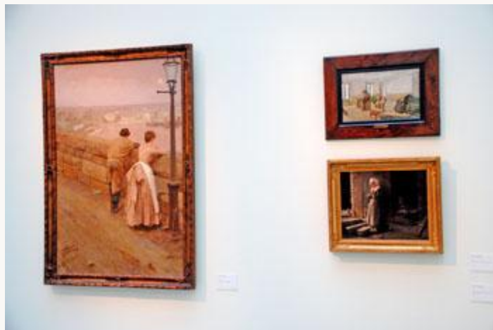
Fig. 6, Installation of Anders Zorn's Fisherman at St Ives, Cornwall , 1888 (left); Otto Hagborg's Interior of a Joinery at Pont Aven , c. 1886 (upper right); and Breton Woman Knitting in an Interior at Pont-Aven , 1883 (lower right). [return to text]