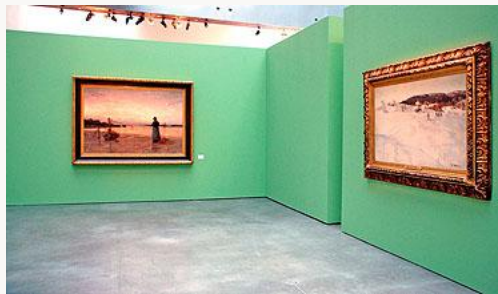
Fig. 9, Installation of Frithjof Smith-Hald's The Old Fishing Net , 1884 (left); and Frits Thaulow's Norwegian Winter , 1886 (right). [larger image]