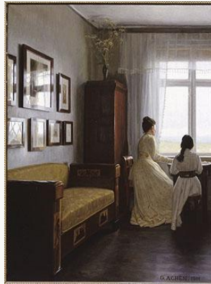
Fig. 7, Georg Nicolaj Achen, Interior , 1901. Oil on canvas. Paris, Musée d'Orsay, © RMN / Jean-Pierre Lagiewski. [larger image]

as Frank Claustrat makes clear in his valuable catalogue essay, many of the genre scenes included in the exhibition are primarily concerned with conveying a 'psychological atmosphere'. Landscape paintings that exploit a variety of lighting effects are paired with softly luminous interiors by artists such as Julius Paulsen, Peter Ilsted and Georg Achen (fig. 7). Further highlighting the link between natural and psychological landscapes, the curators cleverly juxtapose misty seascapes by Danish painter, Henry Brockman, with the depiction of solitary women by Paulsen, Achen and Ilsted. The viewer is invited to draw parallels between the imaginative life of the individual and dream-like meditations on nature.