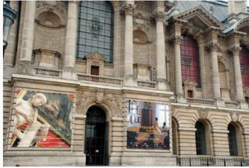
Fig. 2, Exterior of the Palais des Beaux-Arts, Lille, France. [larger image]

In addition to the intrinsic interest of the works on display and the artistic exchanges they illustrate between Northern Europe and France, the exhibition provides insight into an important aspect of nineteenth-century French museology. With one exception, the works in the exhibition are on loan from permanent collections of museums throughout France. By bringing these works together, the exhibition testifies to French interest in Nordic painting during the late nineteenth century and, more importantly, illustrates the aesthetic preferences of officials who administered the fine arts policies of the Third Republic. This particular feature of the exhibition also distinguishes it from two earlier exhibitions of Nordic painting in France, namely, The Painters' Europe at the Musée d'Orsay in 1993 and Northern Lights at the Petit Palais in 1987.