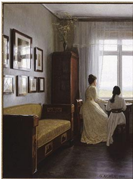
Fig. 7, Georg Nicolaj Achen, Interior , 1901. Oil on canvas. Paris, Musée d'Orsay. [return to text]