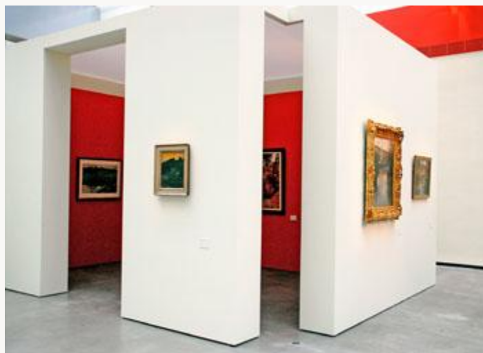
Fig. 5, View of one of the smaller exhibition rooms at the Palais des Beaux-Arts. [return to text]