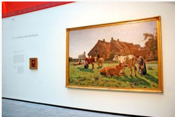
Fig. 3, Installation of Christian Skredsvig's A farm at Venoix , 1881. [return to text]