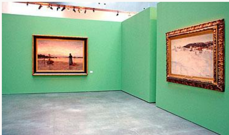
Fig. 9, Installation of Frithjof Smith-Hald's The Old Fishing Net , 1884 (left); and Frits Thaulow's Norwegian Winter , 1886 (right). [return to text]