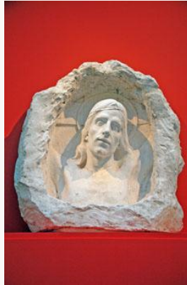
Fig. 11, Installation of Ville Vallgren's Christ , 1899. [larger image]