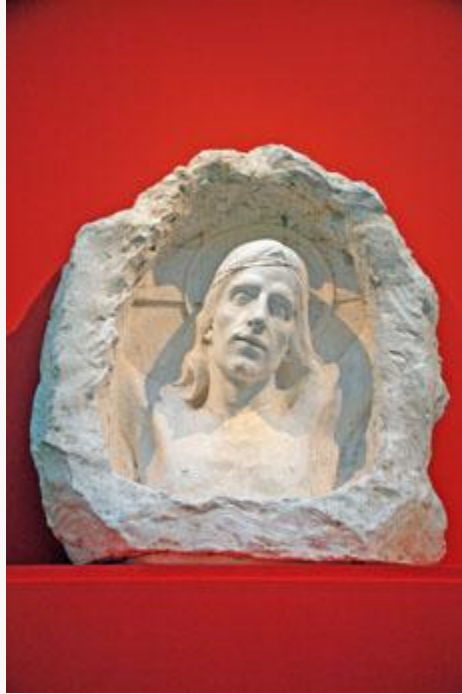
Fig. 11, Installation of Ville Vallgren's Christ , 1899. [return to text]