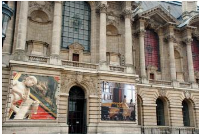
Fig. 2, Exterior of the Palais des Beaux-Arts, Lille, France. [return to text]