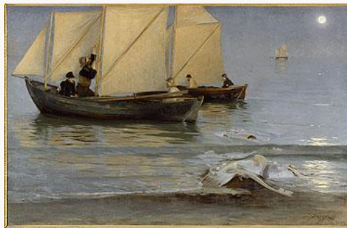
Fig. 10, Peder Severin Krøyer, Fishing Boats, Skagen , 1884. Oil on canvas. Paris, Musée d'Orsay, © RMN / Gérard Blot/Hervé Lewandowski. [larger image]

In illustration of Ponsonailhe's arguments, the exhibition is fortunate to include an impressive large-scale work by Krøyer, Fishing Boats, Skagen (1884) (fig. 10). As discussed in the accompanying catalogue entry, Ponsonailhe considered this particular work to exemplify the lighting effects characteristic of Scandinavian plein-airisme . Painted by Krøyer during his stay in the Danish fishing village of Skagen, the suffusion of blue throughout the work, the interplay of reflections and merging of sea and sky cohere to form not just a seascape, but an 'atmosphere'. What might have been a depiction of local fishermen at work becomes instead a metaphor of existential isolation as a result of the stylistic treatment of the subject. Ponsonailhe's description of the work verges on a prose poem in its own right and praises the fusion of naturalism, luminosity and dream-like atmospheric qualities that came to be considered as the basis of Scandinavian symbolism towards the end of the century.