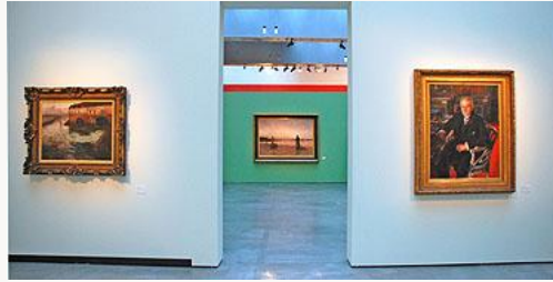
Fig. 8, Transition to second section of the exhibition. [larger image]