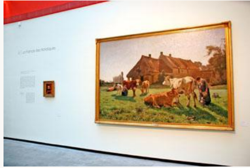
Fig. 3, Installation of Christian Skredsvig's A farm at Venoix , 1881. [larger image]

Exceptions to the naturalism characteristic of the introductory works are two smaller-scale landscapes by Thaulow from the 1890s. As one of the few artists included in the exhibition who had direct contact with members of the Parisian avant-garde such as Auguste Rodin, Claude Monet and Pierre Puvis de Chavannes, Thaulow's more intimate landscapes experiment with a palette and technique familiar from works by members of the Barbizon school and from landscape paintings by Camille Pissarro and Alfred Sisley.