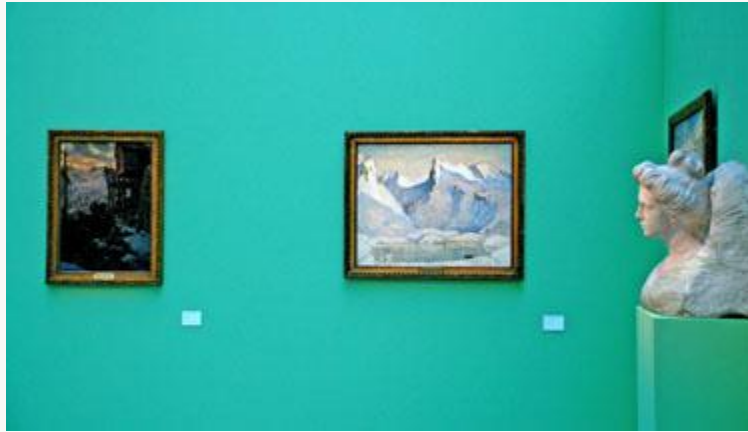
Fig. 13, Installation of Anna Boberg's The Winch , 1906 (left); The Mysterious Cove , 1924 (center); and Ville Vallgren's In the Irises , 1889 (right). [return to text]