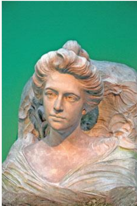
Fig. 12, Installation of Ville Vallgren's In the Irises , 1899. [return to text]