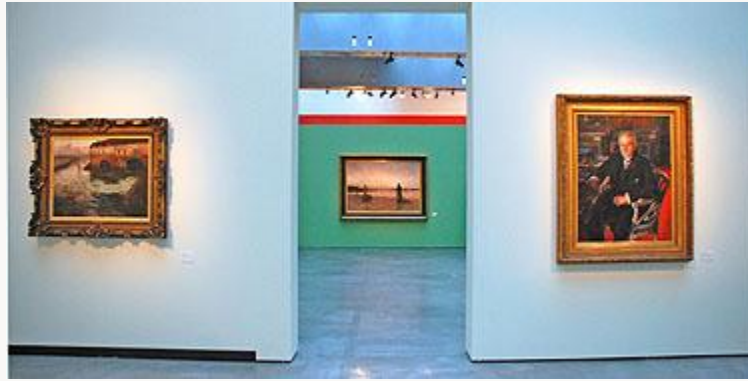
Fig. 8, Transition to second section of the exhibition. [return to text]