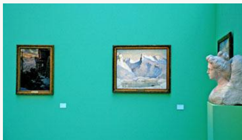
Fig. 13, Installation of Anna Boberg's The Winch , 1906 (left); The Mysterious Cove , 1924 (center); and Ville Vallgren's In the Irises , 1889 (right). [larger image]

Edvard Diriks's luminous clouds and seascapes that verge on abstraction, by the turn of the century Scandinavian and Finnish painting is shown to have transformed French naturalism into something distinctively its own (fig. 13). Ultimately, the works included in the exhibition cannot be reduced to a single style or school. However, the theme of plein-airisme runs through them all, making experimentation with light central to the depiction of a vast array of natural, spiritual and psychological landscapes.