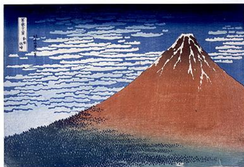
Fig. 7, Katsushika Hokusai, 'South Wind, Clear Sky' (Gaifu kaisei) ['Red Fuji']. From the series 'Thirty-Six Views of Mt. Fuji' (Fugaku sanju-rokkei). Woodblock print. British Museum, London. [larger image]