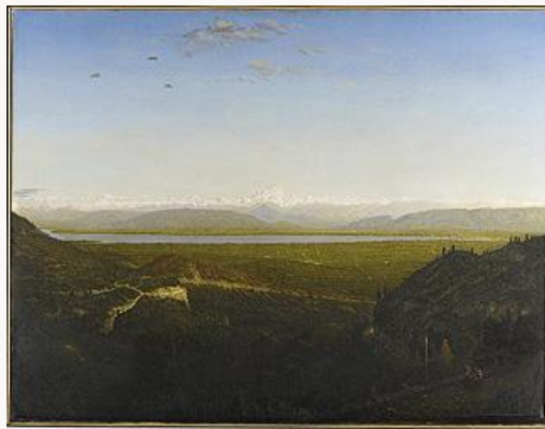
Fig. 1, Théodore Rousseau, View of Mont Blanc, Seen from La Faucille , 1863-1867. Oil on canvas. Private Collection (on loan to the Minneapolis Institute of Arts). [larger image]