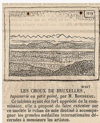
Fig. 8, Bertall [Charles- Albert d'Arnoux], "Les Choux de Bruxelles" from "Le Salon Dépeint par Bertall," Le Journal Amusant , June 1, 1867. Bibliothèque Nationale de France, Paris. [larger image]

Rousseau's method as a "mystery" and wondered whether he used "brushes," or "penknives" and "small sticks." Perhaps, Zola speculated, he used all these instruments at the same time. [34] Both conservative and avant-garde critics struggled to find a language to describe Rousseau's unconventional technique, often comparing his works to foodstuff or to types of cloth. Rousseau's trees were repeatedly likened to "brussels sprouts," probably an allusion to the way in which they seemed to be transformed within the expansive panorama into small, rounded points. [35] Others compared Rousseau's meticulously flecked paint surfaces to a woven or knitted piece of fabric, employing a critical trope that had surrounded his work from the early 1860s. Théophile Thoré described his picture as "knitted like a tapestry fragment, with uniform stitches." [36] The caricaturist Bertall conflated these culinary and clothing associations in his schematic caricature (fig. 8) and even suggested that Rousseau's surfaces might serve as the model for the silk ribbon to accompany the artists' medals at the Exposition Universelle. [37] Other comparisons were even more unusual and informed by the interests of individual critics. For Maxime Du Camp, a writer and critic fascinated by the ancient world, Rousseau's surfaces were comparable to "opus reticulatum," a kind of Roman masonry made up of diamond-shaped bricks. [38]