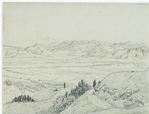
Fig. 4, Théodore Rousseau, Chain of Alps , 1863. Pencil on paper. Museum Boijmans Van Beuningen, Rotterdam. [larger image]

According to Sensier, Rousseau began his View of Mont Blanc on his return to Paris and used a novel technique of a preparatory layer of watercolor to achieve an enhanced tonal luminosity after being impressed by Old Master watercolor practice. [22] Technical analysis has not confirmed this but Rousseau's oil technique—particularly in his distant mountains—does approximate watercolor. Thus, he drew his oil paint across his canvas in very thin, near transparent layers and then offset this by opaque touches, similar to gouache, particularly for the whites of the mountain tops. Sensier noted that Rousseau also initially outlined his composition in pen and ink. This underdrawing is clearly evident when the work is viewed in an infra-red reflectogram, which also makes it possible to see the configuration of the foreground hills, which are now difficult to make out with the naked eye (fig. 5). [23] Rousseau developed View of Mont Blanc on a canvas of a size (90 x 117cm) that he favored in his late work. [24]