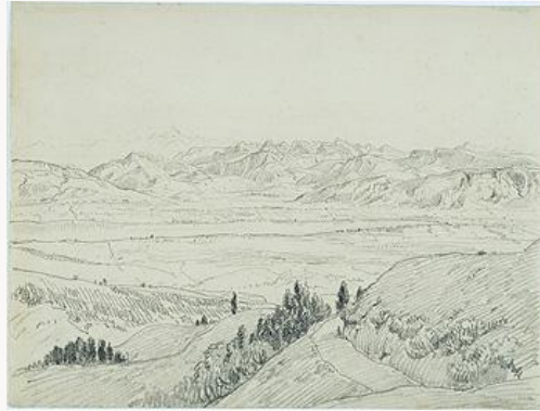
Fig. 5, Infra-red reflectogram of Théodore Rousseau, View of Mont Blanc, Seen from La Faucille . Oil on canvas. Private Collection (on loan to the Minneapolis Institute of Arts). [larger image]

Rousseau built up the surfaces of the mid-ground fields and densely forested foreground hills with a meticulous, additive process of uniform flecks of green applied with a pointed brush, thus creating an almost “woven” or stitched effect (fig. 6). [25] This technique may have been informed by Japanese prints and particularly Hokusai’s many views of Mount Fuji with their dotted treatment of fir trees, as in Red Fuji (fig. 7). Rousseau’s “proto-pointillist” method contrasts markedly with his earlier far more gestural handling—as in the 1834 Alps view (fig. 3)—which was often viewed as a marker of individual “temperament,” and perhaps signified a search for a more impersonal technique. [26] Rousseau never fully explained the rationale behind this approach but it may have represented an effort to create a sense of meditated permanence, less evident in a rapid, spontaneous touch. His personal stylistic evolution can be seen as anticipating that moment some two decades later in the mid-1880s as the young neo-Impressionists explored a uniform facture as a critique of the seemingly random brushwork of the older Impressionists.