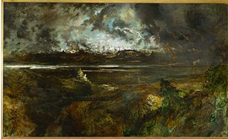
Fig. 3, Théodore Rousseau, Mont Blanc, Seen from La Faucille, thunderstorm , 1834. Oil on canvas. Ny Carlsberg Glyptotek, Copenhagen. [return to text]