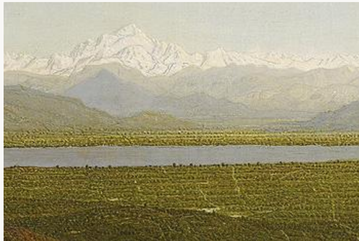
Fig. 6, Detail of central area of Théodore Rousseau, View of Mont Blanc, Seen from La Faucille . Oil on canvas. Private Collection (on loan to the Minneapolis Institute of Arts). [return to text]