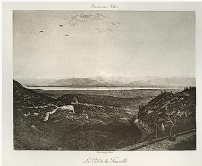
Fig. 2, Anonymous, after Théodore Rousseau, View of Mont Blanc, Seen from La Faucille (Le Col de la Faucille) in Collection de Madame la Marquise Landolfo-Carcano (Paris Georges Petit, 1912). [return to text]