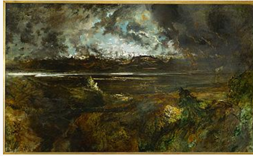
Fig. 3, Théodore Rousseau, Mont Blanc, Seen from La Faucille, thunderstorm , 1834. Oil on canvas. Ny Carlsberg Glyptotek, Copenhagen. [larger image]