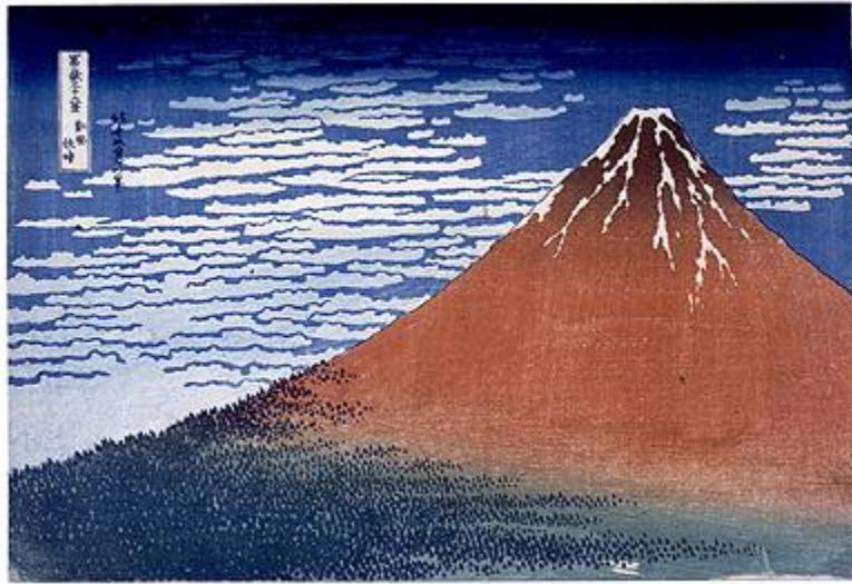
Fig. 7, Katsushika Hokusai, 'South Wind, Clear Sky' (Gaifu kaisei) ['Red Fuji']. From the series 'Thirty-Six Views of Mt. Fuji' (Fugaku sanju-rokkei). Woodblock print. British Museum, London. [return to text]