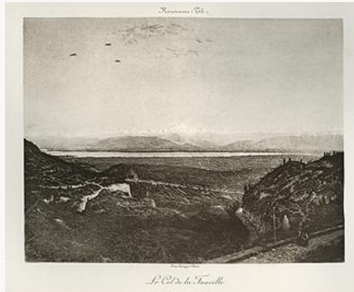
Fig. 2, Anonymous, after Théodore Rousseau, View of Mont Blanc, Seen from La Faucille (Le Col de la Faucille) in Collection de Madame la Marquise Landolfo-Carcano (Paris Georges Petit, 1912). Photograph. [larger image]