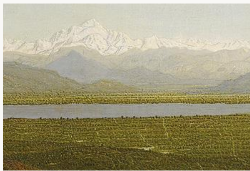
Fig. 6, Detail of central area of Théodore Rousseau, View of Mont Blanc, Seen from La Faucille . Oil on canvas. Private Collection (on loan to the Minneapolis Institute of Arts). [larger image]

Rousseau built up the surfaces of the mid-ground fields and densely forested foreground hills with a meticulous, additive process of uniform flecks of green applied with a pointed brush, thus creating an almost “woven” or stitched effect (fig. 6). [25] This technique may have been informed by Japanese prints and particularly Hokusai’s many views of Mount Fuji with their dotted treatment of fir trees, as in Red Fuji (fig. 7). Rousseau’s “proto-pointillist” method contrasts markedly with his earlier far more gestural handling—as in the 1834 Alps view (fig. 3)—which was often viewed as a marker of individual “temperament,” and perhaps signified a search for a more impersonal technique. [26] Rousseau never fully explained the rationale behind this approach but it may have represented an effort to create a sense of meditated permanence, less evident in a rapid, spontaneous touch. His personal stylistic evolution can be seen as anticipating that moment some two decades later in the mid-1880s as the young neo-Impressionists explored a uniform facture as a critique of the seemingly random brushwork of the older Impressionists.