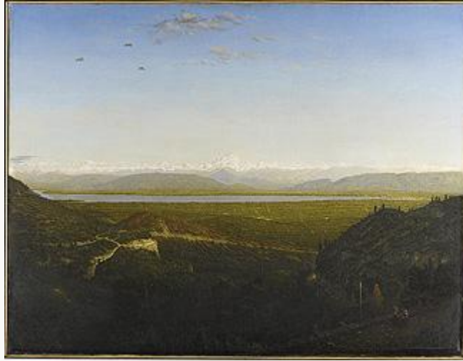
Fig. 1, Théodore Rousseau, View of Mont Blanc, Seen from La Faucille , 1863-1867. Oil on canvas. Private Collection (on loan to the Minneapolis Institute of Arts). [return to text]