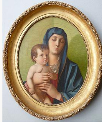
Fig. 2, Louis-Marius Garcin, Madonna degli alberetti after Giovanni Bellini, 1850. Oil on canvas. Collection Elvio Mich, Trent. [larger image]