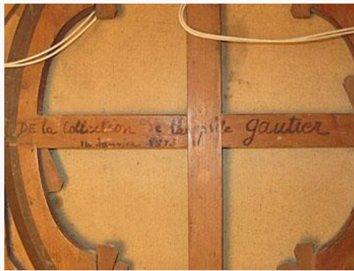
Fig. 3, Garcin, Madonna degli alberetti , verso. [larger image]