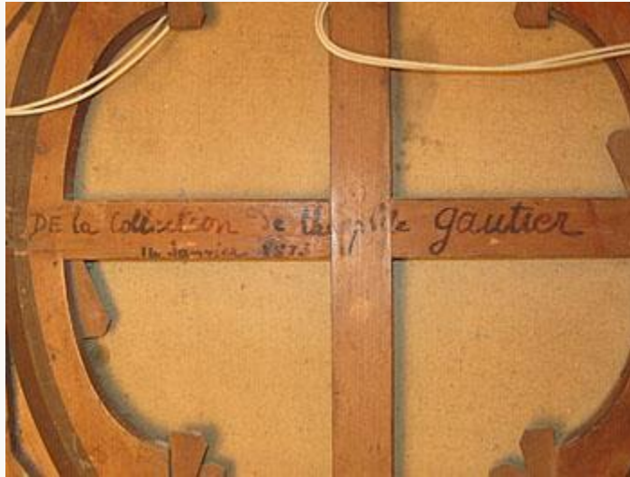
Fig. 3, Garcin, Madonna degli alberetti , verso. [return to text]