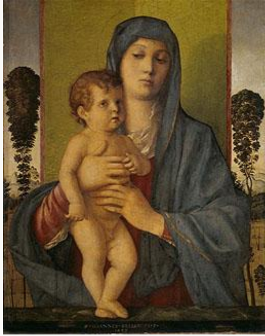
Fig. 1, Giovanni Bellini, Madonna degli alberetti ( Madonna of the Small Trees ), 1487. Oil on panel. Galleria dell'Accademia, Venice. [return to text]