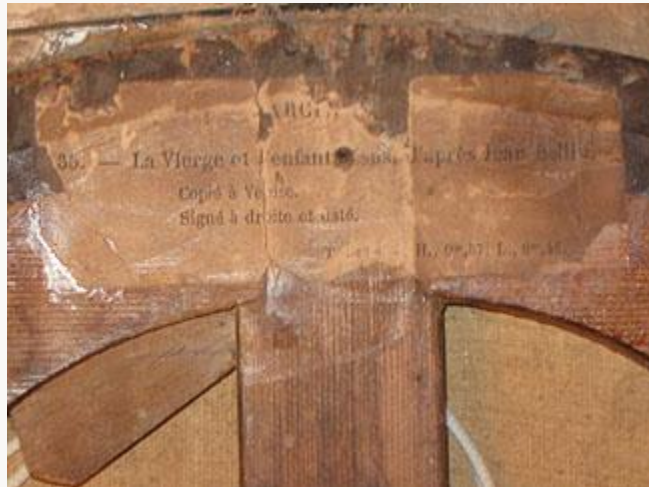
Fig. 4, Garcin, Madonna degli alberetti , verso. [return to text]