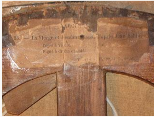
Fig. 4, Garcin, Madonna degli alberetti , verso. [larger image]