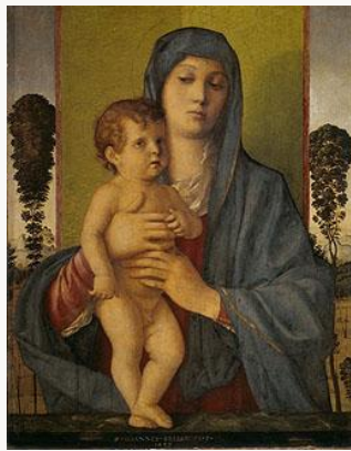
Fig. 1, Giovanni Bellini, Madonna degli alberetti ( Madonna of the Small Trees), 1487. Oil on panel. Galleria dell'Accademia, Venice. [larger image]