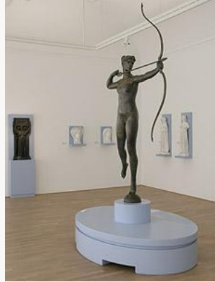
Fig. 6, Installation view, Gallery Sixteen, Museo Vela. [larger image]