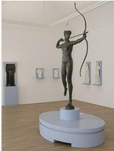
Fig. 6, Installation view, Gallery Sixteen, Museo Vela. [return to text]