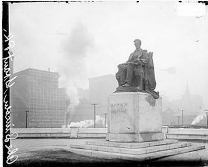
Fig. 2, Augustus Saint-Gaudens, Abraham Lincoln The Head of State (called the Seated Lincoln), 1897-1906.