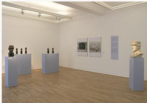
Fig. 4, Installation view, Gallery Thirteen. Museo Vela. [larger image]