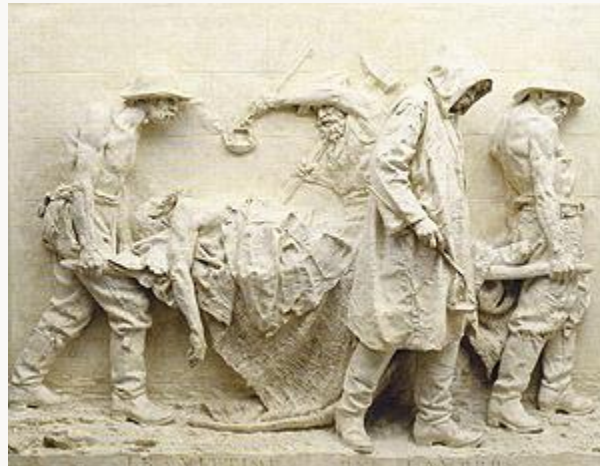
Fig. 8, Vincenzo Vela, The Victims of Labor , 1882. Plaster. Museo Vela. [return to text]