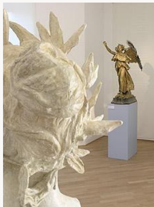
Fig. 5, Installation view, Gallery Fifteen. Museo Vela. [larger image]