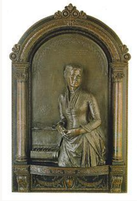
Fig. 9, Augustus Saint-Gaudens and Stanford White, Louise Miller Howland , 1888. Bronze. Private Collection. [return to text]