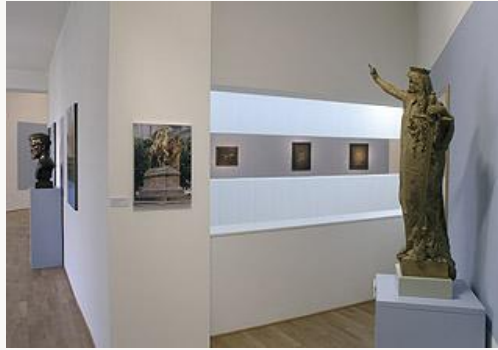
Fig. 3, Installation view, Gallery Nine, Museo Vela, Ligornetto. [larger image]

exhibition light and focused. The installation worked very well with the sculpture, a medium which is often difficult to exhibit successfully precisely because of the limited colors of the works themselves. The light blue color of the pedestals and exhibition design continued to the catalog of the exhibition. It added a bright, soft and welcome deviation from the stark and repetitive white and brown tones of the sculptures on display.