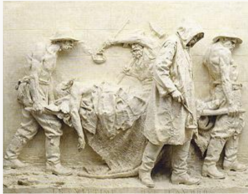
Fig. 8, Vincenzo Vela, The Victims of Labor, 1882. Plaster. Museo Vela. [larger image]

What is striking, through, is their different approach to the presentation of the theme of death. Saint-Gaudens' use of an allegorical figure above or alongside many of his heroic notables (seen in the Shaw Memorial but also in his Sherman Memorial and his Monument to Admiral David Farragut in Madison Square Park, New York) is certainly due to his deep admiration for Renaissance art, but it also says something about Saint-Gaudens' American public. Vela's Victims of Labor , a memorial to the fallen workers who died during the construction of the Saint Gotthard railway in the Swiss Alps, felt that his heroic workers and the dead laborer needed no allegory, no angel of death, to assure the public of this worker's safe passage into the hereafter. Vela, a hyper-realist bar none, would not have allowed for such seemingly trite symbolism of allegorical figures; the expressions and gestures of the figures alone depict the heroic qualities of the common man. Saint-Gaudens' American audience, however, needed the allegorical figure to soften the severe gloom of his memorial, a very real image of the first all-black regiment and their white general Robert Gould Shaw marching towards their imminent deaths (or possibly they are already dead, their spirits being led safely to the great beyond). Their stark fate would have been much too harsh for a public that had physical and psychological wounds still too raw from the war to accept art without an allegorical buffer.