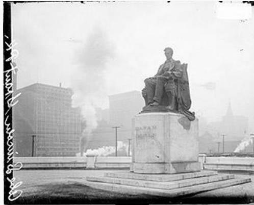
Fig. 2, Augustus Saint-Gaudens, Abraham Lincoln The Head of State (called the Seated Lincoln), 1897-1906.