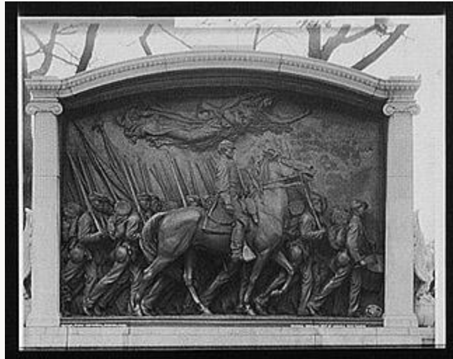
Fig. 7, Augustus Saint-Gaudens, Shaw Memorial , 1897. Boston, Mass. [return to text]