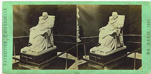
Fig. 1, Stereoview of Vincenzo Vela's Last Days of Napoleon I . 1867. [larger image]