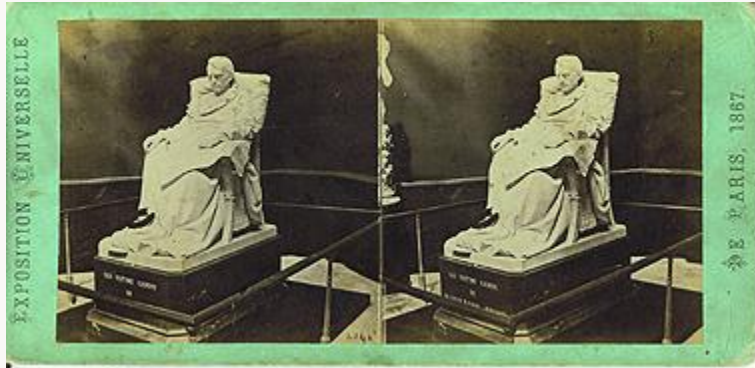
Fig. 1, Stereoview of Vincenzo Vela's Last Days of Napoleon I. 1867. [return to text]