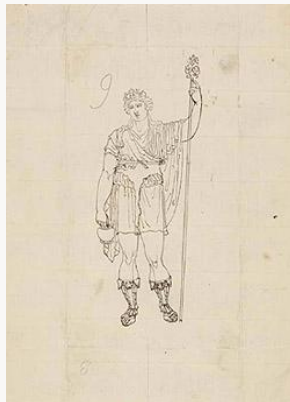
Fig. 10, Thomas Hope, Bacchus from a statue in my possession , 1804-1812. Pen and pencil on laid paper. From the album “[O]utlines for My Costume.” Athens, Gennadius Library, American School of Classical Studies. [larger image]