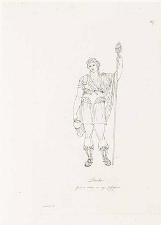
Fig. 11, Thomas Hope, Bacchus. from a statue in my possession. Etched by T.H. , 1812. Etching on wove paper. From Thomas Hope, Costume of the Ancients , new ed. enlarged (London William Miller, 1812), vol. 2, pl. 167. Athens, Gennadius Library, American School of Classical Studies. [return to text]