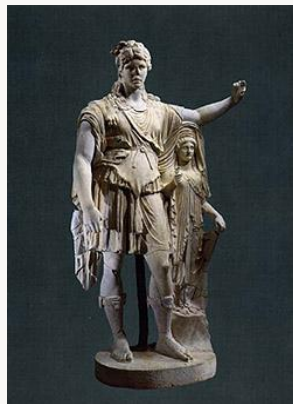
Fig. 12, Hope Dionysos, late 1st century A.D., with 18th-century restoration by Vincenzo Pacetti. Marble. New York, Metropolitan Museum of Art. [larger image]

In Hope's time, the over-life-sized marble statue that his drawing and etching reproduce (fig. 12) was first located in the Statue Gallery in Hope's Duchess Street house in London, then moved to his country home in Deepdene. In 1917, it was sold to Frances Howard, great-grandson of Benjamin Franklin. In 1990, it reappeared in a Sotheby's sale in New York, and was purchased by the Metropolitan Museum of Art, where it is now on view in the Leon Levy and Shelby White Court.[21]