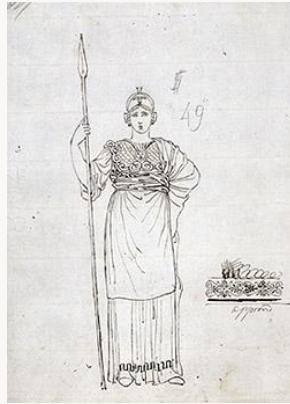
Fig. 5, Thomas Hope, Minerva from a Statue at Florence , 1804-1809. Pen and pencil on laid paper. From the album “[O]utlines for My Costume.” Athens, Gennadius Library, American School of Classical Studies.