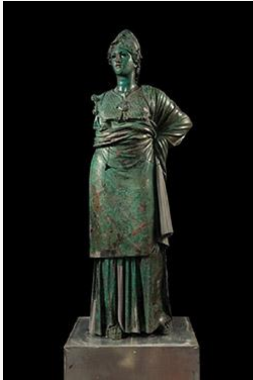
Fig. 8b, Minerva from Arezzo after restoration completed in 2008. [return to text]