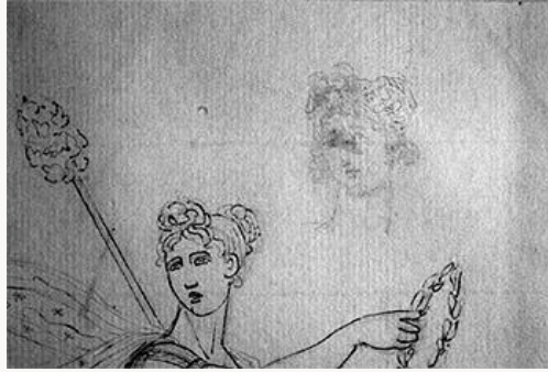
Fig. 2, Detail of sepia and penciled heads from the upper right portion of fig. 1. [larger image]