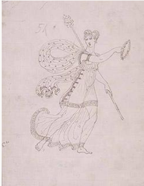
Fig. 1, Thomas Hope, Bacchante with the thyrsus, 1804-1809. Sepia and pencil on laid paper. From the album “[O]utlines for My Costume.” Athens, Gennadius Library, American School of Classical Studies.