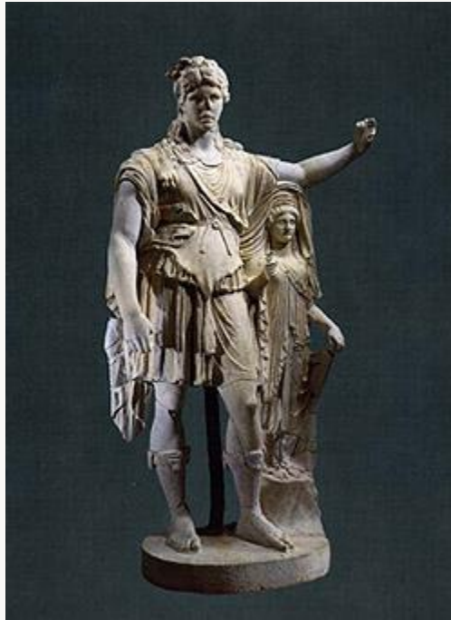
Fig. 12, Hope Dionysos, late 1st century A.D, with 18th-century restoration by Vincenzo Pacetti. Marble. New York, Metropolitan Museum of Art.