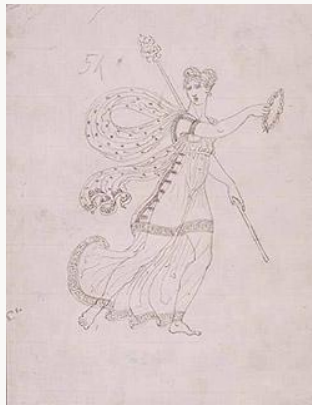
Fig. 1, Thomas Hope, Bacchante with the thyrsus, 1804-1809. Sepia and pencil on laid paper. From the album “[O]utlines for My Costume.” Athens, Gennadius Library, American School of Classical Studies.

The Gennadius Library of the American School of Classical Studies in Athens owns two sets of largely unpublished drawings of figures in ancient costumes. The drawings are important because they document the working method of the Neoclassical collector, author, and artist Thomas Hope (1769–1831) in the production of his widely used costume compendium, Costume of the Ancients . All unsigned, the drawings are collected in two albums—one containing 97 sheets, the other 106. Executed in sepia or pen and pencil, they can be dated, along with the albums into which they were pasted, to the early 19th century. [1] The first album is entitled, on the spine, “[O]UTLINES FOR MY COSTUME” (hereinafter, “Album 1”), and the second is entitled “COSTUMES OF THE ANCIENTS.—HOPE.” (hereinafter, “Album 2”). [2] Both titles clearly refer to Hope’s Costume of the Ancients , which was first published in 1809, with 200 prints; the enlarged second edition, with 300 prints, appeared in 1812. Nearly all the 203 drawings in the two albums have the same figures as, and appear to be preparatory and final studies for, the engravings and etchings in these two editions (e.g., figs. 1–7 and 10–11). [3]