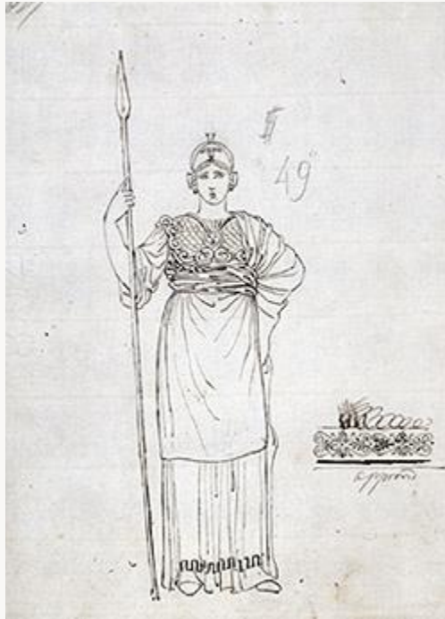
Fig. 5, Thomas Hope, Minerva from a Statue at Florence , 1804-1809. Pen and pencil on laid paper. From the album “[O]utlines for My Costume.” Athens, Gennadius Library, American School of Classical Studies. [return to text]