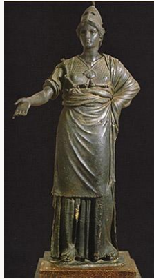
Fig. 8a, Minerva from Arezzo before the most recent restoration, early 3rd century B.C. Bronze. Florence, Soprintendenza Archeologica della Toscana, Museo Archeologico Nazionale. [larger image]