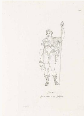
Fig. 11, Thomas Hope, Bacchus. from a statue in my possession. Etched by T.H. , 1812. Etching on wove paper. From Thomas Hope, Costume of the Ancients , new ed. enlarged (London William Miller, 1812), vol. 2, pl. 167. Athens, Gennadius Library, American School of Classical Studies. [larger image]

This article presents the current state of my research on the two albums of drawings. In the future, I hope to publish a monograph that explores them more fully. The first step was to organize the drawings according to where the same figure appears, both within the two albums, and in the prints from the 1809 and 1812 editions of Costume of the Ancients . The signatures on the prints were also examined, for the information they provide. In many cases, they indicate who did the drawing for the plate, who executed the plate itself, and what kind of print the plate is. The handwriting of the labels on the drawings, which was also studied, suggested that the first album is by Thomas Hope himself, and the second album by more than one other artist. To confirm that the two albums were executed by Hope and additional artists, the artistic styles of the drawings with different handwriting styles were compared, but further work in this last area needs to be carried out.