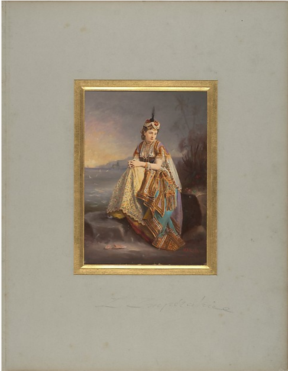
Fig. 12, Pierre-Louis Pierson (photographer) and Marck (colorist), Empress Eugénie as an Odalisque , 1861–65. Albumen silver print. The Metropolitan Museum of Art, New York. Available from: http://www.metmuseum.org . [return to text]