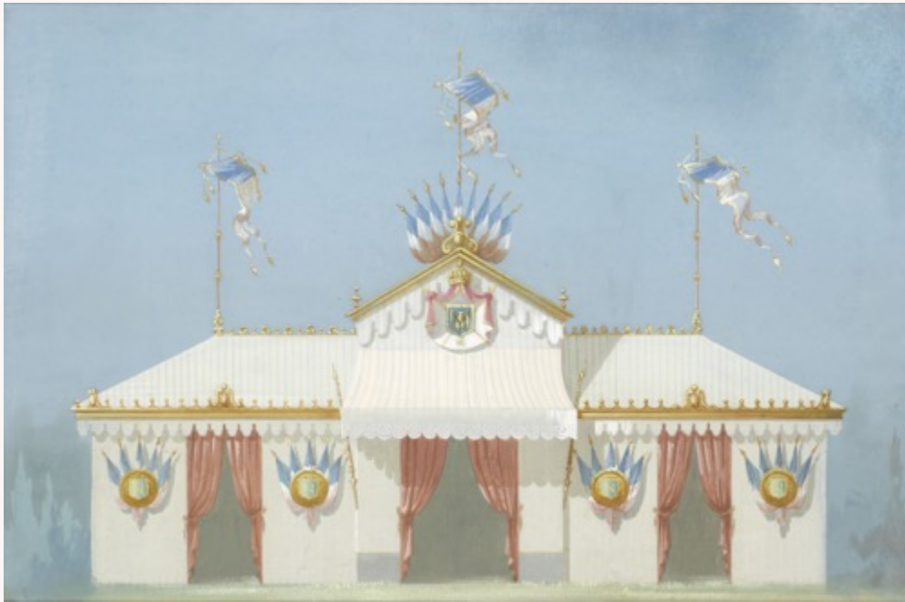
Fig. 5, Maison Belloir & Vazelle, Project drawing for a large tent to be used during an imperial celebration, ca. 1869. Graphite and gouache. Musée d'Orsay, Paris. [return to text]