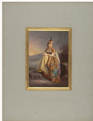
Fig. 12, Pierre-Louis Pierson (photographer) and Marck (colorist), Empress Eugénie as an Odalisque , 1861–65. Albumen silver print. The Metropolitan Museum of Art, New York. Available from: http://www.metmuseum.org . [larger image]

Parties and balls were the subject of the ninth room, called “ Les lumières de la fête .” The theme was best represented in a series of watercolors of feasts, by such artists as Eugène Lami, Emile Reiber, and the Dutch artist Paul Tetar van Elven, which clearly demonstrated the glamour and brightness of nineteenth-century feasts made possible by wide deployment of gaslight since the middle of the nineteenth-century. As one entered the room, however, the eye was most immediately drawn to a group of nine large-scale caricatures by P. F. E Giraud, depicting some of the great party-animals of the period. The Comte de Nieuwerkerke, every week after the Friday fast, received the social elite at his home. These receptions were known for their “after” parties, during which Giraud made these and other caricatures of the guests of the count, who included artists, critics, writers, and members of the imperial family. In addition to these male images, the room also contained a number of fascinating female images—hand-colored photographs of women in the costumes they wore to masked balls. There was Empress Eugénie alternately as odalisque (fig. 12) and as dogressa in photographs by Pierre-Louis Pierson, colored in by an artist who signed as “Marck,” and Countess Castiglione as Dame de Coeurs (photograph by Pierson and coloring by Aquilin Schad). Photographs of women and men thus staged in historic or phantasy costume were so popular that entire albums were made of them.