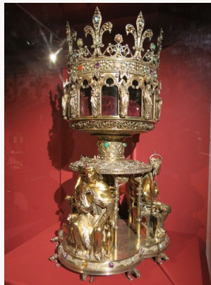
Fig. 10, Eugène Viollet-le-Duc (designer) and Placide Poussielgue-Rusand (manufacturer), Reliquary of the Crown of Thorns , 1862. Notre Dame Cathedral, Paris. Available from: https://commons.wikimedia.org . [larger image]

Neo-gothic was closely linked, in the exhibition, to the Catholic revival of the middle of the century, exemplified by Jules Breton's The Benediction of the Wheat Harvest in the Artois (Musée des Beaux-Arts, Arras). On either side of the painting were two neo-gothic tours-de-force of orfèverie , a monstrance and a reliquary (fig. 10), designed by Eugène Viollet-le-Duc and manufactured by the well-known goldsmith Placide Poussielgue-Rusand. Commissioned by the emperor for Notre Dame, both were shown at the International Exhibition of 1867 before reaching their final destination in the imperial cathedral. The room also featured the surround of a procession dais, woven in Beauvais, which formed a nice connection with Breton's painting.