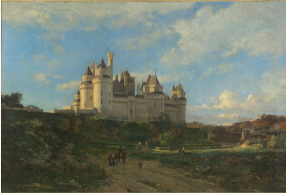
Fig. 6, Emmanuel Lansyer, The Castle of Pierrefonds , ca. 1868. Oil on canvas. Musée Départemental de l'Oise, Beauvais, deposited at Musée d'Orsay. [return to text]