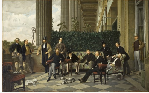
Fig. 8, James Tissot, The Circle of the Rue Royale , 1868. Oil on canvas. Musée d'Orsay, Paris. [larger image]

Portrait photographs were featured in two large vitrines placed along the central axis of the room separated by two huge candelabras by Charles Crozatier and Carpeaux's well-known sculpture of the young prince impérial with his dog Néro (Musée d'Orsay, Paris). Some were large formats, like two albumen prints by Adolphe Dallemagne showing Antoine Barye and Camille Corot standing in elaborate niches à la Gerrit Dou. Others were small cartes-de-visite by André-Adolphe-Eugène Disdéri, who patented the format in 1854. In between these two, there was a wide variety of photo formats, showing individual as well as group portraits. Perhaps the most unusual objects in the entire room, placed on top of the vitrines, were two "photosculptures" representing the dramatist Eugène Labiche and an unknown woman in a crinoline. These works were manufactured using a process invented by François Willème that anticipated today's 3-D printing. Central to the process was the production of a large number of photographs from many different angles, the contours of which were transferred to the clay with the help of a pantograph. [9]