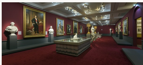
Fig. 7, Room 5, “Portraits d’une société.” [larger image]

While the first four rooms were relatively small, the fifth was a large hall, entitled “ Portraits d’une société ” (fig. 7). It was entirely devoted to portraiture executed in various media of the aristocracy and the middle class of the period. The walls were hung with rows of portraits—interrupted by marble busts as well as a number of large Sèvres vases—which gave a hint of the opulent interiors in which many of these portraits must originally have hung. Both the painted and the sculpted portraits presented an array of men and women ranging from establishment figures like Prince Napoléon, the son of the youngest brother of Napoléon I (Hippolyte Flandrin) and Madame Moitessier, wife of a wealthy banker (Jean-Auguste Ingres) to the socialist philosopher Pierre-Joseph Proudhon with his family (Gustave Courbet) and the dwarfed and hunchbacked painter Achille Empeire[7] (Paul Cézanne), enthroned on a chair as if he were empereur instead of Empeire.[8]