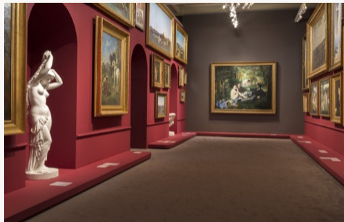
Fig. 14, Room 12, devoted to the Salons during the Second Empire. [larger image]

The next room, the twelfth, a very large room dedicated to the theme of the Salon (fig. 14), showed a sampling of the kind of paintings visitors might have seen at the Salons during the Second Empire. The paintings were crowded together and hung on red walls, to simulate the look of nineteenth-century Salons. One short wall held Manet's Déjeuner sur l'herbe , a work that, of course, was never shown at the official Salon but at the famous Salon des Refusés, the salon of the refused artists, organized by order of Napoléon III in 1863. This room was by far the least successful of the entire exhibition. It paid lip service to an entire body of artwork not elsewhere represented in the exhibition—and for good reason, as the show's focus a priori excluded such artistic subjects as landscape and peasant painting. One got the impression, therefore, that this room was intended, in part, to make up for that lack, but all it did was to show a strange catch-as-catch-can of mid-nineteenth-century paintings whose specific rationale for being there was difficult to understand. The room contributed little to an understanding of the complex history of mid-nineteenth-century French art or, for that matter, of the history of the Salon during the Second Empire; the gratuitous presence of Manet's Déjeuner sur l'herbe did little to clarify the significance of this room.