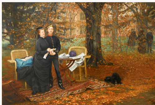
Fig. 16, James Tissot, Empress Eugénie and the Prince Impérial in the Parc of Camden Palace , ca. 1878. Oil on canvas. Musée National du Château, Compiègne. [larger image]

All in all, the Spectacular Second Empire delivered what it promised. It offered a fascinating picture of the glamorous lives of the elite of the period and brought new awareness of the emphasis on spectacle that was actively encouraged by the emperor himself. To illustrate their chosen theme, the organizers of the exhibition embraced the opportunity to show a large number of works that are rarely seen. How wonderful to see Mellerio's jewelry and understand the environment within which it was made and worn. What a pleasure to see the scintillating watercolors of Eugène Lami, and lesser known artists like Léon Leymonnerye, whose delicate works rarely leave the cardboard boxes in which they are kept. And what a treat to see the incredible hand-colored photographs of the empress as odalisque or dogaressa, surprising images in every way. The use of photographs in the show, generally, was exemplary, as the viewer really gained much understanding of the reasons for and contexts within which photographs at the time were made. The same was true for the decorative arts, which shone in the exhibition and, again, gained much from a contextual presentation.