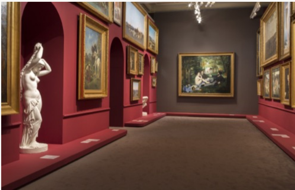
Fig. 14, Room 12, devoted to the Salons during the Second Empire. [return to text]