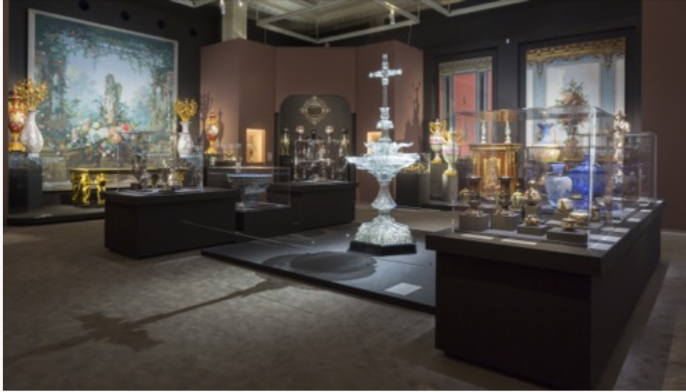
Fig. 15, Room 13, devoted to the International Expositions of 1855 and 1867, showing on the left Rosenmuller's "Garden of Armida" wallpaper, which was manufactured by the firm of Jules Desfossé.