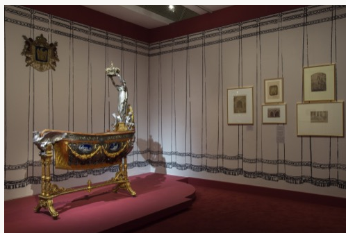
Fig. 4, Room 2, showing the cradle of the prince impérial , 1856. [larger image]

Eugénie in the Tuileries Palace and another one by Hébert Clerget representing their sacramental marriage in Notre Dame Cathedral (both in the Musée National du Château de Compiègne). The latter served to remind the viewer that, like his uncle, Napoléon III chose Notre Dame in Paris as the imperial church to clearly distinguish his rule from that of the French kings, who favored the Cathedral of Reims. Numerous photographs of the imperial marriage and the baptism of the prince impérial rounded out the theme of the room and allowed for some interesting comparisons. It is notable that the baby prince impérial is photographed not in his official cradle but in one that is simpler and in all likelihood more practical. Some of the photographs were made by Ambroise Richebourg, official photographer of the Second Empire, others by Charles Marville and Gustave Le Gray.