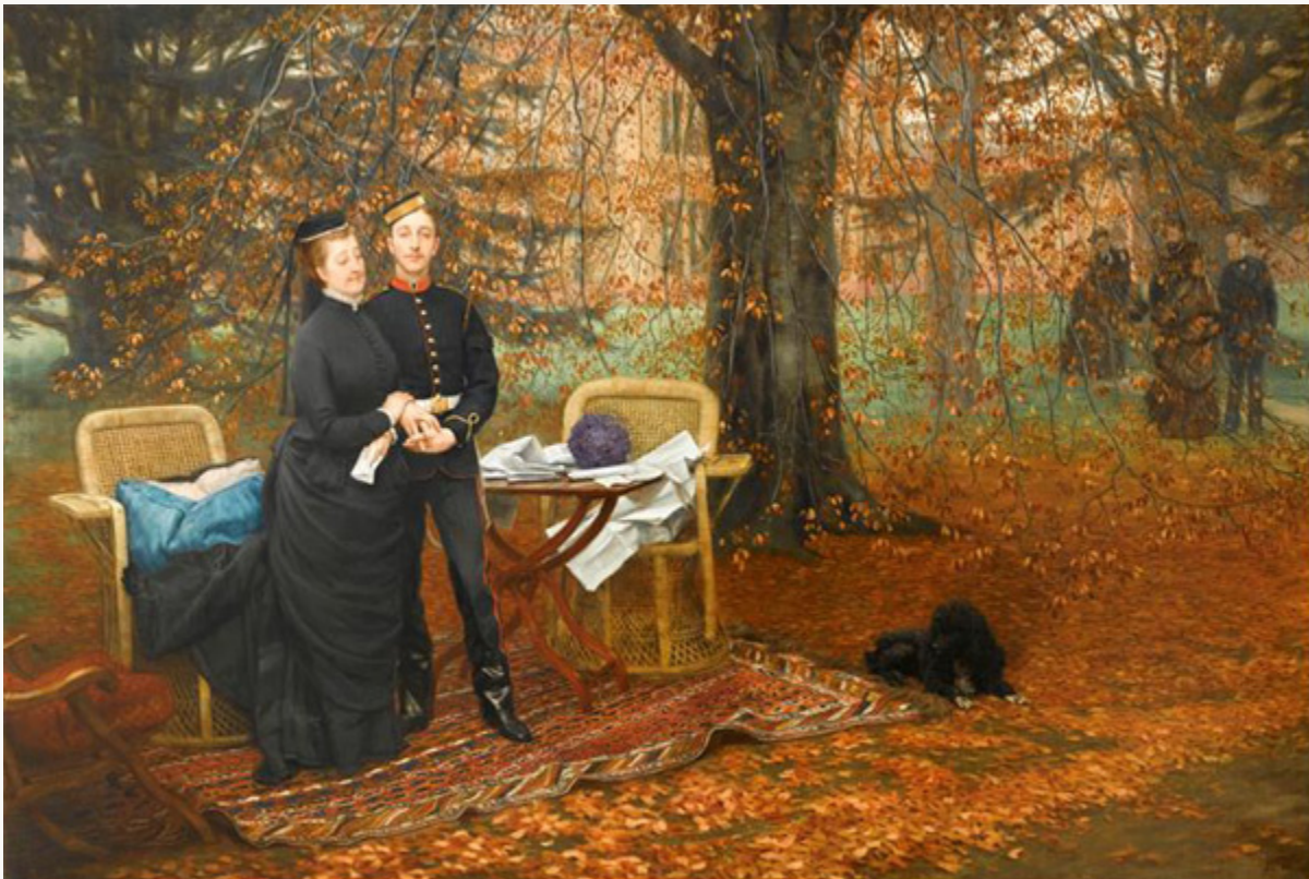
Fig. 16, James Tissot, Empress Eugénie and the Prince Impérial in the Parc of Camden Palace , ca. 1878. Oil on canvas. Musée National du Château, Compiègne.