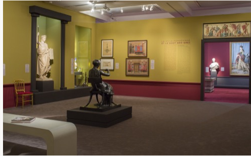
Fig. 9, The neo-Greek room showing Jules Salmson's Thread Winder , 1863, and Eugène Guillaume's Napoléon I, Legislator , 1860. [larger image]

Neo-gothic was closely linked, in the exhibition, to the Catholic revival of the middle of the century, exemplified by Jules Breton's The Benediction of the Wheat Harvest in the Artois (Musée des Beaux-Arts, Arras). On either side of the painting were two neo-gothic tours-de-force of orfèverie , a monstrance and a reliquary (fig. 10), designed by Eugène Viollet-le-Duc and manufactured by the well-known goldsmith Placide Poussielgue-Rusand. Commissioned by the emperor for Notre Dame, both were shown at the International Exhibition of 1867 before reaching their final destination in the imperial cathedral. The room also featured the surround of a procession dais, woven in Beauvais, which formed a nice connection with Breton's painting.