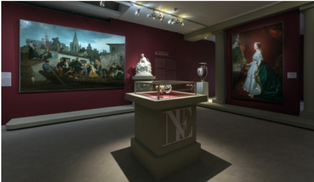
Fig. 3, Room 1, showing William Bouguereau's The Emperor Visiting the Victims of the Tarascon Flood , 1857, and Jean-Baptiste Carpeaux's Empress Eugénie Protecting the Orphans and the Arts , 1855. [return to text]