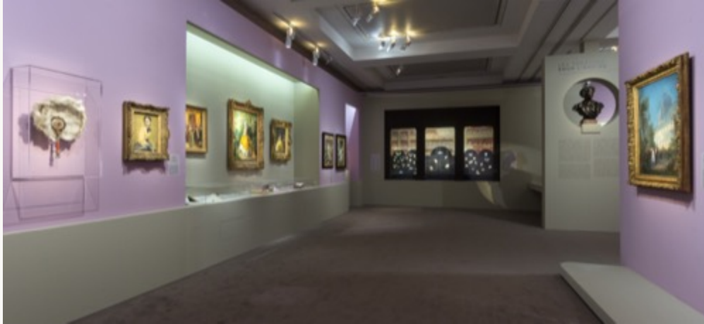
Fig. 13, Room 10, devoted to the Paris theatre, showing left foreground Empress Eugénie’s ostrich feather fan. [return to text]