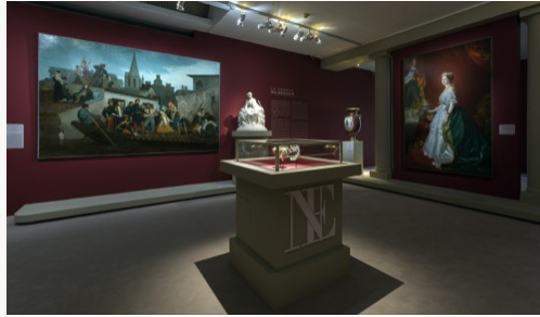
Fig. 3, Room 1, showing William Bouguereau’s The Emperor Visiting the Victims of the Tarascon Flood , 1857, and Jean-Baptiste Carpeaux’s Empress Eugénie Protecting the Orphans and the Arts , 1855. [larger image]

The first exhibition room (fig. 3) was dominated by two life-size state portraits of Napoléon III and Eugénie, facing one another, both painted by that darling of the Second Empire court—François-Xavier Winterhalter. [3] Between them, in the center of the room, was a flat showcase featuring the very same diadem made of gold studded with small diamonds and colossal pearls that Eugénie is wearing in the portrait. Next to it was Eugénie’s crown, commissioned by Napoléon III in 1855 (together with his own, now lost) from Alexandre-Gabriel Lemonnier and shown off at the 1855 International Exposition in Paris. Both the diadem and the crown are today part of the collection of French crown jewels in the Louvre.