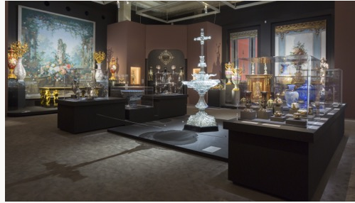
Fig. 15, Room 13, devoted to the International Expositions of 1855 and 1867, showing on the left Rosenmuller's "Garden of Armida" wallpaper, which was manufactured by the firm of Jules Desfossé.