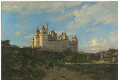
Fig. 6, Emmanuel Lansyer, The Castle of Pierrefonds , ca. 1868. Oil on canvas. Musée Départemental de l’Oise, Beauvais, deposited at Musée d’Orsay. [larger image]

“ Résidences impériales ” (imperial residences) was the theme of the fourth room, which contained numerous large photographs by Edouard Denis Baldus and Richebourg centered on the Louvre and the Tuileries Palace, Napoléon III’s principal winter residence, [5] destroyed during the Commune in 1871. Several of them focused on the new wing of the Louvre, opposite the Grande Galerie and parallel to the rue de Rivoli, and were accompanied by architectural plans showing phases of the construction. A large painting by Emmanuel Lansyer and another by Charles Giraud ( La Salle des Preuses ) presented the exterior and one of the interiors of the Castle of Pierrefonds, the medieval ruin bought by Napoléon I and rebuilt as an imperial residence by Napoléon III (fig. 6). [6] The room also contained watercolors and photographs of other imperial residences, specifically the palaces at St. Cloud and Fontainebleau. Of special interest were some of the photographs of the interior of the Chinese pavilion at Fontainebleau, which featured the objects Empress Eugénie received as gifts from various participants in the looting and destruction of the Chinese imperial palace Yuanming Yuan at the end of the Second Opium War (1856–60).