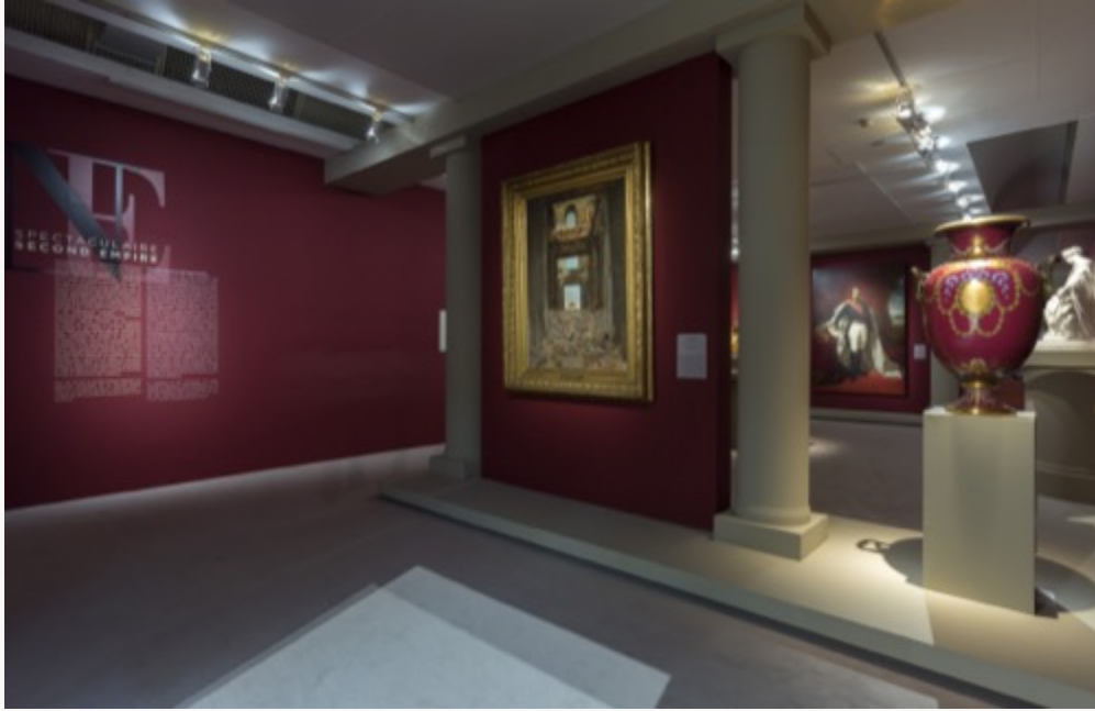
Fig. 2, Anteroom of the exhibition, showing Ernest Meissonier's The Ruins of the Tuileries Palace , 1871. Oil on canvas. Musée National du Château, Compiègne, deposited at Musée d'Orsay, Paris. [return to text]