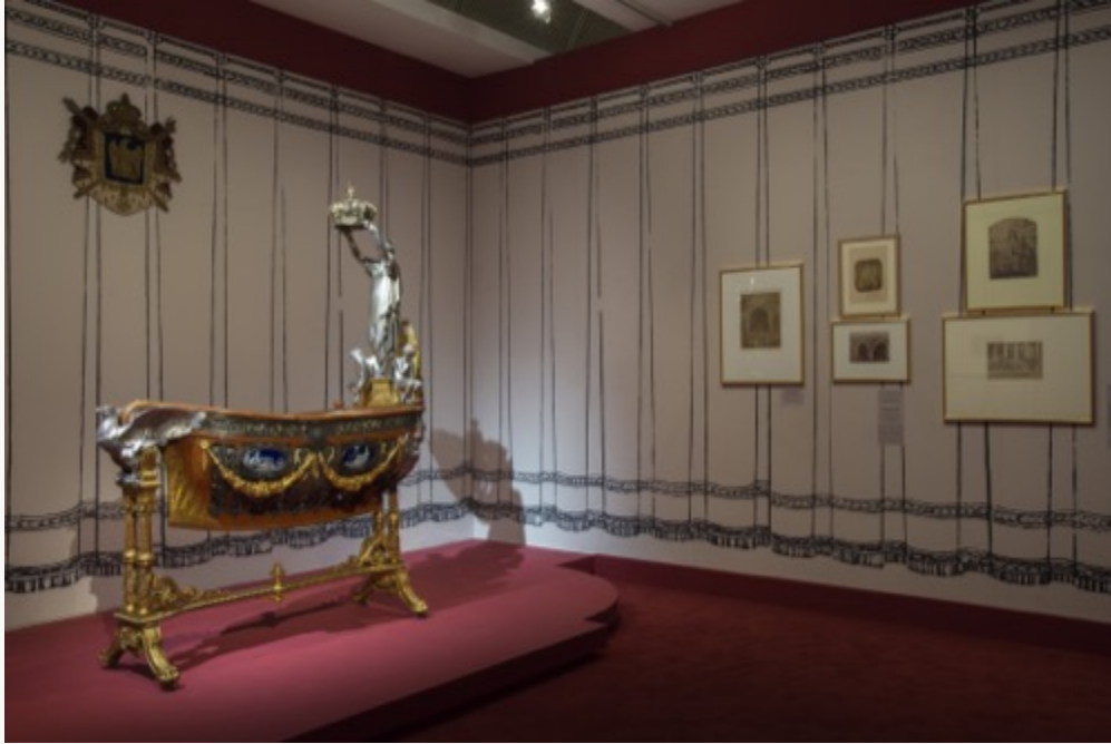
Fig. 4, Room 2, showing the cradle of the prince imperial , 1856. [return to text]