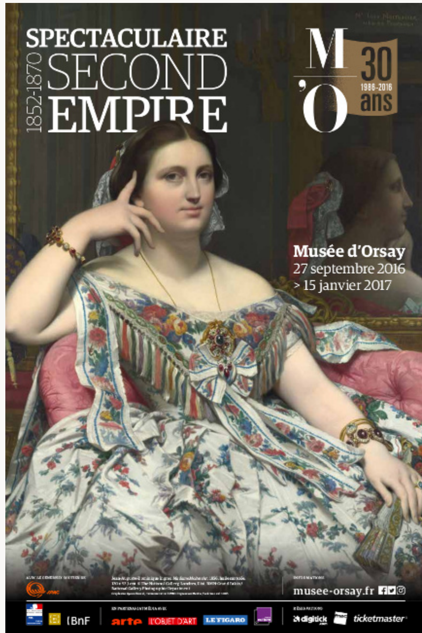
Fig. 1, Exhibition poster for Spectaculaire Second Empire, 1852–1870 . [ return to text ]