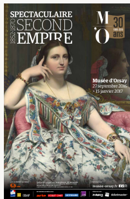
Fig. 1, Exhibition poster for Spectaculaire Second Empire, 1852–1870 . [larger image]