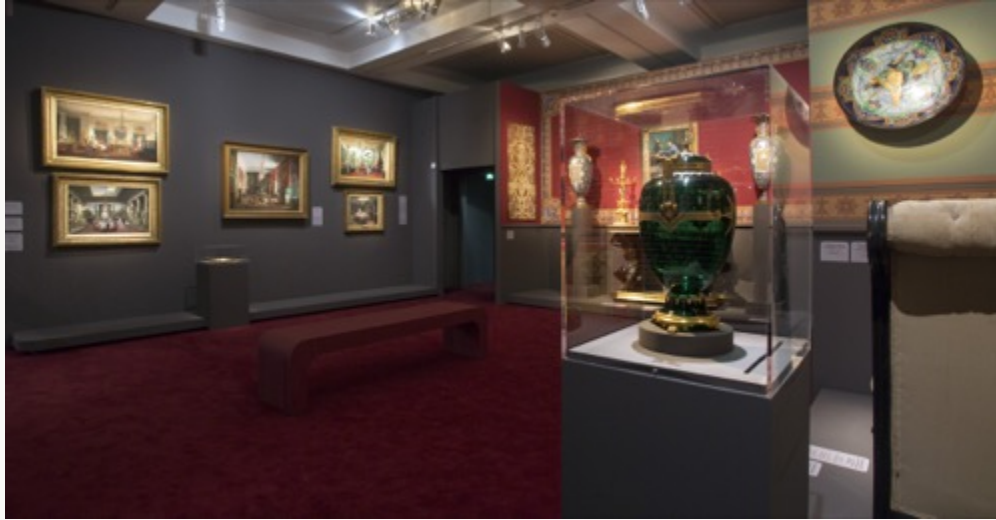
Fig. 11, Room 8, devoted to historic eclecticism. [return to text]