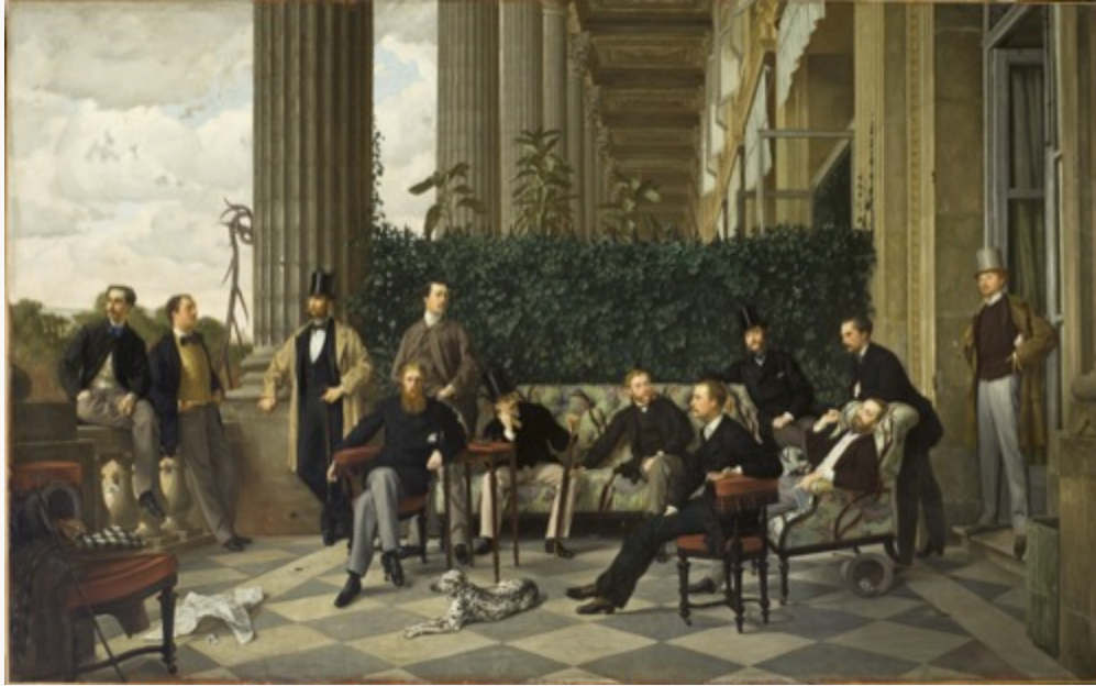
Fig. 8, James Tissot, The Circle of the Rue Royale , 1868. Oil on canvas. Musée d'Orsay, Paris. [return to text]