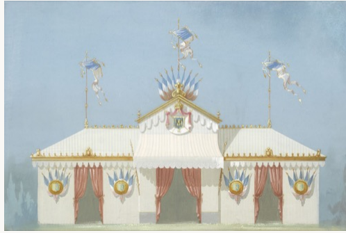
Fig. 5, Maison Belloir & Vazelle, Project drawing for a large tent to be used during an imperial celebration, ca. 1869. Graphite and gouache. Musée d'Orsay, Paris. [larger image]

“ Résidences impériales ” (imperial residences) was the theme of the fourth room, which contained numerous large photographs by Edouard Denis Baldus and Richebourg centered on the Louvre and the Tuileries Palace, Napoléon III’s principal winter residence, [5] destroyed during the Commune in 1871. Several of them focused on the new wing of the Louvre, opposite the Grande Galerie and parallel to the rue de Rivoli, and were accompanied by architectural plans showing phases of the construction. A large painting by Emmanuel Lansyer and another by Charles Giraud ( La Salle des Preuses ) presented the exterior and one of the interiors of the Castle of Pierrefonds, the medieval ruin bought by Napoléon I and rebuilt as an imperial residence by Napoléon III (fig. 6). [6] The room also contained watercolors and photographs of other imperial residences, specifically the palaces at St. Cloud and Fontainebleau. Of special interest were some of the photographs of the interior of the Chinese pavilion at Fontainebleau, which featured the objects Empress Eugénie received as gifts from various participants in the looting and destruction of the Chinese imperial palace Yuanming Yuan at the end of the Second Opium War (1856–60).