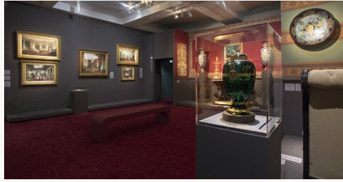
Fig. 11, Room 8, devoted to historic eclecticism. [larger image]

rooms in Baron James de Rothschild's Chateau de Ferrières built by James Paxton between 1855 and 1859.