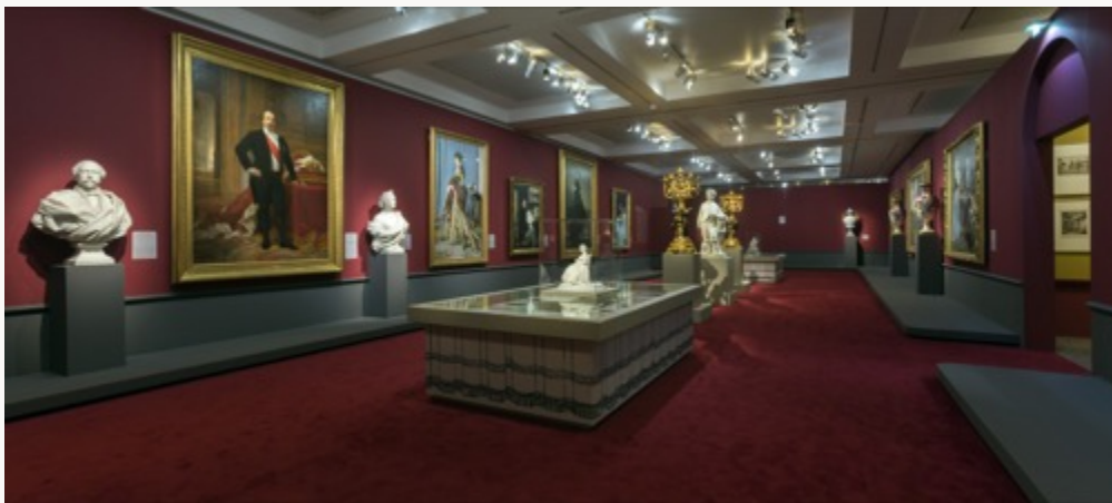
Fig. 7, Room 5, “Portraits d’une société.” [return to text]