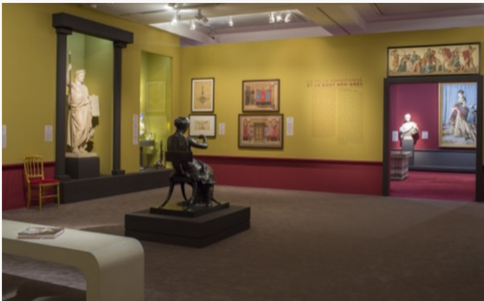
Fig. 9, The neo-Greek room showing Jules Salmson's Thread Winder , 1863, and Eugène Guillaume's Napoléon I, Legislator , 1860. [return to text]