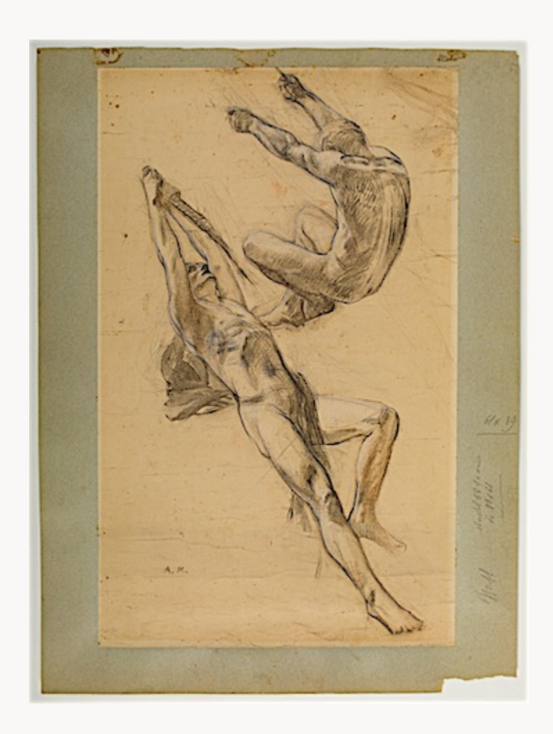
Fig. 12, Drawing for Le Tocsin , ca. 1887. Musée de Picardie, Amiens. [return to text]