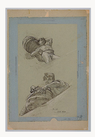
Fig. 7, Drawing for the ceiling mural, La Bourgogne (Burgundy), 1900–01, Train Bleu restaurant, Gare de Lyon, Paris. [view image & full caption]