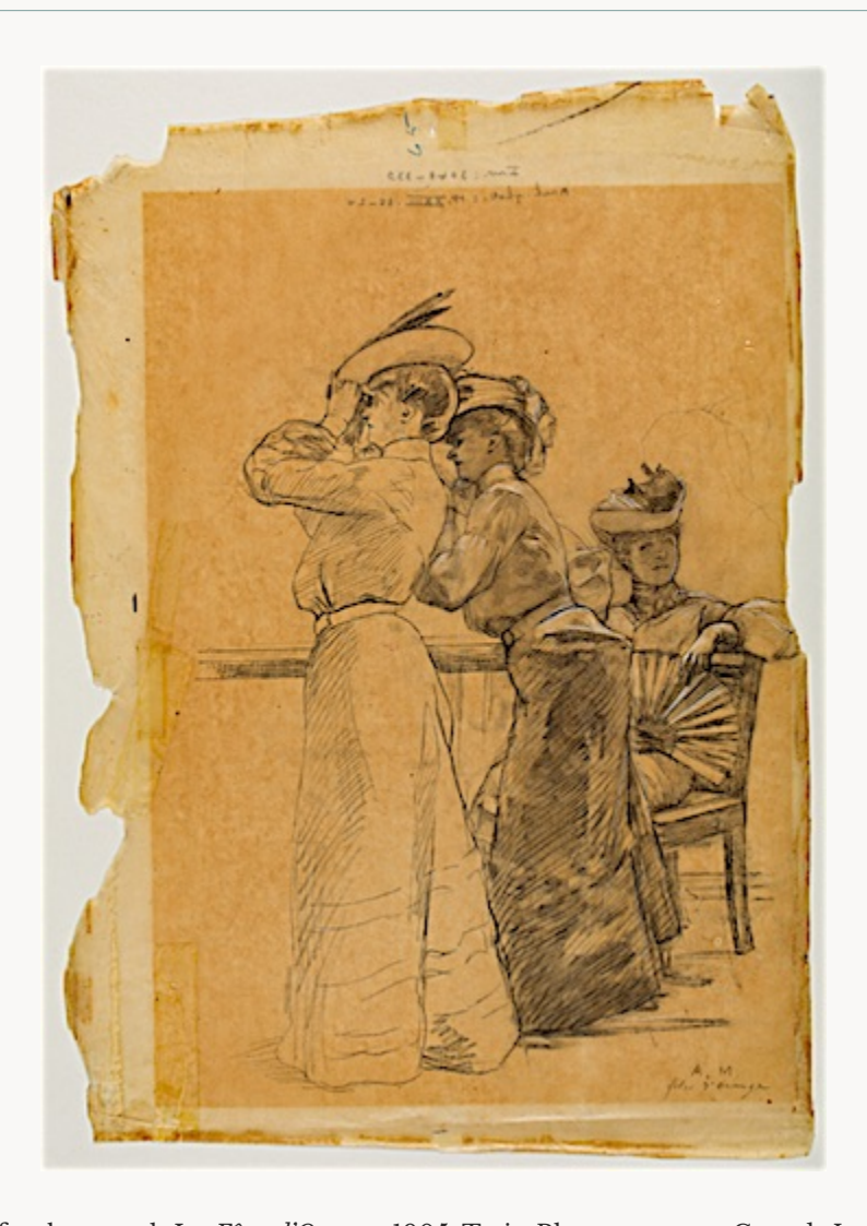
Fig. 5, Drawing for the mural, Les Fêtes d'Orange , 1905, Train Bleu restaurant, Gare de Lyon, Paris. Musée de Picardie, Amiens. [return to text]