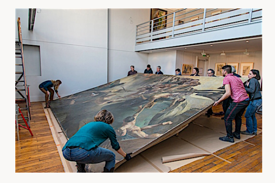
Fig. 11, Installing Le Tocsin at the Fondation Taylor, Paris. [view image & full caption]

Exhibited on the upper floors of the studio, visible close up from a balcony, the painting is shown amidst a broad range of drawings and studies that reveal how the work was modified and changed as it progressed (figs. 12, 13, 14). In the accompanying catalogue entries from Maignan's journal, the artist describes what he was trying to achieve, how he valued criticism of other leading painters of the era, and what had originally inspired him. The old bell,