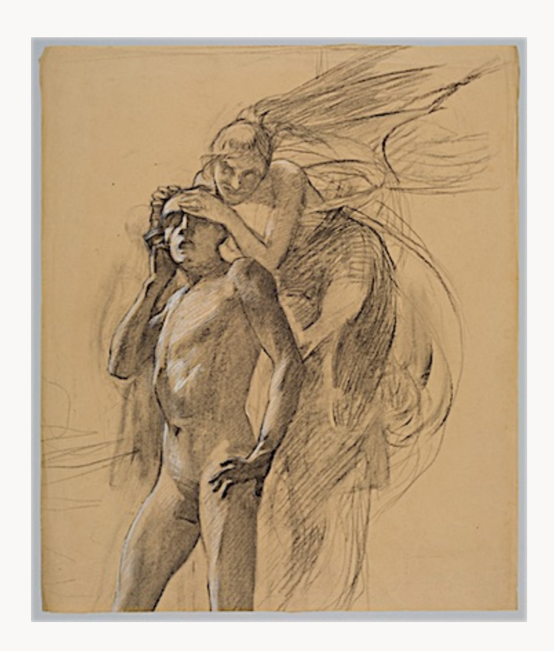
Fig. 16, Drawing for La Muse Verte , 1895. Musée de Picardie, Amiens. [return to text]