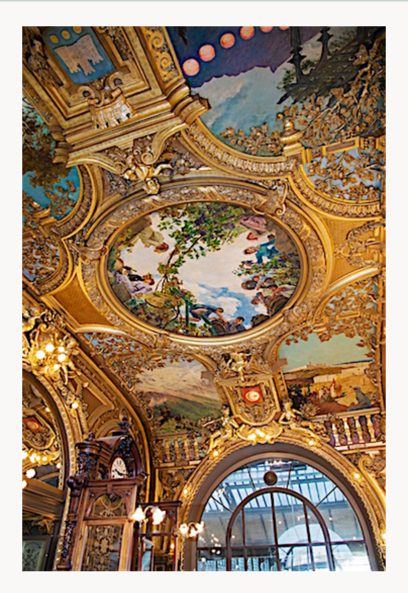
Fig. 8, Ceiling mural, La Bourgogne , 1900–01, Train Bleu restaurant, Gare de Lyon, Paris. [return to text]