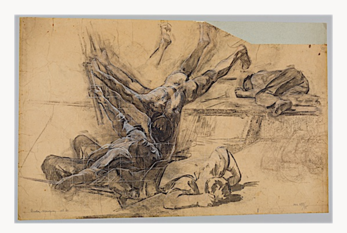
Fig. 13, Gridded drawing for Le Tocsin , ca. 1887. Musée de Picardie, Amiens. [return to text]