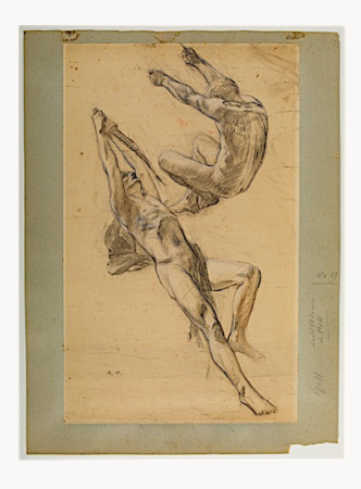
Fig. 12, Drawing for Le Tocsin , ca. 1887. [view image & full caption]

sounding a warning call, creates the aura that this work is really a type of last judgment produced in a modern guise. The figures floating through time and space suggest angels who are spreading the word that the time has come for concern and alarm. Painted in dark tones, but with a firmness of touch, the work makes use of two significant strains of nineteenth-century creativity: realism (tinged with academicism) and symbolism. The painting effectively raises the issue as to how one should appreciate the works of Maignan. In what way can he be compared with others during the same era? And the sheer gigantic size of the work brings one back to the realization that in order to succeed in the public Salons (exhibitions that were still very much alive in 1888), one had to create a masterpiece that would stand up against the expansive Salon paintings of earlier decades from the opening years of the nineteenth century. The final consideration of Maignan's place is still open to discussion, but this work moves him into the camp of traditionalists who understood the past, which they were trying desperately to modernize at this moment in time.