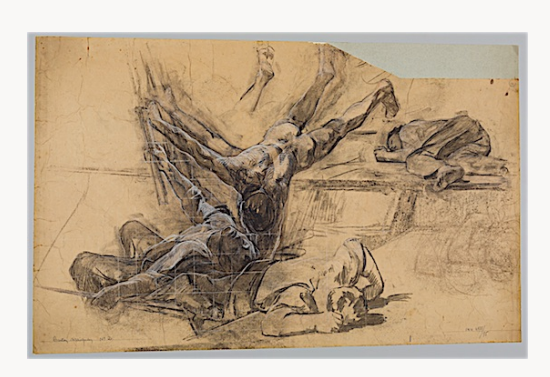
Fig. 13, Gridded drawing for Le Tocsin , ca. 1887. [view image & full caption]