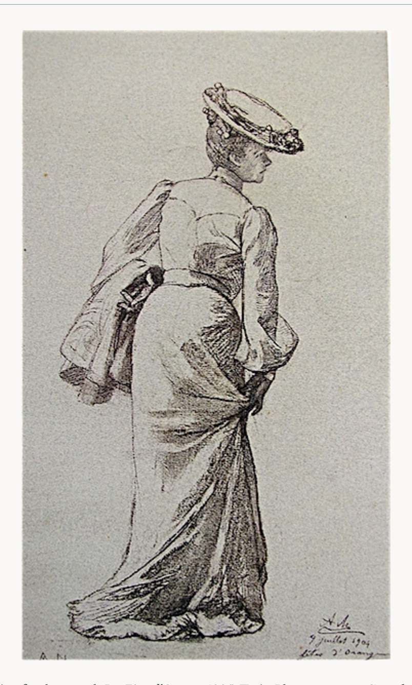
Fig. 9, Drawing for the mural, Les Fêtes d'Orange , 1905, Train Bleu restaurant, Gare de Lyon, Paris. Musée de Picardie, Amiens. [return to text]