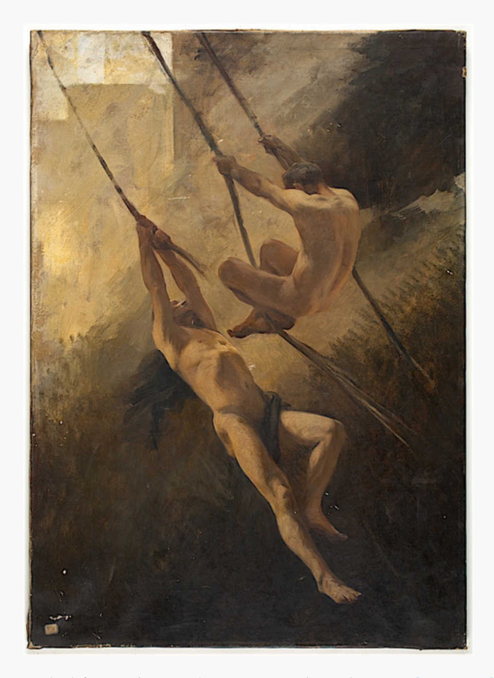
Fig. 14, Sketch for Le Tocsin , 1886. Oil on canvas. Musée de Picardie, Amiens. [return to text]