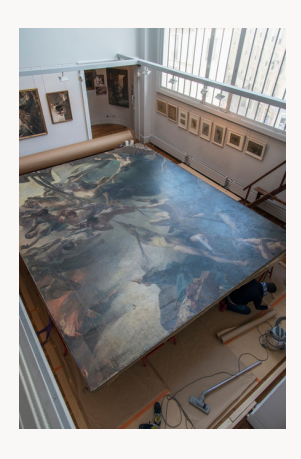
Fig. 10, Installing Le Tocsin at the Fondation Taylor, Paris. [view image & full caption]