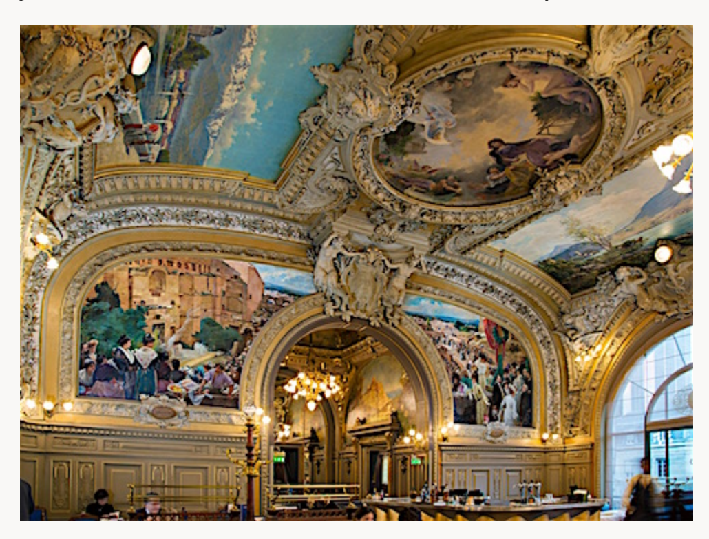
Fig. 2, Interior of the Train Bleu restaurant at the Gare de Lyon, Paris, with mural by Albert Maignan, Les Fêtes d'Orange , 1905. Oil on canvas attached to the wall. [return to text]