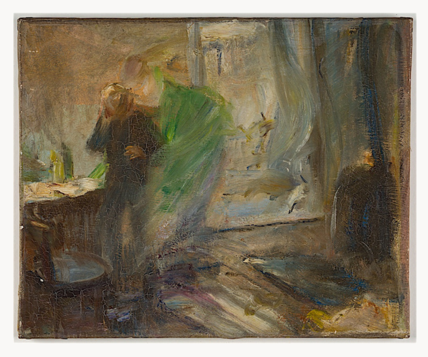
Fig. 17, Oil sketch for La Muse Verte , 1895. Musée de Picardie, Amiens. [return to text]