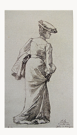
Fig. 9, Drawing for the mural, Les Fêtes d'Orange , 1905, Train Bleu restaurant, Gare de Lyon, Paris. [view image & full caption]

Of all the works in Maignan's former studio, the one painting that unnerves a viewer when he first see it is Les Voix du Tocsin (figs. 10, 11). Overwhelming in size and profound in scope, no one can be prepared for the somber sweep of the composition and the way in which it engulfs a viewer. Suggestive of the Italian renaissance masters, especially Michelangelo, the painting sounds a note of desperation and deep concern for humanity similar to the earlier paintings by Paul Chenavard. The range of the work, and the fact that Maignan worked on it for six years, defines the way in which he recognized that this was to be his signature composition. It is totally different from the lighter, more delicate decorations, which the artist completed for popular sites or for the Paris World's Fair of 1900.