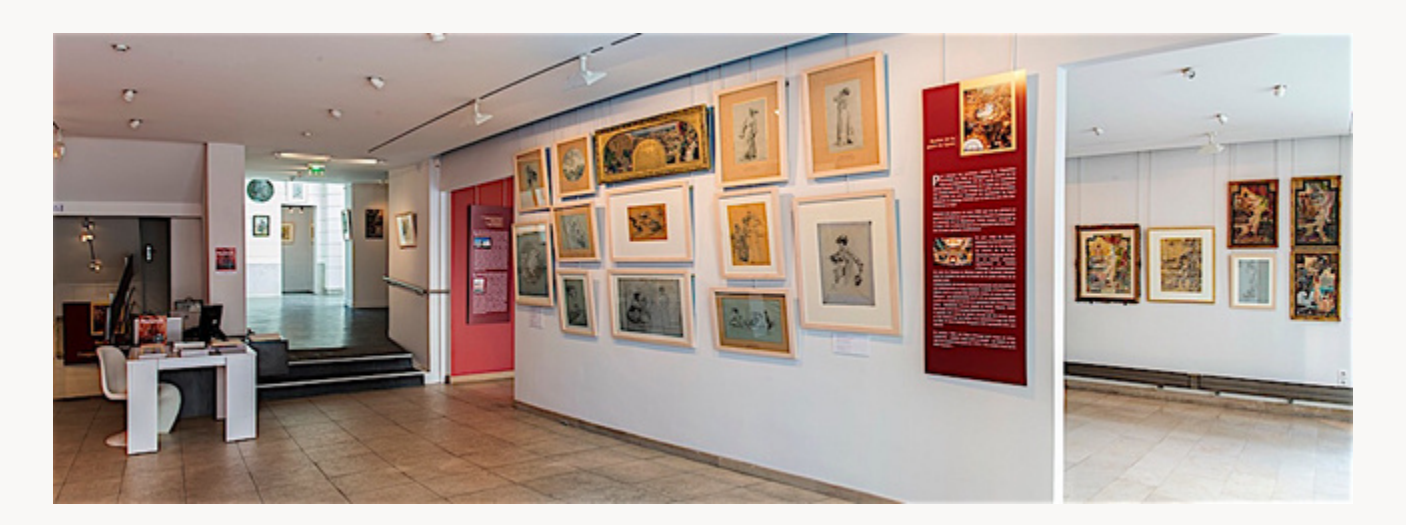
Fig. 1, View of the installation of the exhibition at the Fondation Taylor, Paris, with drawings and painted sketches for the mural at the Train Bleu restaurant, Gare de Lyon. [return to text]