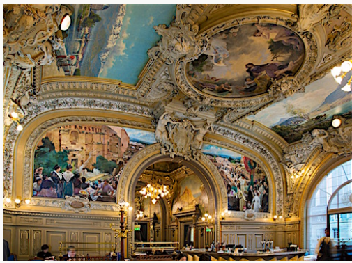
Fig. 2, Interior of the Train Bleu restaurant at the Gare de Lyon, Paris, with mural by Albert Maignan, Les Fêtes d'Orange , 1905. [view image & full caption]