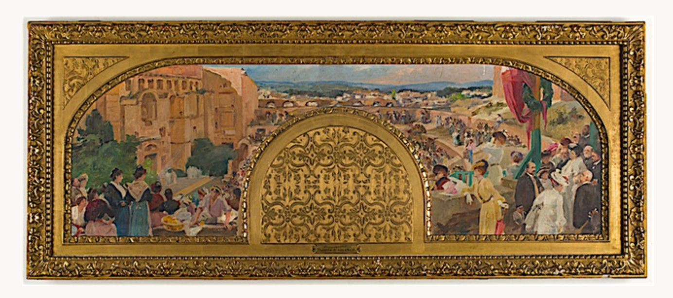
Fig. 6, Small oil sketch for Les Fêtes d'Orange , 1905, Train Bleu Restaurant, Gare de Lyon, Paris. Musée de Picardie, Amiens, France. [return to text]