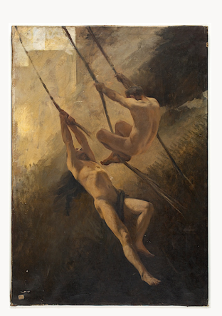
Fig. 14, Sketch for Le Tocsin , 1886. [view image & full caption]

In the balcony area two of Maignan's best-known works are found. Both La Muse Verte (The Green Muse) and La Fortune passe (Fortune is Fickle) reinforce the symbolist strain in Maignan's work (figs. 15, 16, 17, 18); they are modern allegories centered on the temptations of