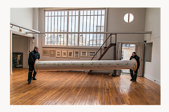
Fig. 4, Installing Le Tocsin at the Fondation Taylor, Paris. [view image & full caption]

Among the sections of the exhibition that offer an in-depth survey of Maignan's work are the preparatory studies, drawings, and oil sketches that provide essential background material for his impressive murals found in the restaurant of "Le Train Bleu" at the Gare de Lyon in Paris (figs. 5, 6, 7, 8, 9). Although the novelty of train travel has passed, the murals that Maignan completed just after 1900 focus on the ways in which travelers prepared to voyage into southeastern France, to visit various festivals that took place in the city of Orange, as it extolled the importance of agriculture and the gathering of workers during the grape harvest season. The importance of these murals, only hinted at in the installation of the show itself, is well explained in the accompanying catalogue. In effect, Maignan was to glorify the region in the south of France, emphasizing how visitors could travel by train between the region and Paris. The carefully visualized wide expanse of the countryside in one mural acquaints viewers with a location they will visit while they are still dining in an elegant station restaurant. The exhibition demonstrated how Maignan created these works, providing evidence of his awareness of the complicated spatial relationships found in the work of earlier masters, as well as his ability to create the conducive ambience of gaiety and