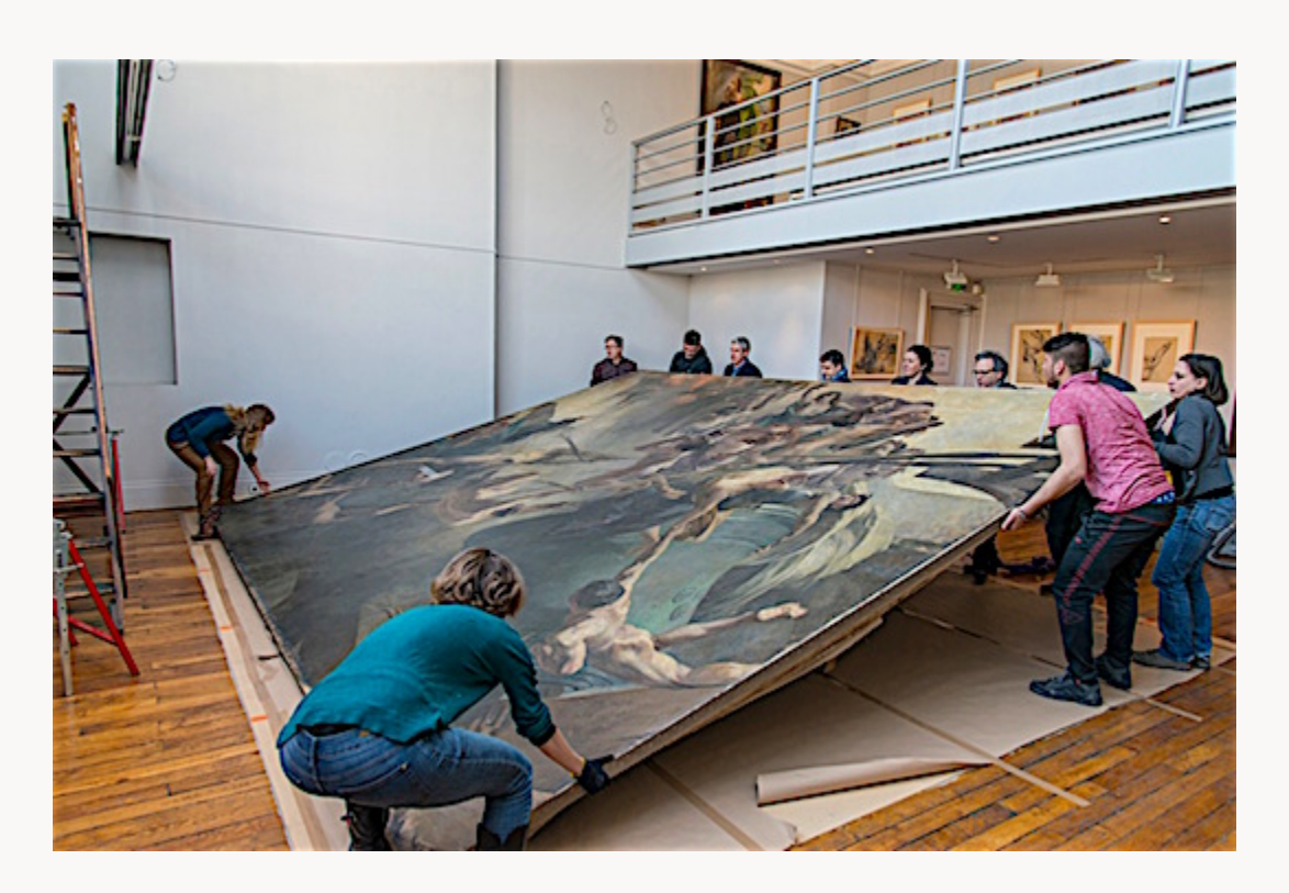
Fig. 11, Installing Le Tocsin at the Fondation Taylor, Paris. [return to text]