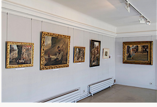
Fig. 18, Installation photograph of the Maignan exhibition, Fondation Taylor, Paris. [view image & full caption]

Once the differing aspects of Maignan's work have been understood, the exhibition poses a series of issues that remain challenging. The range of work is varied, creative, and very much of the time in which they were completed. He was an artist who worked in many areas (and styles) in an effort to maintain his career and to continue to challenge himself as an artist. His