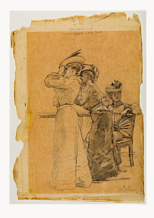
Fig. 5, Drawing for the mural, Les Fêtes d'Orange , 1905, Train Bleu restaurant, Gare de Lyon, Paris. [view image & full caption]

relaxation that might lure contemporary train travelers to the south of France. This part of the exhibition is a revelation, especially if one knows how the actual murals are positioned in the still functioning Train Bleu restaurant at the Gare de Lyon, which is designated as a significant historic site.