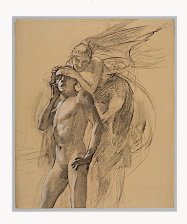
Fig. 16, Drawing for La Muse Verte , 1895. [view image & full caption]