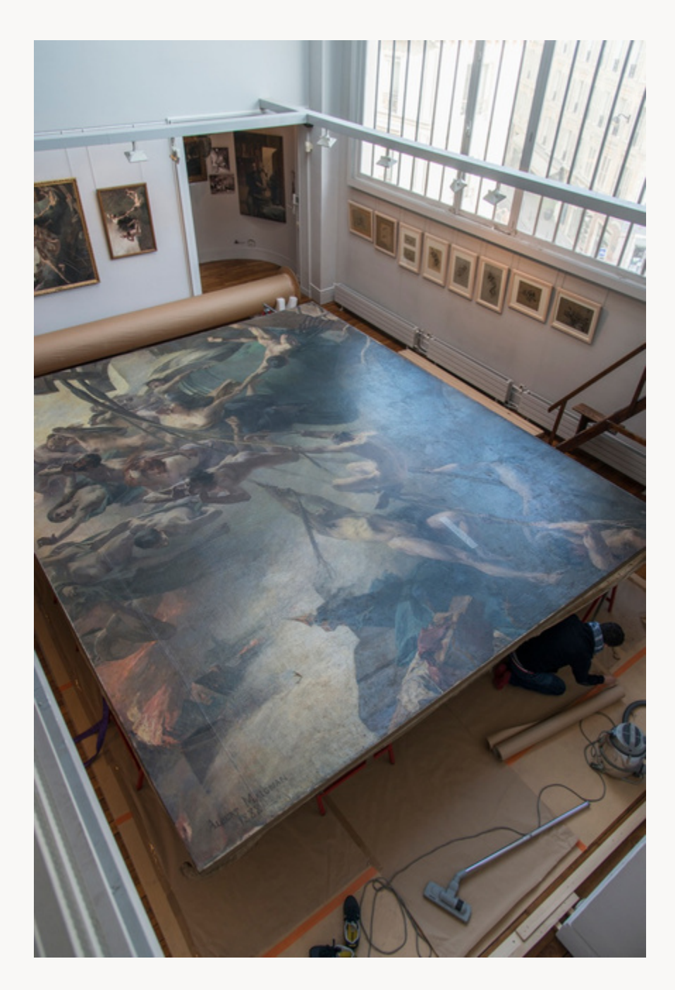
Fig. 10, Installing Le Tocsin at the Fondation Taylor, Paris. [return to text]