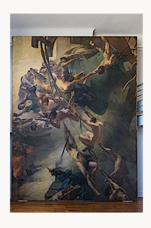
Fig. 3, Albert Maignan, Le Tocsin , 1888. [view image & full caption]