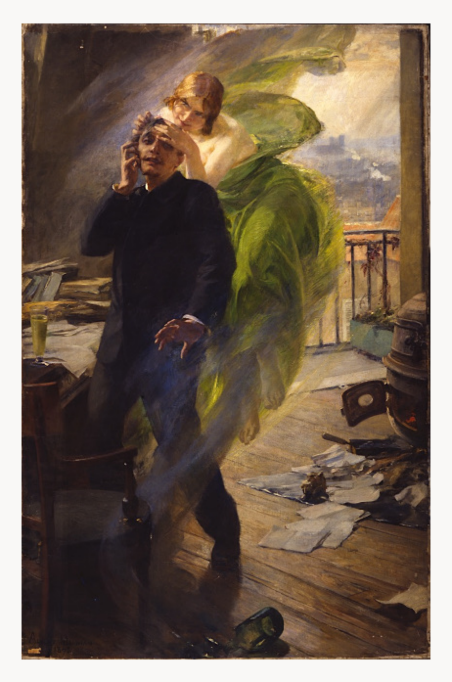
Fig. 15, La Muse Verte (The Green Muse), 1895. Oil on canvas. Musée de Picardie, Amiens. [return to text]