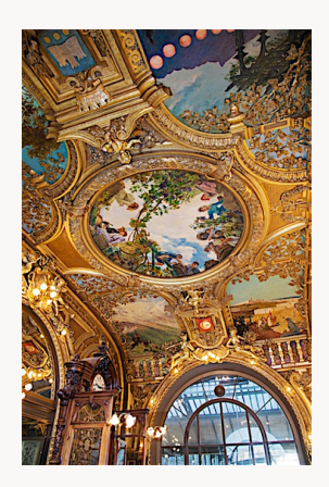
Fig. 8, Ceiling mural, La Bourgogne , 1900–01, Train Bleu restaurant, Gare de Lyon, Paris. [view image & full caption]