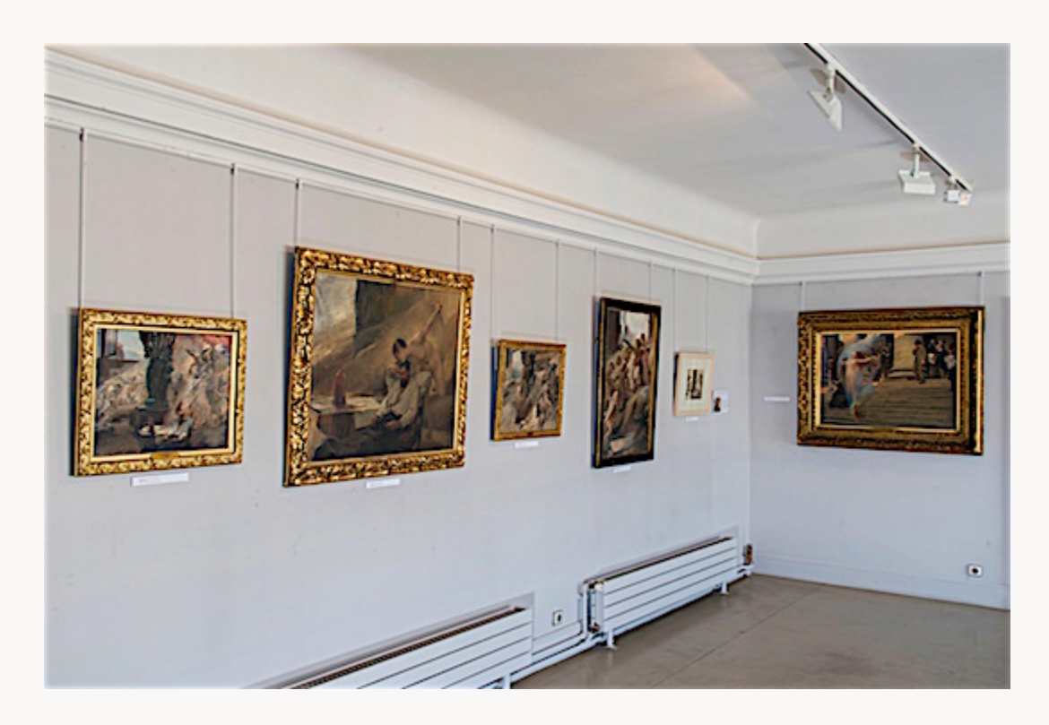
Fig. 18, Installation photograph of the Maignan exhibition, Fondation Taylor, Paris. Back wall right: La Fortune passe (Fortune is Fickle), 1895. Oil on canvas. Musée des Beaux-Arts, Reims. [return to text]