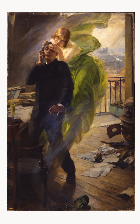
Fig. 15, La Muse Verte (The Green Muse), 1895. [view image & full caption]

the era that reformists often tried to control for the benefit of their citizens. In La Muse Verte , Maignan examined the temptation of absinthe, a popular and highly addictive drink that contributed to numerous social ills. The temptations of the filmy, green figure hovering behind the male figure in his painting raises the specter of total intoxication, a drugged state that was almost impossible to escape. While some other artists in the 1890s dealt with the frightful impact of drugs, few created a painting as haunting and evocative as Maignan did here. La Fortune passe also shown at the Salon of 1895, was another allegorical image that centered on the illusory pursuit of monetary gain, often at the Bourse, only to find that obtaining financial security was a fleeting apparition. Positioning these works in tandem with one another reveals not only how they evolved—often from numerous studies—but also reinforces the ways in which Maignan's works were linked to disturbing social issues, dilemmas that are often as haunting today as they were when Maignan created them.