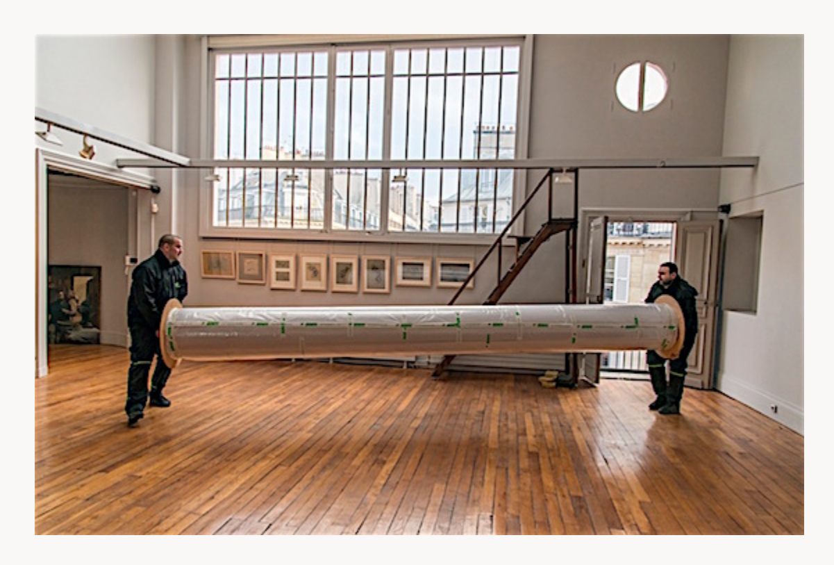
Fig. 4, Installing Le\ Tocsin at the Fondation Taylor, Paris. [return to text]