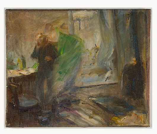
Fig. 17, Oil sketch for La Muse Verte , 1895. [view image & full caption]