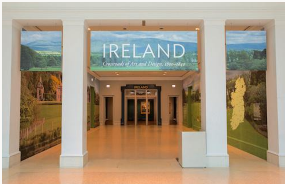
Fig. 2, Entrance to the exhibition Ireland: Crossroads of Art and Design, 1690–1840 . [return to text]