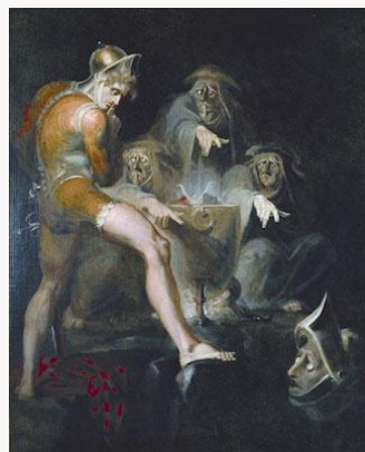
Fig. 9, Henry Fuseli, Macbeth Consulting the Vision of the Armed Head , 1793. [view image & full caption]