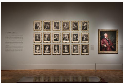
Fig. 5, View of Portrait Gallery featuring Thomas Frye, Life Size Heads and Ladies, Very Elegantly Attired in the Fashion, and in the Most Agreeable Attitudes , 1760–62. [view image & full caption]