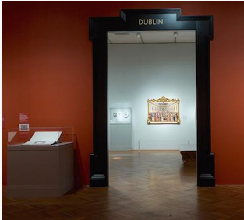
Fig. 11, View of entrance to the “Dublin” gallery. [return to text]