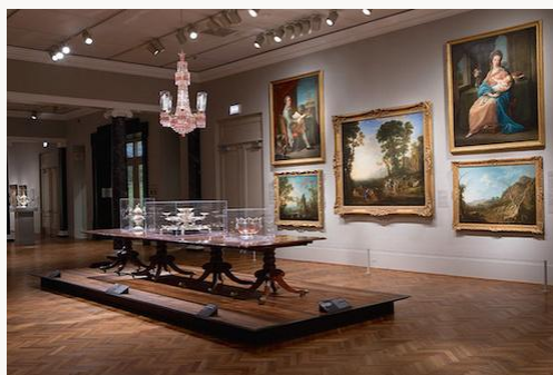
Fig. 36, View of “Saloon” gallery looking toward reception area and entrance to the exhibition.