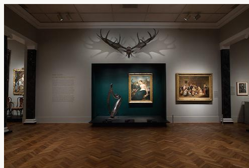
Fig. 3, Main reception area in the first gallery.