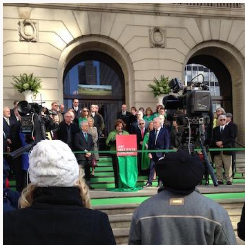
Fig. 1, Opening ceremonies for Ireland: Crossroads of Art and Design, 1690–1840 on the steps of the Art Institute of Chicago on March 17, 2015.