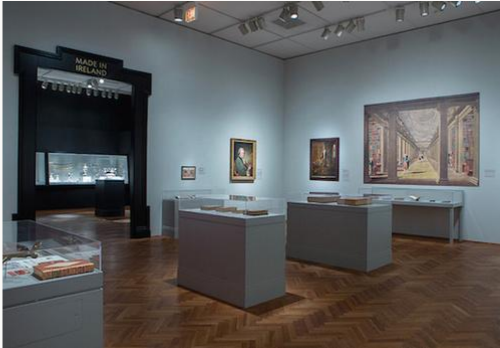
Fig. 14, View of entrance to the “Made in Ireland” sequence of galleries. [return to text]