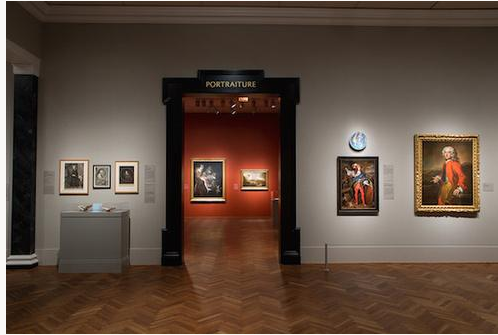
Fig. 8, View of entrance to the second “Portraiture” gallery from the first “Portraiture” gallery.

element not only announced a new theme, but also reminded the visitor of the country house design concept at every juncture along the circulation path.