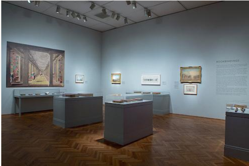
Fig. 12, View of Bookbinding area of the “Dublin” gallery. [return to text]