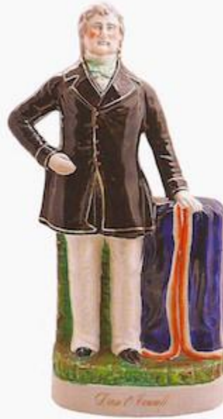
Fig. 31, Daniel O'Connell , ca. 1870. Earthenware with polychrome decoration, Staffordshire. Private collection. [return to text]