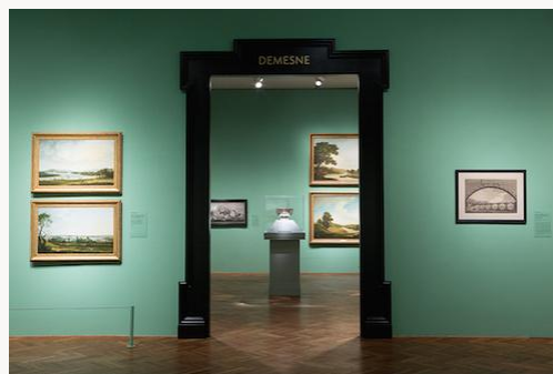
Fig. 32, View of “Demesne” gallery from the “Landscape” gallery.