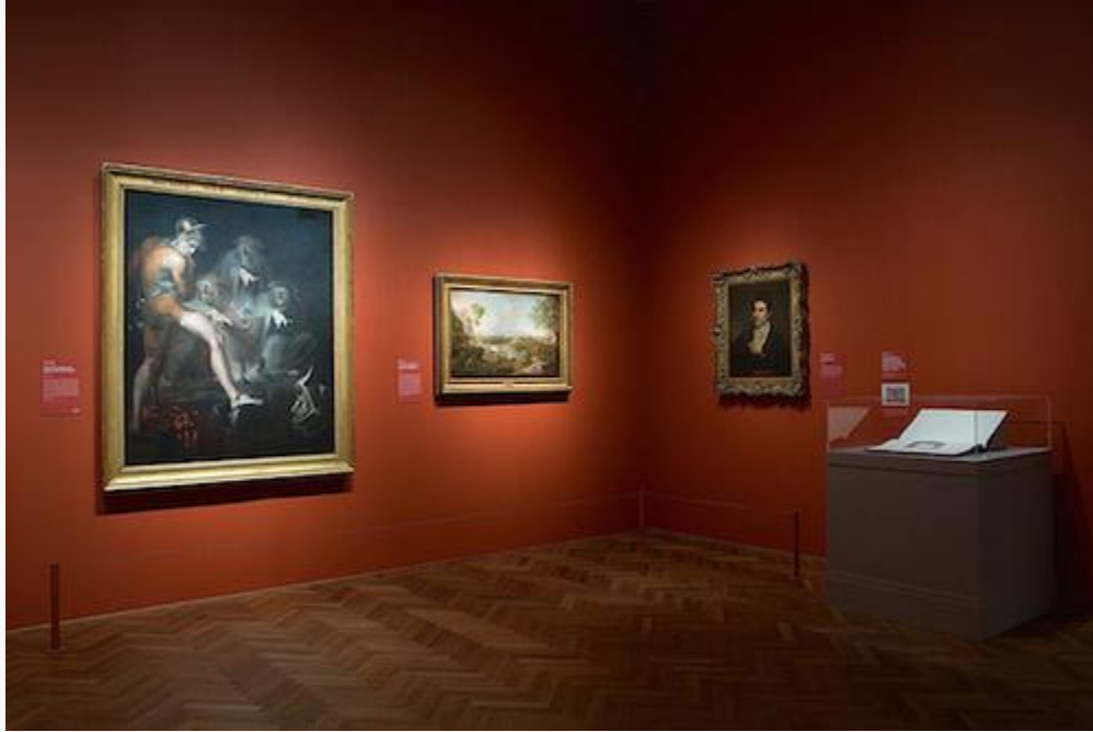
Fig. 10, View of second “Portraiture” gallery with glass case containing James Lewis’s Section of the Theatre for the City of Limerick . From Original Designs in Architecture: Consisting of Plans, Elevations, and Sections for Villas, Mansions, Townhouses, etc. and a New Design for a Theatre , 1797. The Art Institute of Chicago, Ryerson and Burnham Libraries. [return to text]