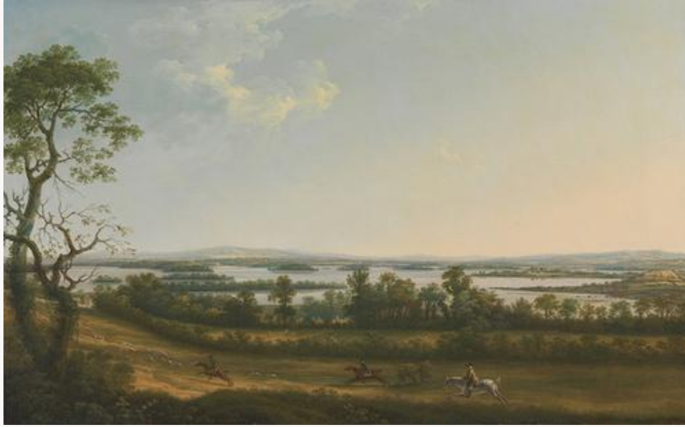
Fig. 29, Thomas Roberts, Lough Erne from Knock Ninney, withj Bellisle in the Distance, County Fermanagh, Ireland. 1771. Oil on canvas. [return to text]