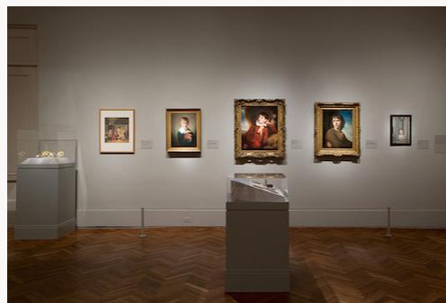
Fig. 6, Installation view of Portrait Gallery showing grouping of portraits of children. [view image & full caption]

It was Robert Richard Scanlan (1801–1876), however, whose painting The Blacksmith was most surprising (fig. 7). Although this work is dated only to the first half of the nineteenth century, the image of an Irish blacksmith resting from his labors discloses two significant characteristics: it is an image of a working man rather than a privileged—or comic—figure, and it is similar in spirit to the images of working class people found in the work of contemporary French painters like Philippe-Auguste Jeanron (1809–1877). Although Scanlan seems to have worked primarily as a genre painter catering to the Anglo-Irish market for images of horses, dogs, and anecdotal history, there is clear evidence in his watercolors that he was also concerned about the working poor in Ireland. [3] The blacksmith seated near his forge is shown in a monochromatic palette of browns and grays with all of his horseshoes pointing down—a comment perhaps on the state of the republican cause in Ireland?