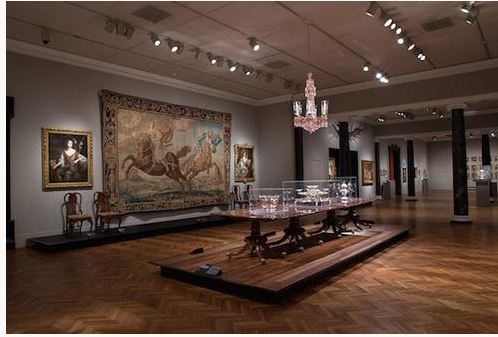
Fig. 4, View of the Saloon looking back at the Reception area and the Portrait Gallery.

circulation pattern mimicked that of an eighteenth-century country house and clearly stated the design concept for the exhibition at the outset.