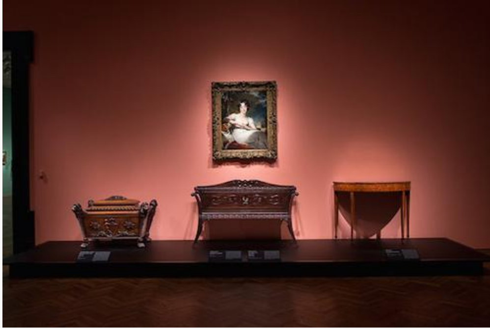
Fig. 25, View of vignette featuring nineteenth-century furniture. Left: Mack, Williams and Gibton, Cellarette , 1821–25. Mahogany with metal liner. L. Knife and Son, Inc.; center: Mack, Williams Gibton, Hall Bench , 1829–42. Mahogany and brass. Museum of Art, Rhode Island School of Design, Providence.