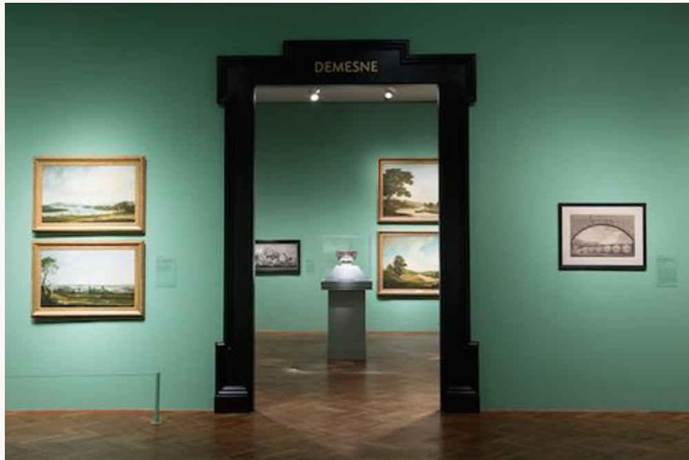
Fig. 32, View of “Demesne” gallery from the “Landscape” gallery. [return to text]