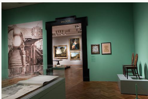
Fig. 35, View of “Saloon” from the “Demesne” gallery.

The final gallery in the country house circuit is the “Saloon,” which is a gloriously grand, eighteenth-century space (fig. 35). The only nineteenth-century object in it is a pink crystal and brass chandelier from the Art Institute of Chicago’s collection that was a late addition to the installation (fig. 36). In a room full of tapestries and large-scale paintings as well as impressive silver serving pieces, the chandelier seemed to attract visitors’ attention first. Perhaps it simply added a necessary sparkle to the beautifully designed gallery.