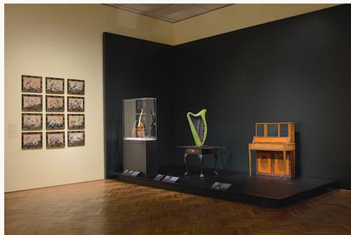
Fig. 21, View of musical instruments section of “Made in Ireland” sequence. [view image & full caption]

Music certainly qualifies as one of Ireland’s most widely exported cultural traditions; the full scope of Irish design production would not be complete without the inclusion of musical instruments in the exhibition. Although references to musical instruments could be found in a variety of contexts throughout the show, the actual instruments were featured prominently in the “Made in Ireland” galleries where a cither viol, a kit/pochette (a small string instrument), an upright piano, and a portable harp took center stage (fig. 21). With the exception of the piano, portability is an important characteristic of many Irish instruments, in part because Irish music has historically functioned as much as a political tool as any weapon. [7]