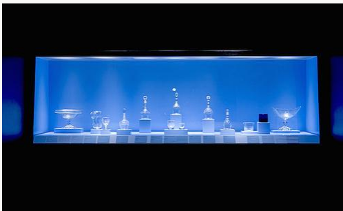
Fig. 19, View of glassware vitrine in “Made in Ireland” sequence. [view image & full caption]

The English restrictions on textile production were equally, if not even more severe than those on glass. Production of wool cloth for export, for example, was prohibited because it provided competition for the numerous English wool manufacturers. Instead, the Irish were encouraged to develop linen production, which subsequently became highly desirable in its own right. Most of the textile objects in the exhibition represented eighteenth-century tapestry production (typically in linen) as well as a selection of charming embroidered samplers. One of the few objects in the exhibition that related to the working class Irish was the needlework sampler book created by Dorothy Tyrrell in 1832. This portfolio of small scale samples was made when Tyrrell was a student at the Kildare Place Model School in Dublin, a school for