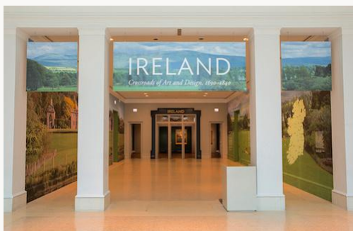
Fig. 2, Entrance to the exhibition Ireland: Crossroads of Art and Design, 1690–1840 .