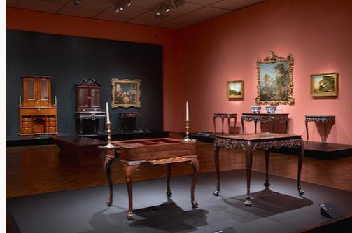
Fig. 24, View of “Furniture” gallery.