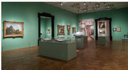
Fig. 33, View of “Demesne” gallery.