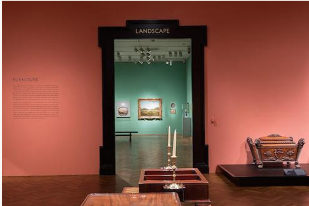
Fig. 27, View of the “Landscape” gallery from the “Furniture” gallery. [return to text]