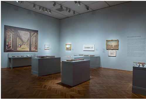
Fig. 12, View of Bookbinding area of the “Dublin” gallery.

Watson Bindery in Dublin. For bibliophiles everywhere, this was an opportunity to study Irish bookbinding in detail; for neophyte book lovers, an instructive video explained the techniques of the process.