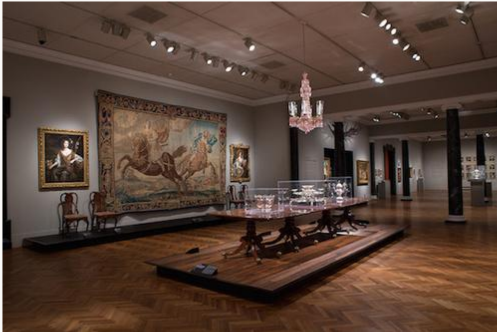
Fig. 4, View of the Saloon looking back at the Reception area and the Portrait Gallery. [return to text]