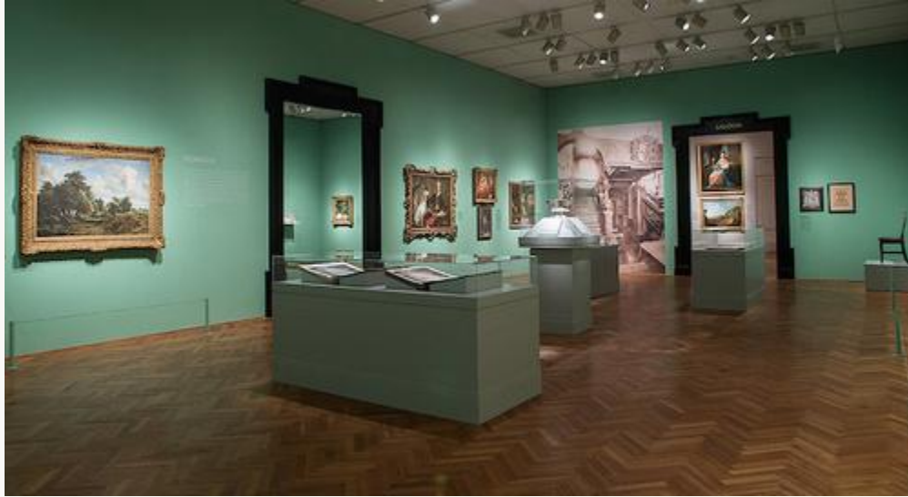
Fig. 33, View of “Demesne” gallery. [return to text]