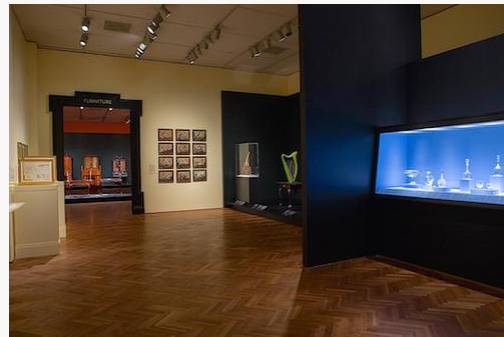
Fig. 18, View of three-part sequence of “Made in Ireland,” showing Glassware and Musical Instruments. [view image & full caption]