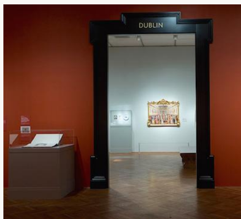
Fig. 11, View of entrance to the “Dublin” gallery. [view image & full caption]

The visitor turns next to the theme of Dublin where the development of the city is explored in some detail (fig. 11). The dark and somewhat gloomy atmosphere of the previous gallery opened onto a large light blue colored gallery featuring an early survey of Dublin as well as several portraits by the American painter Gilbert Stuart (1755–1828) who received a number of commissions from prominent Dublin residents. The expansion of Dublin during this colonial period was quite dramatic. The population in 1685 was 45,000; by 1841, it was 254,000. Real estate development and commercial connections with the western ports of England and Scotland as well as the larger British Empire made the city second only to London in importance. It was during the same period, however, that the Irish diaspora began, first to other ports in Europe and then to Jamaica, Philadelphia, Boston, New York, and Chicago. By 1849 there would be 220,000 Irish immigrants arriving in the United States in just one year as a result of the Potato Famine and political oppression.