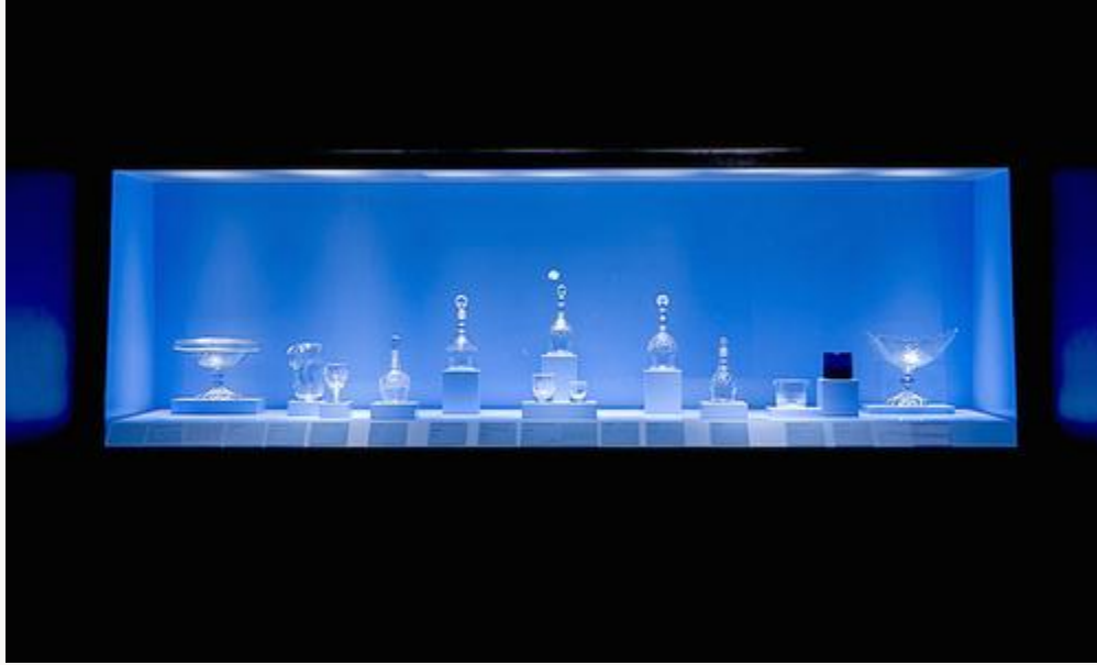
Fig. 19, View of glassware vitrine in “Made in Ireland” sequence. [return to text]