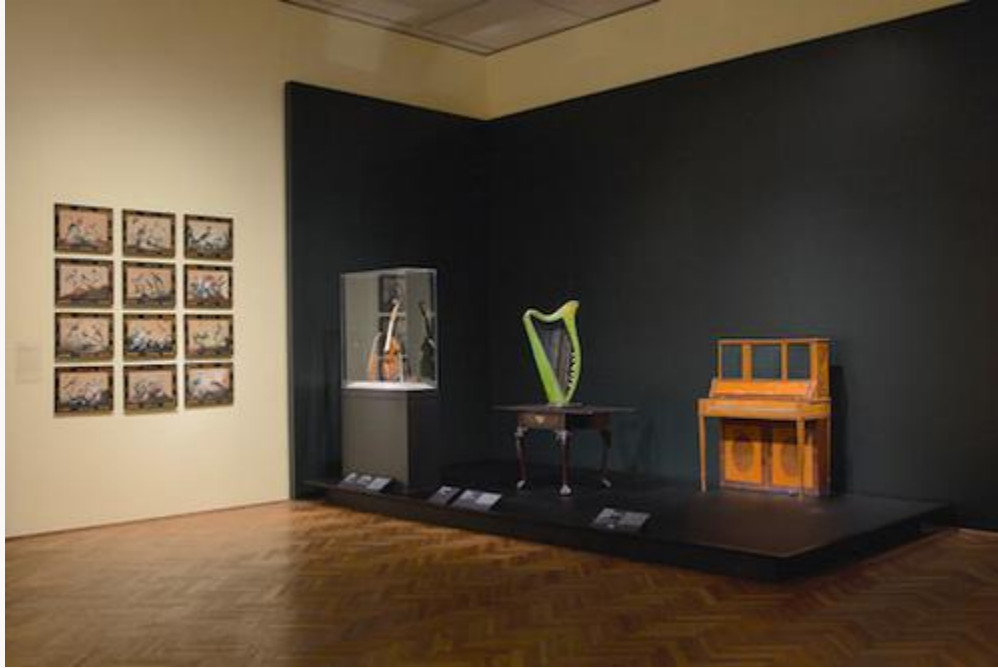
Fig. 21, View of musical instruments section of “Made in Ireland” sequence. [return to text]