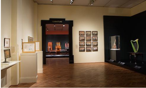
Fig. 23, View of entrance to the “Furniture” gallery from the three-part “Made in Ireland” sequence of galleries.

English architect James Wyatt (1746–1813) for Mount Kennedy, an Irish-Georgian estate in County Wicklow. [9] One slight alteration to the neoclassical design vocabulary appears to have been made by replacing the traditional Roman swags of garlands with a more rococo curving design around the central brass crest.