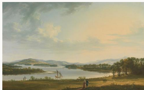
Fig. 28, Thomas Roberts, Knock Ninney and Lough Erne from Bellisle, County Fermanagh, Ireland , 1771. [view image & full caption]