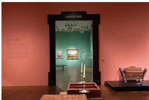
Fig. 27, View of the “Landscape” gallery from the “Furniture” gallery. [view image & full caption]