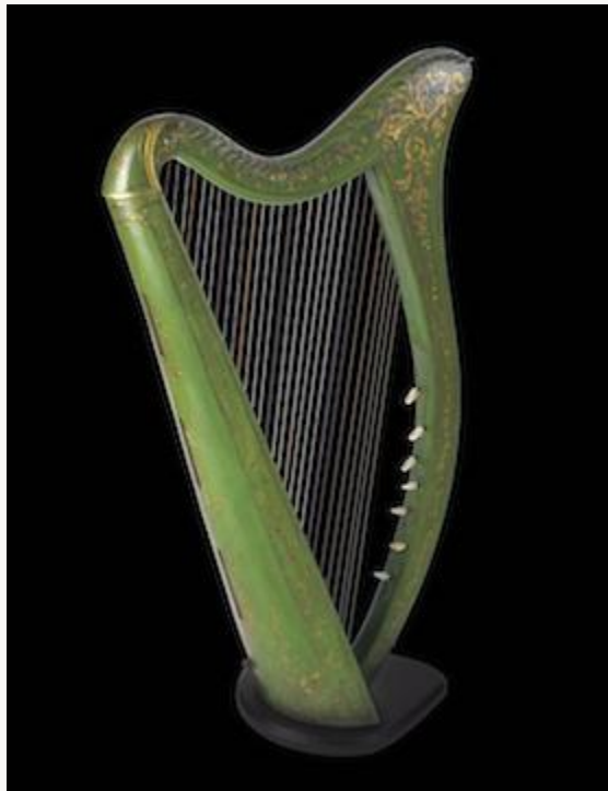
Fig. 22, John Egan, Portable Harp , ca. 1820. Maple, spruce, ivory, catgut and green paint with gilt decoration. The O’Brien Collection.