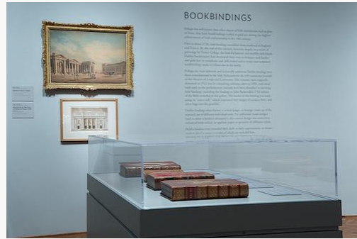
Fig. 13, Close-up view of Bookbindings area of the “Dublin” gallery.