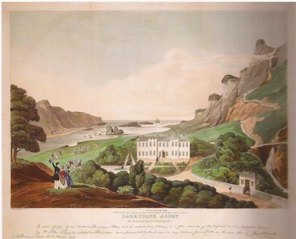
Fig. 30, Robert Havell, Derryane Abbey, the Residence of Daniel O'Connell, Esquire, M. P. , ca. 1833. Etching and hand-colored aquatint on paper. Private collection. [return to text]