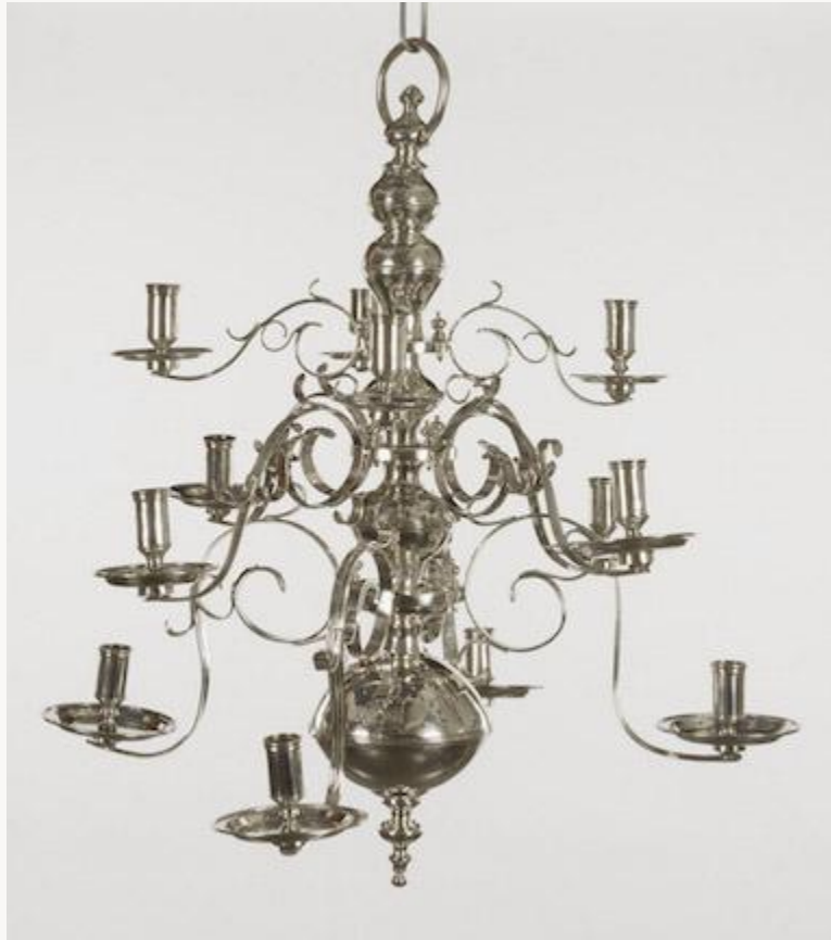
Fig. 16, Mark Fallon, Chandelier , ca. 1742. Silver. Winterthur Museum, Winterthur. Made for the Dominican Convent of Jesus, Mary and Joseph, County Galway, Ireland. [return to text]