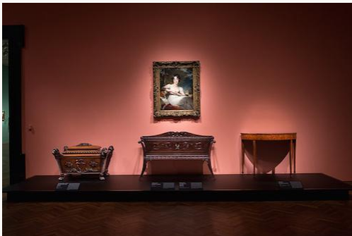
Fig. 25, View of vignette featuring nineteenth-century furniture.