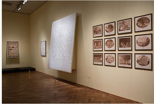
Fig. 20, View of textile gallery featuring a Damask tablecloth from 1830. [view image & full caption]

training young women as elementary school teachers run by the Society for the Promotion of the Poor in Ireland. In contrast, the manufacturing side of the textile business was best illustrated by a large linen damask tablecloth design by Coulson’s Manufactory (ca. 1830) (fig. 20). Immediately adjacent to the tablecloth was a set of twelve didactic engravings by William Hincks showing the process of producing linen, from planting the flax to the finished textiles at the factory; these historical engravings remained quite effective in serving their original educational purpose in the twenty- first century.