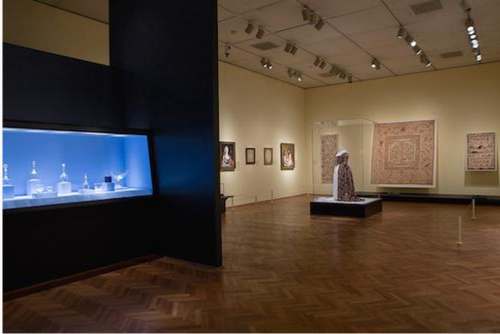
Fig. 17, View of three-part sequence of “Made in Ireland,” showing Glassware and Textiles. [return to text]