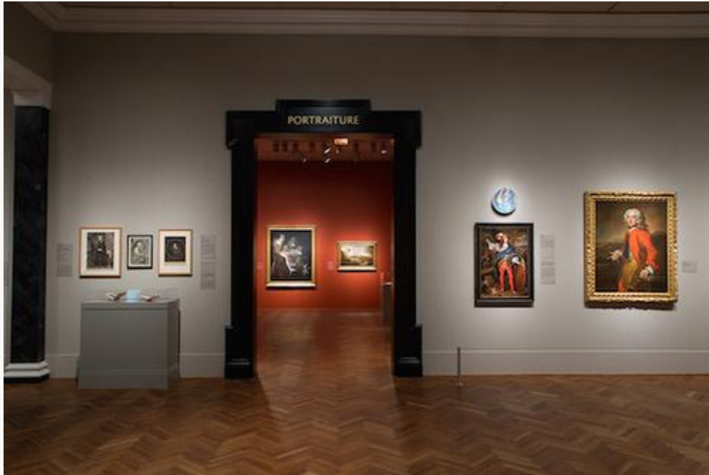
Fig. 8, View of entrance to the second “Portraiture” gallery from the first “Portraiture” gallery. [return to text]