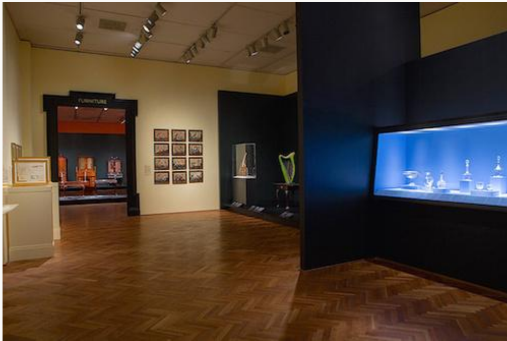
Fig. 18, View of three-part sequence of “Made in Ireland,” showing Glassware and Musical Instruments. [return to text]