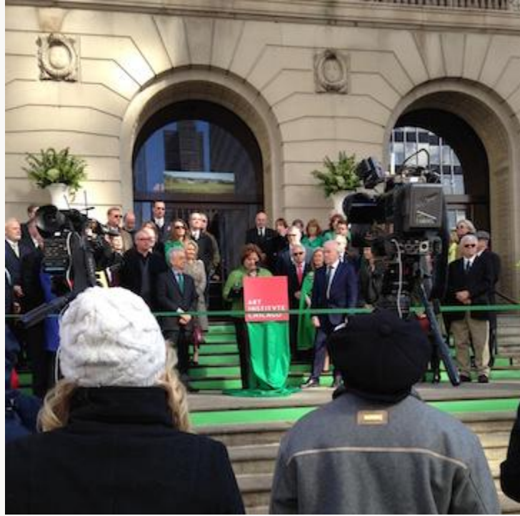
Fig. 1, Opening ceremonies for Ireland: Crossroads of Art and Design, 1690–1840 on the steps of the Art Institute of Chicago on March 17, 2015. [return to text]