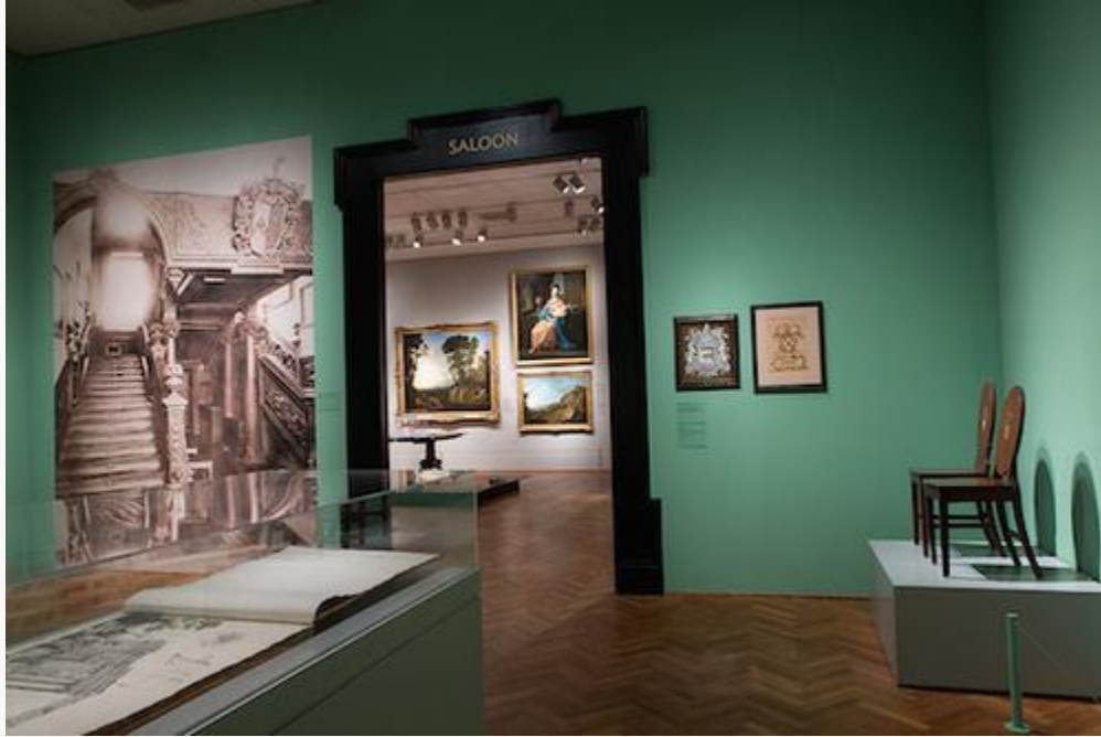
Fig. 35, View of “Saloon” from the “Demesne” gallery. [return to text]