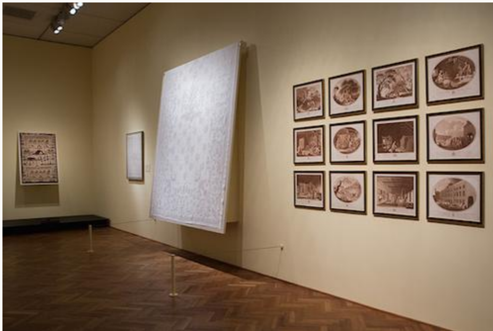
Fig. 20, View of textile gallery featuring a Damask tablecloth from 1830. Coulson’s Manufactory. Higinbotham Textile Collection; and William Hincks, Twelve Engravings Showing the Stages of Flax and Linene Fabrication in Ireland , 1783. Engraving on paper in bistre. Private Collection. [return to text]