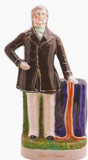
Fig. 31, Daniel O'Connell , ca. 1870.

The next country house ‘room’ is visually linked to the theme of landscape in its use of sea green walls, but the context in the “Desmesne” gallery explored the architecture of the country home in considerably more depth (fig. 31). In both paintings and architectural folios, the nature of the Anglo-Irish aesthetic is clearly expressed (fig. 32). The paintings, though mostly created in the eighteenth century, portray aristocratic English customs and beliefs: the love of dogs and horses; the indifference about acknowledging the full humanity of native peoples in British colonies, and the adoption of a neoclassical architectural language based on the work of John Vanbrugh and the Palladian circle around Lord Burlington. In the 1825 painting by George Nairn, the museum visitor bears witness to the stables of Robert FitzGerald, 19th Earl of Kildare at Carton, his estate in County Kildare (fig. 33). The lengthy title of the painting tells the story: The Interior of the Stables at Carton, County Kildare: A Liveried Groom, Lord Charles William FitzGerald, and His Sister, Lady Jane Seymour FitzGerald (fig. 34). To say that these pristinely clean stables are untouched by reality would be an understatement, and yet the canvas reflects the very real illusions of a privileged class.