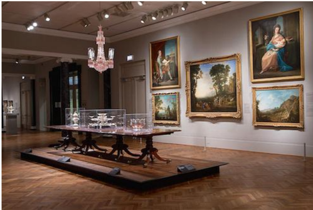
Fig. 36, View of “Saloon” gallery looking toward reception area and entrance to the exhibition. [return to text]