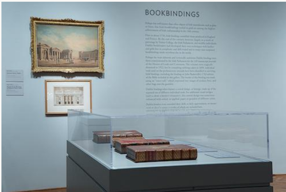
Fig. 13, Close-up view of Bookbindings area of the “Dublin” gallery. [return to text]