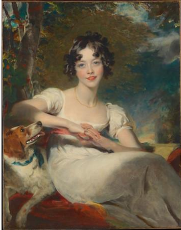
Fig. 26, Thomas Lawrence, Lady Maria Conygham , 1824–25. Oil on canvas. The Metropolitan Museum of Art, New York. [return to text]