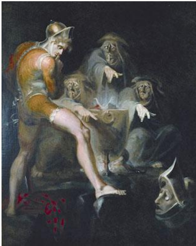
Fig. 9, Henry Fuseli, Macbeth Consulting the Vision of the Armed Head , 1793. Oil on canvas. Folger Shakespeare Library, Washington, DC. [return to text]