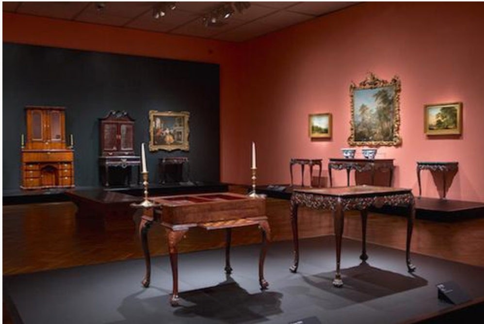
Fig. 24, View of “Furniture” gallery. [return to text]