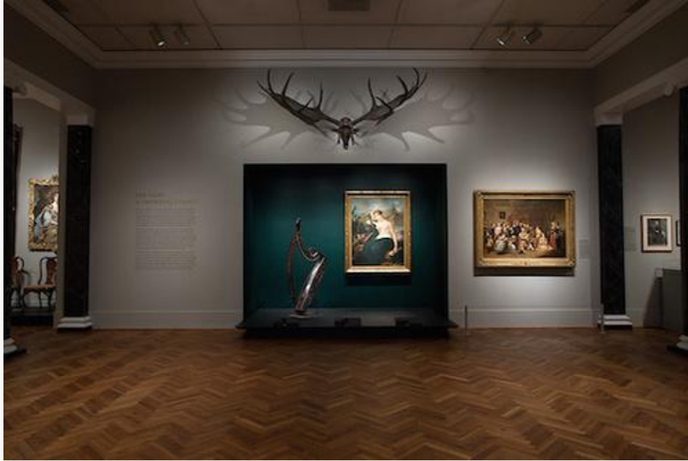
Fig. 3, Main reception area in the first gallery. Central display: John Kelly, Harp (Cláirseach) , 1734. Painted willow and brass. Museum of Fine Arts, Boston; Robert Fagan. Portrait of a Lady as Hibernia , ca. 1801. Private collection; Giant Irish Elk ( Megaloceros giganteus ), ca. 9000 BCE. Bone. American College of Surgeons, Chicago. [return to text]