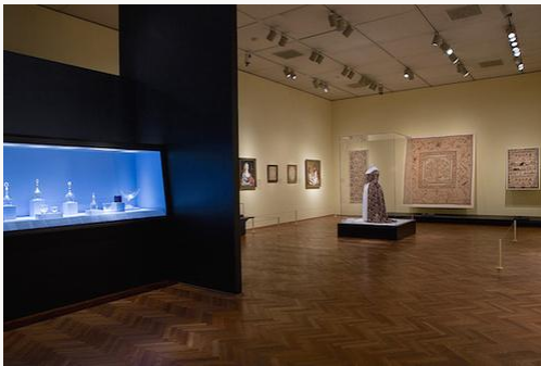
Fig. 17, View of three-part sequence of “Made in Ireland,” showing Glassware and Textiles. [view image & full caption]

this dilemma by redefining their market, changing their production processes, and creating a new approach to glass design. The result was a simpler type of glassware, emphasizing form rather than decoration and utilizing a much lower lead content. The dark gray color that resulted from trace contaminants in the production process became a hallmark of its unique character. The market was no longer the middle class or Anglo-Irish aristocracy, but the Irish working class. It would appear that the concept of good design at an affordable price for everyone arrived in Ireland seventy years before William Morris stated the case in 1860s England. Sadly, the English tax measures imposed after 1800 “forced many Irish glass-houses to resort to smuggling in order to stay in business” (191). By 1835, almost all Irish glass production was closed; despite the quality of the work, even Waterford Glass had to shut its doors in 1851. [6]