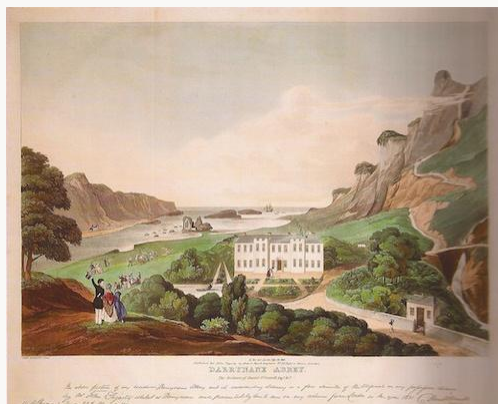
Fig. 30, Robert Havell, Derrynane Abbey, the Residence of Daniel O'Connell, Esquire, M. P. , ca. 1833.