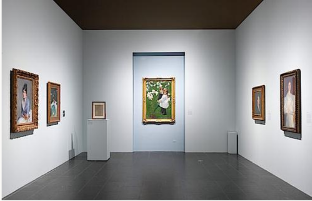
Fig. 8, View of the second gallery, “Broadway,” including John Singer Sargent, Garden Study of the Vickers Children , 1884, at center. [return to text]