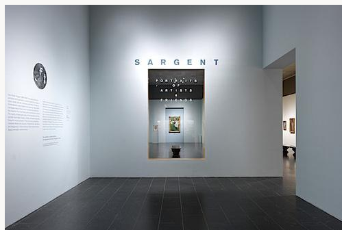
Fig. 2, View of the entrance to Sargent: Portraits of Artists and Friends . [larger image]

This goal was manifested in an installation that prompted new discourses by juxtaposing works not usually paired together. Subtle changes were also made to the physical space of the exhibition hall. The clean, modern lines and minimalist aesthetic deployed by Brian Butterfield, the Metropolitan Museum's Senior Exhibition designer, forcefully held the temptation for Gilded Age nostalgia at bay. In the initial vestibule, crisp white walls surrounded a rectangular glass window through which visitors could peer into the second gallery space (fig. 2). This design decision reinforced a commitment to porous boundaries between galleries, and thus a more fluid conversation between works created in different years and inspired by different locations. Meanwhile, the adjacent introductory wall text concisely established Sargent's protean nature and social acumen among his theatrical, musical, and literary contemporaries.