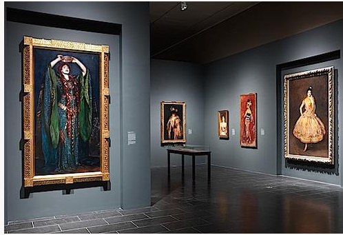
Fig. 11, View of the third gallery, “London,” including John Singer Sargent, Ellen Terry as Lady MacBeth , 1889, on the left. [larger image]