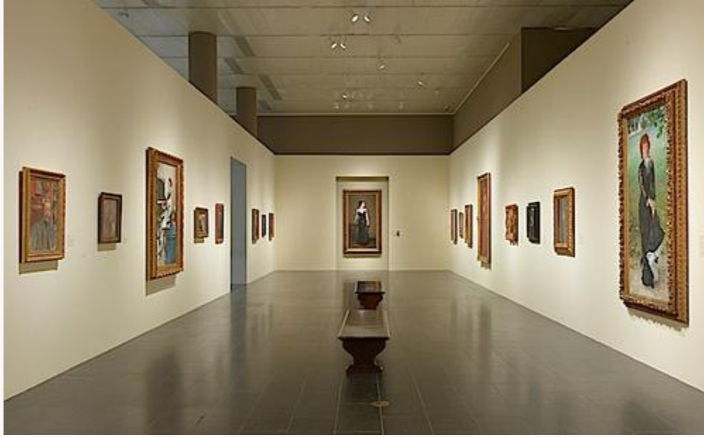
Fig. 5, View of the first gallery, "Paris," including John Singer Sargent, Madame X , 1883–84, at center.