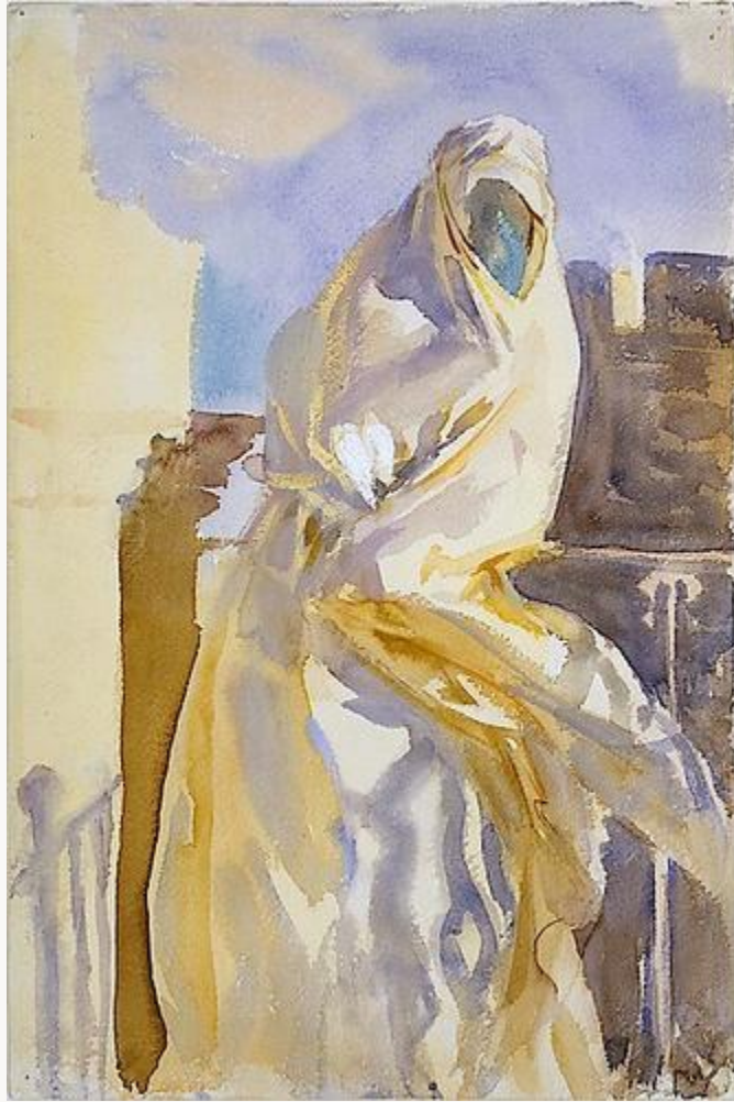
Fig. 18, John Singer Sargent, Arab Woman , 1905–06. Watercolor with gouache on off-white wove paper. The Metropolitan Museum of Art, New York. [return to text]