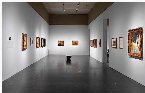
Fig. 16, View of the fifth gallery, "Europe," including John Singer Sargent, In the Garden (Corfu) , 1909, on the far right. [larger image]