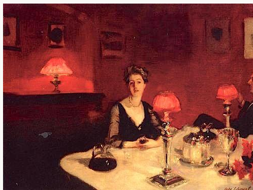
Fig. 10, John Singer Sargent, Le Verre de Porto (A Dinner Table at Night) , 1884. Oil on canvas. Fine Arts Museums of San Francisco, California. [larger image]

One particularly evocative group of portraits within the “Broadway” portion of the exhibition hung on the far side of the long gallery space. While not the largest or best known of the works on view, these four paintings of destabilized domestic spaces, Robert Louis Stevenson and his Wife (1885), Fête Familiale (The Birthday Party) (1887), Robert Louis Stevenson (1887), and A Dinner Table at Night (1884) shared a rich red tonality that enticed exhibition visitors. In A Dinner Table at Night (1884) (fig. 10), Sargent adheres to upper class conventions of a well-appointed room only to subvert the terms of his fashionably organized interior by deploying unsettling vacancies and denying the viewer a coherent narrative. Upon closer inspection, one can see where Sargent exposed the canvas throughout the painted white tablecloth, which further disrupts the viewer’s illusion of the dining room. The work is generally quite thinly painted, a quality made more vivid in those passages where Sargent scraped away layers of paint and ground wash to reveal high points of the canvas weave. This is thrown into relief thanks to the impasto highlights added to the still-life elements in the foreground using a heavily laden dry brush.