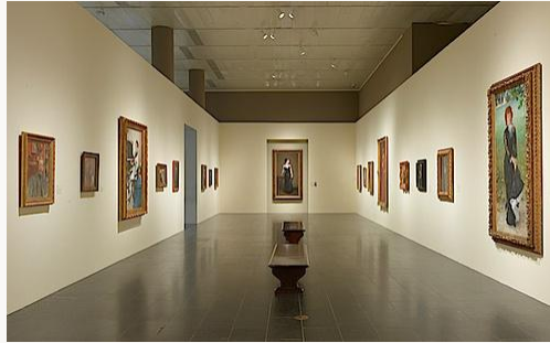
Fig. 5, View of the first gallery, “Paris,” including John Singer Sargent, Madame X , 1883–84, at center.