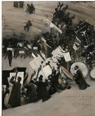
Fig. 3, John Singer Sargent, Rehearsal of the Padeloup Orchestra at the Cirque d’Hiver, 1879–80. Oil on canvas. Museum of Fine Arts, Boston. [larger image]

The term “portrait,” the unifying generic theme of the exhibition, was immediately complicated thanks to the inclusion of Rehearsal of the Padeloup Orchestra at the Cirque d’Hiver (1879–80), one of the first paintings encountered in the gallery (fig. 3). This study of Jules-Etienne Padeloup’s orchestra features a grisaille palette and blurred amphitheater. By eliminating detail or identifiable likenesses, Sargent draws attention away from specific musicians in order to highlight the aural experience of the orchestra itself. While this image certainly reinforced Sargent’s interest in performance and spectacle, it could have also anchored an exhibition devoted entirely to Sargent’s discipleship of Wagner and love of music, or an exploration of Sargent and the performing arts more broadly. In the context of this exhibition, the experimental study reinforced Sargent’s aesthetic response to the Concert Populaires conducted by his Parisian contemporary. Nearby, visitors congregated around the Portrait of Edouard and Marie-Loise Pailleron (1880), which was united in the gallery space with flanking portraits of the sitters’ parents (fig. 4). The children’s penetrating gazes confront the viewer, and their distinct identities unsettle conventions of traditional portraiture, particularly portraits of young sitters who were typically rendered as deferential accessories to prominent parents.