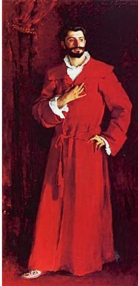
Fig. 6, John Singer Sargent, Dr. Pozzi at Home , 1881. Oil on canvas. Hammer Museum, Los Angeles. [return to text]