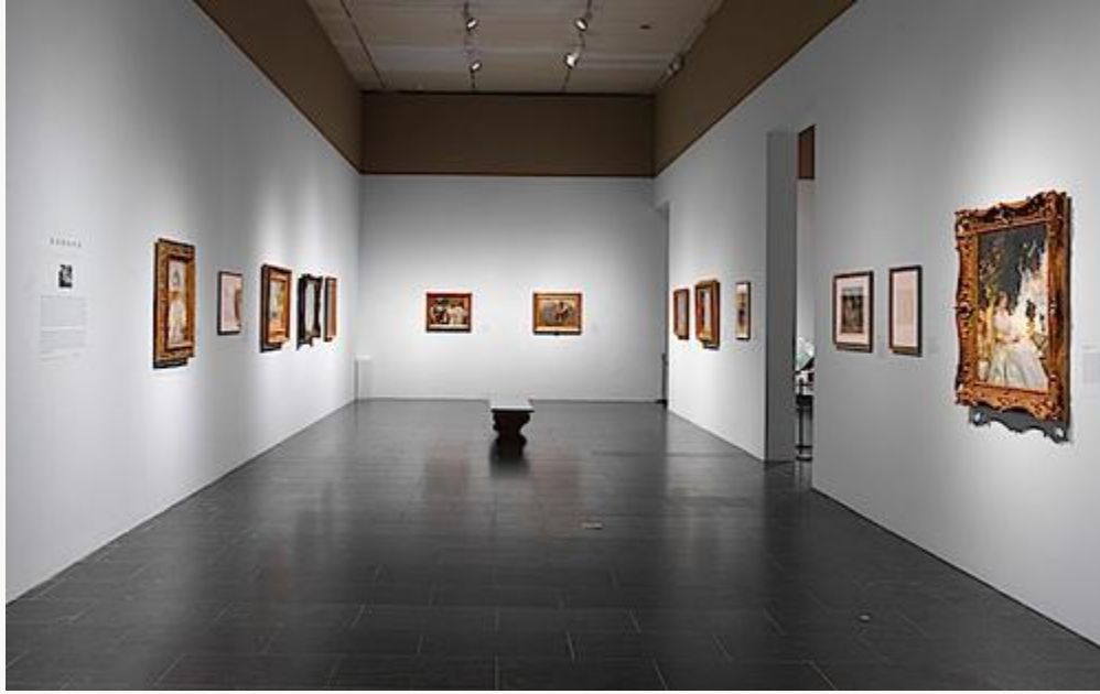
Fig. 16, View of the fifth gallery, “Europe,” including John Singer Sargent, In the Garden (Corfu) , 1909, on the far right. [return to text]