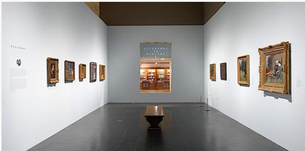
Fig. 7, View of the second gallery, “Broadway,” which included works produced in the English countryside. [return to text]