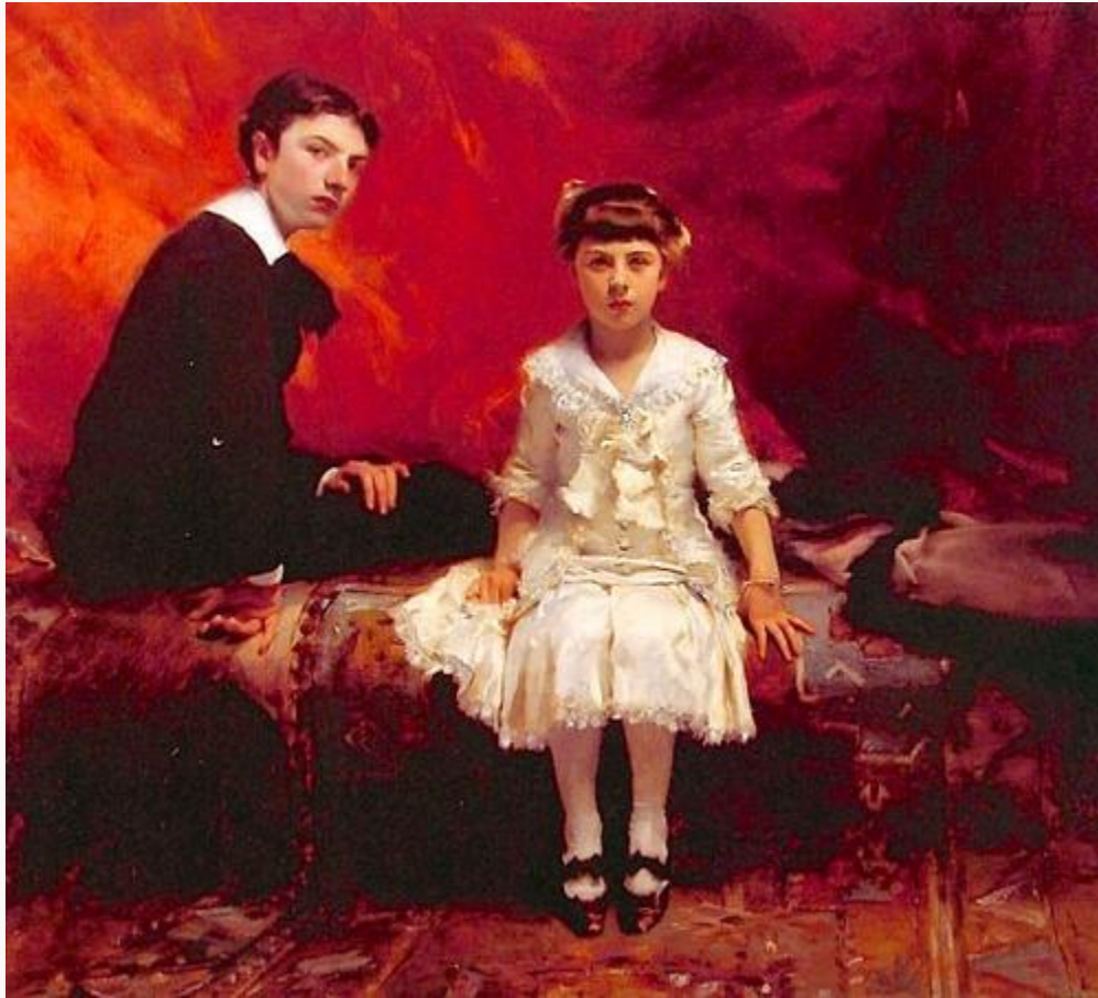
Fig. 4, John Singer Sargent, Portrait of Edouard and Marie-Loise Pailleron , 1881. Oil on canvas. Des Moines Art Center. [return to text]