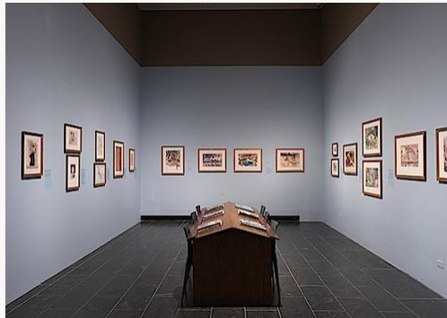
Fig. 17, View of the reading room, Sargent: Portraits of Artists and Friends . [larger image]

The Cantor Exhibition Hall's reading room housed the final room of the exhibition, which featured twenty-one watercolors and drawings from the Metropolitan Museum's permanent collection (fig. 17). Emphasizing Sargent's acumen as a draftsman and watercolorist, the gallery showcased the museum's corpus of Sargent's figural works on paper, and situated Sargent: Portraits of Artists and Friends in conversation with the popular 2012 exhibition Sargent's Watercolors .