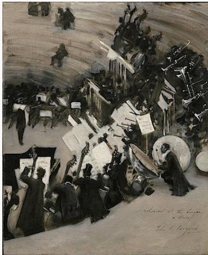
Fig. 3, John Singer Sargent, Rehearsal of the Padeloup Orchestra at the Cirque d'Hiver , 1879–80. Oil on canvas. Museum of Fine Arts, Boston. [return to text]