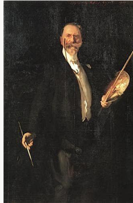
Fig. 15, John Singer Sargent, William Merritt Chase , 1902. Oil on canvas. The Metropolitan Museum of Art, New York. [larger image]

that viewers could consider the arrangements of pigments and physical presence of paint, as it relates to Sargent's alleged instructions to his students: "Do not starve your palette." [2]