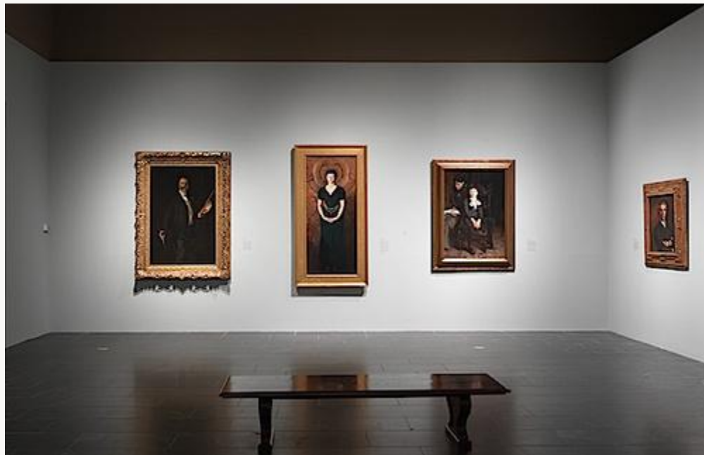
Fig. 13, View of the fourth gallery, "United States," showing [left to right] John Singer Sargent, William Merritt Chase , 1902; Isabella Stewart Gardner , 1888; and Portrait of a Boy , 1890. [return to text]