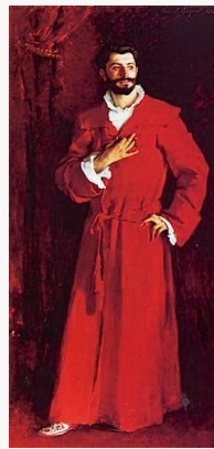
Fig. 6, John Singer Sargent, Dr. Pozzi at Home , 1881. Oil on canvas. Hammer Museum, Los Angeles.

[larger image]