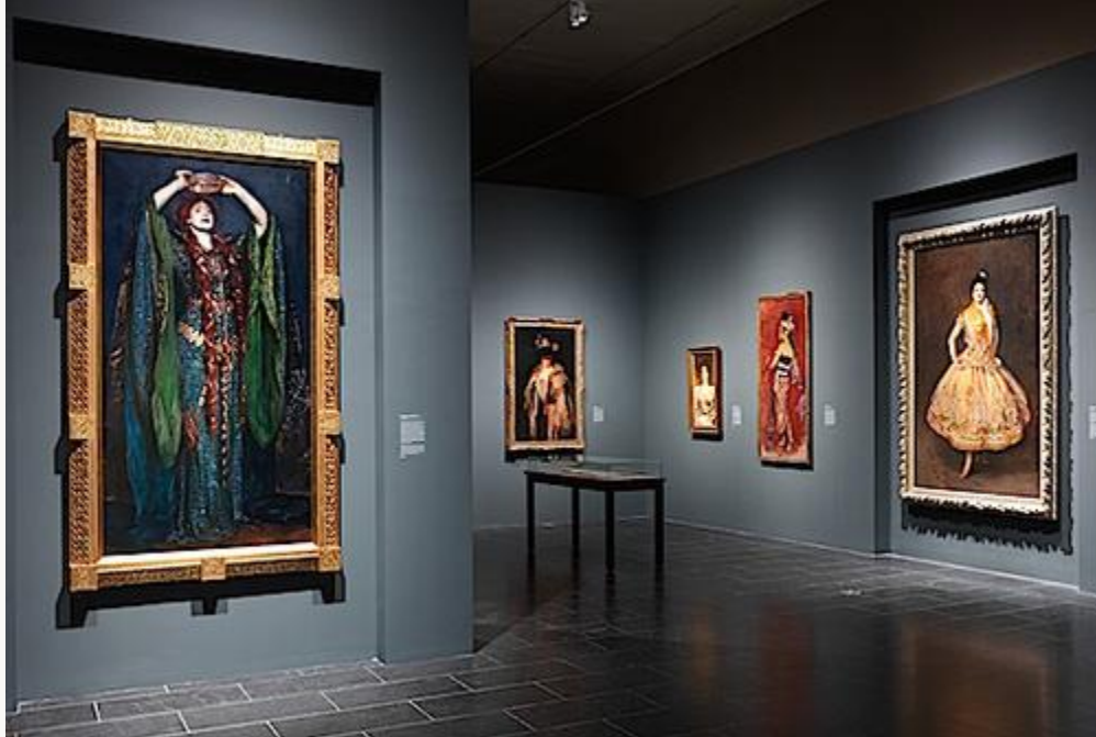
Fig. 11, View of the third gallery, "London," including John Singer Sargent, Ellen Terry as Lady MacBeth , 1889, on the left. [return to text]