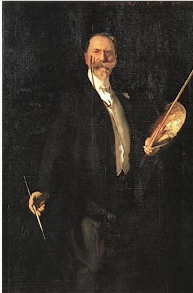
Fig. 15, John Singer Sargent, William Merritt Chase , 1902. Oil on canvas. The Metropolitan Museum of Art, New York. [return to text]