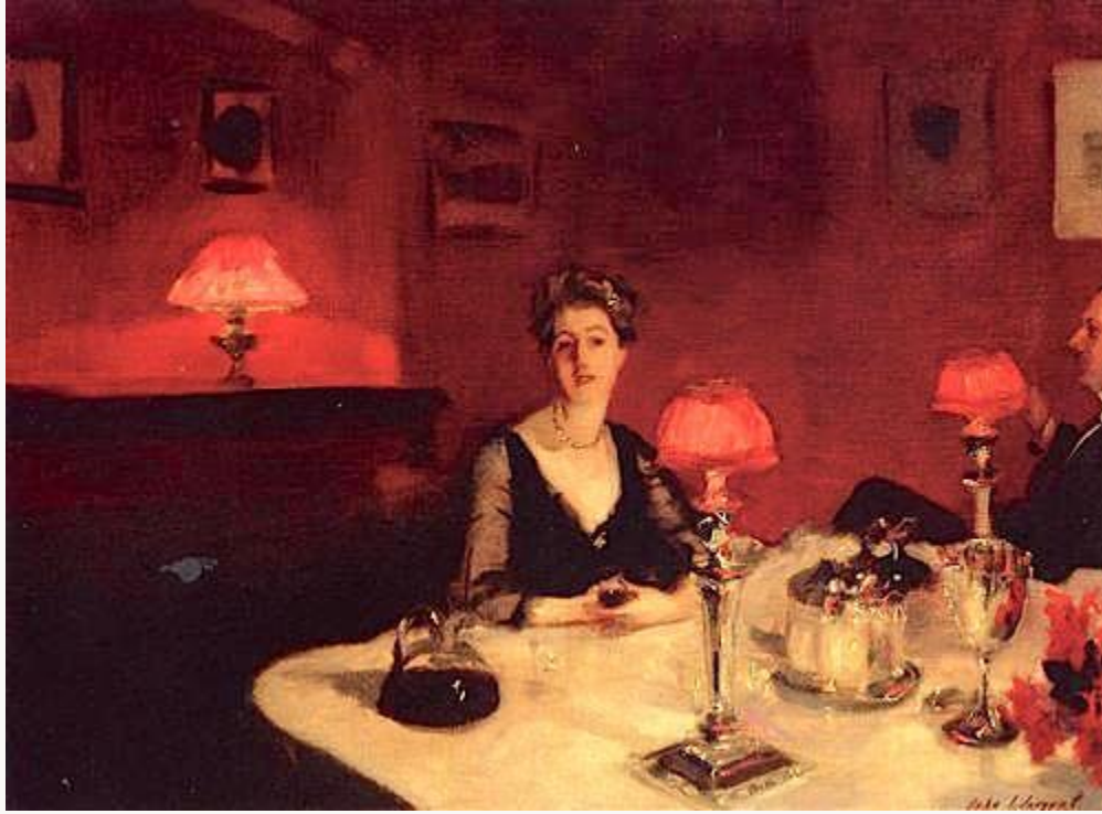
Fig. 10, John Singer Sargent, Le Verre de Porto ( A Dinner Table at Night ), 1884. Oil on canvas. Fine Arts Museums of San Francisco, California. [return to text]