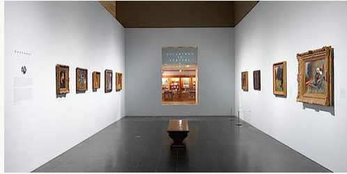
Fig. 7, View of the second gallery, “Broadway,” which included works produced in the English countryside. [larger image]

As with the previous gallery, “Broadway” operated around a clearly delineated and recessed anchor, in this case, Garden Study of the Vickers Children (1884) (fig. 8). Notably absent from this gallery was Carnation Lily, Lily Rose (1885–86), one of Sargent’s best-known works and an example of his experimentation with English Aestheticism en plein air . More interesting, however, were the preparatory studies that revealed his process and gestural facture. In addition to Garden Study of the Vickers Children , the Metropolitan Museum included a double-sided preparatory pencil drawing of Dorothy and Polly Barnard, acquired mere months before the exhibition’s opening and here placed in dialogue with the larger oil studies of the same scene (fig. 9). This thoughtful juxtaposition served as an effective didactic tool, allowing visitors to engage with, and learn about, Sargent’s method without the inclusion of extra wall texts or invasive touch screens.