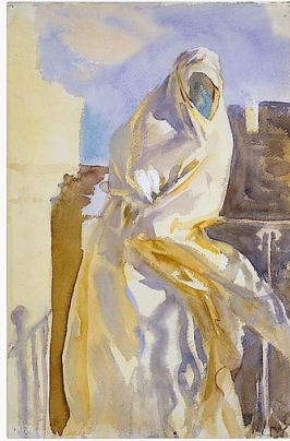
Fig. 18, John Singer Sargent, Arab Woman , 1905–06. Watercolor with gouache on off-white wove paper. The Metropolitan Museum of Art, New York. [larger image]