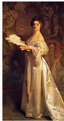
Fig. 14, John Singer Sargent, Ada Rehan , 1894–95. Oil on canvas. The Metropolitan Museum of Art, New York. [larger image]

The portrait of Shakespearean actress Ada Rehan (1894–94) appeared after a year of cleaning and conservation work that successfully removed a discolored varnish over the portrait’s surface (fig. 14). Rehan, portrayed in an ornate costume and lavish setting, typifies how Sargent took just as much care rendering the details of the total work—the tapestry behind the sitter and reflective fabric of her gown—as he did with her distinctive facial features. Once again, Sargent’s emphasis shifts from the depiction of a likeness, a move that reflects the artist’s continuing disengagement with the fundamental terms and conventions of portraiture.