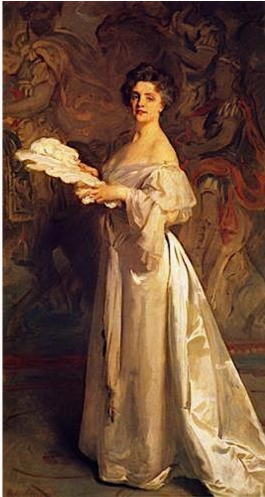
Fig. 14, John Singer Sargent, Ada Rehan , 1894–95. Oil on canvas. The Metropolitan Museum of Art, New York. [return to text]