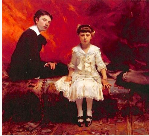
Fig. 4, John Singer Sargent, Portrait of Edouard and Marie-Loise Pailleron , 1881. Oil on canvas. Des Moines Art Center. [larger image]

A particular strength of this initial room was the inclusion of multiple renderings of the same figure to demonstrate Sargent's stylistic range and experimental tendencies. French poet and novelist, Judith Gautier, for example, was presented twice; once in 1885 as a stylish sitter costumed à la japonaise , and again in an impressionistic sketch entitled A Gust of Wind (1886–87). Paul Helleu also appears twice—in an 1880 pastel on brown wove paper and later in a double portrait with François Flameng.