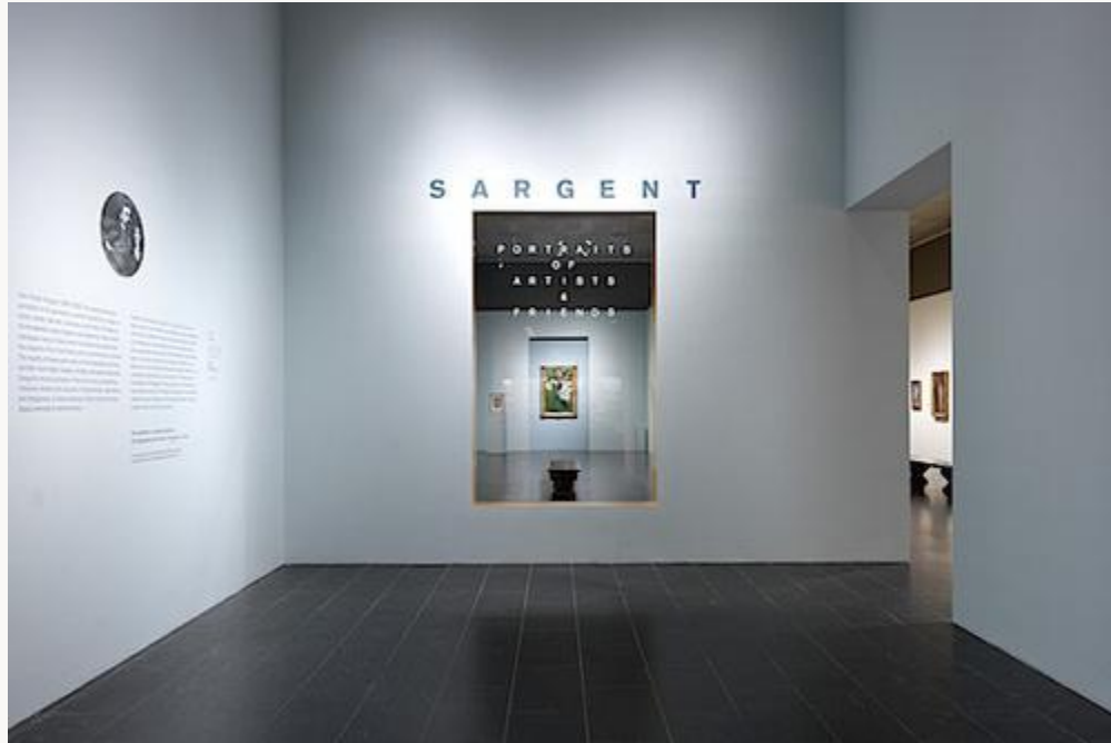
Fig. 2, View of the entrance to Sargent: Portraits of Artists and Friends . [return to text]