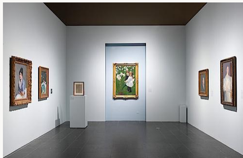
Fig. 8, View of the second gallery, “Broadway,” including John Singer Sargent, Garden Study of the Vickers Children , 1884, at center. [larger image]