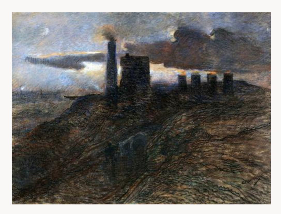
Fig. 12, Constantin Meunier, The Furnaces , n.d. Pastel on paper. Royal Museums of Fine Arts of Belgium, Brussels. [return to text]