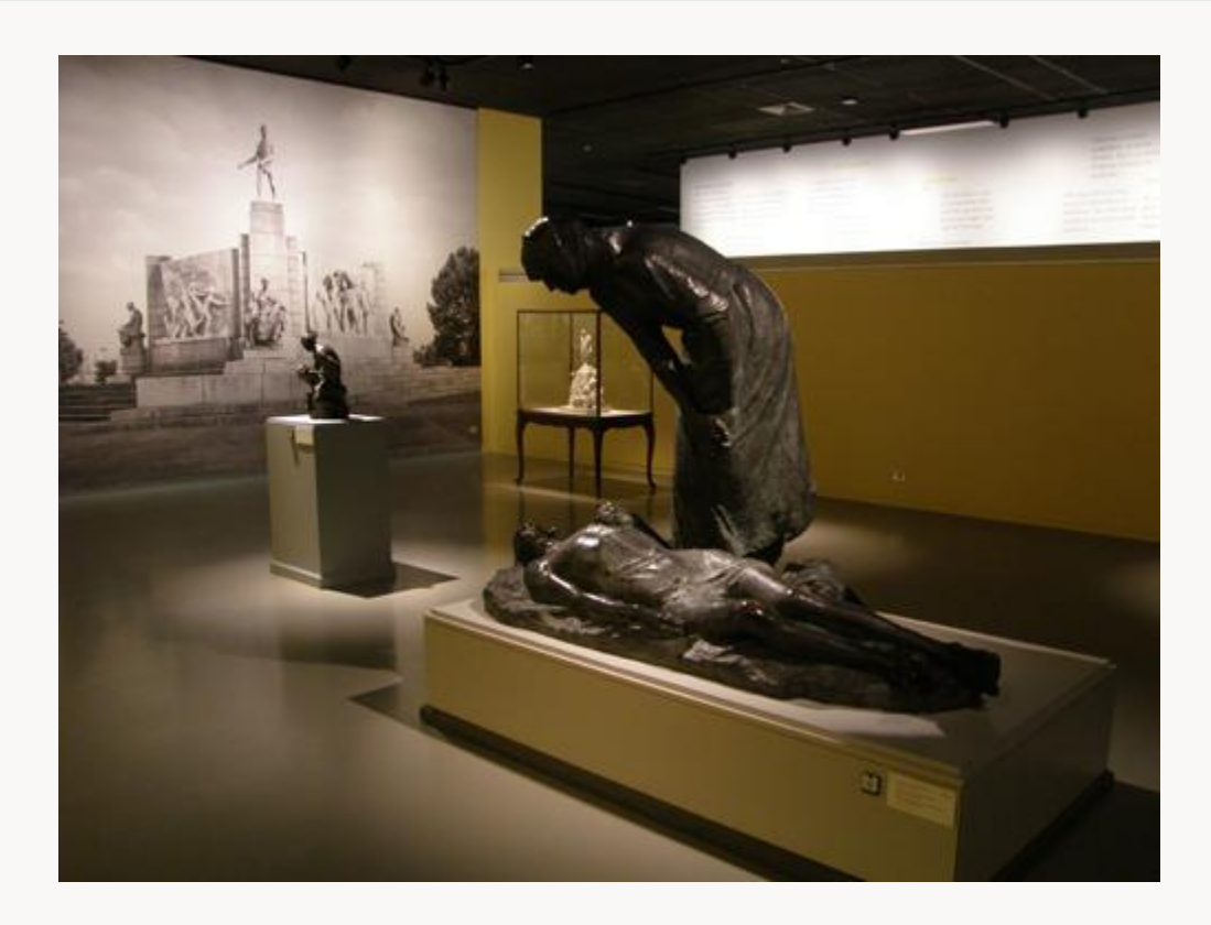
Fig. 15, Installation view of the section "Tragic Beauty." Front: Constantin Meunier, Firedamp , 1889. Bronze. Royal Museums of Fine Arts of Belgium, Brussels. Back wall: Constantin Meunier and Mario Knauer, Monument to Labor , 1930. Jachtenkaai, Laken, Brussels. [return to text]