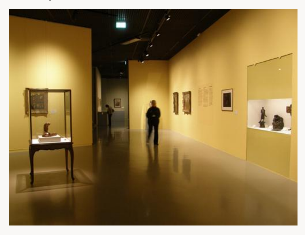
Fig. 11, Installation view of the section "The Great Disaster." [return to text]