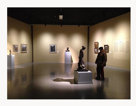
Fig. 14, Installation view of the section "The Black Country." Front: Constantin Meunier, The Smith , 1886. Bronze. Royal Museums of Fine Arts of Belgium, Brussels. [larger image]

The triptych was on view in the final section of the exhibition. Named "Tragic Beauty," this gallery included the mature work of the artist, the "archetypical representations of sorrow and suffering, internalized, dismal and dejected" (fig. 15) (33, author's translation). The most striking sculpture on view there—and for good reason, one of the best known of Meunier's works—was Firedamp (1888–90, fig. 16). While staying with a friend in 1887, Meunier witnessed the tragic outcome of the mining disaster of La Boule, near Quaregnon, in which a total of 113 laborers lost their lives. Meunier was present when the scorched bodies were brought up to the surface for identification, and in a quick drawing captured the moment when a mother recognized her son among the fallen. Later, while living and teaching in the city of Leuven, that sketch served as the basis for the monumental sculpture seen here. The incident is portrayed with such sincerity and humanity that it is easily elevated to a symbol of universal anguish, with a timeless quality underscored by referencing the Pietà . [18] The Prodigal Son (ca. 1892), showing a seated man clasping the face of his son kneeling before him, was another stand-out, made all the more poignant by the knowledge that not long after, in 1894, Meunier was to lose both of his sons, Georges (aged 24) and Karl (aged 30, himself a promising artist).