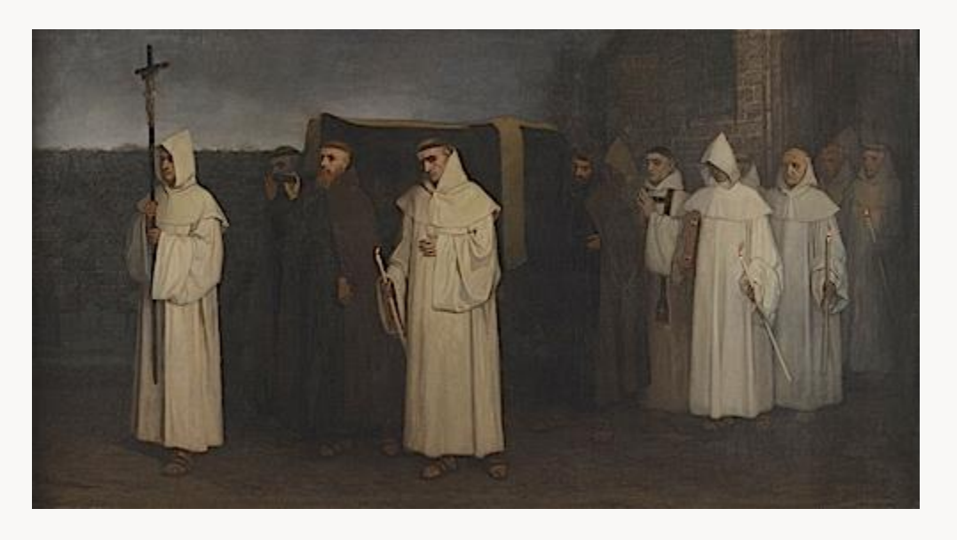
Fig. 1, Constantin Meunier, The Funeral of a Trappist , 1873. Oil on canvas. Broelmuseum, Kortrijk. [return to text]

All installation views were taken by the author with permission of the Royal Museums of Fine Arts of Belgium, Brussels.