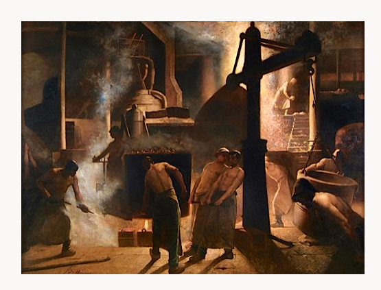
Fig. 4, Constantin Meunier, Foundry of Seraing , ca. 1880. Oil on canvas. Museum of Fine Arts, Liège. [larger image]