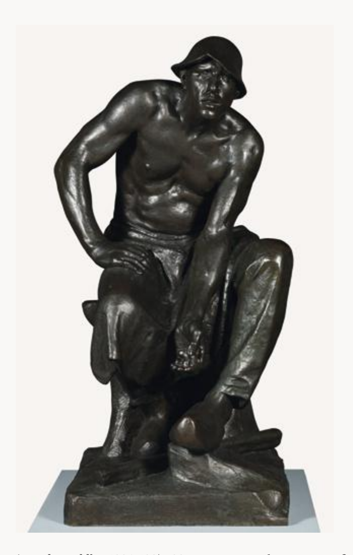
Fig. 8, Constantin Meunier, The Puddler , 1884/1887–88. Bronze. Royal Museums of Fine Arts of Belgium, Brussels. [return to text]