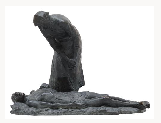
Fig. 16, Constantin Meunier, Firedamp , 1889. Bronze. Royal Museums of Fine Arts of Belgium, Brussels. [larger image]

Oddly, little attention was paid to the project that occupied much of Meunier's thoughts since 1890 at the latest, his Monument to Labor , which wouldn't be erected until a quarter of a century after his death, in 1930.[19] A large, grayscale photograph was plastered on one of the section's walls, but a diagram would have been welcome, or, at the very least, additional photographs of the different sides of the monument (which includes a total of four reliefs and five free-standing figures) (fig. 15). In fact, Meunier's public monuments could have easily merited a section of their own: in addition to the Monument to Labor , there is the statue Father Damien (1894, installed in the church garden of the Brusselsestraat in Leuven), the Mower and Sower made for the Brussels Botanical Garden (1897), the Horse at the Watering Place (1899–1901, installed on the Square Ambiorix in Brussels) and the Monument to Emile Zola (of which a plaster model was displayed from 1905, the year of Meunier's death).[20] I was, however, pleasantly surprised to find the Great Miner (1900) included in the section, since until recently it was kept in the reserves of the Meunier Museum in Ixelles. The small scale bronze—its name indeed appears to be almost ironic given its modest dimensions—is remarkable because not