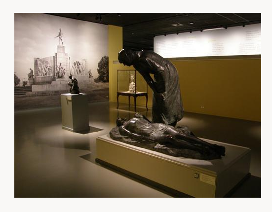
Fig. 15, Installation view of the section "Tragic Beauty." Front: Constantin Meunier, Firedamp , 1889. Bronze. Royal Museums of Fine Arts of Belgium, Brussels. Back wall: Constantin Meunier and Mario Knauer, Monument to Labor , 1930. Jachtenkaai, Laken, Brussels. [larger image]