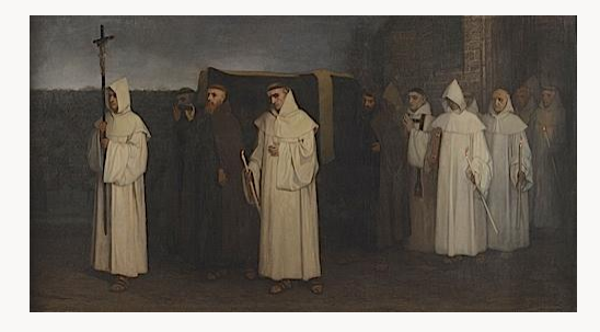
Fig. 1, Constantin Meunier, The Funeral of a Trappist , 1873. Oil on canvas. Broelmuseum, Kortrijk. [larger image]