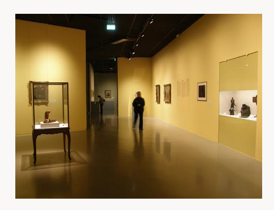
Fig. 11, Installation view of the section "The Great Disaster." [larger image]