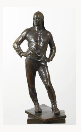
Fig. 9, Constantin Meunier, The Docker , 1885/1893. Bronze. Royal Museums of Fine Arts of Belgium, Brussels. [larger image]

Sculpture had changed since Meunier had last practiced it. In the course of the 1870s, Belgian sculpture had awoken from its "marble slumber", to use Octave Maus' (1856–1919) eloquent metaphor; and Auguste Rodin (1840–1917) had been rocking the art scene to its core, not just in Paris, but also in Brussels where, in 1877, Rodin had presented the infamous sculpture known today as The Bronze Age (28–30).[16] (Rodin and Meunier were to become good friends, with both supporting the career of the other in their respective home countries; this aspect of their friendship remained unexplored in the exhibition, save for a quotation of Rodin's on a panel near the entrance and exit, calling Meunier "one of the most important artists of our century". [17]) Meunier's innovative series of sculptures immediately received a warm welcome in the contemporary art world; and with that, the tone was set for the second stage of his career (30). The section " L'Art Moderne " constituted an attempt at reconstructing the artistic circles in which Meunier dwelled, centering on the famous art journal founded by Edmond Picard (1836–1924) (fig. 10). On view were portraits, statuettes and busts of such distinguished individuals as Lemonnier, Picard, Emile Verhaeren (1855–1916) and Henry van de Velde (1863–1957); some book illustration projects; the foundation charter and original membership list of