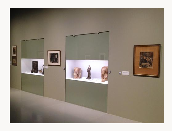
Fig. 10, Installation view of the section "L'Art Moderne." [larger image]

the Société Libre des Beaux-Arts; and a host of letters from and to other members of the artistic beau monde . Still, the overall impression was somewhat haphazard, and it was not always immediately clear why the item in question was chosen, and in what way it contributed to a better insight into the artist, especially for the average visitor who lacks the necessary prior knowledge. None of the letters, for instance, had been transcribed or summarized, and among the odder choices for inclusion were a postcard from Meunier to an "unknown recipient" and a letter to "Anon".