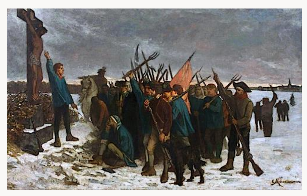
Fig. 3, Constantin Meunier, Episode of the Uprising in the Vendée , 1872. Oil on canvas. The Royal Collection, Brussels. [return to text]