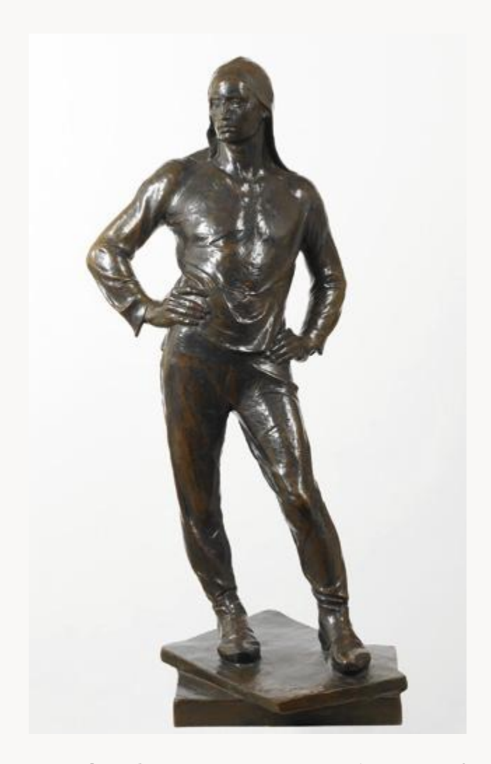
Fig. 9, Constantin Meunier, The Docker , 1885/1893. Bronze. Royal Museums of Fine Arts of Belgium, Brussels. [return to text]