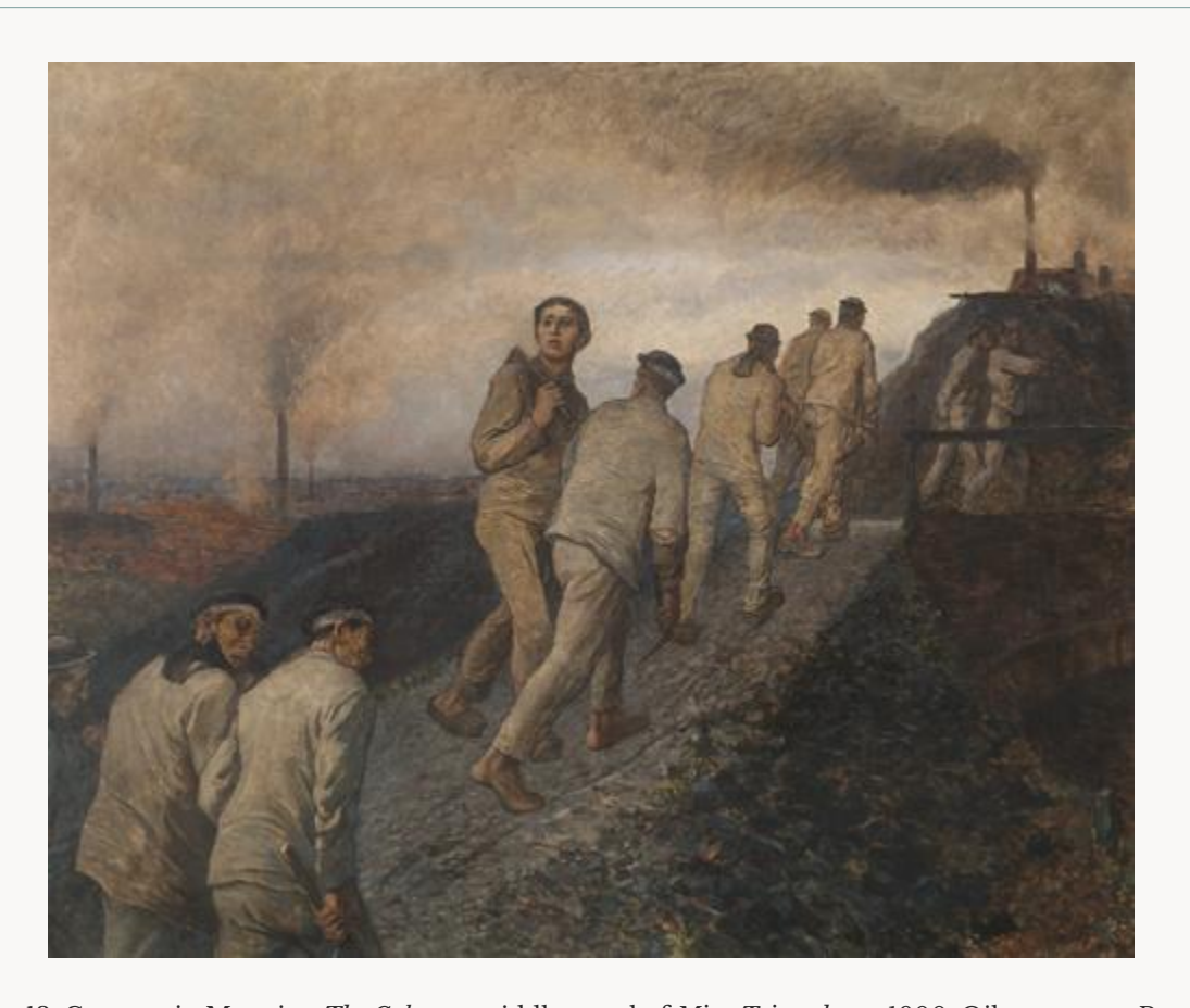
Fig. 13, Constantin Meunier, The Calvary , middle panel of Mine Triptych , ca. 1900. Oil on canvas. Royal Museums of Fine Arts of Belgium, Brussels. [return to text]