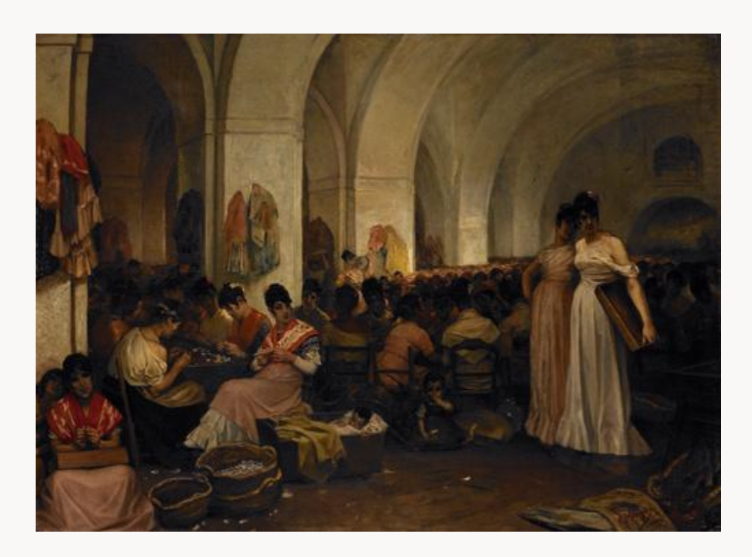
Fig. 7, Constantin Meunier, The Tobacco Factory , 1882–83. Oil on canvas. Royal Museums of Fine Arts of Belgium, Brussels. [return to text]