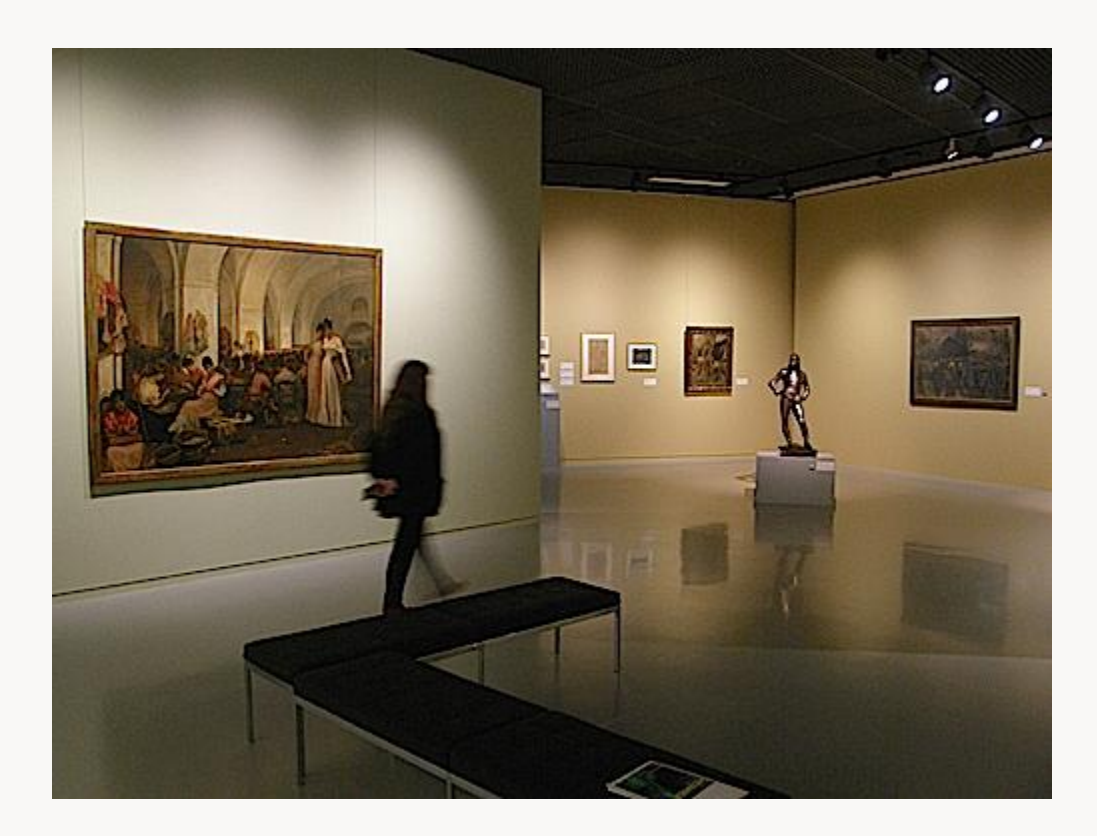
Fig. 6, Installation view of the sections "Seville" and "On the Waterfront." Front left: Constantin Meunier, The Tobacco Factory , 1882–83. Oil on canvas. Royal Museums of Fine Arts of Belgium, Brussels. Back middle: Constantin Meunier, The Docker , 1885/1893. Bronze. Royal Museums of Fine Arts of Belgium, Brussels. [return to text]