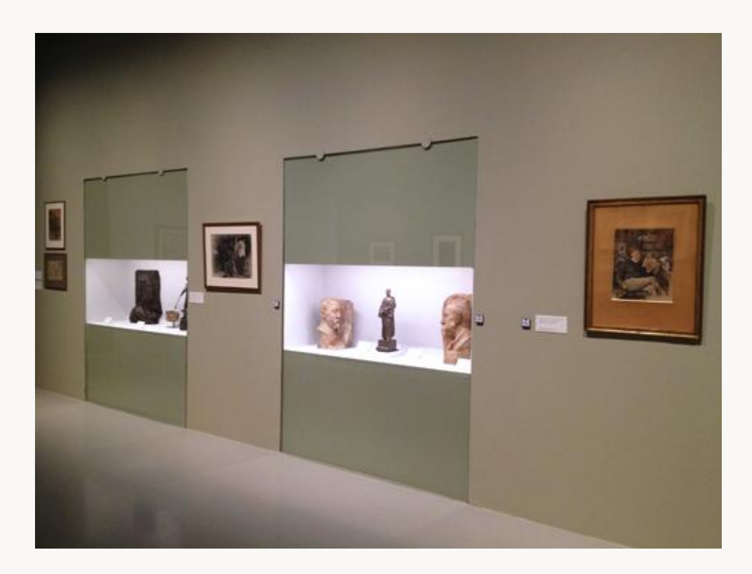
Fig. 10, Installation view of the section "L'Art Moderne." [return to text]