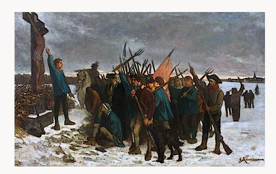
Fig. 3, Constantin Meunier, Episode of the Uprising in the Vendée , 1872. Oil on canvas. The Royal Collection, Brussels. [larger image]

Luxembourg and Germany. Meunier's Episode of the Uprising in the Vendée (1872) is an easy stand-out, noteworthy for the bold, simplified outlines and loose application of paint (fig. 3). The work depicts a group of peasants armed with rifles, scythes, and pitchforks, rallying for the cause in a barren, snowy landscape before an outdoor crucifix. Meunier was less in his element when, a couple of years earlier, he painted his Allegory of the Death of Lincoln (1865), which was on view in the same section. The painting turned up only shortly before 1990 in a private collection in the United States, before being acquired by Michigan's Grand Valley State University in 2002.[8] Though unremarkable from a technical point of view, it too stands as a testament to Meunier's societal commitment with its central image of a family of newly freed black slaves paying homage to the fallen president, while on the right are represented the working people, who have also come to pay their final respects.