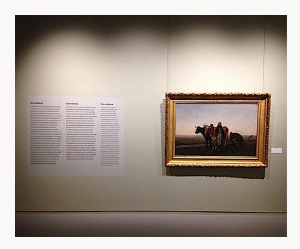
Fig. 2, Installation view of the section "Ora et labora." Constantin Meunier and Alfred Verwee, Monks Plowing, 1863. Oil on canvas. Abdijmuseum Ten Duinen, Koksijde (Collection of the Flemish Community). [return to text]