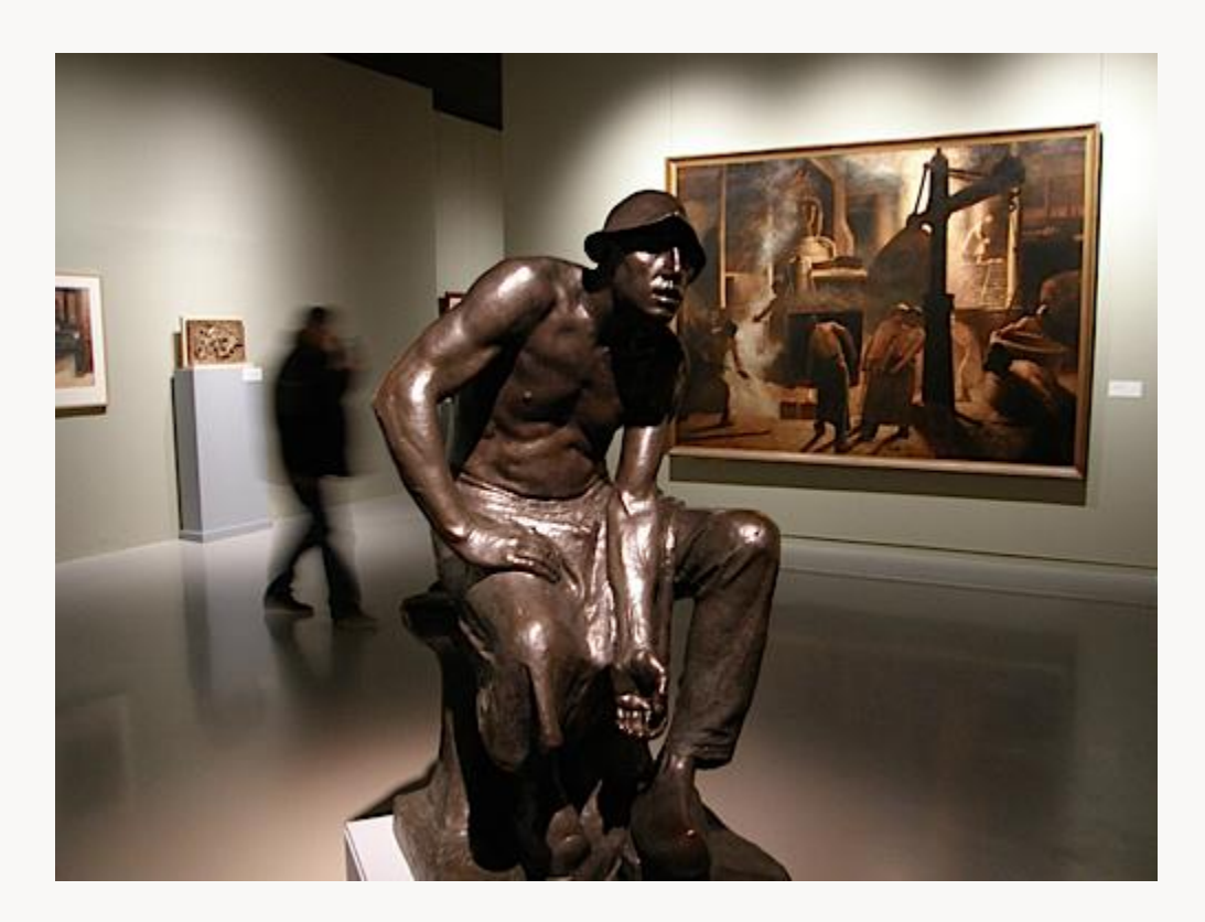
Fig. 5, Installation view of the section "Glass and Steel Industry." Front: Constantin Meunier, The Puddler , 1884/1887–88. Bronze. Royal Museums of Fine Arts of Belgium, Brussels. Back right: Constantin Meunier, Foundry of Seraing , ca. 1880. Oil on canvas. Museum of Fine Arts, Liège. [return to text]