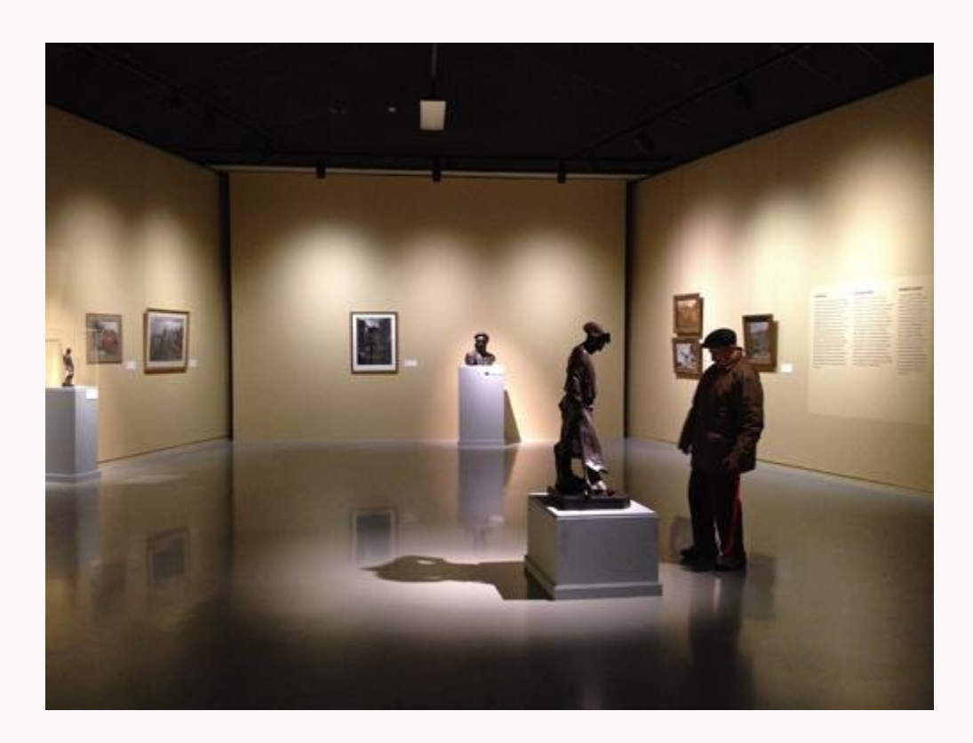
Fig. 14, Installation view of the section "The Black Country." Front: Constantin Meunier, The Smith , 1886. Bronze. Royal Museums of Fine Arts of Belgium, Brussels. [return to text]