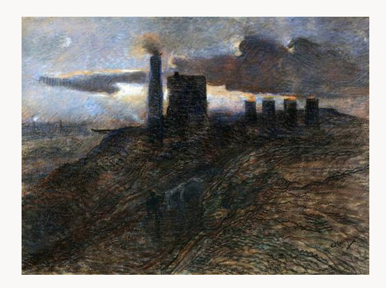
Fig. 12, Constantin Meunier, The Furnaces , n.d. Pastel on paper. Royal Museums of Fine Arts of Belgium, Brussels. [larger image]