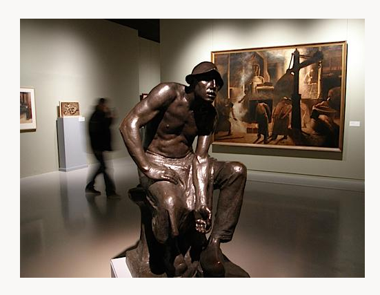
Fig. 5, Installation view of the section "Glass and Steel Industry." Front: Constantin Meunier, The Puddler , 1884/1887–88. Bronze. Royal Museums of Fine Arts of Belgium, Brussels. Back right: Constantin Meunier, Foundry of Seraing , ca. 1880. Oil on canvas. Museum of Fine Arts, Liège. [larger image]

The shift in Meunier's career was consolidated when, in 1881, he travelled through the so-called Black Country—an industrial region in Wallonia so named for the omnipresence of coal mines—in the company of the artist Xavier Mellery (1845–1921) and the writer Camille Lemonnier (1844–1913), in the context of the latter's book project, La Belgique . For those aware of its significance, an original copy of the book could be found lying inconspicuously spread open in one of the display cases in the section " L'Art Moderne "; though surely it could have been awarded a place of greater centrality, ideally accompanied by a monitor, so as to let visitors digitally leaf through the book and examine the thirteen illustrations provided by Meunier.[10]