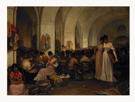
Fig. 7, Constantin Meunier, The Tobacco Factory , 1882–83. Oil on canvas. Royal Museums of Fine Arts of Belgium, Brussels. [larger image]