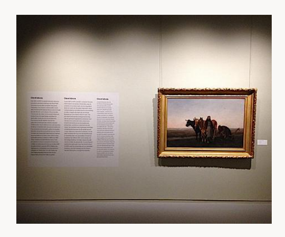
Fig. 2, Installation view of the section "Ora et labora." Constantin Meunier and Alfred Verwee, Monks Plowing, 1863. Oil on canvas. Abdijmuseum Ten Duinen, Koksijde (Collection of the Flemish Community). [larger image]

In 1868, Meunier and Verwee were founding members of the Société Libre des Beaux-Arts, an avant-garde exhibition society devoted to disseminating realism in Belgium. In fact, Verwee and Meunier are shown seated next to each other on the society's group portrait made by Edmond Lambrichs (1830–1887), which sadly was absent from the exhibition, though it is on view in the permanent wing of the museum. Even if visitors were supposed to find their own way there, however, the painting's plaque does not identify the sitters, nor does the caption that goes with the image in the exhibition catalogue—an unfortunate oversight.