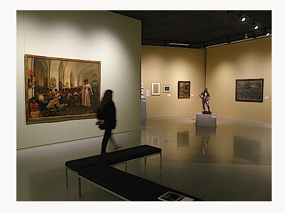
Fig. 6, Installation view of the sections "Seville" and "On the Waterfront." Front left: Constantin Meunier, The Tobacco Factory , 1882–83. Oil on canvas. Royal Museums of Fine Arts of Belgium, Brussels. Back middle: Constantin Meunier, The Docker , 1885/1893. Bronze. Royal Museums of Fine Arts of Belgium, Brussels. [larger image]

out for Spain, his stay proved to be a pivotal stage in his career; hence the reason why it was already the subject of a small scale exhibition in the Royal Museums in 2008–2009, during which time it was reviewed for this very journal by Marjan Sterckx.[11] The impression from the works gathered is that the visit offered Meunier a breath of fresh air, and reinforced the evolution begun in Belgium. The paintings made in Seville feel very much alive; the brushstrokes are more direct than ever before, the colors are more vibrant, and, perhaps most significantly, the ability to capture life around him has deepened (28).[12] A case in point is the chef-d'oeuvre The Tobacco Factory (1882–83), which shows a sea of female workers engrossed in their task, seated underneath the impressive vaulted ceilings of the Real Fabrica de Tabacos (fig. 7). Two other women are placed convivially together in the front right, and add a picturesque flavor to the scene, all the more so since the strap of one woman's dress has slid seductively off her shoulder. More revelatory still was the selection of sketches and scribbles Meunier made in Seville, hung on the wall opposite. Though at first sight they may not appear noteworthy, they reveal an artist capable of rapidly capturing his impressions on paper, as well as an artist unafraid of trying his hand at different materials from charcoal and pencil to ink and gouache, and any combination thereof.