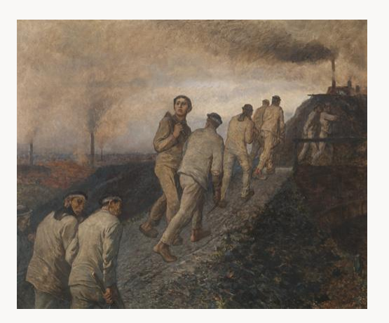
Fig. 13, Constantin Meunier, The Calvary , middle panel of Mine Triptych , ca. 1900. Oil on canvas. Royal Museums of Fine Arts of Belgium, Brussels. [larger image]