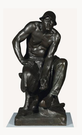
Fig. 8, Constantin Meunier, The Puddler , 1884/1887–88. Bronze. Royal Museums of Fine Arts of Belgium, Brussels. [larger image]