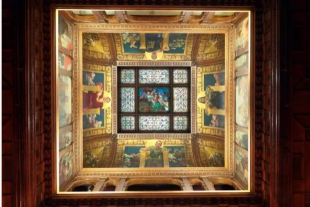
Fig. 2, Jean-Joseph Benjamin-Constant, The Justinian Cycle and The Venetian Cycle , 1889–90. Oil on canvas; John LaFarge, Guercino Aurora , 1882, stained glass skylight. Ames-Webster House, 306 Dartmouth Street, Boston, Massachusetts. [return to text]