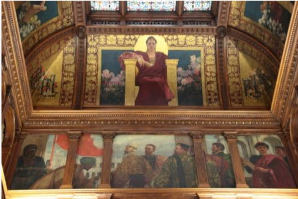
Fig. 8, Jean-Joseph Benjamin-Constant, Patrician Woman [above] and Venetian Cycle with Doge [west wall], 1889–90. Oil on canvas. Ames-Webster House, 306 Dartmouth Street, Boston, Massachusetts.