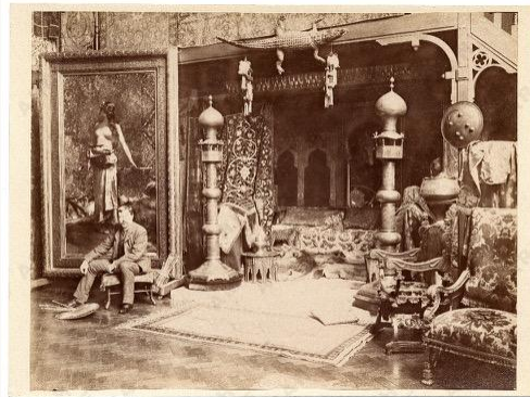
Fig. 6, Unknown photographer, Benjamin-Constant in his Paris Studio , ca. 1890. Photograph. Archives of American Art, Smithsonian Institution, Washington, DC, digital ID: 3823. “Current copyright status is undetermined,” according to the Archives of American Art website, www.aaa.si.edu . [larger image]

in Paris, after which he travelled to Spain and Morocco for about two years. Upon his return to Paris in 1873, Benjamin-Constant began to show a series of Orientalist subjects at the Salon and for nearly two decades he produced works depicting Janissaries, eunuchs, viziers, and half-naked women, sometimes indulging in what one modern scholar has termed “lurid scenes of violence” and a “predilection for melodrama.” [24]