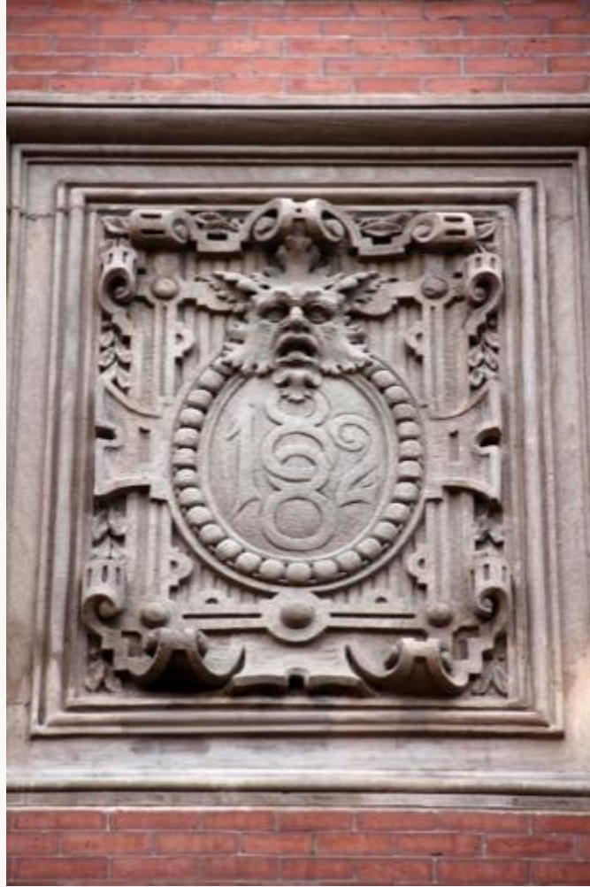
Fig. 5, Artist unknown, Roundel on façade of Ames-Webster House, 306 Dartmouth Street, Boston, Massachusetts, 1882. Author's photograph. [return to text]