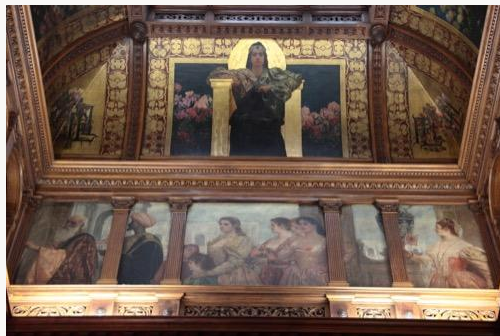
Fig. 9, Jean-Joseph Benjamin-Constant Empress Theodora [above] and Venetian Cycle with Dogaressa [east wall], 1889–90. Oil on canvas. Ames-Webster House, 306 Dartmouth Street, Boston, Massachusetts. [larger image]

The four curved panels in the top register show Byzantine rulers with golden haloes seated on golden thrones, set against blue backgrounds filled with flowers. [32] The gold is applied in little squares of gold leaf calling to mind the tesserae used in Byzantine mosaics. The murals on the south and north walls, each measuring 60 x 114 inches, represent the Byzantine Emperor Justinian and what Benjamin-Constant called the “First Counsellor.” [33] The murals on the east and west walls, each measuring 60 x 105 inches, represent Justinian’s wife (the empress Theodora), and a “Patrician Woman.” The painting of Justinian is signed and dated in red paint at the bottom left corner, “Benj-Constant, 1890.” The style, size, and perspective of these four figures are different from those in the Venetian panels. The Byzantine figures are significantly larger, and they look directly at the viewer rather than at other figures in the mural.