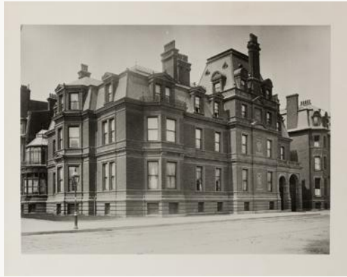
Fig. 4, Exterior of Ames-Webster House, 306 Dartmouth Street, Boston, Massachusetts, ca. 1885. Photograph. [larger image]