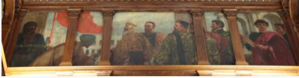
Fig. 14, Jean-Joseph Benjamin-Constant, Detail of Venetian Cycle with Doge, 1889–90. Oil on canvas. Ames-Webster House, 306 Dartmouth Street, Boston, Massachusetts. [return to text]