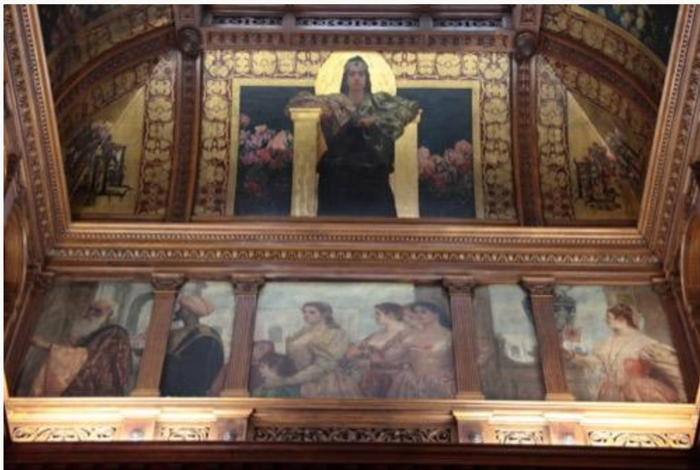
Fig. 9, Jean-Joseph Benjamin-Constant Empress Theodora [above] and Venetian Cycle with Dogressa [east wall], 1889–90. Oil on canvas. Ames-Webster House, 306 Dartmouth Street, Boston, Massachusetts.