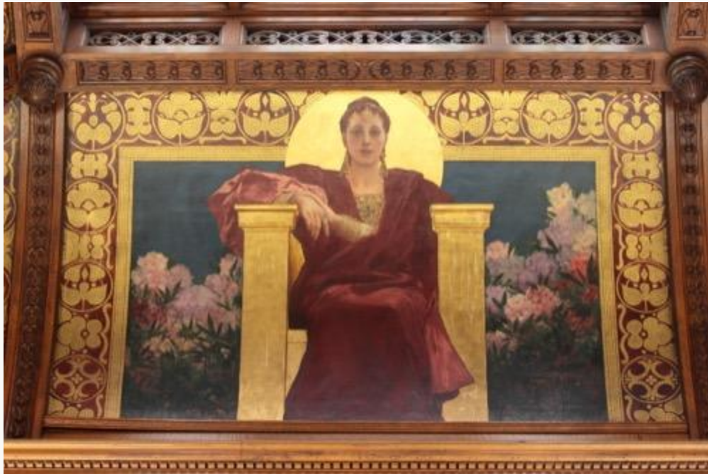
Fig. 13, Jean-Joseph Benjamin-Constant, Patrician Woman , 1889–90. Oil on canvas. Ames-Webster House, 306 Dartmouth Street, Boston, Massachusetts. [return to text]