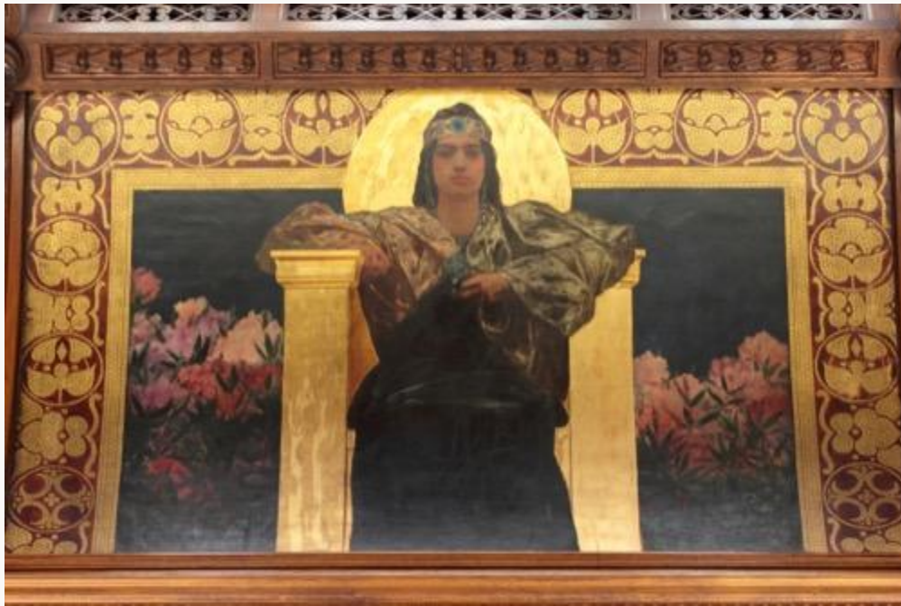
Fig. 11, Jean-Joseph Benjamin-Constant, Empress Theodora , 1889–90. Oil on canvas. Ames-Webster House, 306 Dartmouth Street, Boston, Massachusetts. [return to text]