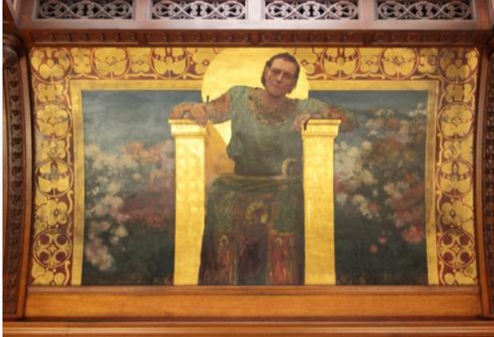
Fig. 12, Jean-Joseph Benjamin-Constant, First Counsellor , 1889–80. Oil on canvas. Ames-Webster House, 306 Dartmouth Street, Boston, Massachusetts. [return to text]