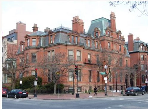
Fig. 1, Exterior of Ames-Webster House, 306 Dartmouth Street, Boston, Massachusetts, in 2013. [larger image]

Among the dozens of elegant brownstones in Boston's Back Bay, the Ames-Webster house at 306 Dartmouth Street stands out both for its stately exterior and rich interior, notable for a cycle of nineteenth-century mural paintings that depict historical figures from Renaissance Venice and Late Antique Byzantium (fig. 1). Completed in 1889–90 by the French artist Jean-Joseph Benjamin-Constant (1845–1902) for owner Frederick L. Ames (1835–93), two horizontal murals high on the wall of the central hall show a procession of Venetian noblemen and noblewomen, attired in Renaissance dress and arrayed in front of Renaissance buildings. Immediately above this Venetian cycle are four large “portraits” of historical figures from sixth-century Constantinople who gaze down toward the viewer. Surmounted by a stained-glass skylight by American John LaFarge (1835–1910), the murals—like the house itself—remain in situ and largely unchanged (fig. 2). The murals suffer from decades of grime and dust, and some minor stains or scuffs are evident; nevertheless, the images remain bright and easily visible from the stairway and the loggias. [1]