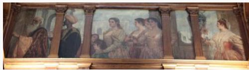
Fig. 15. Jean-Joseph Benjamin-Constant, Detail of Venetian Cycle with Dogaresse , 1889–90. Oil on canvas. Ames-Webster House, 306 Dartmouth Street, Boston, Massachusetts. [larger image]

Benjamin-Constant describes the second panel much more briefly: “On the panel, opposite, the procession continues and the ‘dogaresse’, followed by three young Patrician women and a mistress of ceremony, advances, leaning on the shoulder of a little girl, hers without doubt? An old Master of the Palace, followed by a colored Prince, walks ahead.” [58] The dogaresse was the wife of the doge. It was an important position in late medieval and early modern Venice, as it represented one of the few opportunities for women to exercise some authority within the state. [59] In this case, however, the dogaresse lacks any of the identifying markers of her office, such as the ducal cornio . Although the phrase “Master of the Palace” (often translated as “majordomo”) was in regular usage in Europe, the phrase “mistress of ceremony” appears to be