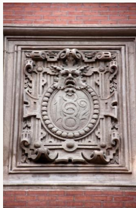
Fig. 5, Artist unknown, Roundel on façade of Ames-Webster House, 306 Dartmouth Street, Boston, Massachusetts, 1882. [larger image]

The expanded ground floor of the house included a grand hall measuring sixty-three feet long and eighteen feet wide. A monumental staircase rose three stories to the domed stained-glass skylight by LaFarge; wrapped around the four sides of the stairwell was the mural cycle of Benjamin-Constant. Guests at 306 Dartmouth Street drove into the porte cochère, ascended to the second floor in an elevator, and made a formal entrance down a staircase and into the magnificent hall. The murals above, with their processions and portraits of powerful people of a bygone age, made a fitting backdrop for the Ames family who inhabited this house, and for their guests.