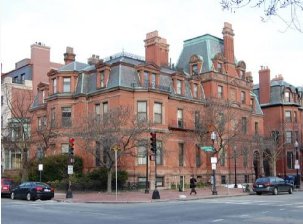
Fig. 1, Exterior of Ames-Webster House, 306 Dartmouth Street, Boston, Massachusetts, in 2013. Courtesy of Back Bay Houses, http://backbayhouses.org/306-dartmouth/ . [ return to text ]

All photographs of the murals at Ames-Webster House, 306 Dartmouth Street, Boston, Massachusetts, are by the author.