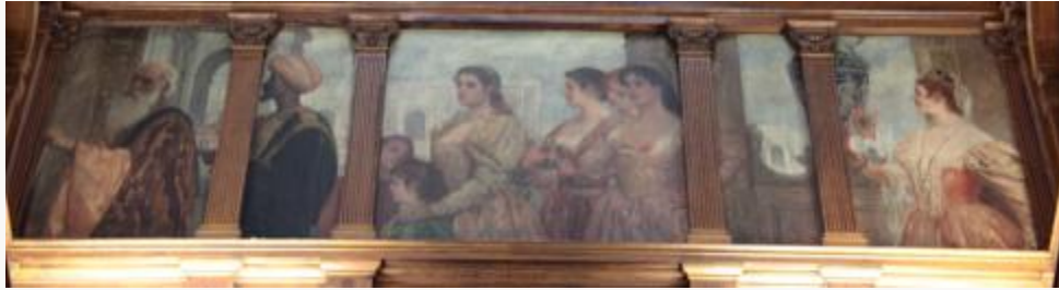
Fig. 15, Jean-Joseph Benjamin-Constant, Detail of Venetian Cycle with Dogaressa, 1889–90. Oil on canvas. Ames-Webster House, 306 Dartmouth Street, Boston, Massachusetts. [return to text]