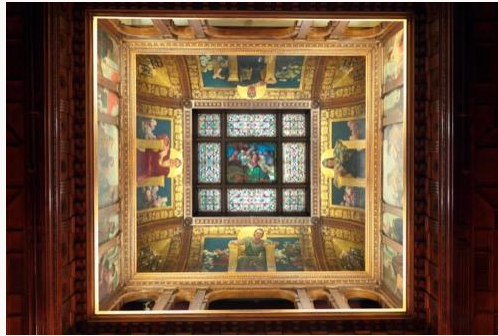
Fig. 2, Jean-Joseph Benjamin-Constant, The Justinian Cycle and The Venetian Cycle , 1889–90. Oil on canvas; John LaFarge, Guercino Aurora , 1882, stained glass skylight. Ames-Webster House, 306 Dartmouth Street, Boston, Massachusetts. [larger image]