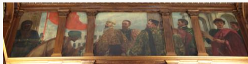
Fig. 14, Jean-Joseph Benjamin-Constant, Detail of Venetian Cycle with Doge, 1889–90. Oil on canvas. Ames-Webster House, 306 Dartmouth Street, Boston, Massachusetts. [larger image]