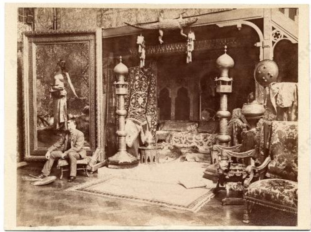
Fig. 6, Unknown photographer, Benjamin-Constant in his Paris Studio , ca. 1890. Photograph. Archives of American Art, Smithsonian Institution, Washington, DC, digital ID: 3823. "Current copyright status is undetermined," according to the Archives of American Art website, www.aaa.si.edu . [return to text]