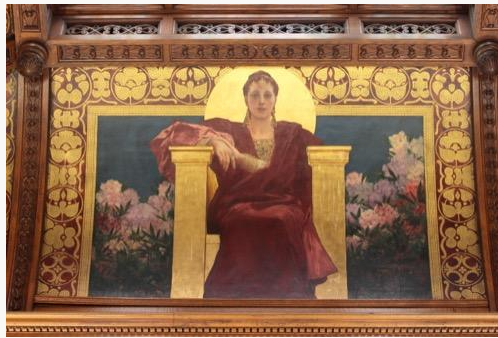
Fig. 13, Jean-Joseph Benjamin-Constant, Patrician Woman , 1889–90. Oil on canvas. Ames-Webster House, 306 Dartmouth Street, Boston, Massachusetts. [larger image]