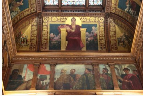
Fig. 8, Jean-Joseph Benjamin-Constant, Patrician Woman [above] and Venetian Cycle with Doge [west wall], 1889–90. Oil on canvas. Ames-Webster House, 306 Dartmouth Street, Boston, Massachusetts. [larger image]