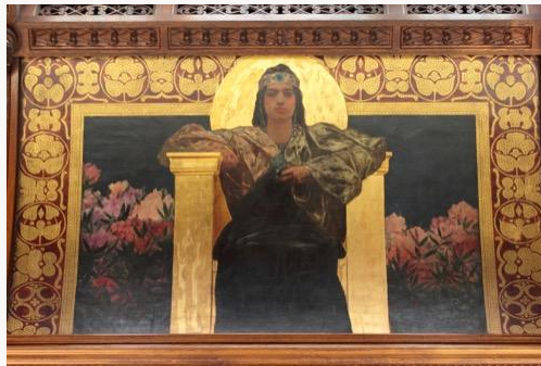
Fig. 11, Jean-Joseph Benjamin-Constant, Empress Theodora , 1889–90. Oil on canvas. Ames-Webster House, 306 Dartmouth Street, Boston, Massachusetts. [larger image]