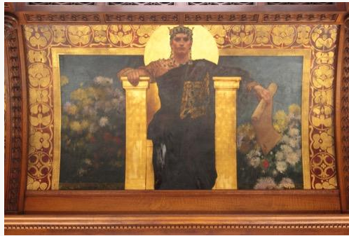
Fig. 10, Jean-Joseph Benjamin-Constant, Emperor Justinian , 1889–90. Oil on canvas. Ames-Webster House, 306 Dartmouth Street, Boston, Massachusetts. [larger image]

On the south wall (toward Commonwealth Avenue) is the Byzantine Emperor Justinian (482–565) seated on a throne, wearing a crown, and holding a parchment scroll with a red wax seal that likely represents a decree pertaining to the Digest (fig. 10). [36] A blue trabea is wrapped around most of his body, largely obscuring the gold-colored tunic that he wears underneath. Green emeralds stud his crown and necklace; bejeweled golden strings hang down from his crown to his shoulders. More precious stones, this time red and white, gird the shoulders and the wrists of his tunic. A geometric pattern decorates the part of the trabea covering his chest. [37] Easily the best-remembered ruler of the Byzantine empire, Justinian was famous for his military exploits against the Vandals and the Ostrogoths, as well as for rewriting Roman Law, building the Hagia Sophia, and surviving a catastrophic outbreak of bubonic plague.