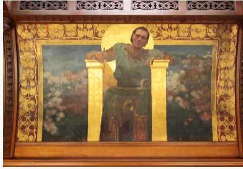
Fig. 12, Jean-Joseph Benjamin-Constant, First Counsellor , 1889–80. Oil on canvas. Ames-Webster House, 306 Dartmouth Street, Boston, Massachusetts. [larger image]