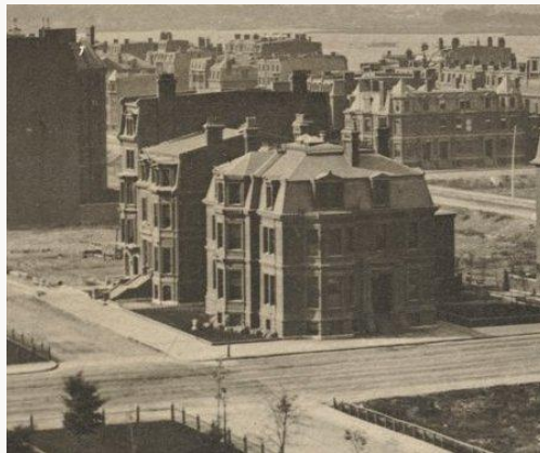
Fig. 3, Exterior of Ames-Webster House, 306 Dartmouth Street, from the First Baptist Church tower, Brattle Street, ca. 1875. Photograph. [larger image]

The Ames-Webster house is one of the most prominent and elegant mansions in Back Bay. [9] Located on the northwest corner of Dartmouth Street and Commonwealth Avenue, this freestanding home was initially designed in the Second Empire style in 1871–72 by the firm of Peabody and Stearns for Stephen Van Rensselaer Thayer, on a plot of 4400 square feet purchased from the Commonwealth of Massachusetts (fig. 3). [10] In 1882, Frederick Ames purchased the house and commissioned architect John H. Sturgis (1834–88) to remodel it. Sturgis added a monumental tower, a massive front hall, a two-story glazed conservatory facing Commonwealth Avenue, and a new entrance on Dartmouth Street with a porte cochère (fig. 4). All that remained of the Peabody and Stearns building were the exterior walls and some of the mansard roof. The renovated façade on Dartmouth Street still includes a roundel with the date of 1882 and the Ames family coat-of-arms on the chimney (fig. 5). American Architect and Building News described this house as the “most beautiful single example” of Sturgis’s career, and an undated newspaper clipping confirmed, “The best work of Mr. Sturgis, in the opinion of many of his professional brethren, is . . . the interior of the Ames house.” [11]