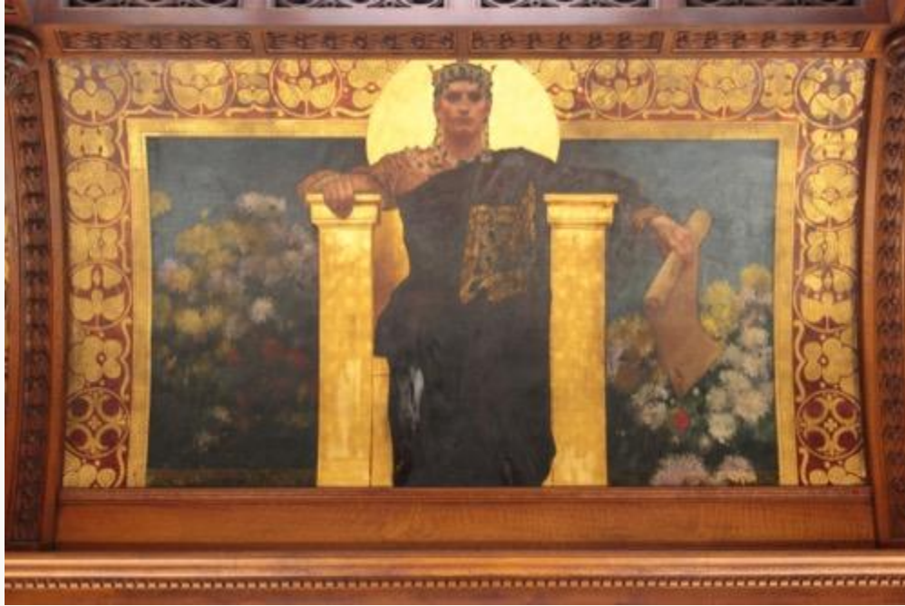
Fig. 10, Jean-Joseph Benjamin-Constant, Emperor Justinian , 1889–90. Oil on canvas. Ames-Webster House, 306 Dartmouth Street, Boston, Massachusetts. [return to text]