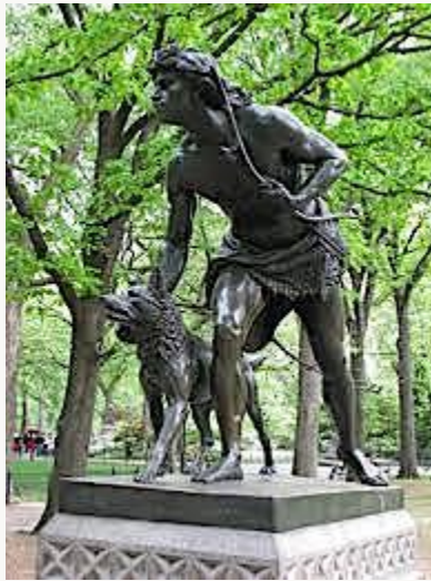
Fig. 6, John Quincy Adams Ward, The Indian Hunter , 1866 (dedicated 1869). Bronze. Central Park, New York. [return to text]