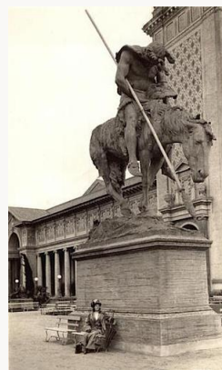
Fig. 10, James Earle Fraser, End of the Trail , Panama-Pacific International Exposition, San Francisco, 1915. [view image & full caption]