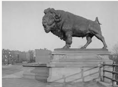
Fig. 14, Alexander Phimister Proctor, Buffalo I , 1911–14.