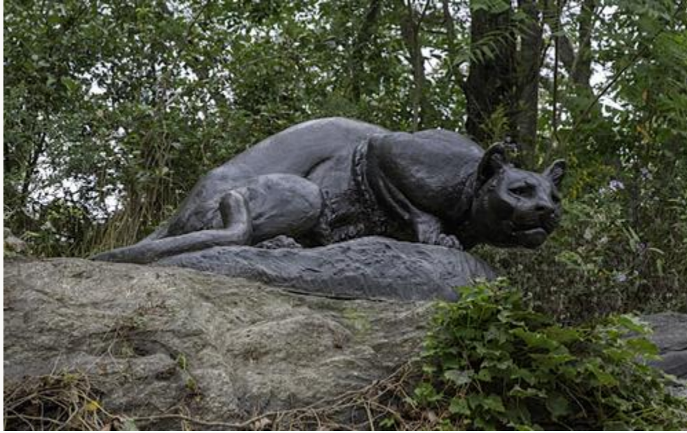
Fig. 11, Edward Kemeys, Still Hunt , 1881–82 (installed 1883). Bronze. Central Park, New York. [return to text]