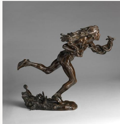
Fig. 8, Hermon Atkins MacNeil, The Moqui Prayer for Rain , 1895–96 (cast ca. 1897). [view image & full caption]