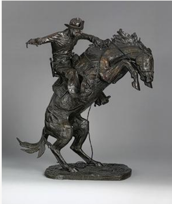
Fig. 15, Frederic Remington, The Bronco Buster , 1895 (cast 1906). Bronze. Sagamore Hill National Historic Site, Oyster Bay. [return to text]