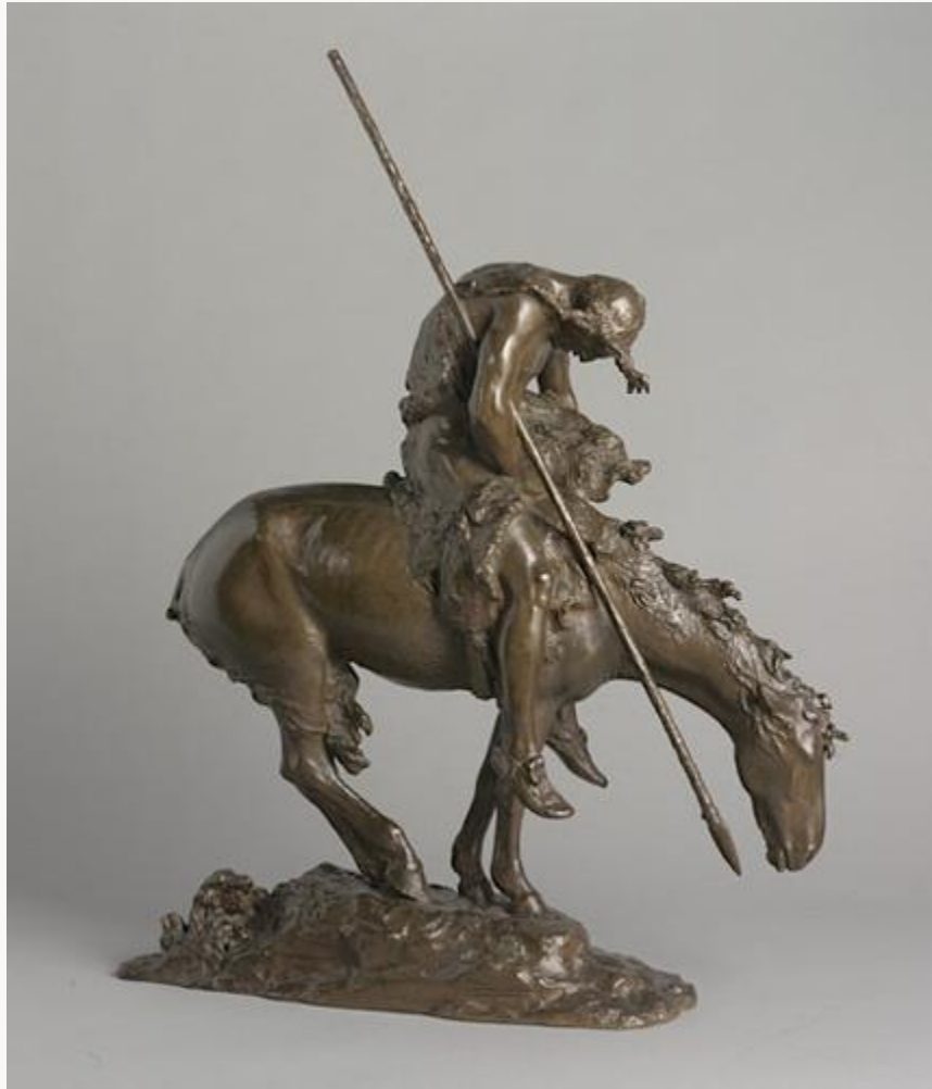
Fig. 9, James Earle Fraser, End of the Trail , 1918 (cast 1918). Bronze. The Metropolitan Museum of Art, New York. [return to text]