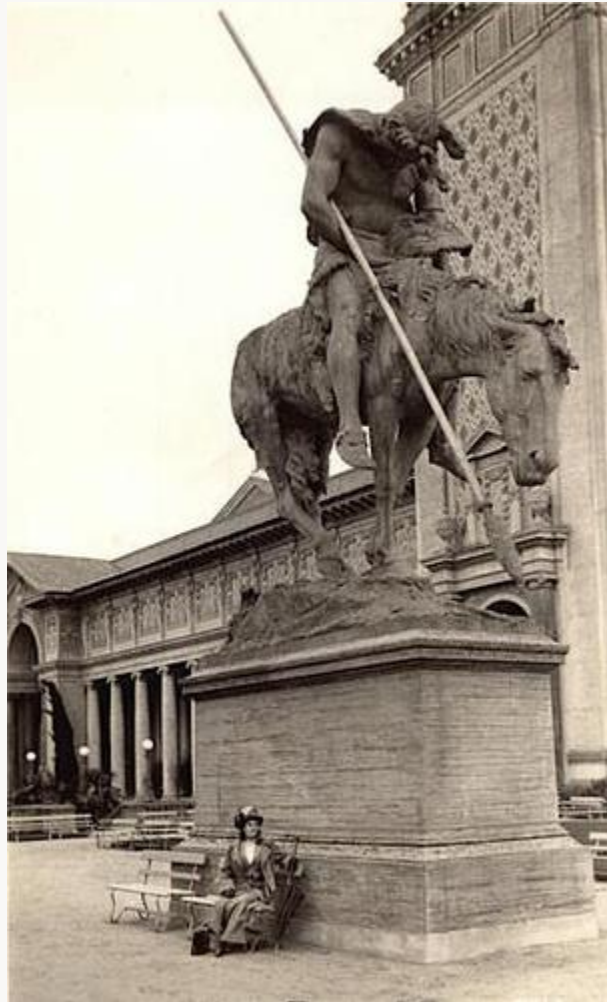
Fig. 10, James Earle Fraser, End of the Trail , Panama-Pacific International Exposition, San Francisco, 1915.