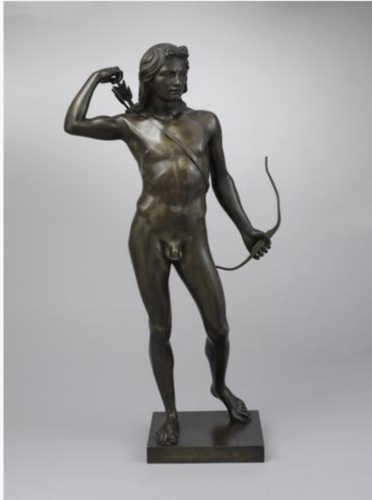
Fig. 4, Henry Kirke Brown, Choosing the Arrow , 1849. Bronze. The Metropolitan Museum of Art, New York.