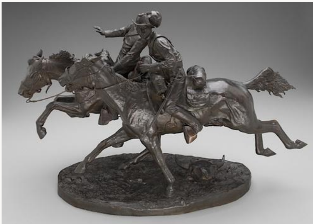
Fig. 16, Frederic Remington, The Wounded Bunkie , 1896 (cast 1896). Bronze. Birmingham Museum of Art, Birmingham. [return to text]