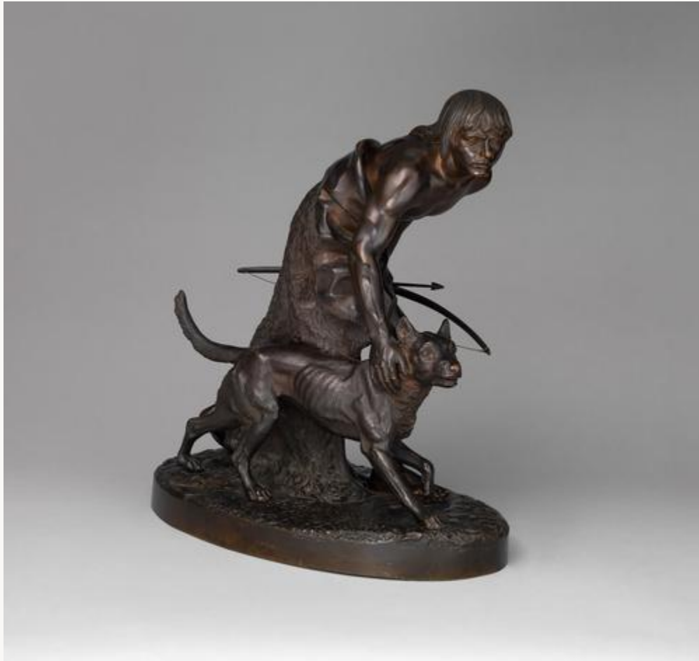
Fig. 5, John Quincy Adams Ward, The Indian Hunter , 1860. Bronze. The Metropolitan Museum of Art, New York. [return to text]