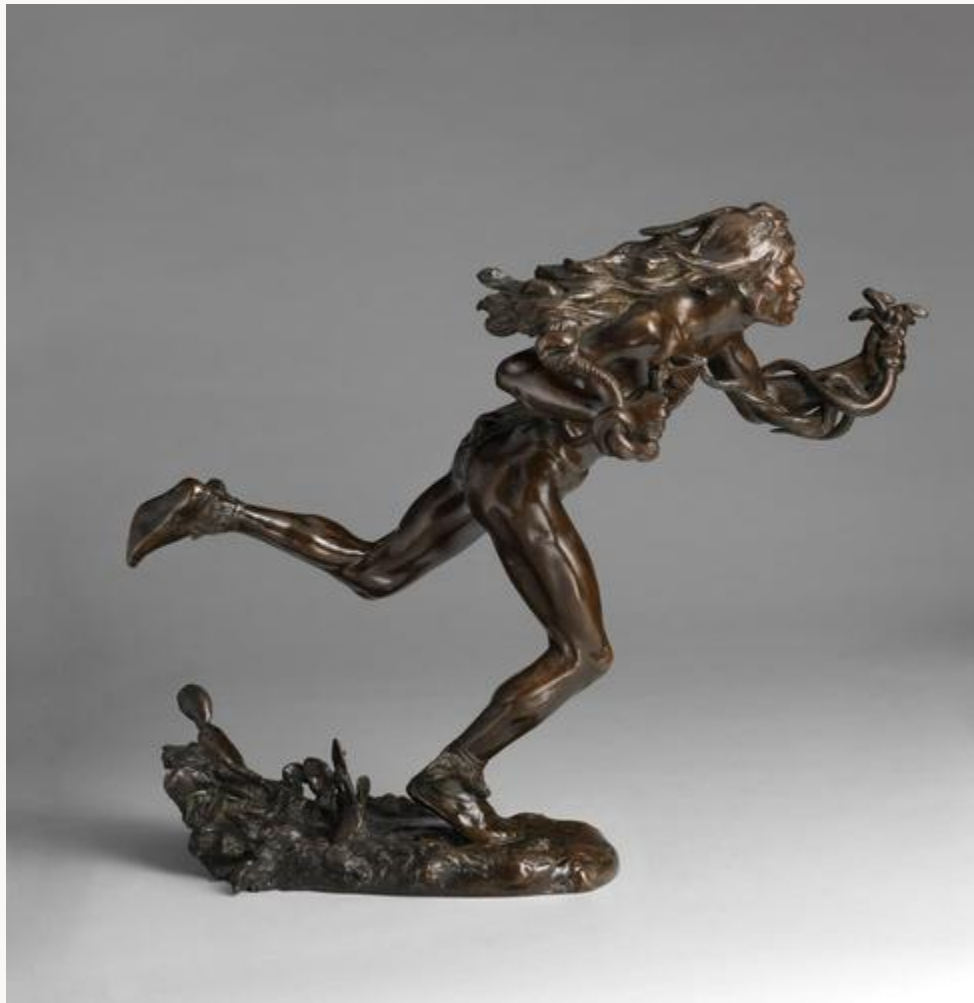
Fig. 8, Hermon Atkins MacNeil, The Moqui Prayer for Rain , 1895–96 (cast ca. 1897). Bronze. The Metropolitan Museum of Art, New York. [return to text]