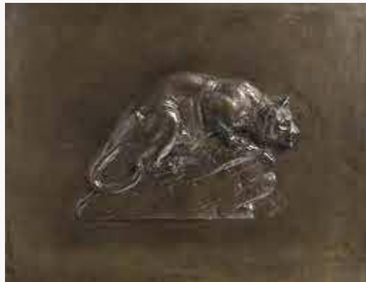
Fig. 12, Edward Kemeys, Still Hunt , 1894. Bronze relief. The Metropolitan Museum of Art, New York. [return to text]