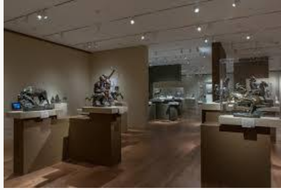
Fig. 7, Installation view, The Metropolitan Museum of Art, New York. [return to text]