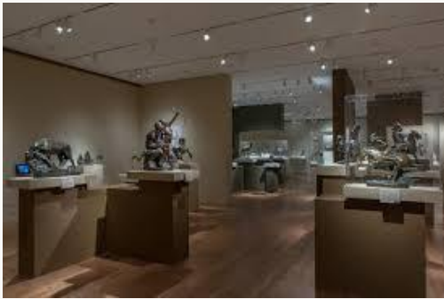
Fig. 7, Installation view, The Metropolitan Museum of Art, New York. [view image & full caption]

Once inside the main galleries, which were appropriately small in scale (fig. 7), one was introduced to the first of the four organizing themes—the American Indian. The sculptures in this section focused on their way of life often enveloped with an air of nostalgia or defeat. Hermon MacNeil, who traveled to Arizona to study the Hopi Indians first hand, captured an arresting image in his The Moqui [Hopi] Prayer of Rain or Snake Dance (fig. 8). What catches the eye is the running pose, flowing locks and the several snakes held by the Hopi priest, all of which are combined to create a remarkably fluid image. Among the most familiar of these Native American images is Fraser’s heart-breaking End of the Trail , which was a small scale replica of the monumental plaster displayed at San Francisco’s 1915 Panama-Pacific International Exposition (figs. 9, 10). Fraser grew up in the Dakota Territory and witnessed the opening up of the West to settlers, miners, ranchmen, and railroad men, all of whom impacted the lives and livelihoods of the Native Americans. For a contemporary American audience, Fraser’s image of an exhausted Native American, slumped over in his saddle fully encapsulates the despair experienced by the displaced indigenous peoples.