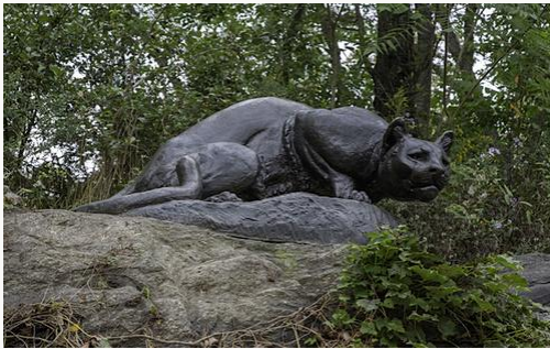
Fig. 11, Edward Kemeys, Still Hunt , 1881–82 (installed 1883).

Complementing these fraught images of Native Americans were the depictions of the wildlife of the American West in the subsequent section. Some of these, most notably the bison, were at risk of becoming extinct. Exquisitely crafted, these sculptures reflect a renewed interest in Renaissance bronzes, the work of the contemporary French sculptor Antoine Louis Barye, and the tradition of the animalier . Buffalo and panthers, moose and black bears, these sculptures, like their figural counterparts also made a appearances in the public realm, sometimes the full-scale version preceding the table top edition. Two are relatively well known—one to ramblers in Manhattan’s Central Park, the other to pedestrians in Washington, DC, who cross the Dumbarton Oak Bridge at Q Street. Unlike most of the sculptures in Central Park that form a part of the formal landscaping, Edward Kemeys’s Still Hunt is found on top of a granite outcropping, a couching black panther ready to pounce (figs. 11, 12). In contrast, Proctor’s four monumental Buffalo are fully exposed on pylons at each corner of the bridge (figs. 13, 14). These two animals, in particular, which had largely disappeared from the western landscape, embody the same sense of nostalgia as that held for the Native American.