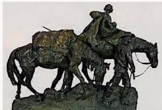
Fig. 3, Alexander Phimister Proctor, Pioneer Mother , 1925 (cast 1927). Bronze. Santa Barbara Museum of Art, Santa Barbara. [return to text]