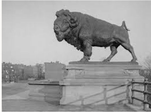
Fig. 14, Alexander Phimister Proctor, Buffalo I , 1911–14. Bronze. Q Street Bridge, Washington, DC. [return to text]