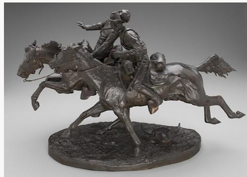
Fig. 16, Frederic Remington, The Wounded Bunkie , 1896 (cast 1896). [view image & full caption]