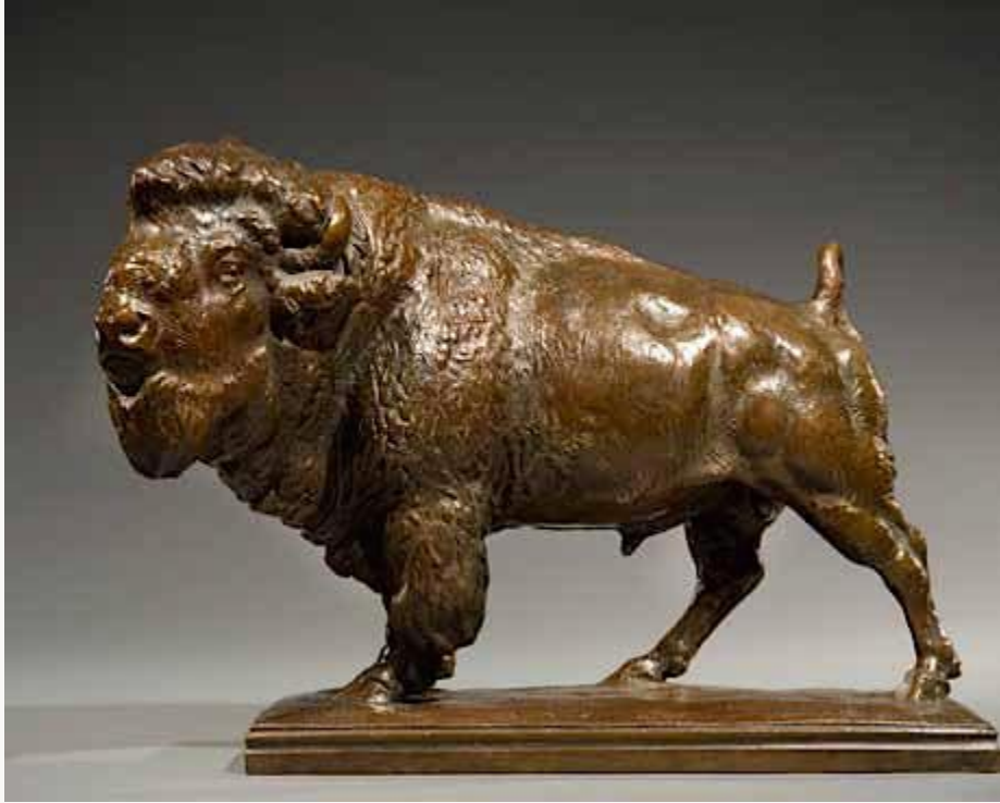
Fig. 13, Alexander Phimister Proctor, Buffalo , 1912 (cast 1913 or after). Bronze. The Metropolitan Museum of Art, New York. [return to text]