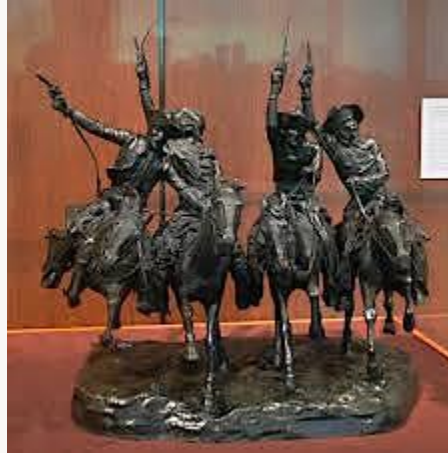
Fig. 1, Frederic Remington, Coming Through the Rye , 1902 (cast 1907). Bronze. Buffalo Bill Center of the West, Cody. [return to text]