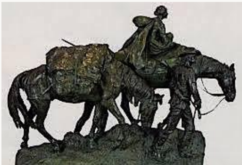
Fig. 3, Alexander Phimister Proctor, Pioneer Mother , 1925 (cast 1927). [view image & full caption]

In the exhibition this afterlife of the western bronzes was illustrated through archival photographs and images in the accompanying catalogue. Writing there, Brian Dippie, a Canadian historian, demonstrates how these images also invaded popular culture, reappearing as characters in dime novels, the movies, and even on coinage—the Buffalo nickel was designed by one of the most prolific of these artists, James Earle Fraser in 1913.