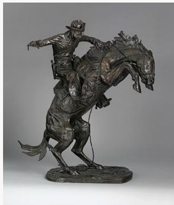
Fig. 15, Frederic Remington, The Bronco Buster , 1895 (cast 1906). [view image & full caption]

His first bronze, The Bronco Buster is a tour de force in which a grizzled old man is determined to tame the rearing, wild bronco (fig. 15). Remington's The Wounded Bunkie [bunkmate] in which a cavalryman, riding on horseback, rescues his wounded partner is another example of agitated sculpted narrative for which Remington was best known (fig. 16). The most complex of these story-telling bronzes is Coming through the Rye , a popular image that was based on an illustration Remington had created for a commentary "Frontier Types" written for Century Magazine by Theodore Roosevelt.