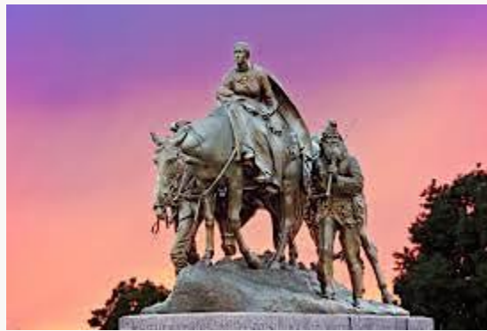
Fig. 2, Alexander Phimister Proctor, Pioneer Mother , 1925–27 (dedicated 1927). Bronze. Penn Valley Park, Kansas City. [return to text]