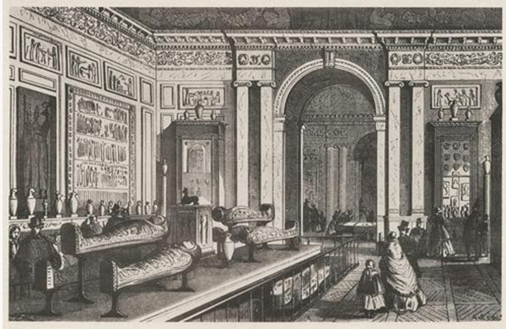
Fig. 2, A. Régis, Salle funéraire du musée Charles X , engraving published in Adolphe Joanne, Paris illustré, nouveau guide de l'étranger et du Parisien (Paris: Bonaventure et Ducessois, 1863). [return to text]