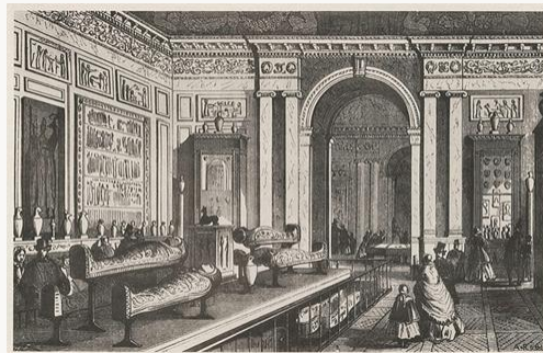
Fig. 2, A. Régis, Salle funéraire du musée Charles X , engraving published in Adolphe Joanne, Paris illustré, nouveau guide de l'étranger et du Parisien (Paris: Bonaventure et Ducessois, 1863). [larger image]

A note on the second funerary room (current room 29): in several instances Dubois noted that mummies were displayed, with and without coffins, “on the table.” However, because no documentation exists from that time to suggest what such a table may have looked like, no table has been included in the model. It may have been located in the center of the gallery, as shown in the first known visual record of the Musée Charles X, which dates to 1863 (fig. 2). In other cases, Dubois’s notes indicate that various parts of a single coffin were divided between rooms, or his notes contradict each other, suggesting that an item (or components of it) was both on display and in storage. Given this lack of specificity, we have rendered one mummy in three-dimensions and placed it in the third cabinet of room 3 to suggest the presence of the mummies and coffins in this gallery. [1]