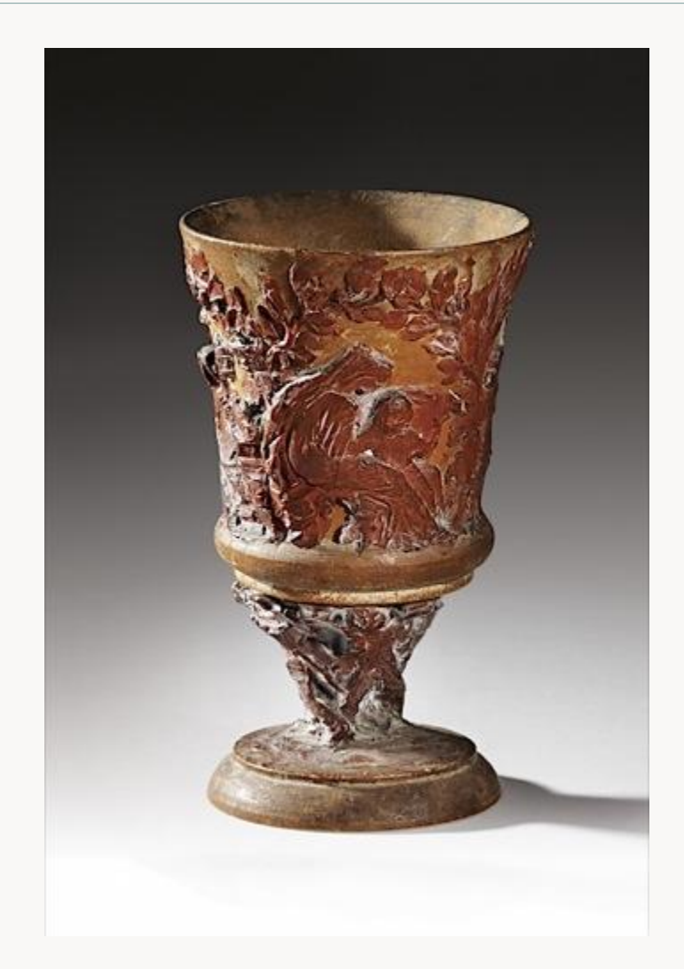
Fig. 8, David d'Angers, Christening Cup , 1835. Wood, wax and graphite. Collection Pierre Bergé. [return to text]