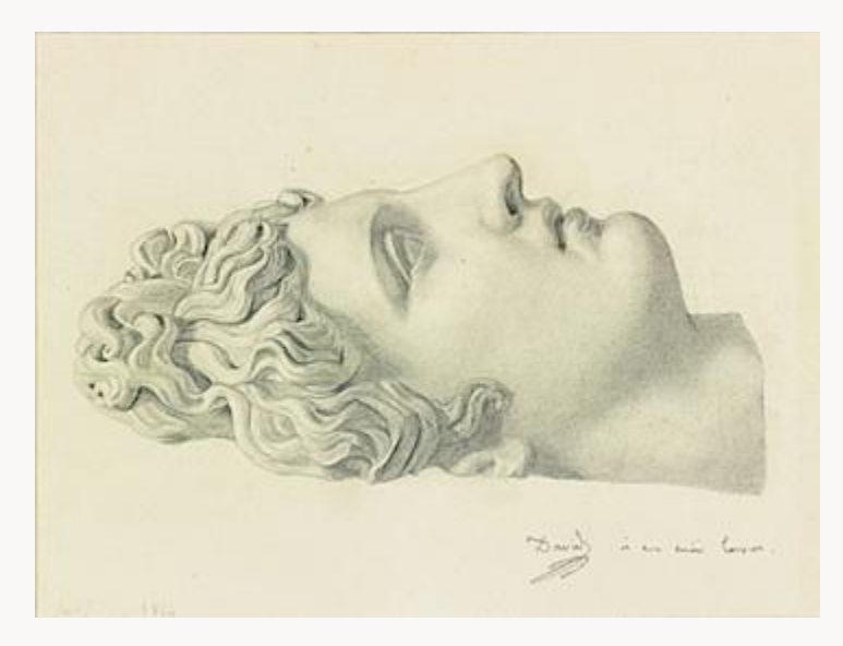
Fig. 5, David d'Angers, Study after a Plaster Cast of the Apollo Belvedere , ca. 1814. Black chalk on laid paper. Collection Louise Grunwald. [return to text]