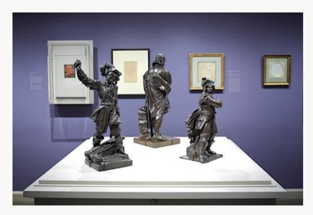
Fig. 13, Installation view of the Lower Level Gallery, showing the display of the Grand Condé, Jean Bart , and Ambroise Paré , in the exhibition David d'Angers: Making the Modern Monument at the Frick Collection, New York. [return to text]