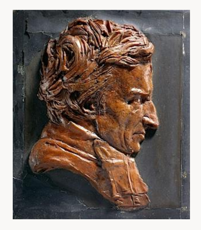
Fig. 9, David d'Angers, The Abbé de Lamennais, 1831. Wax on slate. Private Collection. [return to text]