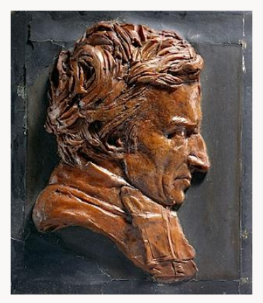
Fig. 9, David d'Angers, The Abbé de Lamennais, 1831. [view image & full caption]

After viewing three representations of female figures (a drawing entitled Head of a Woman in Profile ; a small terracotta called Seated Woman , and a bronze medallion of Cecilia Odescalchi, David's first love), the visitor was presented with two wax on slate portraits and the two bronzes made from them. One of these sets, the portrait of the Abbé de Lamennais in wax and bronze (figs. 9, 10), both from 1831, exemplified well David's working method. Showing these works side-by-side also highlights, for better or worse, the various details that are lost after the work in wax is transferred into bronze. In viewing the Abbé de Lamennais works together, I felt that there was a loss of the freshness and immediacy of the wax in the bronze translation, particularly in the cravat and in the hair. Visitors were told in a wall label that few of the original wax models for the medallions have survived, so it was a special event to see the Abbé de Lamennais and the portrait in wax of Émile Deschamps (1829), in the same display case, all from private collections.