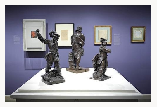
Fig. 13, Installation view of the Lower Level Gallery, showing the display of the Grand Condé, Jean Bart, and Ambroise Paré, in the exhibition David d'Angers: Making the Modern Monument at the Frick Collection, New York. [view image & full caption]