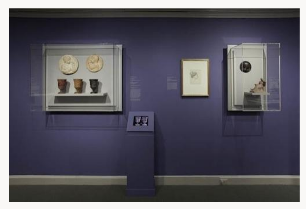
Fig. 7, Installation view of the Lower Level Gallery, showing the display of medallions of Robert and Hélène David and the Christening Cups, in the exhibition David d'Angers: Making the Modern Monument at the Frick Collection, New York. [return to text]