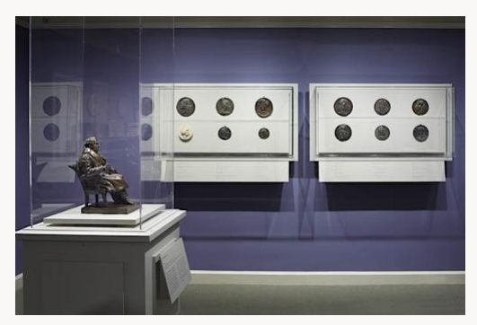
Fig. 11, Installation view of the Lower Level Gallery, showing the back wall with two cases of medallions by David d'Angers, in the exhibition David d'Angers: Making the Modern Monument at the Frick Collection, New York. [view image & full caption]