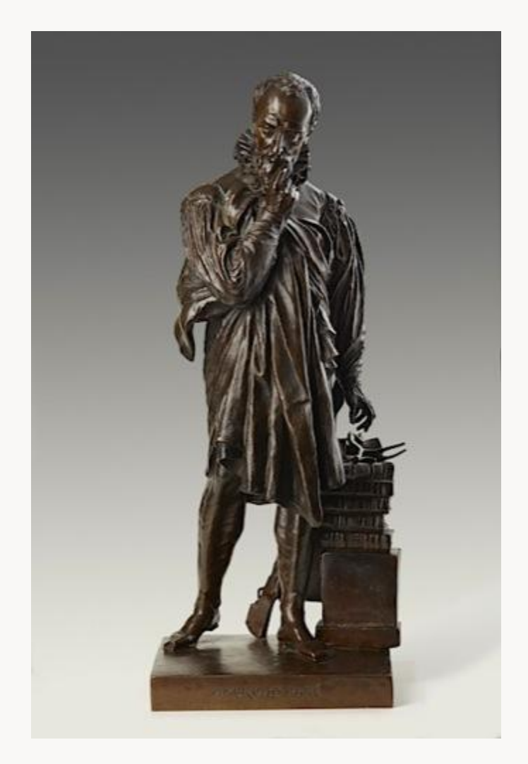
Fig. 14, David d'Angers, Ambroise Paré , 1840. Bronze. Collection Carol and Herbert Diamond. [return to text]