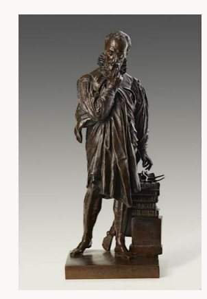
Fig. 14, David d'Angers, Ambroise Paré , 1840. [view image & full caption]