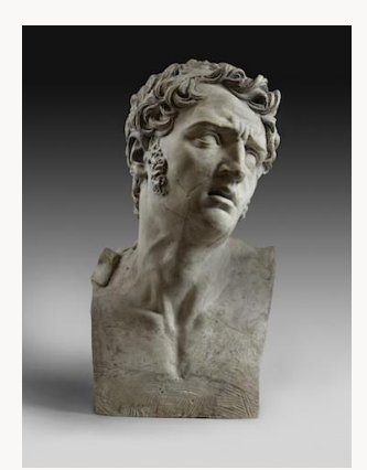
Fig. 3, David d'Angers, La Douleur (Pain) , 1811. [view image & full caption]

Turning into the Lower Level gallery to the right (fig. 4), the exhibition continued on the left wall with a two drawings, Study after a Plaster Cast of the Apollo Belvedere (fig. 5) and General Bonchamps Shown in a Pose Designed for His Tomb (recto shown, 1824), and small bronze version of the Monument to Bonchamps from the same year as examples of David's early works. The history of the monument dedicated to Charles-Melchior-Artus, marquis de Bonchamps (1760–1793) was recently and deeply treated by Lindsay in her book reviewed here <u>Pierre reviews</u> Funerary Arts and Tomb Cult, and is in fact David's most important monument.[2] As he lay dying, the conservative Bonchamps asked that the 5,000 republican revolutionary prisoners, held at the church of Saint-Florent-le-Vieil, be pardoned. David's own father was among the prisoners released, and although the artist did not reveal that information to the parties in charge of the commission, he was nevertheless selected for the project in 1818. The drawing for the monument, lent by the Metropolitan Museum of Art, and the small bronze edition of the final tomb project were important, necessary contributions to the exhibition.