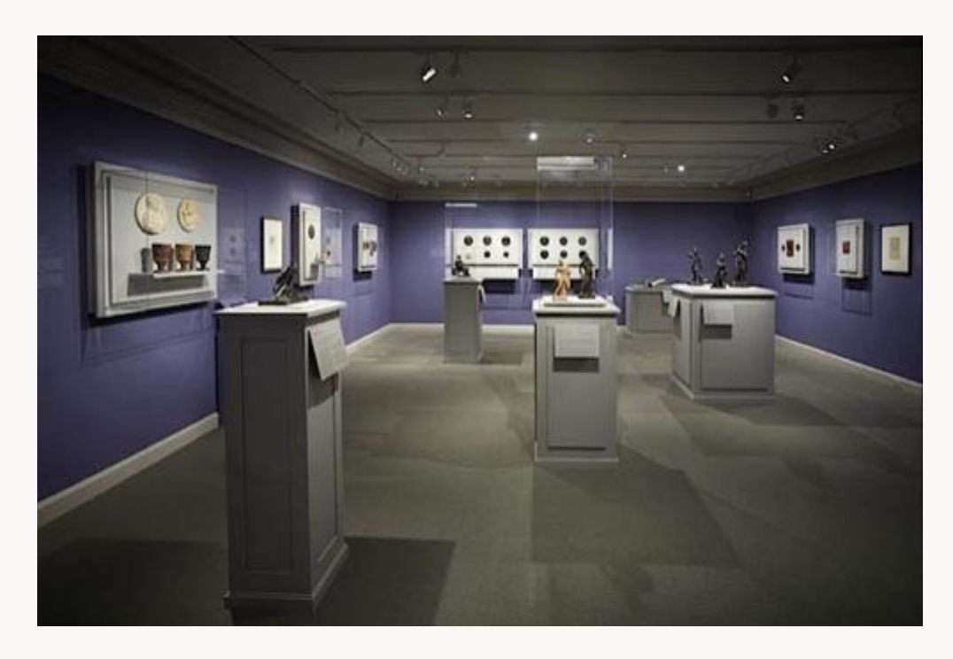
Fig. 4, Installation view of the Lower Level Gallery, showing the exhibition David d'Angers: Making the Modern Monument at the Frick Collection, New York. [return to text]