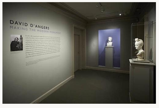
Fig. 1, Installation view of the entranceway to the exhibition David d'Angers: Making the Modern Monument at the Frick Collection, New York. [view image & full caption]