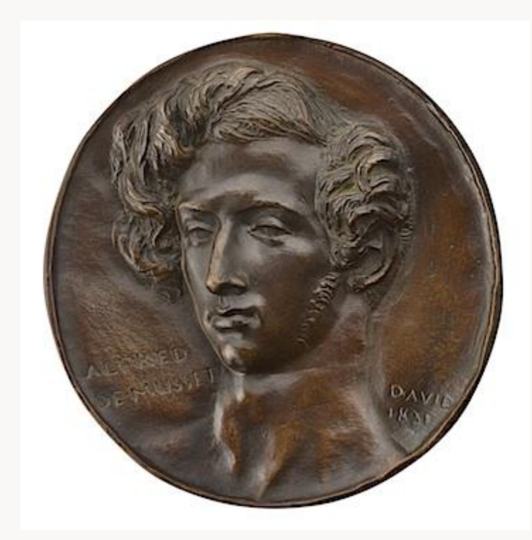
Fig. 12, David d'Angers, Alfred de Musset , 1831. Bronze. Collection Frances Beatty and Allen Adler. [return to text]