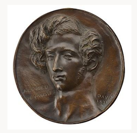
Fig. 12, David d'Angers, Alfred de Musset , 1831. [view image & full caption]

While there was no press image available for David's Study for a Tomb Relief for the Duchess d'Abrantès (1841), I would like to mention it here. The drawing was among the most detailed in the exhibition and is an example of a rare concept for a public monument dedicated to a female artist. Known for her wild extravagance and witty though biting memoirs, the tomb