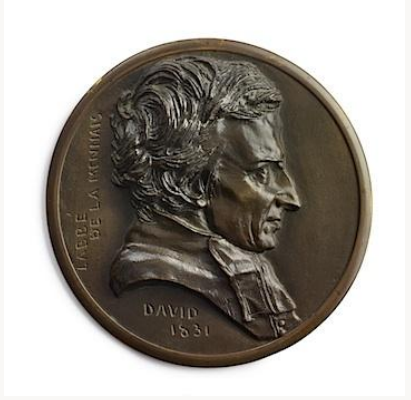
Fig. 10, David d'Angers, The Abbé de Lamennais , 1831. [view image & full caption]

The far wall of the exhibition, parallel to the entrance, held two display cases containing eleven bronze portrait medallions and one plaster medallion (fig. 11). Although David created largescale and truly monumental public works, his fame rightly lies with his revival of the cast bronze portrait medal, a sculptural type, which originated in the Renaissance. The single-sided