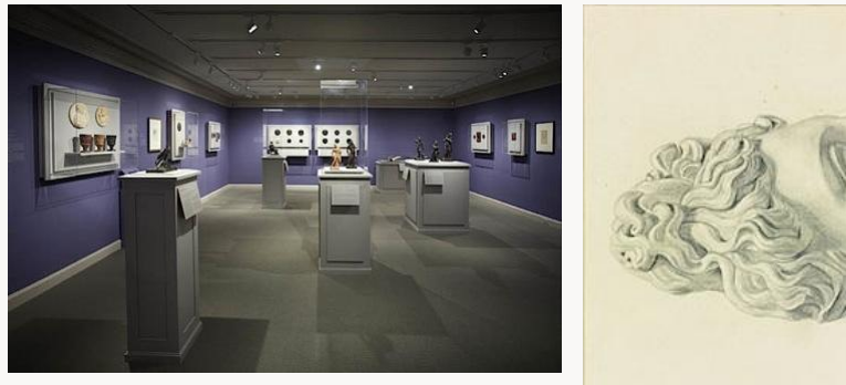
Fig. 4, Installation view of the Lower Level Gallery, showing the exhibition David d'Angers: Making the Modern Monument at the Frick Collection, New York. [view image & full caption]

Turning into the Lower Level gallery to the right (fig. 4), the exhibition continued on the left wall with a two drawings, Study after a Plaster Cast of the Apollo Belvedere (fig. 5) and General Bonchamps Shown in a Pose Designed for His Tomb (recto shown, 1824), and small bronze version of the Monument to Bonchamps from the same year as examples of David's early works. The history of the monument dedicated to Charles-Melchior-Artus, marquis de Bonchamps (1760–1793) was recently and deeply treated by Lindsay in her book reviewed here <u>Pierre reviews</u> Funerary Arts and Tomb Cult, and is in fact David's most important monument.[2] As he lay dying, the conservative Bonchamps asked that the 5,000 republican revolutionary prisoners, held at the church of Saint-Florent-le-Vieil, be pardoned. David's own father was among the prisoners released, and although the artist did not reveal that information to the parties in charge of the commission, he was nevertheless selected for the project in 1818. The drawing for the monument, lent by the Metropolitan Museum of Art, and the small bronze edition of the final tomb project were important, necessary contributions to the exhibition.