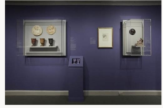
Fig. 7, Installation view of the Lower Level Gallery, showing the display of medallions of Robert and Hélène David and the Christening Cups, in the exhibition David d'Angers: Making the Modern Monument at the Frick Collection, New York. [view image & full caption]