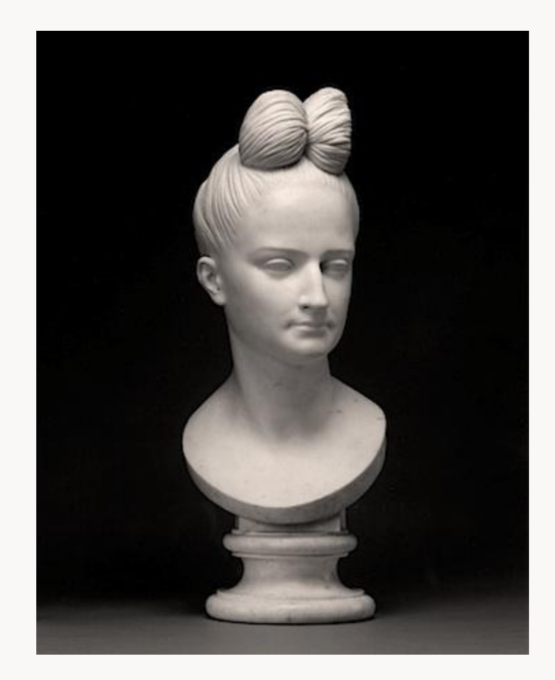
Fig. 2, David d'Angers, Ann Buchan Robinson , 1831. Marble. Museum of the City of New York; Gift of J. Philip Benkard II, 1958. [return to text]