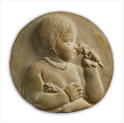
Fig. 6, David d'Angers, Hélène David , 1838. [view image & full caption]