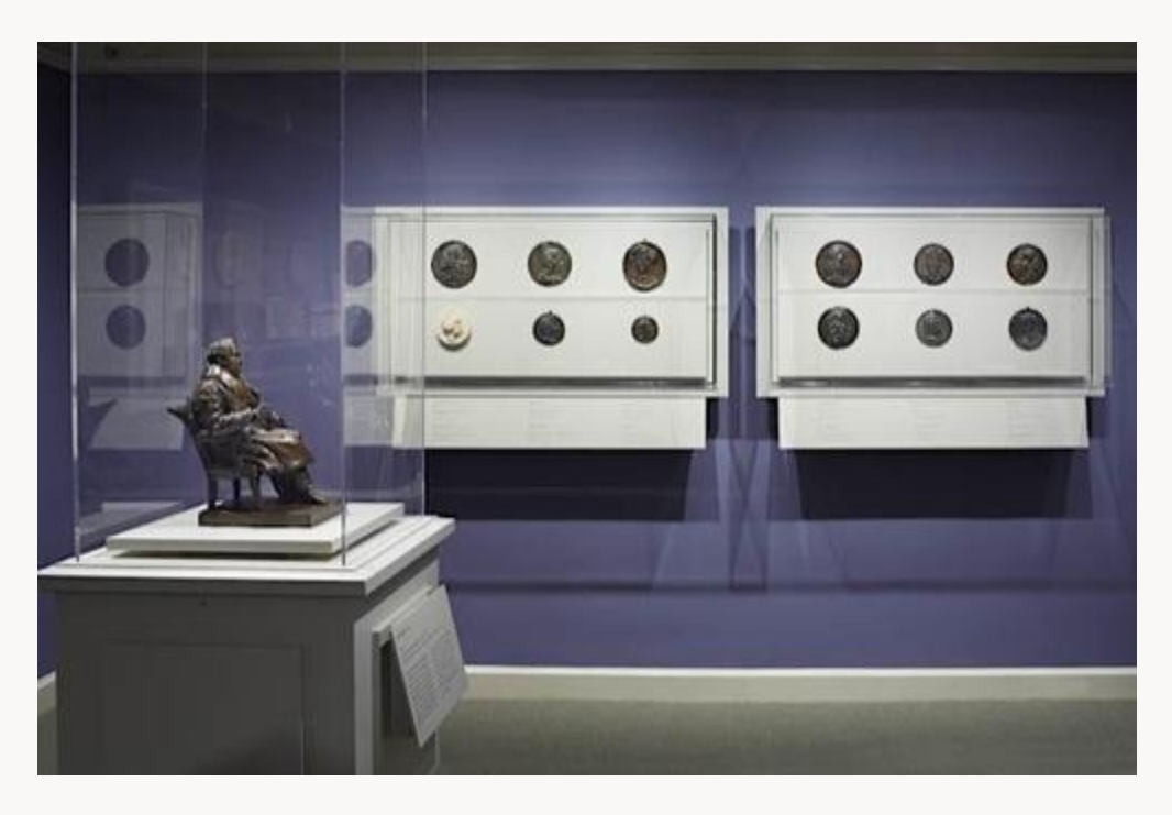
Fig. 11, Installation view of the Lower Level Gallery, showing the back wall with two cases of medallions by David d'Angers, in the exhibition David d'Angers: Making the Modern Monument at the Frick Collection, New York. [return to text]