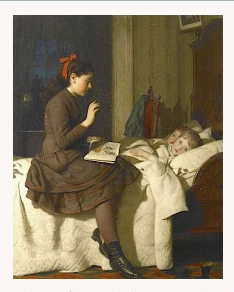
Fig. 15, Seymour Joseph Guy, A Bedtime Story, 1878. Oil on canvas. Private collection. [return to text]