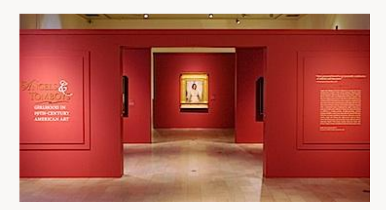
Fig. 4, Entrance to the exhibition with Thayer, Angel (see fig. 2). [return to text]