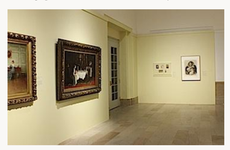
Fig. 12, "The Innocence of Girlhood": On rear wall, from left: Photographs from the collection of Tanya Sheehan, Providence, RI. Lilly Martin Spencer, engraving by Jean Baptiste Adolphe Lafosse, Height of Fashion , 1854. Lithograph. Library of Congress, Prints and Photographs, Washington, DC. [return to text]