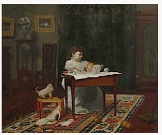
Fig. 7, "Attributes of Girlhood ~ Flowers, Pets and Dolls": William J. McCloskey, Feeding Dolly (If You Don't Eat It, I'll Give It to Doggie) , 1890.