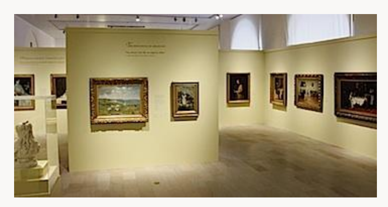
Fig. 10, "The Innocence of Girlhood": On center wall, from left: William Merritt Chase, Idle Hours , ca. 1894. Oil on canvas. Amon Carter Museum of American Art, Fort Worth; Winslow Homer, Girl and Laurel , 1879. Oil on canvas. Detroit Institute of Arts, Detroit. [return to text]