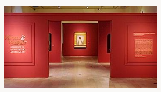
Fig. 4, Entrance to the exhibition with Thayer, Angel (see fig. 2). [view image & full caption]