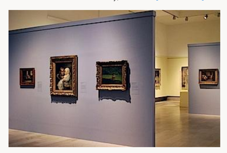
Fig. 26, "The Young Scholar": At left: Edward Lamson Henry, Kept In , 1889. Oil on canvas. Fenimore Art Museum, Cooperstown. [return to text]