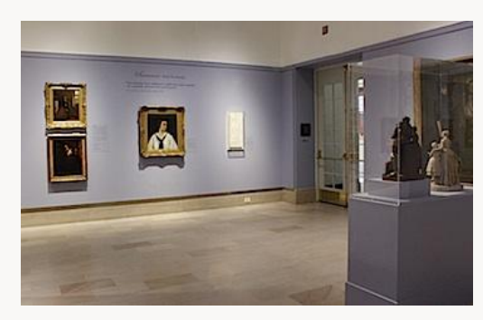
Fig. 22, "Adolescence ~ Rite of Passage" section.