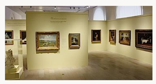
Fig. 10, "The Innocence of Girlhood": On center wall, from left: William Merritt Chase, Idle Hours , ca. 1894.