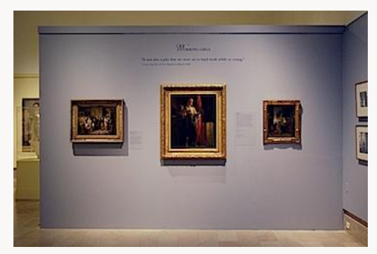
Fig. 20, "Working Girls": From left: John Lewis Krimmel, Quilting Frolic , 1813. [view image & full caption]

as longing for the freedom that the tomboys in the previous section enjoyed, she appears strong and clean, as if her work is the foundation for a healthful future. Connor pointed out on the wall label that "artists rarely dealt with the grim realities that faced children who had to work for a living," and only occasionally represented working-class African-American girls.