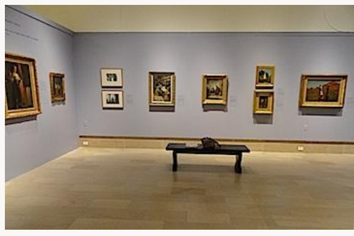
Fig. 21, "Working Girls": On rear wall, at left: Jacob Riis, Girl and Baby at Doorstep and I Scrubs , ca. 1890.