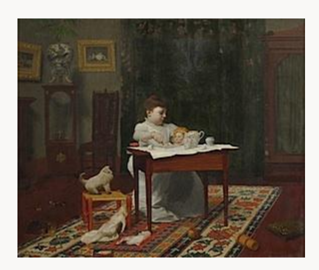
Fig. 7, "Attributes of Girlhood ~ Flowers, Pets and Dolls": William J. McCloskey, Feeding Dolly (If You Don't Eat It, I'll Give It to Doggie) , 1890. Oil on canvas. Hudson River Museum, Yonkers. [return to text]