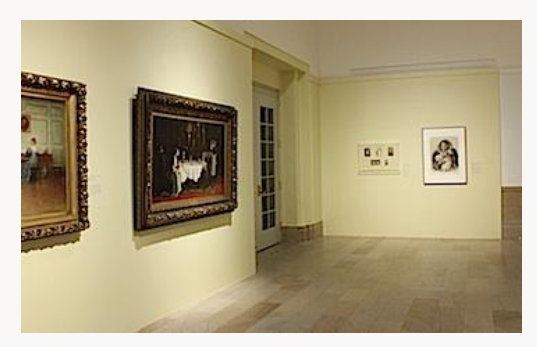
Fig. 12, "The Innocence of Girlhood": On rear wall, from left: Photographs from the collection of Tanya Sheehan, Providence, RI. [view image & full caption]