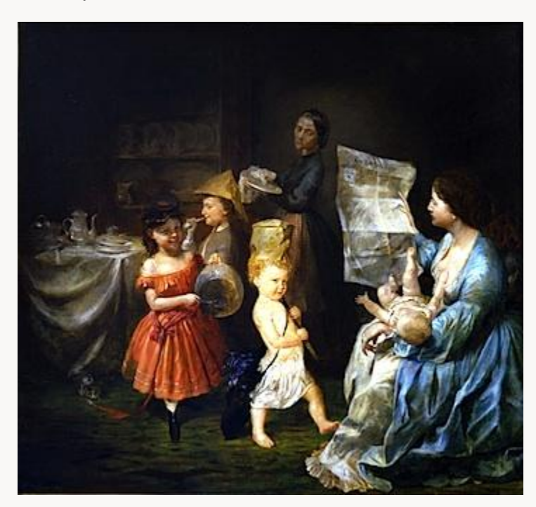
Fig. 14, "Mothers, Daughters and Sisters": Lilly Martin Spencer, War Spirit at Home (Celebrating the Victory at Vicksburg) , 1866. Oil on canvas. Newark Museum, Newark. [return to text]