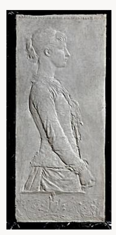
Fig. 24, "Adolescence ~ Rite of Passage": Augustus Saint-Gaudens, Sarah Redwood Lee , 1881. Plaster. [return to text]