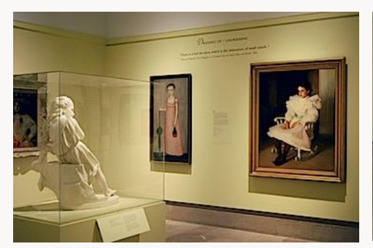
Fig. 16, "Dressing Up ~ Undressing": On the right: Frank Weston Benson, Gertrude , 1899. [view image & full caption]

—speaks to her innocence. Connor pointed out in the wall text that while the sculpture appears undeniably sensual to modern eyes, "nineteenth-century writers—and by implication viewers—did not consider images of naked children to be provocative or disturbing but rather to capture the innocence and naivety of youth." She went on to note, however, that the ambivalent readings of Ives' sculpture echo Henry James' novella The Turn of the Screw (1898), in which the specter of childhood corruption is raised, but never resolved, wisely letting the visitor decide how to interpret The Truant . Nearby, Seymour Joseph Guy's Dressing for the Rehearsal (ca. 1890, Smithsonian American Art Museum, Washington, DC), in which a pubescent nude wearing butterfly wings looks dolefully aside while her body casts a menacing shadow, reminded visitors that given the romantic belief in the innate innocence of childhood, puberty signaled the start of an inevitable, but tragic, fall from grace (fig. 18). Dressing for the Rehearsal was visible through the doorway to the third gallery as you approached Angel in the second, and functioned as a melancholy doppelganger to Thayer's painting. While Thayer sought to immortalize the state of girlish purity, Guy anxiously alluded to the inevitability of sexual development.