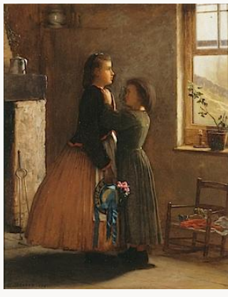
Fig. 23, "Adolescence ~ Rite of Passage": Eastman Johnson, The Party Dress (The Finishing Touch) , 1872.