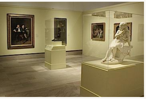
Fig. 17, "Dressing Up ~ Undressing": On the right: Chauncey Bradley Ives, The Truant , 1871.