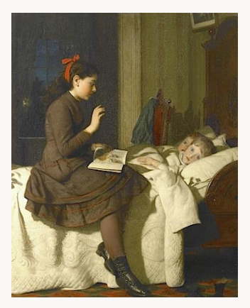
Fig. 15, Seymour Joseph Guy, A Bedtime Story , 1878.