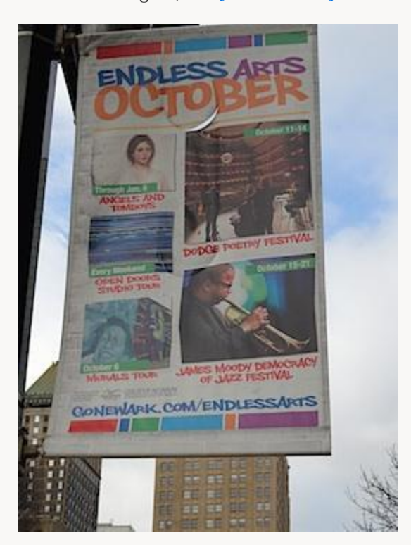
Fig. 3, Banner advertising the exhibition, with detail of Angel (see fig. 2). [return to text]