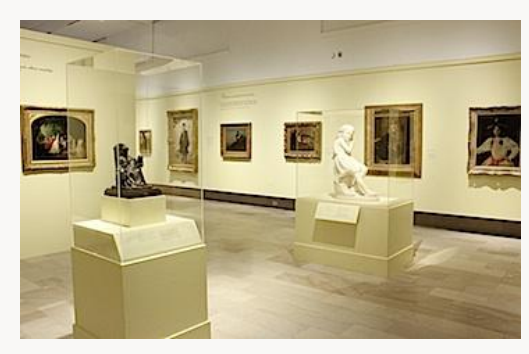
Fig. 13, "Mothers, Daughters and Sisters": In left case: Bessie Potter Vonnoh, Enthroned , 1902; cast 1906.

duty, as an adolescent girl masterfully frightens her younger siblings with the tale of Goldilocks and the three bears (fig. 15).[7] However, there were a number of works in the exhibition that would have been at home in several sections, which speaks to the rich and varied interpretive possibilities the images in Angels and Tomboys offered.