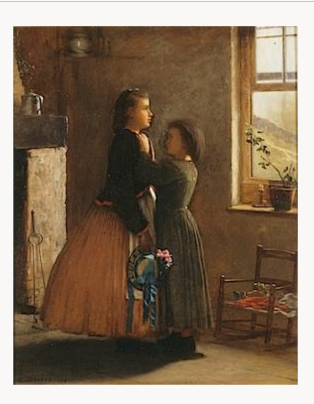
Fig. 23, "Adolescence ~ Rite of Passage": Eastman Johnson, The Party Dress (The Finishing Touch) , 1872. Oil on composition board. Wadsworth Atheneum Museum of Art, Hartford. [return to text]