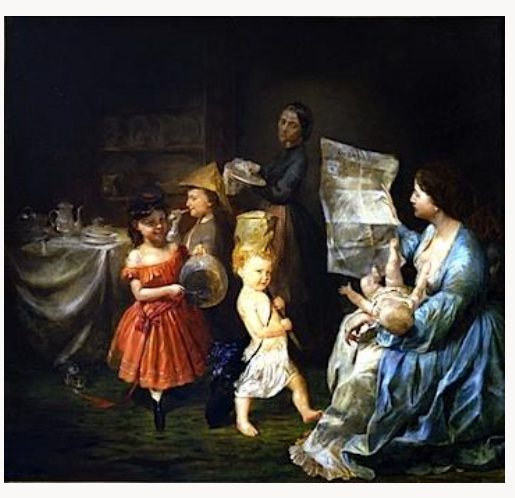
Fig. 14, "Mothers, Daughters and Sisters": Lilly Martin Spencer, War Spirit at Home ( Celebrating the Victory at Vicksburg ), 1866. [view image & full caption]