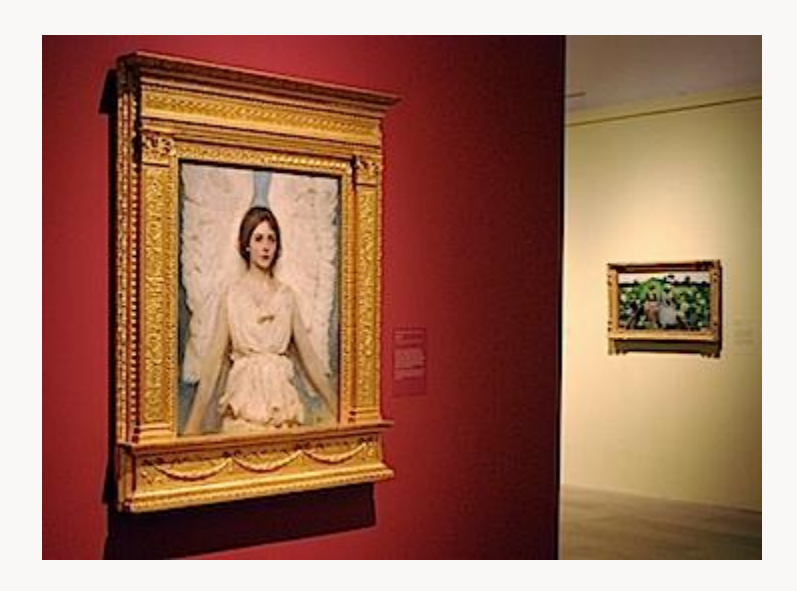
Fig. 9, From left: Thayer, Angel (see fig. 2). Charles Courtney Curran, Lotus Lilies , 1888. Oil on canvas. Terra Foundation for American Art, Chicago. [return to text]