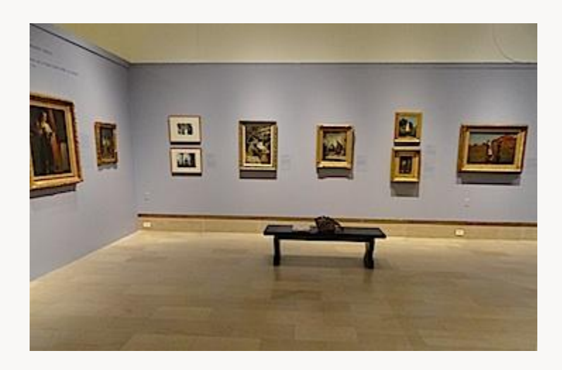
Fig. 21, "Working Girls": On rear wall, at left: Jacob Riis, Girl and Baby at Doorstep and I Scrubs , ca. 1890. Both photographs printed from copy negatives. Both Museum of the City of New York, New York. At right: Winslow Homer, A Temperance Meeting (Noon Time) , 1874. Oil on canvas. Philadelphia Museum of Art, Philadelphia. [return to text]