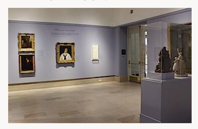
Fig. 22, "Adolescence ~ Rite of Passage" section. [return to text]