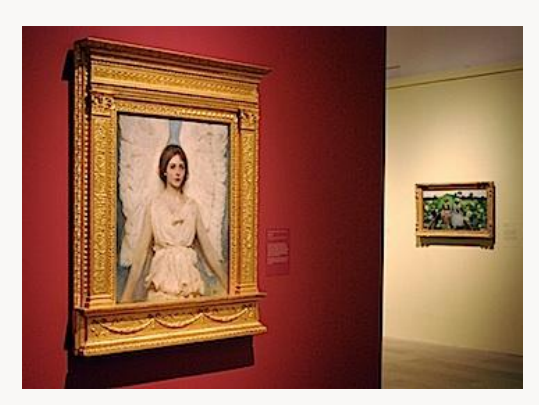
Fig. 9, From left: Thayer, Angel (see fig. 2). [view image & full caption]