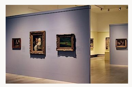
Fig. 26, "The Young Scholar": At left: Edward Lamson Henry, Kept In , 1889. [view image & full caption]

addressed female education, the exhibition looked ahead to the gradual expansion of opportunities for women in American society during the following century.