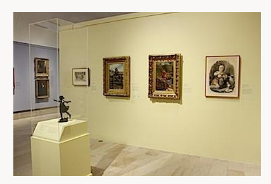
Fig. 19, "Tomboys and Mischievous Little Girls": On yellow wall, from left: Winslow Homer, "Winter"— *A Skating Scene*, 1868.