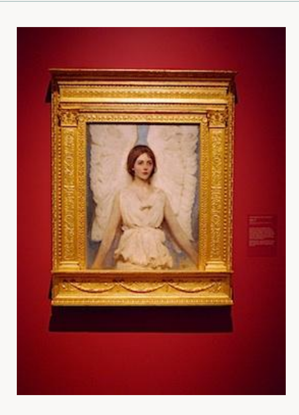
Fig. 2, Abbott Handerson Thayer, Angel , 1887. Oil on canvas. Smithsonian American Art Museum, Washington, DC. [return to text]