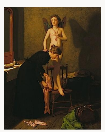
Fig. 18, "Dressing Up ~ Undressing": Seymour Joseph Guy, Dressing for the Rehearsal , ca. 1890. [view image & full caption]

Moving along in the gallery, the mood lightened again with images of "Tomboys and Mischievous Little Girls." This section featured representations of high-spirited, physically