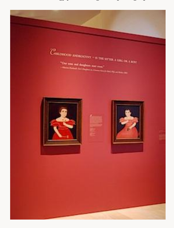
Fig. 1, "Childhood Androgyny ~ Is the Sitter a Girl or a Boy": From left: Ammi Phillips, Boy in Red and Girl in Pink , ca. 1832. Both oil on canvas. Both Princeton University Art Museum, Princeton. [return to text]