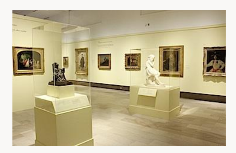
Fig. 13, "Mothers, Daughters and Sisters": In left case: Bessie Potter Vonnoh, Enthroned , 1902; cast 1906. Bronze. Colby College Museum of Art, Waterville. To the right: "Dressing Up ~ Undressing" and "Tomboys and Mischievous Little Girls" sections. [return to text]