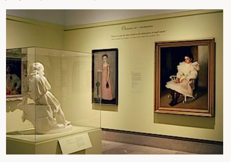
Fig. 16, "Dressing Up ~ Undressing": On the right: Frank Weston Benson, Gertrude , 1899. Oil on canvas. Museum of Fine Arts, Boston. [return to text]