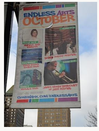
Fig. 2, Abbott Handerson Thayer, Angel, 1887. Fig. 3, Banner advertising the exhibition, with detail of Angel (see fig. 2).