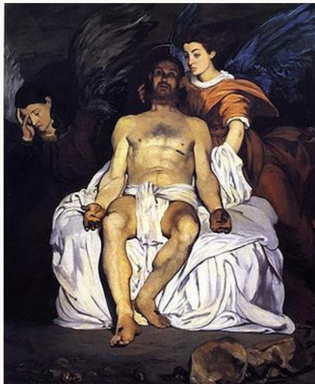
Fig. 8, Manet, The Dead Christ with Angels , 1864. Oil on canvas. The Metropolitan Museum of Art, New York. [return to text]