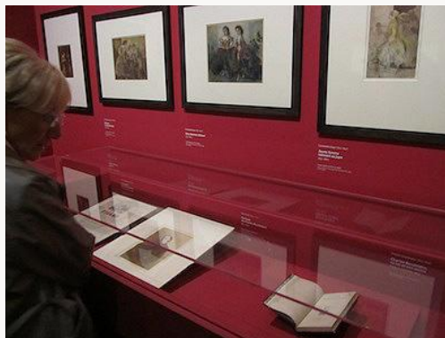
Fig. 3, View of installation of “The Baudelaire Moment,” with (top center) Constantin Guys, Two Women Standing , 1850-60. Pencil, pen and ink on paper. Musée d’Orsay, Paris. [larger image]

Section two, “The Baudelaire Moment,” grouped some of Manet’s first large-scale and perhaps most infamous paintings like Olympia (1863), The Déjeuner sur l’herbe (1862–63), Lola de Valence (1862–63) and The Street Singer (ca. 1862) with smaller works made in Baudelaire’s orbit (figs. 3–5). The show’s compare-and-contrast mode with other artists continued, including a large Portrait of Charles Baudelaire by Émile Deroy (1844) and several watercolors by Constantin Guys.