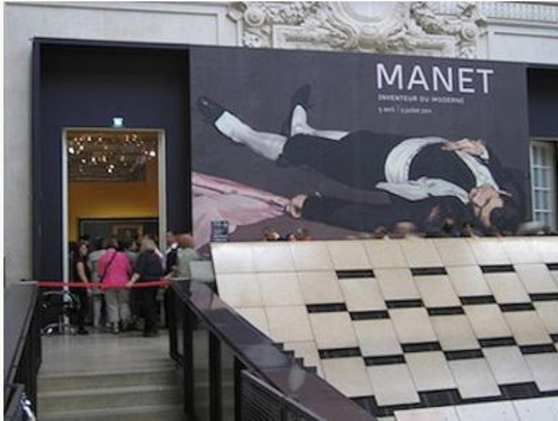
Fig. 1, View of exhibition entrance with poster showing Édouard Manet, The Dead Torero , 1864-65. Oil on canvas. National Gallery of Art, Washington, D. C. [return to text]