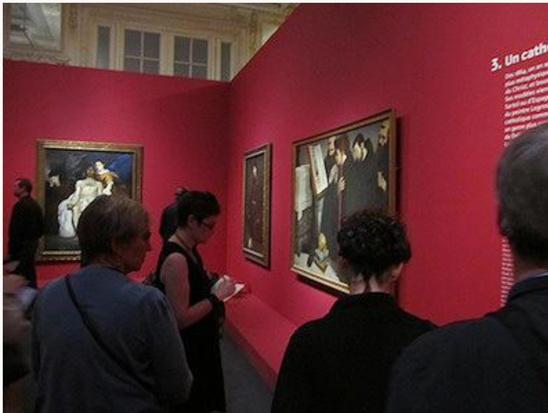
Fig. 6, View of installation of “A Suspicious Catholicism,” with (from right to left) Alphonse Legros, The Calling of St. Francis , 1861. Oil on canvas, Musée des Beaux-Arts et de la Dentelle, Alençon; Manet, A Monk at Prayer , 1865. Oil on canvas, Museum of Fine Arts, Boston; and Manet, The Dead Christ with Angels , 1864. Oil on canvas, The Metropolitan Museum of Art, New York. [return to text]