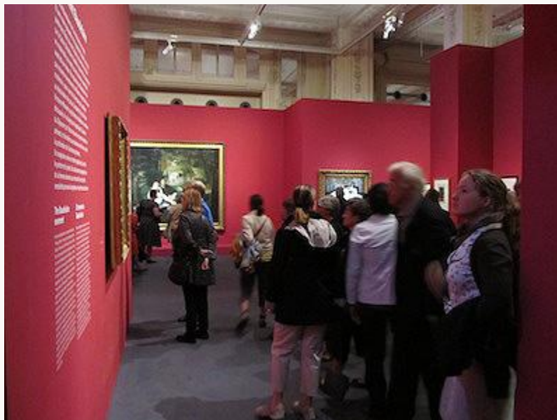
Fig. 4, View of installation of “The Baudelaire Moment,” with Manet, Le Déjeuner sur l’herbe , 1862-63. Oil on canvas. Musée d’Orsay, Paris; and Manet, Baudelaire’s Mistress, Reclining , 1862. Oil on canvas. Szépművészeti Múzeum, Budapest, in the background. [return to text]