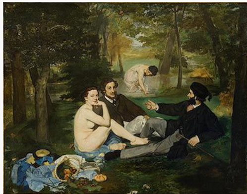
Fig. 5, Manet, Le Déjeuner sur l’herbe , 1862–63. Oil on canvas. Musée d’Orsay, Paris. [larger image]

Section three covered most of Manet’s large-scale 1860s religious paintings, hung together in this format, I imagine, for the first time. Entitled “A Suspicious Catholicism,” it included Alphonse Legros’s The Calling of St. Francis of 1861 as a benchmark by which religious and modern experience could find common form (figs. 6–8). “From the Prado to the Place de l’Alma,” the subsequent section, chronicled the paintings Manet made after his 1865 trip to Spain, concluding with his infamous 1867 one-person show opposite the International Exposition: it included paintings like The Fifer (1866) and The Dead Torero (1864–65). The next section, gathered in the exhibition’s most spacious room, was devoted to one of Manet’s favorite models, Berthe Morisot. The Balcony of 1868–69, in which she is seen sitting pensively leaning over a green metal railing, occupied the central wall, allowing visitors the most expansive view onto any painting in the show. Several details of The Balcony also open the exhibition catalogue; with its portrayal of a much quieter and less provocative modernity than the naked Victorine Meurent in Olympia or the Déjeuner —a modernity of fashionability and self-display without sex and prostitution— The Balcony became the exhibition’s key to the new meanings of “the Modern” (fig. 9).