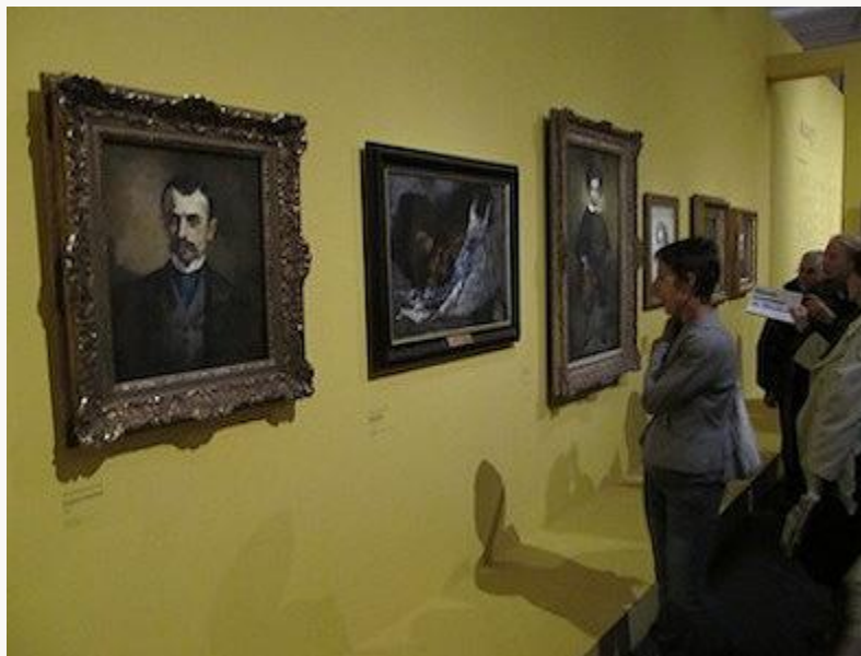
Fig. 2, View of installation of “Couture’s Choices,” with (from left to right) Manet, Portrait of a Man (Paul Roudier?) , 1860. Oil on canvas. Kröller-Müller Museum, Otterlo; Thomas Couture, Full-Length Study of Mme Bruat , ca. 1856. Oil on canvas. Musée National du Château de Compiègne; and Manet, The Lange Boy , 1861. Oil on canvas. Staatliche Kunsthalle, Karlsruhe. [return to text]