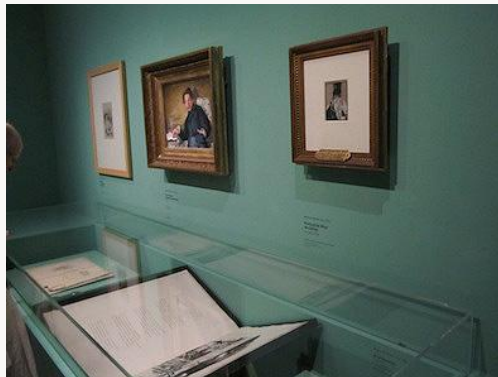
Fig. 10, View of installation of “Impressionism Caught in a Trap,” with (top center) Manet, Portrait of Stéphane Mallarmé , 1876. Oil on canvas. Musée d'Orsay, Paris. [larger image]

Section six, “Impressionism Caught in a Trap,” was stretched out over several smaller rooms and corridors along the left side of the exhibition space and was perhaps the most dispersed group of works. It dealt with Manet’s fraught relation to Impressionism, with his adoption of the style and simultaneous rejection of its new counter-establishment venues. The famous portraits of Nina de Callias (1873–74) and Stéphane Mallarmé (1876) were joined here by several 1860s and 1870s beach, harbor, and river bank scenes (fig. 10). The following section seven, “The Turning Point of 1879,” considered the consequences for Manet’s practice—in formal, iconographic and institutional terms—of the rise of opportunist republicanism in the late 1870s. Chez le père Lathuille of 1879 was the central painting of this section, but it included as well some of Manet’s late paintings and pastels of fashionable Parisian women such as The Amazon (Summer) of 1882—the painting that was, quite surprisingly, used on the cover of the catalogue (figs. 11 and 12).