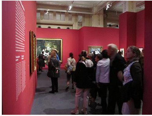
Fig. 4, View of installation of “The Baudelaire Moment,” with Manet, Le Déjeuner sur l’herbe , 1862–63. Oil on canvas. Musée d’Orsay, Paris; and Manet, Baudelaire’s Mistress, Reclining , 1862. Oil on canvas. Szépművészeti Múzeum, Budapest, in the background. [larger image]