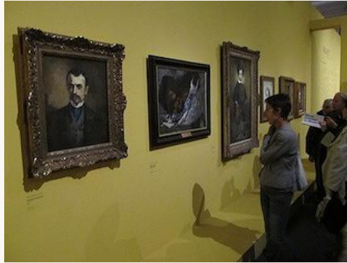
Fig. 2, View of installation of “Couture’s Choices,” with (from left to right) Manet, Portrait of a Man (Paul Roudier?) , 1860. Oil on canvas. Kröller-Müller Museum, Otterlo; Thomas Couture, Full-Length Study of Mme Bruat , ca. 1856. Oil on canvas. Musée National du Château de Compiègne; and Manet, The Lange Boy , 1861. Oil on canvas. Staatliche Kunsthalle, Karlsruhe. [larger image]

Section two, “The Baudelaire Moment,” grouped some of Manet’s first large-scale and perhaps most infamous paintings like Olympia (1863), The Déjeuner sur l’herbe (1862–63), Lola de Valence (1862–63) and The Street Singer (ca. 1862) with smaller works made in Baudelaire’s orbit (figs. 3–5). The show’s compare-and-contrast mode with other artists continued, including a large Portrait of Charles Baudelaire by Émile Deroy (1844) and several watercolors by Constantin Guys.