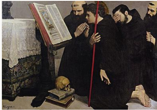
Fig. 7, Alphonse Legros, The Calling of St. Francis , 1861. Oil on canvas. Musée des Beaux-Arts et de la Dentelle, Alençon. [larger image]