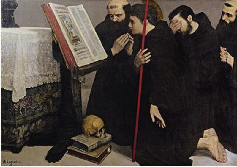
Fig. 7, Alphonse Legros, The Calling of St. Francis , 1861. Oil on canvas. Musée des Beaux-Arts et de la Dentelle, Alençon. [return to text]