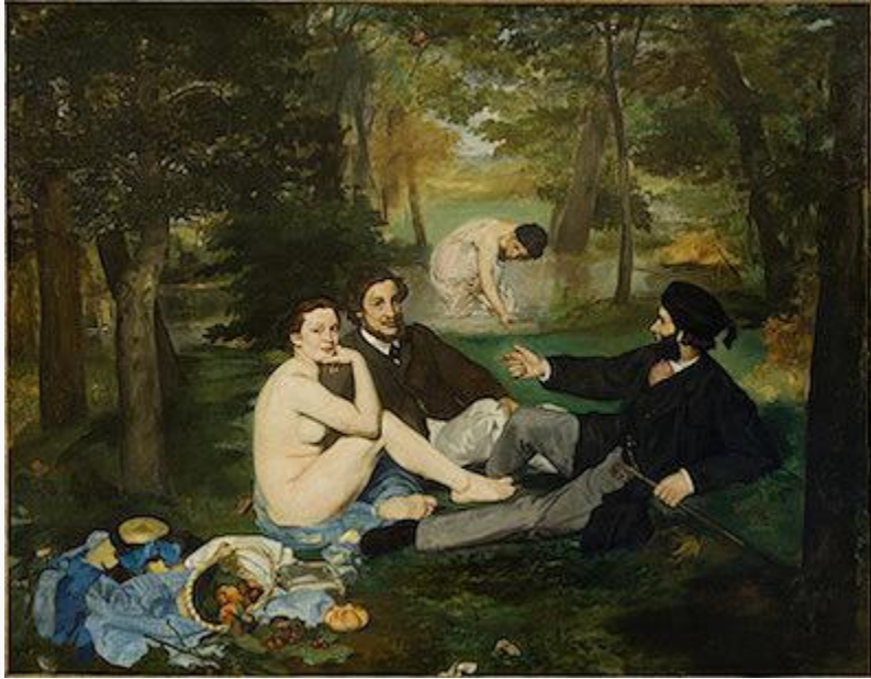
Fig. 5, Manet, Le Déjeuner sur l'herbe , 1862-63. Oil on canvas. Musée d'Orsay, Paris. [return to text]