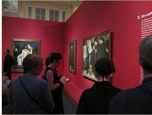
Fig. 6, View of installation of “A Suspicious Catholicism,” with (from right to left) Alphonse Legros, The Calling of St. Francis , 1861. Oil on canvas, Musée des Beaux-Arts et de la Dentelle, Alençon; Manet, A Monk at Prayer , 1865. Oil on canvas, Museum of Fine Arts, Boston; and Manet, The Dead Christ with Angels , 1864. Oil on canvas, The Metropolitan Museum of Art, New York. [larger image]