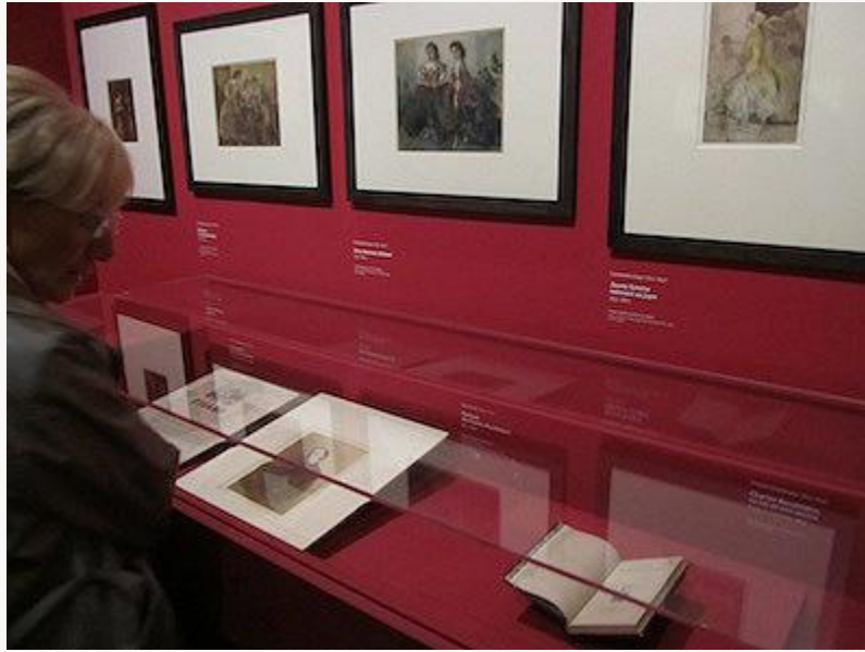
Fig. 3, View of installation of “The Baudelaire Moment,” with (top center) Constantin Guys, Two Women Standing , 1850-60. Pencil, pen and ink on paper. Musée d’Orsay, Paris. [return to text]