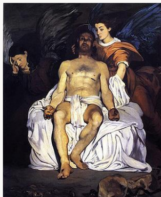
Fig. 8, Manet, The Dead Christ with Angels , 1864. Oil on canvas. The Metropolitan Museum of Art, New York. Photograph: Wikimedia Commons. [larger image]