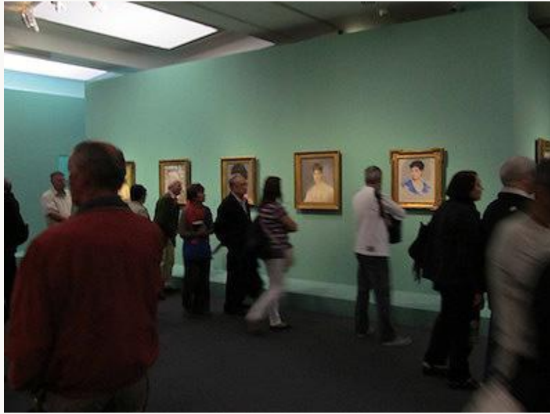
Fig. 11, View of installation of “The Turning Point of 1879,” with (from right to left) Manet, Portrait of Mme Émile Zola , 1879. Pastel on canvas. Musée d’Orsay; and Manet, Young Blonde Woman with Blue Eyes , 1878. Pastel on board. Musée d’Orsay. [return to text]