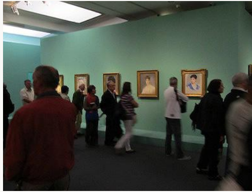
Fig. 11, View of installation of “The Turning Point of 1879,” with (from right to left) Manet, Portrait of Mme Émile Zola, 1879. Pastel on canvas. Musée d’Orsay; and Manet, Young Blonde Woman with Blue Eyes, 1878. Pastel on board. Musée d’Orsay. [larger image]