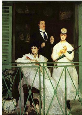
Fig. 9, Manet, The Balcony , 1868-69. Oil on canvas. Musée d'Orsay, Paris. [larger image]

Section six, “Impressionism Caught in a Trap,” was stretched out over several smaller rooms and corridors along the left side of the exhibition space and was perhaps the most dispersed group of works. It dealt with Manet’s fraught relation to Impressionism, with his adoption of the style and simultaneous rejection of its new counter-establishment venues. The famous portraits of Nina de Callias (1873–74) and Stéphane Mallarmé (1876) were joined here by several 1860s and 1870s beach, harbor, and river bank scenes (fig. 10). The following section seven, “The Turning Point of 1879,” considered the consequences for Manet’s practice—in formal, iconographic and institutional terms—of the rise of opportunist republicanism in the late 1870s. Chez le père Lathuille of 1879 was the central painting of this section, but it included as well some of Manet’s late paintings and pastels of fashionable Parisian women such as The Amazon (Summer) of 1882—the painting that was, quite surprisingly, used on the cover of the catalogue (figs. 11 and 12).