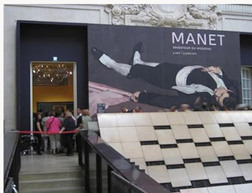
Fig. 1, View of exhibition entrance with poster showing Édouard Manet, The Dead Torero , 1864-65. Oil on canvas. National Gallery of Art, Washington, D. C. [larger image]

Once you actually managed to stand in front of most of the Manet paintings gathered at the Orsay this summer, the rewards were endless (fig. 1). [1] In painting after painting, you were reminded what made him one of the nineteenth century's most gifted and nuanced artists. The bravura with which he applied paint lends his world an elegant ease that emerges less as reality than as fraught dream and wish. The unusually stark contrasts in light and dark color he employed to destroy centuries' old rules of academic decorum morph into social distinctions as much as aesthetic ones (struggles over visibility and invisibility, identity and non-identity, subjectivity and objectivity, order and disorder, hierarchy and chaos). Ordinary things and everyday scenes parade before us as poignant reminders—distillations—of a world of eroding distinctions, such that politics and fashion speak the same dialect. Here, abbreviation connotes informality, but also a generalized loss of meaning. Everywhere, there is the wondrous, and endlessly complex, world of modern Paris that fascinated Manet, and he remains one of our sharpest translators of nineteenth-century modern life into early modernist form.