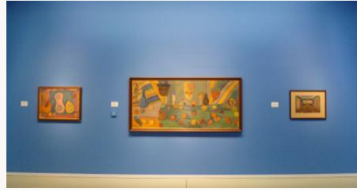
Fig. 29, Installation view of room featuring Martiros Sarian, in the center Large Oriental Still-Life , 1915.