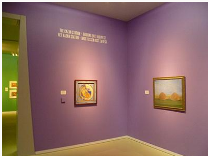
Fig. 25, Installation view of room featuring (on left) the Kazan Station. Zinaida Serebriakova's sketch Turkey , 1916. [return to text]