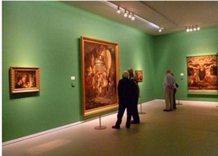
Fig. 11, Installation view of “Allegories—Confronting the Past”. [return to text]