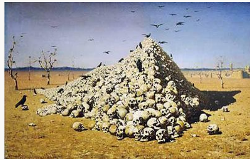
Fig. 16, Vasily Vereshchagin, Apotheosis of War , 1871.