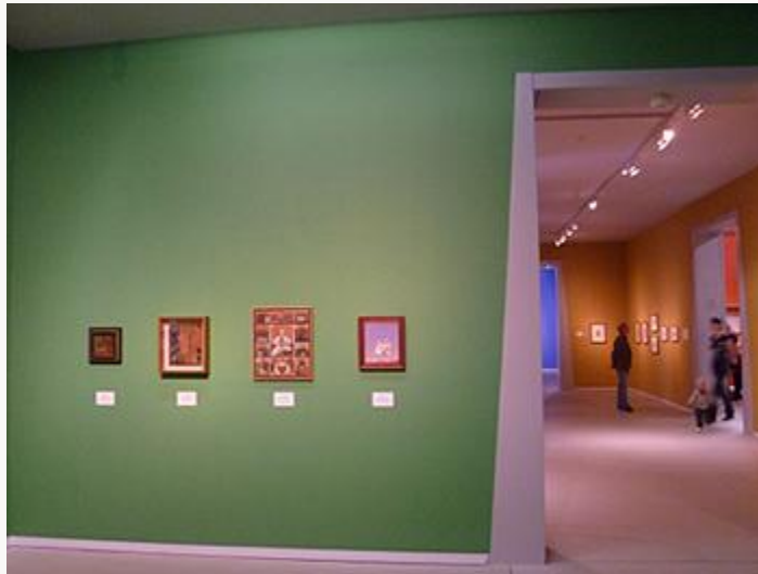
Fig. 23, Detail of “A View from Within”. [return to text]