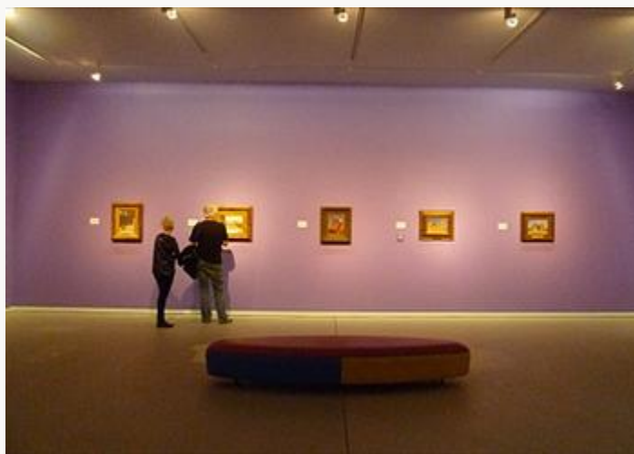
Fig. 13, Installation view of first room featuring Vasily Vereshchagin. [return to text]