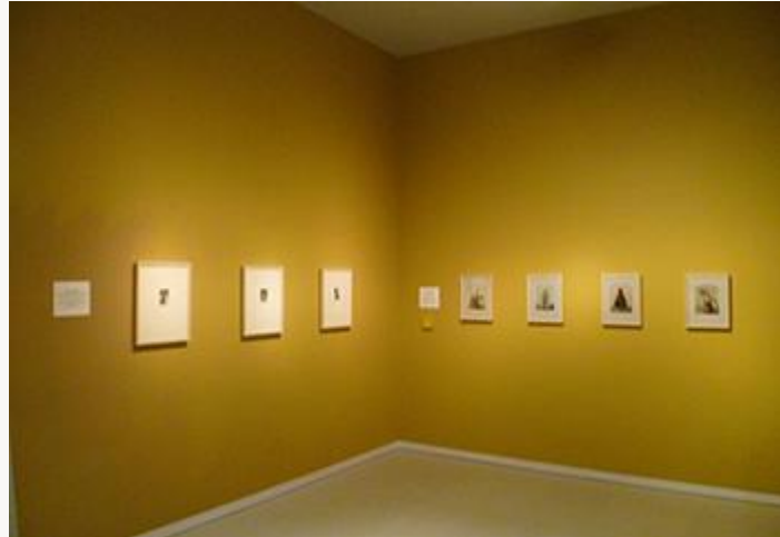
Fig. 21, Installation view of the room "Early Orientalist Photography", with photographs to the left and drawings to the right. [return to text]