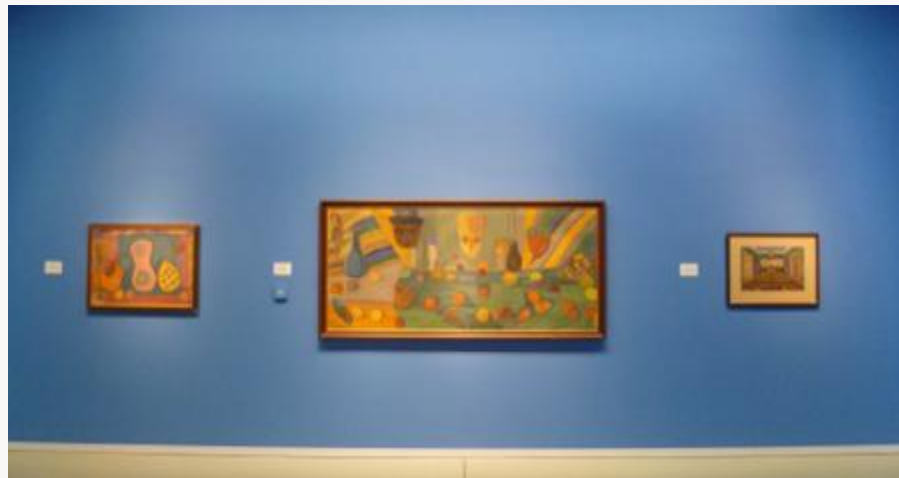
Fig. 29, Installation view of room featuring Martiros Sarian, in the center Large Oriental Still-Life , 1915. Tempera on canvas. [return to text]