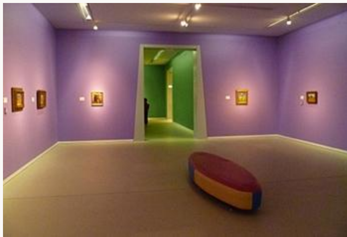
Fig. 12, Installation view of first room featuring Vasily Vereshchagin. [return to text]