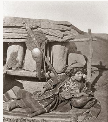
Fig. 20, Dmitry Yermakov, Young Tushian Woman, Caucasus , late nineteenth century. [view image & full caption]