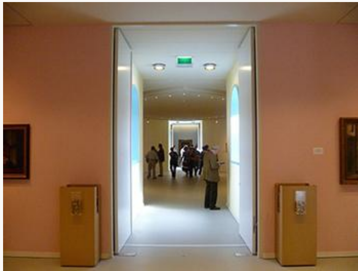
Fig. 4, Installation view of entrance hall with the paintings at both sides of the door. [return to text]