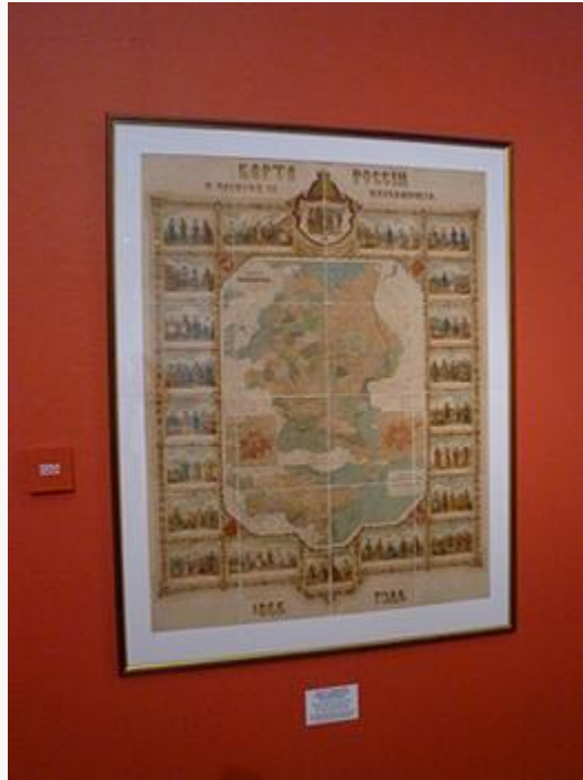
Fig. 9, Room 2 with Nestor Alexandrovich Terebenev, Map of Russia and the Tribes That Inhabit Her , 1866. Lithograph. [return to text]