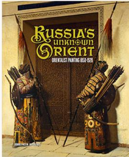
Fig. 30, The exhibition catalogue. Caption from the web shop at the Groninger Museum's website. [return to text]