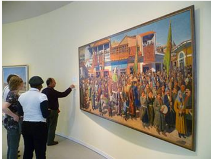
Fig. 7, Exhibition visitors collecting the data from Grigor Sharbabchian's Keinoba. Celebration of Quinquagesima in the Old Tiflis , undated. Oil on canvas. [return to text]