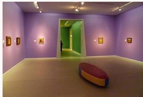
Fig. 12, Installation view of first room featuring Vasily Vereshchagin. [view image & full caption]