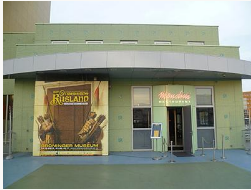
Fig. 1, Poster of the exhibition at the entrance of the Groninger Museum, Groningen, The Netherlands.