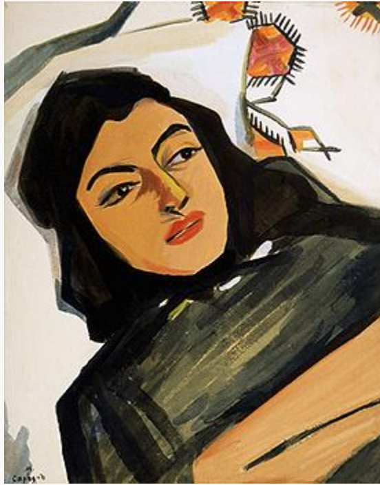
Fig. 3, Martiros Sergeyevich Saryan, Head of a Young Girl , 1912. Tempera on canvas. [return to text]