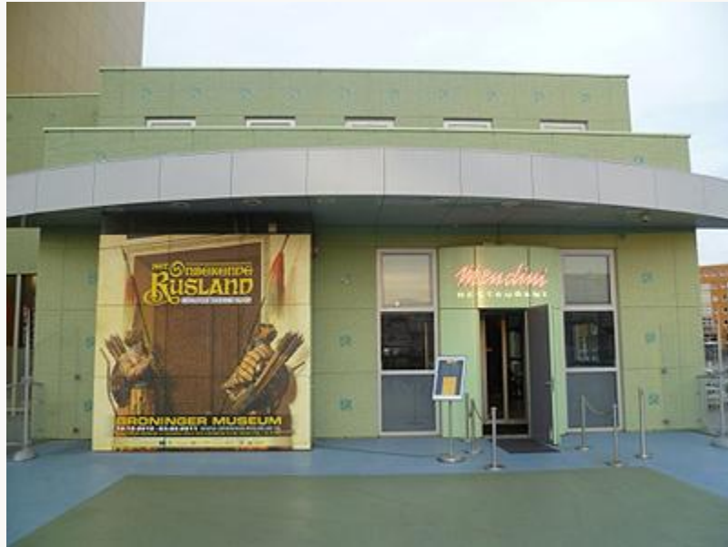
Fig. 1, Poster of the exhibition at the entrance of the Groninger Museum, Groningen, The Netherlands. [return to text]