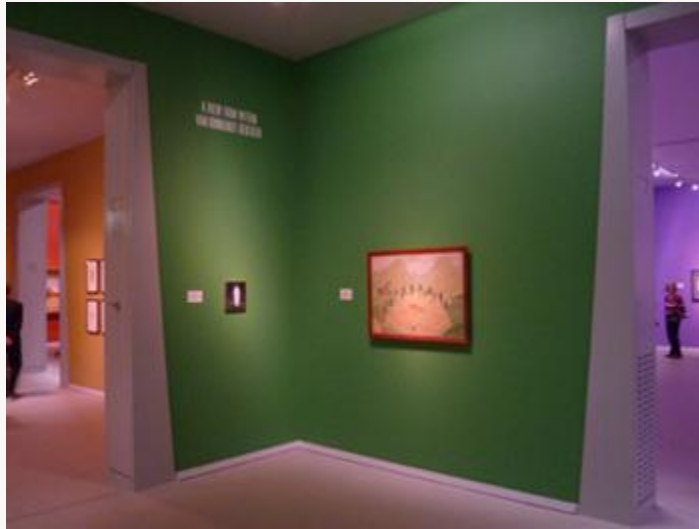
Fig. 22, Installation view of the room “A View from Within”. [return to text]