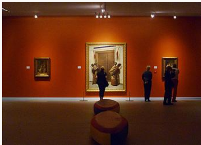
Fig. 15, Installation view of second room featuring Vasily Vereshchagin. [return to text]