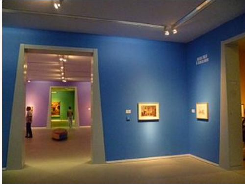
Fig. 17, Installation view of room of Biblical paintings, almost exclusively devoted to Vasily Polenov.