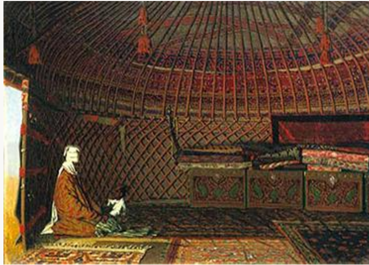
Fig. 14, Vasily Vereshchagin, Inside the Tent of a Rich Kirghiz , 1869–1870. Oil on canvas. [return to text]