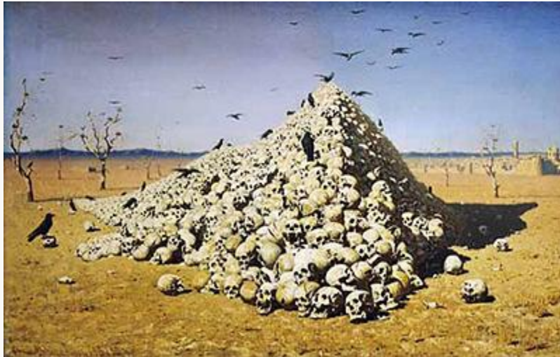
Fig. 16, Vasily Vereshchagin, Apotheosis of War , 1871. Oil on canvas.  [return to text]