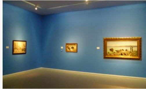
Fig. 18, Installation view of room of Biblical paintings with Vasily Polenov's masterpiece, On the Sea of Tiberias (Galilee) , 1888, at right.