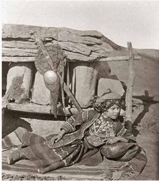
Fig. 20, Dmitry Yermakov, Young Tushian Woman, Caucasus , late nineteenth century. Albumin print. [return to text]