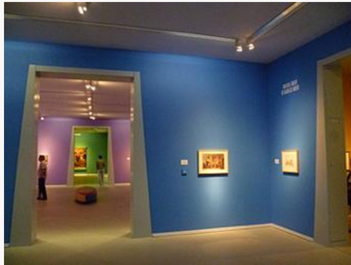
Fig. 17, Installation view of room of Biblical paintings, almost exclusively devoted to Vasily Polenov. [return to text]