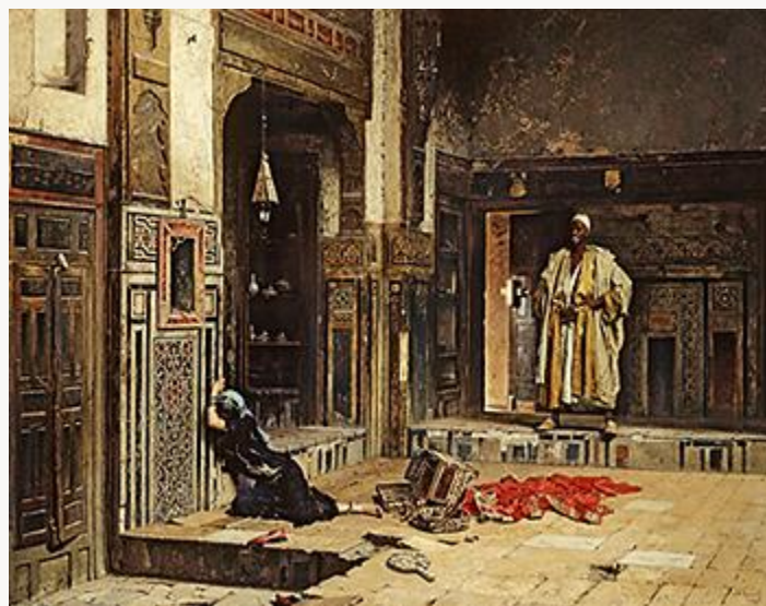
Fig. 2, Aleksander Nikolaevich Russov, Bought for the Harem , 1891. Oil on canvas. [return to text]