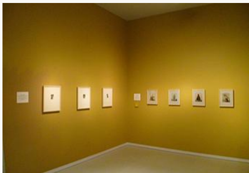
Fig. 21, Installation view of the room “Early Orientalist Photography”, with photographs to the left and drawings to the right. [view image & full caption]

It was the documentary precision, artistic expression and information-rich nature of these photographs that defined this highly informed perception of vibrant and diverse cultures and traditions, a worldview in which Muslim and Christian societies lived in harmony side by side (64, 66).