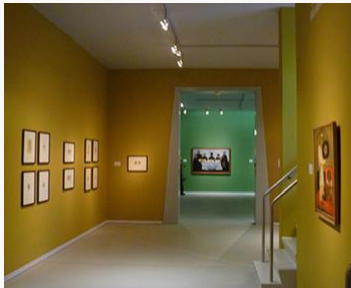
Fig. 19, Installation view of the room “Early Orientalist Photography”. [return to text]