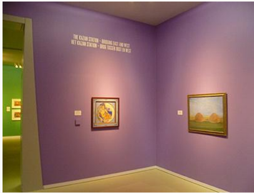
Fig. 25, Installation view of room featuring (on left) the Kazan Station.

to the animals and harvest), both lands are represented by a young woman richly dressed and in a similar self-assuring bodily attitude, thus positioning the two cultures at the very same level.