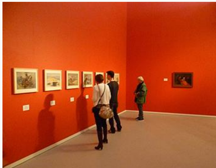
Fig. 10, Room 2 with Nikolai Karazin, Series of The Trans-Caspian Railway , 1888. Watercolor. [return to text]