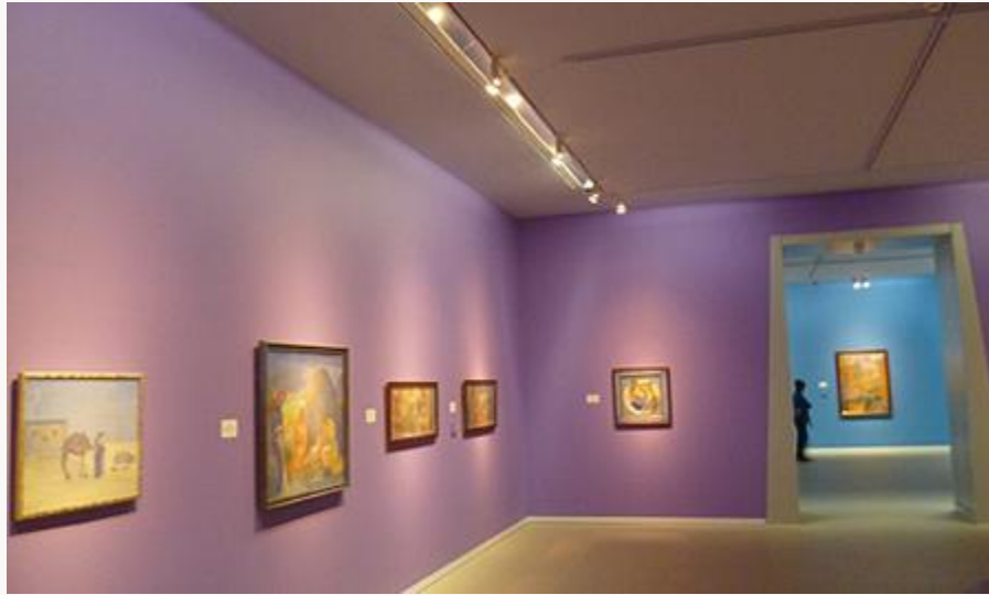
Fig. 26, Installation view of room featuring (on background wall) the Kazan Station. Zinaida Serebriakova's sketch Japan (Harem Slave) , 1916. [return to text]