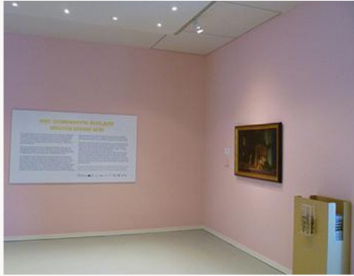
Fig. 5, Installation view of entrance hall with wall text.