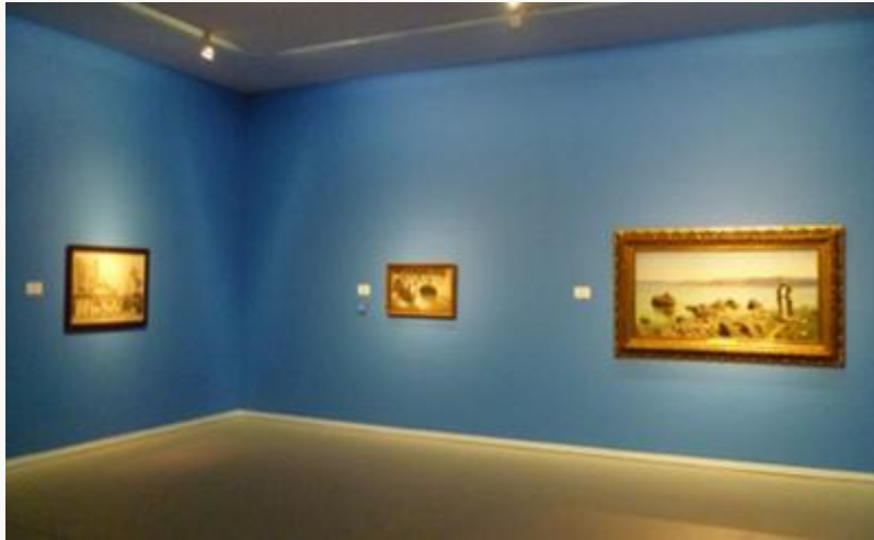
Fig. 18, Installation view of room of Biblical paintings with Vasily Polenov's masterpiece, On the Sea of Tiberias (Galilee) , 1888, at right. Oil on canvas. [return to text]