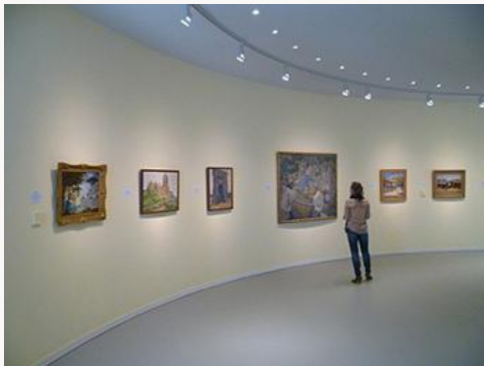
Fig. 8, Room 1 with Andrei Roller's The Gardens of Chernomor in the foreground. [return to text]