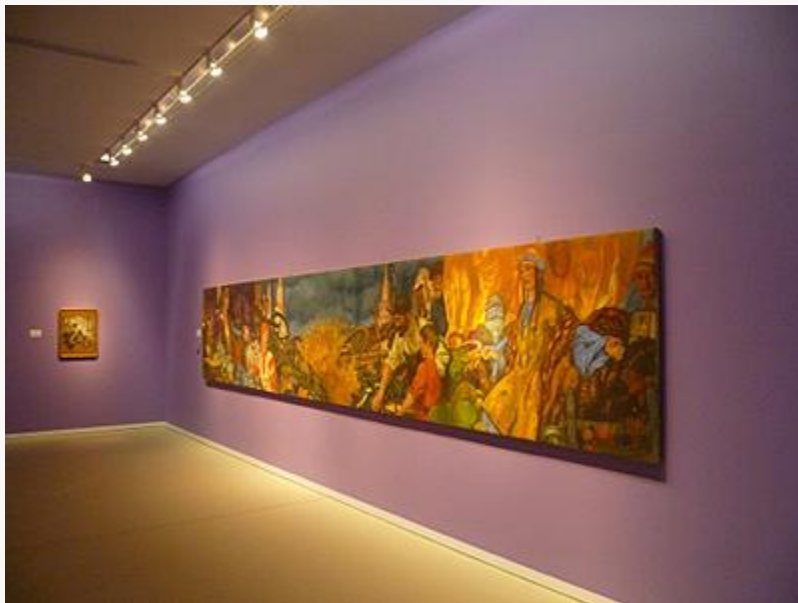
Fig. 27, Evgeny Lanseray, The Peoples of Russia , 1916–17. Tempera on canvas. [return to text]