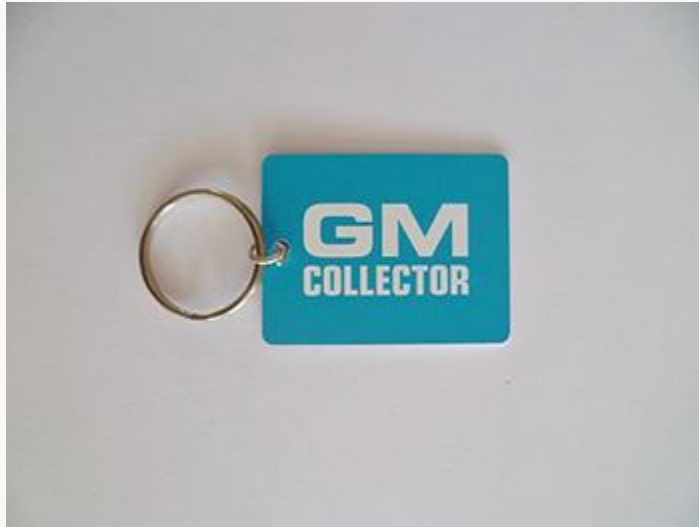
Fig. 6, The GM Collector. [return to text]