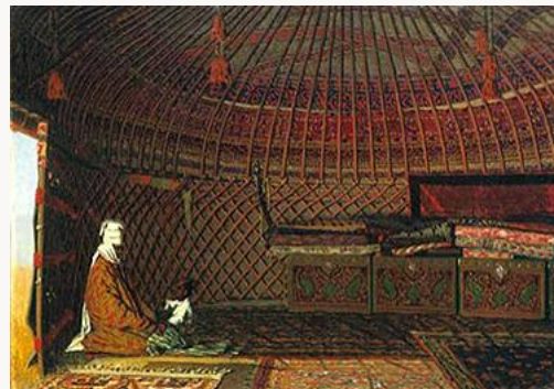
Fig. 14, Vasily Vereshchagin, Inside the Tent of a Rich Kirghiz , 1869–1870. [view image & full caption]

"Vereshchagin—A Window to the Orient" was the core section of the exhibition. This room displayed Vereshchagin's pacifist legacy with a whole series of paintings showing the horrors of war. This body of work hung in a dark room with red-painted walls that invited the visitor to engage in the reflection Vereshchagin wanted to foster (fig. 15). The artist believed in the power of art to move consciousness and change the world, and with this idea he created the Poèmes Barbares series. This series consisting of seven large canvases which were intended "...to