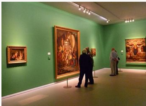
Fig. 11, Installation view of "Allegories—Confronting the Past". [view image & full caption]

Catherine the Great making a tour on a horse-car preceded by the angels, Ivan III tearing up the Khan's Charter, or even Prince Mikhail Chernigovsky's role at the grand machine painted by Vasily Smirnov (1858–1890) followed the Western canon of history painting (fig. 11). This green space led to a greater room that represented the Russian orientalist hero Vasily Vereshchagin's work in full bloom (figs. 12 and 13). This section, "Vereshchagin—The Painted Voyage", consisted of a long rectangular space with lavender-toned walls. The painter joined the Russian army during its conquest of Central Asia between 1867 and 1869 and recorded the exotic wonders he found on the way, like Samarkand, where he fought and was injured, and for which he received the fourth class Saint Joris-Cross.[3] The Kirghiz people appeared well represented in this room too, with depictions of their daily life at the camps (fig. 14). This last group of paintings were shown in London (1873) and Moscow (1874) at the artist's solo exhibition devoted to the Turkestan.