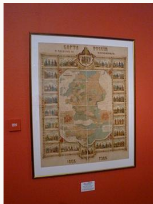
Fig. 9, Room 2 with Nestor Alexandrovich Terebenev, Map of Russia and the Tribes That Inhabit Her , 1866.

The second room was devoted to the geographic research conducted on the neighboring lands. This section was called “Expeditions—Constructing the Future” and the red color on the walls made the maps and drawings stand out magnificently. The earlier maps on display showed scientific and military interests with very precise political and geological borders (late eighteenth century to mid-nineteenth century). A map made in 1866, however, displayed ethnographic curiosity as well; the Map of Russia and the Tribes That Inhabit Her represented twenty-one “tribes” in little drawings around the great map in the center (fig. 9). This piece highlighted the ethnographic diversity of Russia while it stressed its imperial power in diverse and far away provinces. The rest of the works in the room consisted of a series of watercolors from Nikolai Karazin (1842–1908) for the Trans-Caspian Railway (fig. 10). As the exhibition booklet stated, the series showed the exotic new areas of the Russian empire that the railway company managed to connect in the 1880s. [2] If the military first used the railway, industrial and commercial interests in it quickly followed and thus provided the watercolors with a clear advertising character.