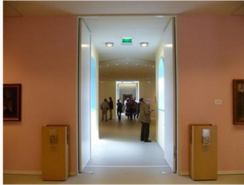
Fig. 4, Installation view of entrance hall with the paintings at both sides of the door.

attitude of crying while an unscrupulous dark-skinned man grinned at her in an arrogant way. The next painting, Stanislaw Chlebovski's (1835–1884) Drama in a Harem , rendered a pale-skinned woman sleeping in a richly decorated bed while several men walk silently in the room; the attitude of the dark-skinned man who approaches on tiptoe, in combination with the painting's title, made viewers think the worst. Symptomatically, this sort of painting did not appear again in the exhibition. Was the presence of such stereotypical themes of the “other” a must for the visitor to feel at home when thinking about orientalist painting? Or was it an appeal against clichéd images? In any case, they remained at the entrance hall, thus not mixing with the rest of the art works and being distanced from Russian Orientalism.