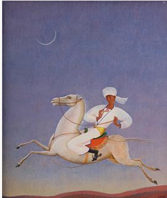
Fig. 24, Alexander Nikolaev, The Bridegroom , 1920. Tempera on paper. © State Museum of Oriental Art, Moscow. Groninger Museum, Groningen, The Netherlands. [return to text]