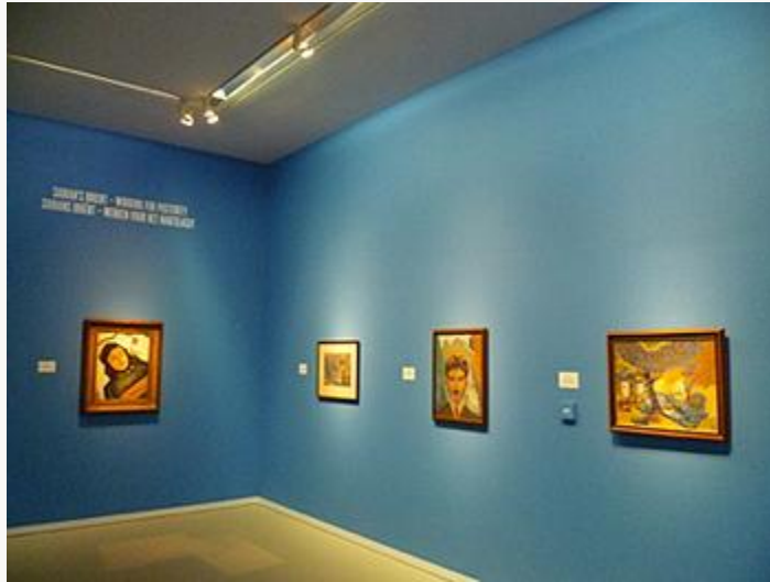
Fig. 28, Installation view of room featuring Martiros Sarian. [return to text]