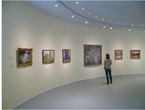
Fig. 8, Room 1 with Andrei Roller's The Gardens of Chernomor in the foreground.