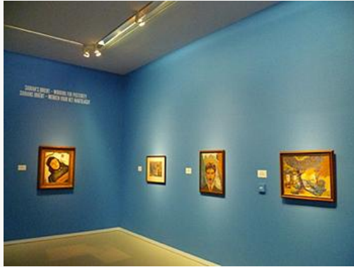
Fig. 28, Installation view of room featuring Martiros Sarian.