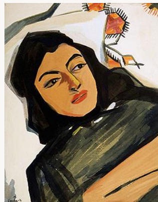
Fig. 3, Martiros Sergeyevich Saryan, Head of a Young Girl , 1912.