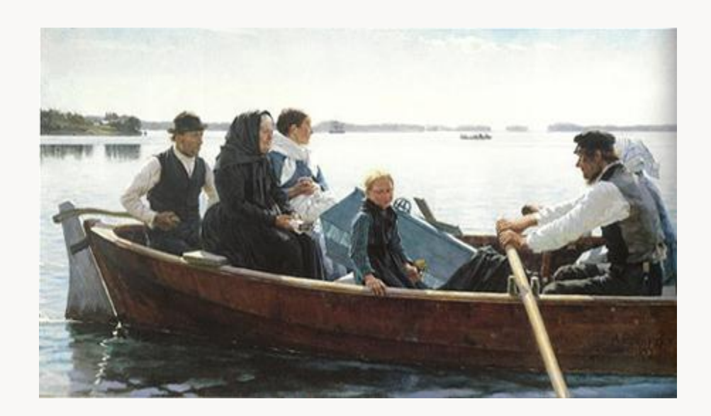
Fig. 10, Albert Edelfelt, Conveying the Child's Coffin , 1879. Oil on canvas. Ateneum Art Museum, Finnish National Gallery, Helsinki. [return to text]