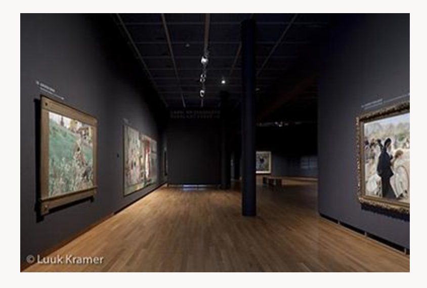
Fig. 9, Installation view showing juxtaposition of Zorn's The Mora Fair , Pelez's Grimaces and Misery (both left wall), and Edelfelt's The Luxembourg Gardens , Paris, at the exhibition Illusions of Reality . [return to text]