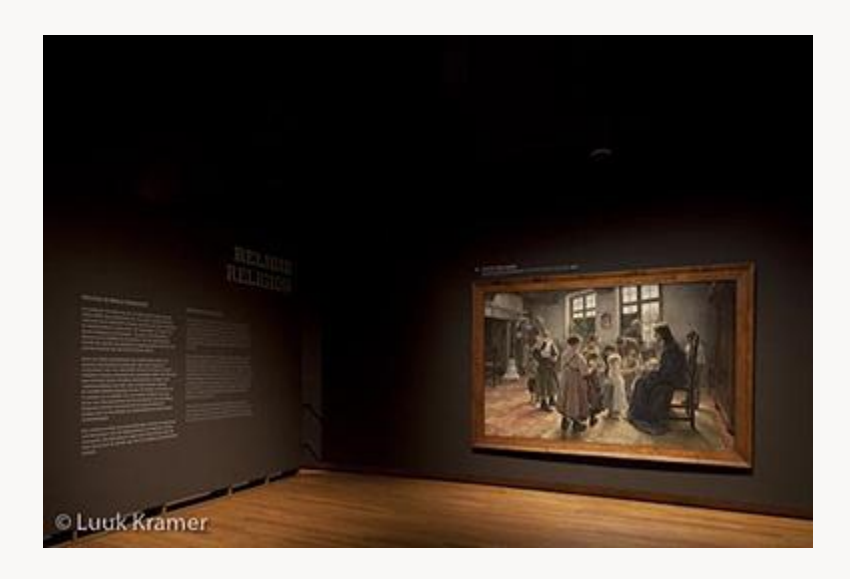
Fig. 20, Installation view showing Fritz von Uhde's Let the Little Children Come to Me , 1884. [return to text]