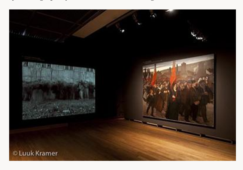
Fig. 17, Installation view showing Capellani's Germinal and Adler's The Strike at Le Creusot . [return to text]