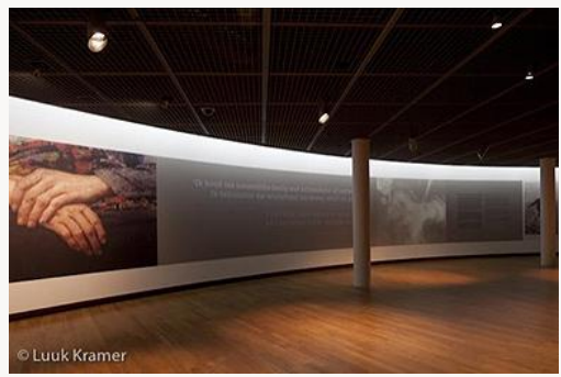
Fig. 2, Installation view of the entrance to the exhibition Illusions of Reality . [view image & full caption]