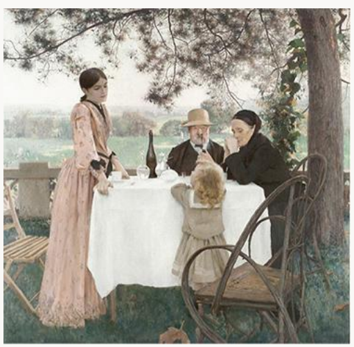
Fig. 3, Jules-Alexis Muenier, Beautiful Days , 1889.