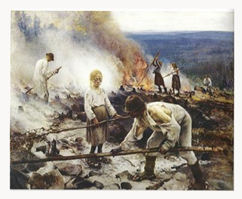
Fig. 11, Eero Järenfelt, Under the Yoke (Burning the Brushwood) , 1893. Oil on canvas. Ateneum Art Museum, Finnish National Gallery, Helsinki. [return to text]