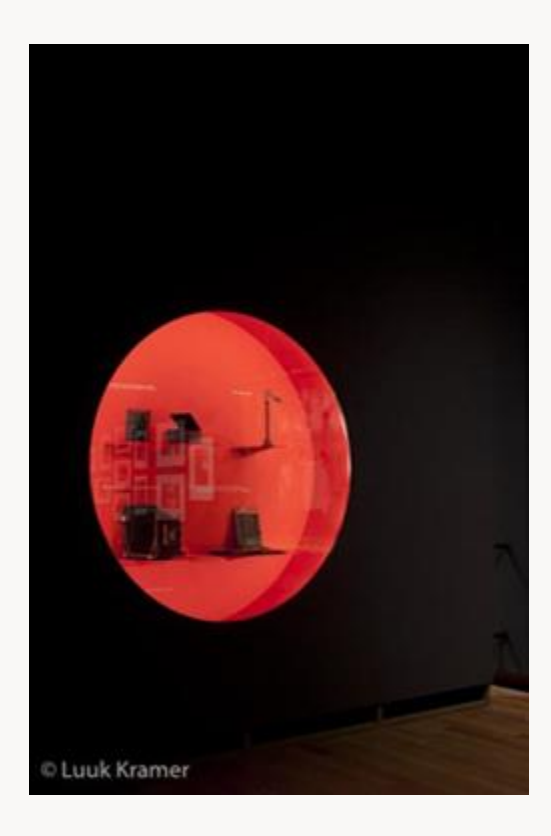
Fig. 5, Camera, camera lucida, Thornton-Pickard camera harmonica and chassis for glass negatives owned by Jules-Alexis Muenier, shown as installed at the exhibition Illusions of Reality . [return to text]