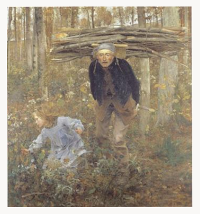
Fig. 6, Jules-Bastien Lepage, The Wood Gatherer , 1881.

exhibits all of the refinements of the better-known painting. The message of The Wood Gatherer is actually more universal: while youth picks flowers, old age continues to bear a heavy burden, here shown as a large bundle of kindling. An additional film clip of Antoine's La terre was shown directly on the exhibition wall right above Haymakers (1890) by the Hungarian artist István Csók (1865-1961). In both, and in Bastien-Lepage's Haymaking (1878, Musée d'Orsay, Paris), which was not in the exhibition but was reproduced in the small exhibition brochure provided to visitors for free at the start of the show, workers rest or sleep in a mound of hay (fig. 7). The theme continues in Homeless ( Sans asile , 1883), by Fernand Pelez (1843-1913), in which a small boy and some of his siblings sleep on the street with their heads resting on potato sacks or on the back of their mother. The suggestion that the earth is both the cradle and the grave of the worker abounds in Naturalist imagery, such as in these works and in others throughout the exhibition.