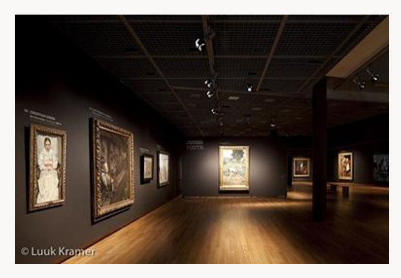
Fig. 13, Installation view showing first gallery on the second floor of the exhibition Illusions of Reality . [return to text]