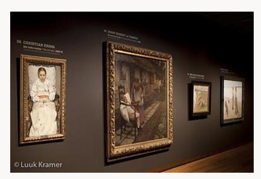
Fig. 14, Installation view showing Krohg's The Sick Girl and Henry Herbert La Thangue's The Man with the Scythe among other works.