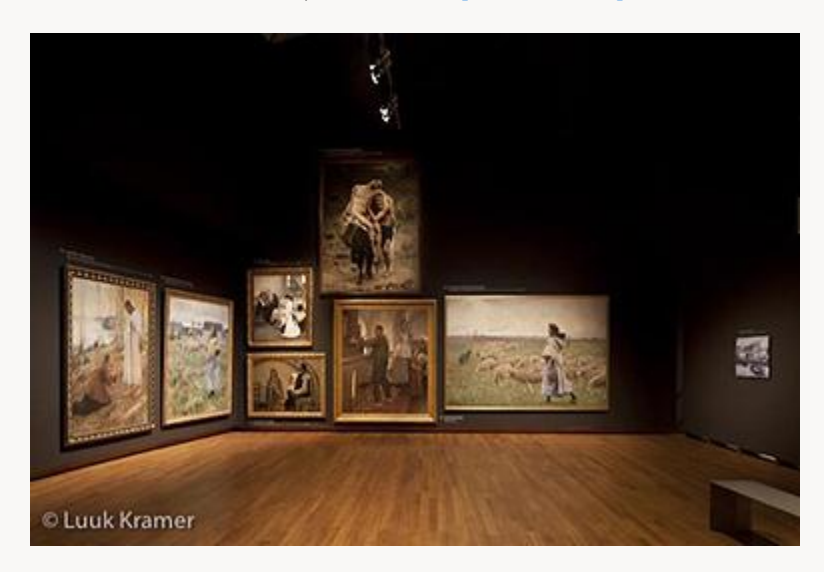
Fig. 19, Installation view of the section entitled "Representing Belief," at the exhibition Illusions of Reality . [return to text]