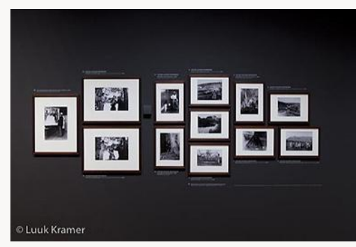
Fig. 4, Jules-Alexis Muenier, preparatory photographs for Beautiful Days , ca. 1889. [view image & full caption]