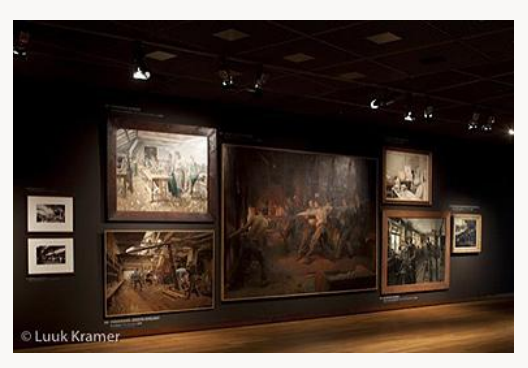
Fig. 16, Installation view of the section entitled "Industrialization Takes Command," at the exhibition Illusions of Reality . [view image & full caption]