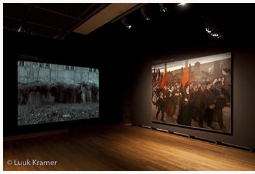
Fig. 17, Installation view showing Capellani's Germinal and Adler's The Strike at Le Creusot . [view image & full caption]