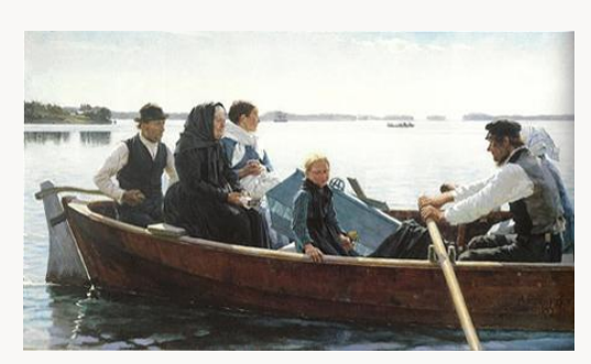
Fig. 10, Albert Edelfelt, Conveying the Child's Coffin, 1879.