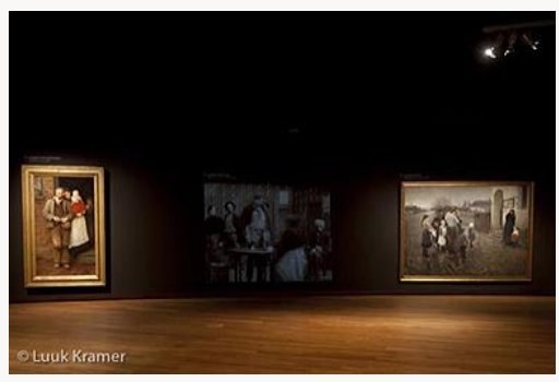
Fig. 18, Installation view showing (from left to right) Herkomer's On Strike , Capellani's Germinal and Pataky's The Interrogation , at the exhibition Illusions of Reality . [view image & full caption]