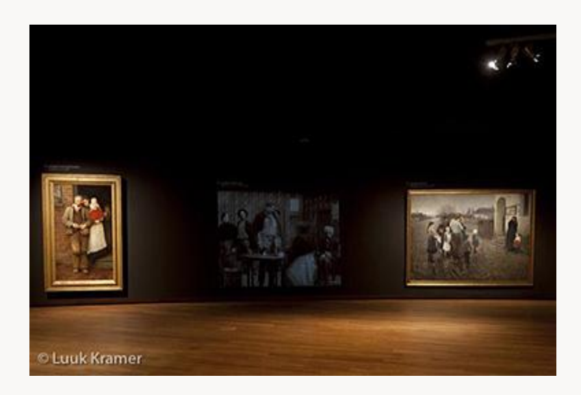
Fig. 18, Installation view showing (from left to right) Herkomer's On Strike , Capellani's Germinal and Pataky's The Interrogation , at the exhibition Illusions of Reality . [return to text]