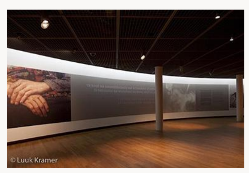
Fig. 2, Installation view of the entrance to the exhibition Illusions of Reality . [return to text]