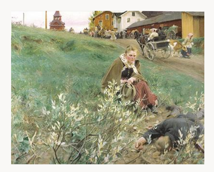
Fig. 8, Anders Zorn, The Mora Fair, 1892. Oil on canvas. Mora City Hall, Mora, Sweden. [return to text]