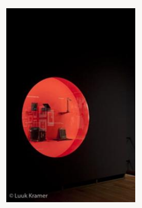
Fig. 5, Camera, camera lucida, Thornton-Pickard camera harmonica and chassis for glass negatives owned by Jules-Alexis Muenier, shown as installed at the exhibition Illusions of Reality .