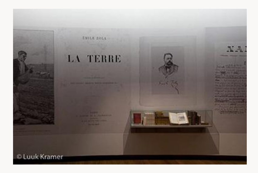
Fig. 1, Installation view of the Emile Zola display at the exhibition Illusions of Reality . [return to text]