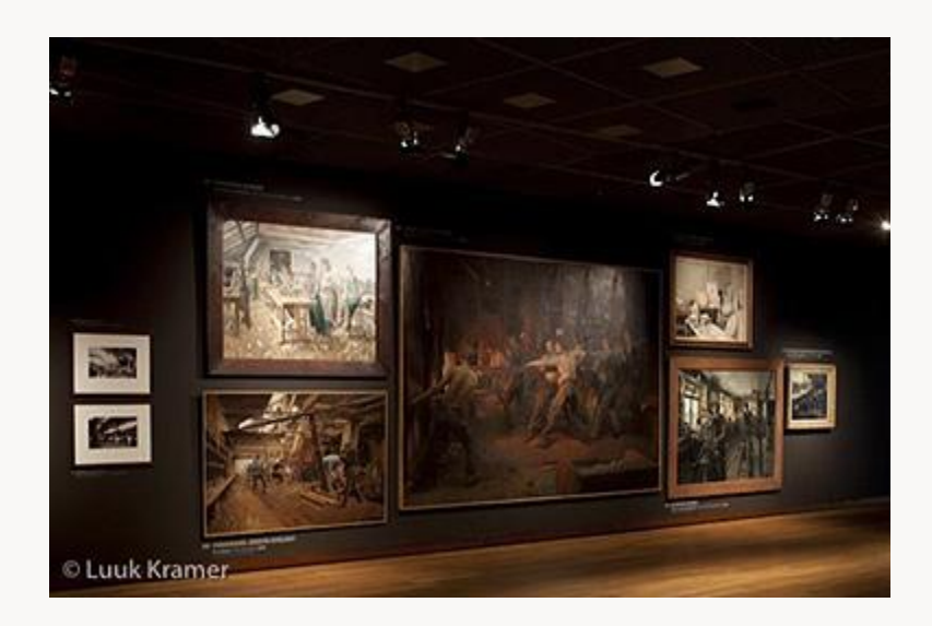
Fig. 16, Installation view of the section entitled "Industrialization Takes Command," at the exhibition Illusions of Reality . [return to text]