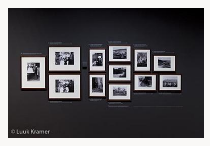
Fig. 4, Jules-Alexis Muenier, preparatory photographs for Beautiful Days , ca. 1889. Shown as installed at the exhibition Illusions of Reality . [return to text]