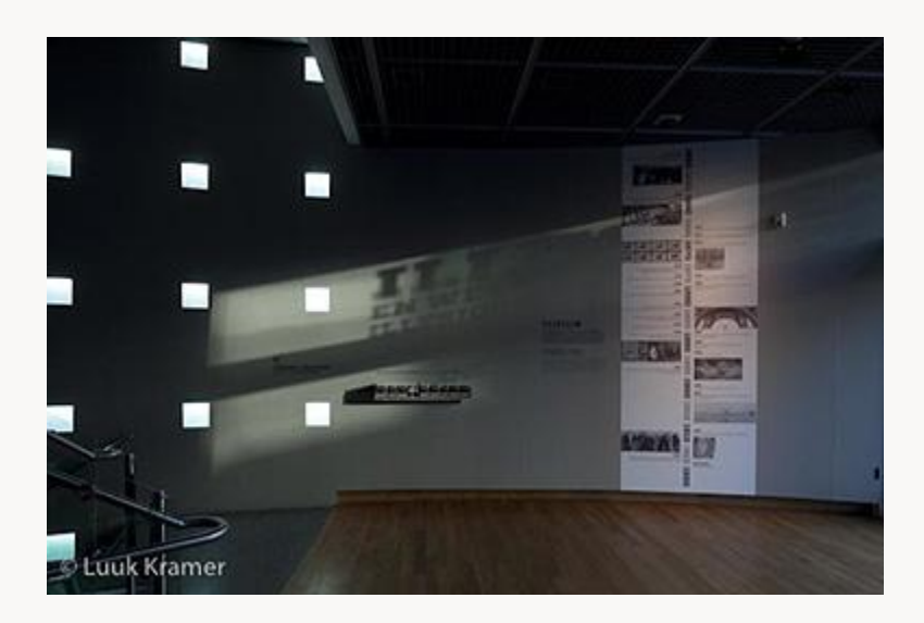
Fig. 12, Installation view showing timeline on the second floor of the exhibition Illusions of Reality . [return to text]