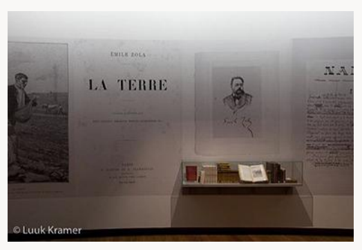
Fig. 1, Installation view of the Emile Zola display at the exhibition Illusions of Reality . [view image & full caption]