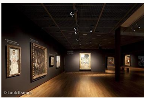
Fig. 13, Installation view showing first gallery on the second floor of the exhibition Illusions of Reality .