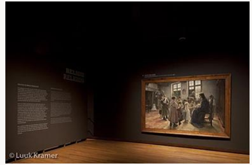
Fig. 20, Installation view showing Fritz von Uhde's Let the Little Children Come to Me , 1884. [view image & full caption]