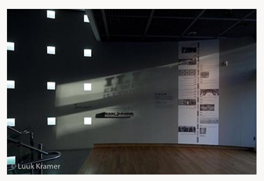
Fig. 12, Installation view showing timeline on the second floor of the exhibition Illusions of Reality .