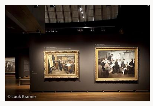
Fig. 15, Installation view showing Bettanier's The Geography Lesson: The Black Stain and Geoffroy's The Drawing Lesson in a Primary School.