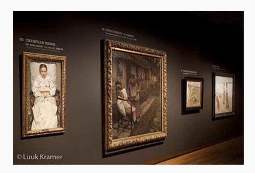
Fig. 14, Installation view showing Krohg's The Sick Girl and Henry Herbert La Thangue's The Man with the Scythe among other works. [return to text]