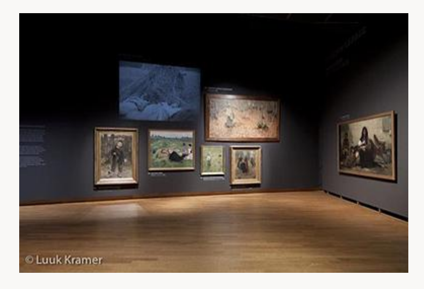
Fig. 7, Installation view of the section entitled "Jules Bastien Lepage and his Influence," at the exhibition Illusions of Reality . [return to text]