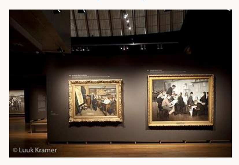
Fig. 15, Installation view showing Bettanier's The Geography Lesson: The Black Stain and Geoffroy's The Drawing Lesson in a Primary School. [return to text]