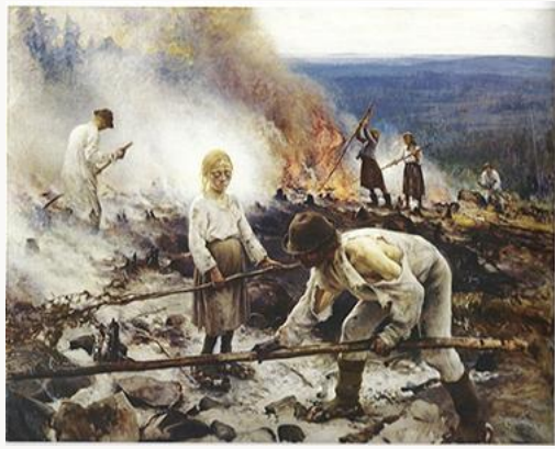
Fig. 11, Eero Järenfelt, Under the Yoke (Burning the Brushwood) , 1893. [view image & full caption]