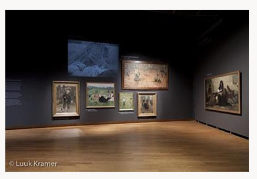
Fig. 7, Installation view of the section entitled "Jules Bastien Lepage and his Influence," at the exhibition Illusions of Reality.

Many of the artworks shown within the third theme of Illusions of Reality , entitled "Episodes from Rural and Urban Life," act to remind the viewer of nineteenth-century social injustices and ills such as poor working conditions, child labor, severe urban poverty and alcoholism. The Mora Fair (1892) by the Swede Anders Zorn (1860-1920) provides a glimpse into an episode of public drunkenness, the subject of which was also at the core of Zola's Les Rougon-Marquart (fig. 8). A telling juxtaposition is found here as well in the installation of Pelez's wonderful and immense Grimaces and Misery (Les Saltimbanques, 1888) across from The Luxembourg Gardens, Paris (1887) by Albert Edelfelt (1854-1905). In the former, a small drummer boy weeps at the far left, seemingly from fatigue and hunger; as one young girl looks upon him with pity, another folds her arms in front of her with a face full of annoyance and disdain. Everyone else in Pelez's circus sideshow plays along, but none of the characters seem completely engaged in what they are doing. They have the facial expressions of people going through the motions of something they despise doing, but are resigned to do. In the latter painting by Edelfelt, Parisian children are adored and fawned upon, and play and bask in a sunny afternoon that seems made for them alone. The brilliant pairing of these two works almost exactly opposite each other drives home a truth that stings: not all children experience childhood equally (fig. 9).