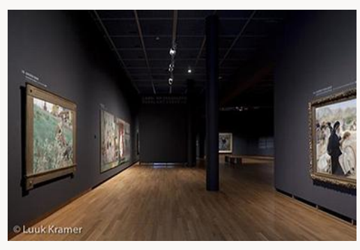
Fig. 9, Installation view showing juxtaposition of Zorn's The Mora Fair , Pelez's Grimaces and Misery (both left wall), and Edelfelt's The Luxembourg Gardens , Paris, at the exhibition Illusions of Reality .

Edelfelt, however, was not blind to the troubles that plague childhood. His austere image Conveying the Child's Coffin (1879), is a tour-de-force of Naturalist painting (fig. 10). The child in the foreground, who was spared the fate of the child in the coffin next to her, glances longingly at her reflection in the water, while the mother figure similarly glances out towards the horizon, searching for something lost. This large canvas, with its blue tones that accurately set the mood, and its amazingly modern brushwork in the water and the background passages, won Edelfelt a third class medal at the Salon of 1880, making him the first Finnish artist to ever win a medal at the Salon. Such truths about childhood poverty and death are rarely, if ever, dealt with by painters of other movements during the same period; children reign as the adored, carefree darlings of Impressionist art, for example. The theme of the tragedy of childhood, however, continues in many of the Naturalist paintings shown. This subject is in none of them bleaker and more truly startling than in a painting by Edelfelt's countryman, Eero Järnefelt, entitled Under the Yoke (Burning the Brushwood) , painted in 1893. The troubled, piercing stare of Johanna Kokkonen, the young model of Järenfelt's work, haunts the viewer long after they have moved on (fig. 11).