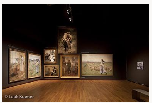
Fig. 19, Installation view of the section entitled "Representing Belief," at the exhibition Illusions of Reality . [view image & full caption]

from Ferdinand Zecca's The Life and the Passion of the Lord Jesus Christ (1905), which was a very early cinematic staging of the life of Christ; the film is briefly discussed in the catalogue for the exhibition and a film still of the Veronica and Christ scene is reproduced in Weisberg's catalogue essay on Naturalist cinema, but an excerpt of the film was not included in the presentation.[5] It is possible that a film about Jesus might not be easily considered Naturalist, but it may have ended the exhibition with greater impact than the smallish photograph of the Pan-American Exhibition.