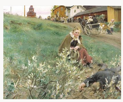
Fig. 8, Anders Zorn, The Mora Fair , 1892. [view image & full caption]