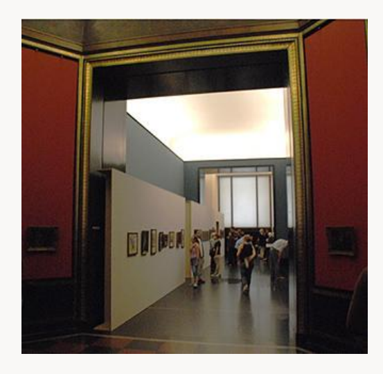
Fig. 4, Installation view of Menzel's Extreme Realism showing white walls of temporary exhibition works. Photograph by Michael Strassburger, 2010. © Berlin Biennale for Contemporary Art, 2010. [larger image]

Fig. 3, Installation view of Menzel's Extreme Realism showing white walls of temporary exhibition works. Photograph by Michael Strassburger, 2010. © Berlin Biennale for Contemporary Art, 2010. [larger image]