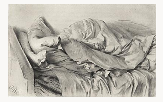
Fig. 6, Adolph Menzel, Ungemachtes Bett / Unmade Bed , ca. 1845. Black stone and stump on greenish-gray paper. [larger image]

possibility that this unmade bed might not have ever existed in this form, although it of course shows what a good draftsman Menzel was. Fried points out that what makes Menzel's art 'bodily', even if the body is not present, is that in the folds, bulges and contours of the pillow, blankets and sheets, there is still a reference to the form of the recent sleeper.[10] According to Fried, the viewer has these associations because we are not just visual beings, but also have a body and so understand physical form.[11] It seems again that Fried is making an effort to stress a more in-depth explanation of Menzel's studies, but his arguments seem very apparent and not very renewing. A more interesting point that Fried makes is that Menzel's work does not just show reality, but that it even produces the reality that it ostensibly records.