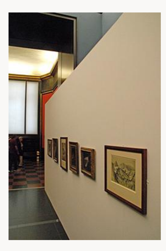
Fig. 3, Installation view of Menzel's Extreme Realism showing white walls of temporary exhibition works. Photograph by Michael Strassburger, 2010. © Berlin Biennale for Contemporary Art, 2010. [return to text]