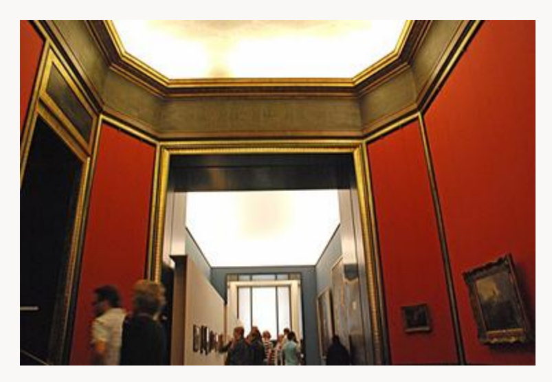
Fig. 2, Installation view of Menzel's Extreme Realism , Old National Gallery, 6th Berlin Biennale for Contemporary Art. [return to text]