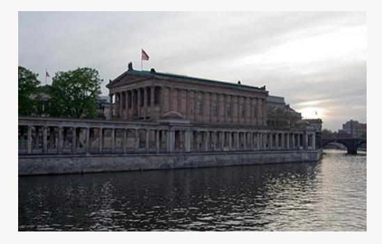
Fig. 1, Alte Nationalgalerie, Berlin. Photograph by Christian Sievers, 2010. © Berlin Biennale für Zeitgenössische Kunst / Berlin Biennale for Contemporary Art. [larger image]

That the exhibition Menzel's Extreme Realism should have taken place in the Alte Nationalgalerie (Old National Gallery) in Berlin seems obvious. The museum was designed at the beginning of the nineteenth century as a venue for contemporary German artists. (fig. 1) In his own time, Adolph Menzel (1815–1905) was recognized as a great artist, and in 1895, there was an exhibition in the Alte Nationalgalerie in honor of his eightieth anniversary.[1] The museum also holds a great number of Menzel's paintings in its permanent collection. Menzel began painting in the mid-1840s, depicting his surroundings, objects and views from his window. Later he took on grand subjects and events, for example Departure of King William I for the Army, 31 July 1870 (1871). He also took on historical subjects and made himself an expert on the life of the Prussian King Frederick the Great (1792–1786) the subject of several large-scale canvases.[2]