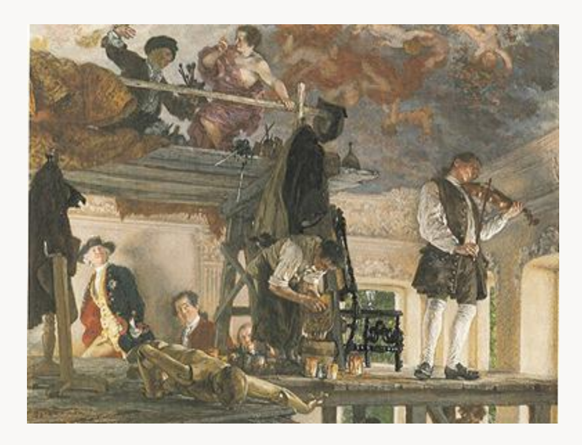
Fig. 7, Adolph Menzel, Crown Prince Frederick Pays a Visit to the Painter Pesne on His Scaffold at Rheinsberg, 1861. Gouache on paper, board backing. Alte Nationalgalerie, Berlin. [return to text]