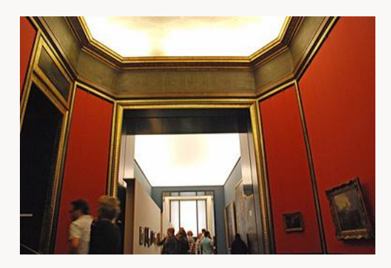
Fig. 2, Installation view of Menzel's Extreme Realism , Old National Gallery, 6th Berlin Biennale for Contemporary Art. [larger image]

The more obvious way of experiencing the exhibition would be as an addition to the permanent collection. The Menzel exhibition was installed in one of the grand neo-classical halls of the Alte Nationalgalerie, which usually displays many of Menzel's grand paintings of Frederick the Great. (fig. 2) During the exhibition one wall still displayed these large-scale canvases, while the other wall was dedicated to the exhibition. (fig. 3) Some of the works presented in the exhibition were studies, which were hung just opposite of the paintings for which they were made. For example, the exhibition contained Menzel's drawing Worker Holding Shaft of the Casting Truck (with Details) (1872–74) and Worker Washing Himself (ca. 1872–74), both studies of the figures for his painting Iron Rolling Mill (1872–75), which hung on the opposite wall in the exhibition. The exhibition works were hung on a white wall to distinguish them from the permanent display on the opposite wall; however, the distinction between the two was not especially clear. (fig. 4)