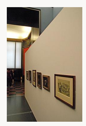
Fig. 3, Installation view of Menzel's Extreme Realism showing white walls of temporary exhibition works. Photograph by Michael Strassburger, 2010. © Berlin Biennale for Contemporary Art, 2010. [larger image]