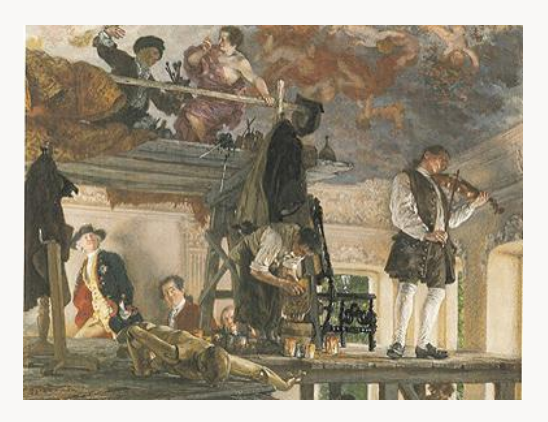
Fig. 7, Adolph Menzel, Crown Prince Frederick Pays a Visit to the Painter Pesne on His Scaffold at Rheinsberg, 1861. Gouache on paper, board backing. Alte Nationalgalerie, Berlin. [larger image]

The erotic female model up on the scaffold with Pesne is very much in contrast with the mannequin lying face down in an awkward position in the left corner of the picture. Fried declares that it would be too simple just to read this dummy that lies forgotten on the ground as a preference for the living model. One can see the mannequin as a distinction that is made in Menzel's art between the living model and the body as a dead object. In this gouache Menzel makes the viewer aware that he doesn't just visualise an object in a realistic manner, but that in his art there is liveliness present.[13] Fried draws attention to the sketches Menzel made of corpses, for example Two Dead Soldiers Laid out on Straw (1866) and Corpse of a General from the Period of the Wars of Liberation (1873), and makes a point that even these images drawn with so much detail have a certain morbid liveliness to them.