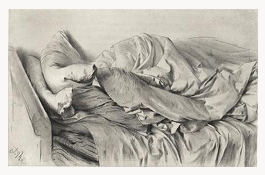
Fig. 6, Adolph Menzel, Ungemachtes Bett / Unmade Bed , ca. 1845. Black stone and stump on greenish-gray paper. [return to text]