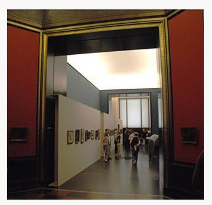
Fig. 4, Installation view of Menzel's Extreme Realism showing white walls of temporary exhibition works. [return to text]