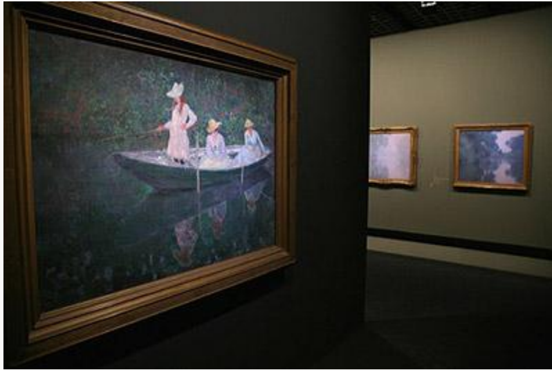
Fig. 7, Installation view of the downstairs gallery. [return to text]