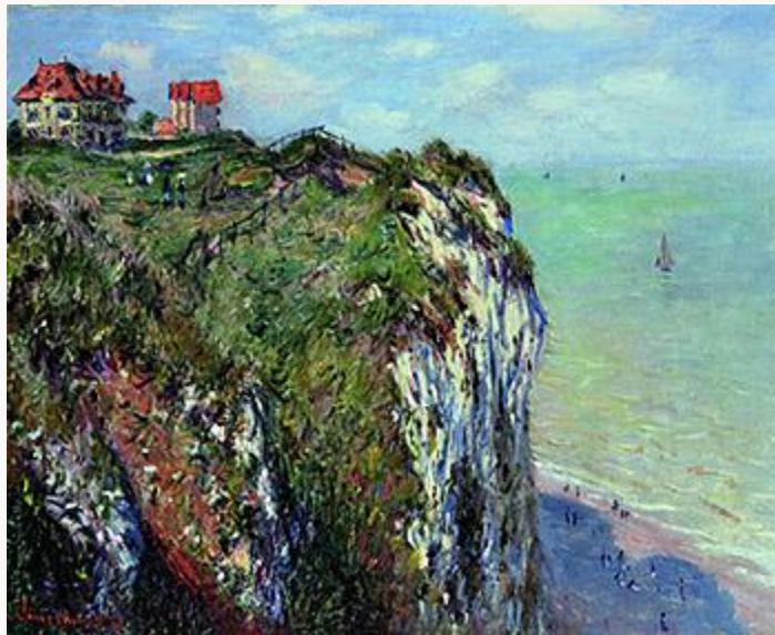
Fig. 4, Claude Monet, The Cliff at Dieppe , 1882. Oil on canvas. Kunsthhaus Zürich, Zürich. [return to text]