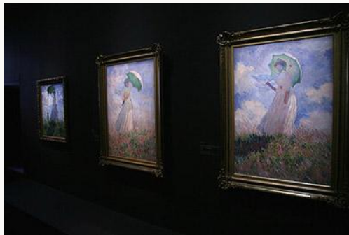
Fig. 8, Installation view of the "Decoration Room." [larger image]

The catalog entry for this room is also a lost opportunity. The mutual influence between Monet and the fin-de-siècle champions of the decorative is a comparatively neglected field in Monet studies, and could have presented an opening for someone behind the organization of this exhibition to make a strong and new contribution to the literature. However, the entry is instead a fairly workmanlike discussion of some of Monet's commissions for Ernest Hoschedé, a basic introduction to the parameters of the decorative as exemplified by Pierre Bonnard and Edouard Vuillard, a quick explanation of the tapestries, and an introduction to Monet's years devoted to the water lilies and culminating in the Orangerie decorations.