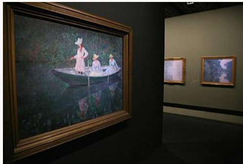
Fig. 7, Installation view of the downstairs gallery. [larger image]

In contrast to the density of works, constant crowds and dictatorial layout of the first half of the exhibition, the first three galleries of the 1890s-onward half downstairs may provide the most pleasant experience of the show. As soon as one enters them, it becomes clear that the organizing principle of the installation has changed: there are pictures to the right, to the left, and directly facing the visitor, and the order in which to approach them is not clear. People quickly begin to distribute themselves much more evenly. Moreover, these first three galleries also feel bigger since they are not organized into one snaking line: the rooms flow one into the next, and thus encourage viewers to move freely among them (fig. 7). The decision to open the space in this way is perfectly suited to the paintings on display here, which by their textural and serial nature invite movement back and forth, and closer and farther, especially from an audience now grounded in Monet's development and ready to contemplate works--grain stacks, Giverny, the Rouen Cathedral--that look much more like what most of them associated with Monet before they came to the exhibition.