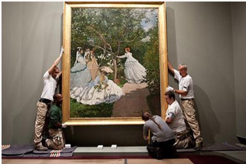
Fig. 6, Installing the Monet installation: a true installation image. Claude Monet, Four Women in a Garden , 1866. Oil on canvas. Musée d’Orsay, Paris. [return to text]