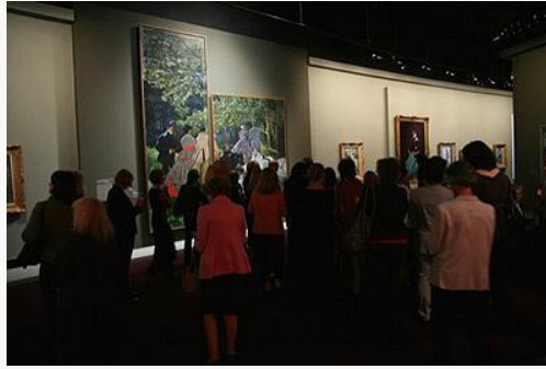
Fig. 5, Installation view of the “Figure Room.” [larger image]