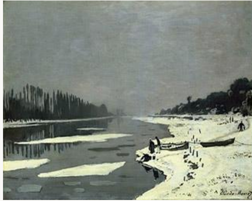
Fig. 3, Claude Monet, Ice Floes on the Seine at Bougival , 1867-68. Oil on canvas. Musée du Louvre, Paris. [larger image]