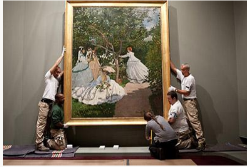
Fig. 6, Installing the Monet installation: a true installation image. Claude Monet, Four Women in a Garden , 1866. Oil on canvas. Musée d'Orsay, Paris. [larger image]

In contrast to the density of works, constant crowds and dictatorial layout of the first half of the exhibition, the first three galleries of the 1890s-onward half downstairs may provide the most pleasant experience of the show. As soon as one enters them, it becomes clear that the organizing principle of the installation has changed: there are pictures to the right, to the left, and directly facing the visitor, and the order in which to approach them is not clear. People quickly begin to distribute themselves much more evenly. Moreover, these first three galleries also feel bigger since they are not organized into one snaking line: the rooms flow one into the next, and thus encourage viewers to move freely among them (fig. 7). The decision to open the space in this way is perfectly suited to the paintings on display here, which by their textural and serial nature invite movement back and forth, and closer and farther, especially from an audience now grounded in Monet's development and ready to contemplate works--grain stacks, Giverny, the Rouen Cathedral--that look much more like what most of them associated with Monet before they came to the exhibition.