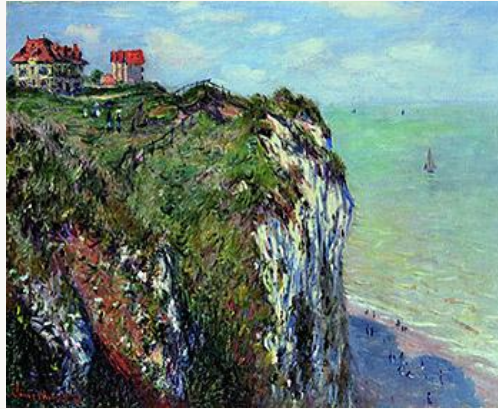
Fig. 4, Claude Monet, The Cliff at Dieppe , 1882. Oil on canvas. Kunsthau Zürich, Zürich. [larger image]