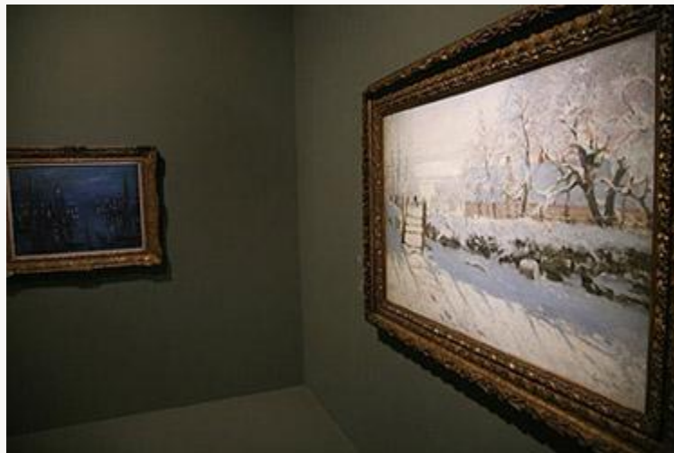
Fig. 2, Installation view showing Claude Monet, The Port at Le Havre, Night Effect , 1873. Oil on canvas. Musée d'Orsay, Paris (left); and The Magpie , 1869. Oil on canvas. Private Collection (right). [return to text]