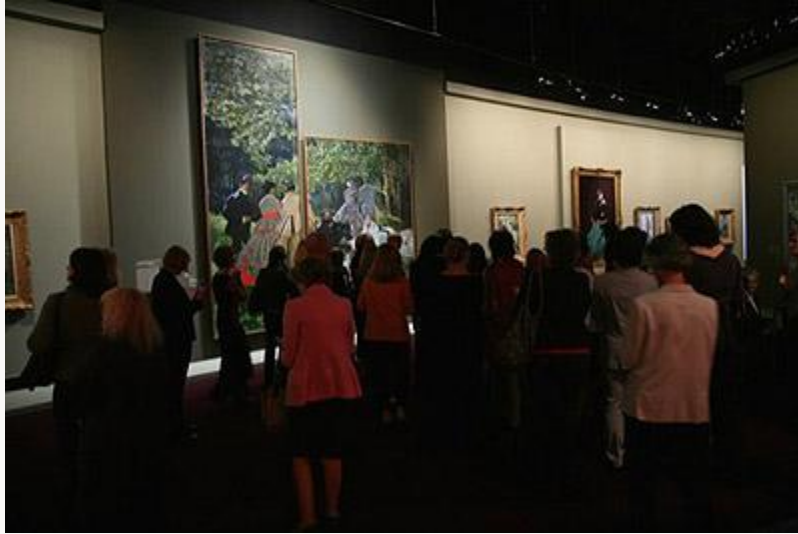
Fig. 5, Installation view of the “Figure Room.” [return to text]