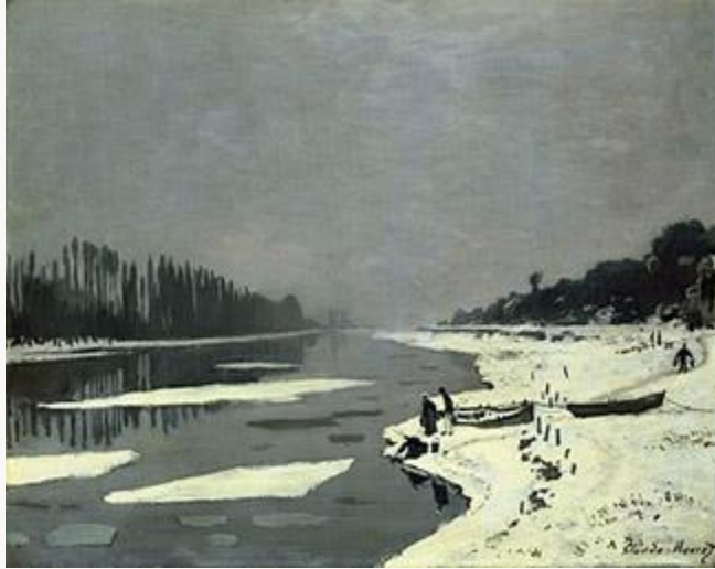
Fig. 3, Claude Monet, Ice Floes on the Seine at Bougival , 1867-68. Oil on canvas. Musée du Louvre, Paris. [return to text]