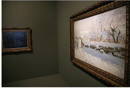
Fig. 2, Installation view showing Claude Monet, The Port at Le Havre, Night Effect , 1873. Oil on canvas. Musée d'Orsay, Paris (left); and The Magpie , 1869. Oil on canvas. Private Collection (right). [larger image]

The main part of the exhibition catalogue is devoted to explaining the logic of these different sections, and does a solid job of introducing them and placing them in the larger context both of Monet's career as a whole and of the greater development of late nineteenth-century art. Instead of individual catalogue entries, the text of the hefty volume is comprised of color reproductions of all the works in the exhibit and essays that correspond to the thematic sections in the exhibition. While informative and written in a style accessible to a general public, it is unclear how the catalogue advances or challenges existing Monet scholarship. Moreover, the English-speaking public is at something of a disadvantage with regard to the catalogue, whose English translation is marred by numerous awkward turns of phrase and would have greatly benefited from a rigorous editorial reading.