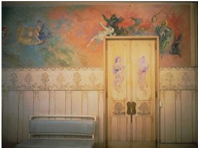
Fig. 6, Billiard Room at La Sapinière, villa of Baron Vitta, 1892, Evian, France. Detail of wall and door painting, furniture, stenciling. [return to text]