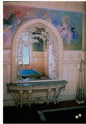
Fig. 7, Billiard Room at La Sapinière, villa of Baron Vitta, 1892, Evian, France. [view image & full caption]

As it unfolded, the exhibition documented the many facets and variants of Chéret's work. Early states of a poster "before letters" revealed how he worked on mastering his designs; other versions of a poster documented how his use of color made his images come alive. By placing the works next to one another in the installation, the organizers gave visitors a very good idea of the evolution of a print from its original inception to its final resolution (fig. 8).