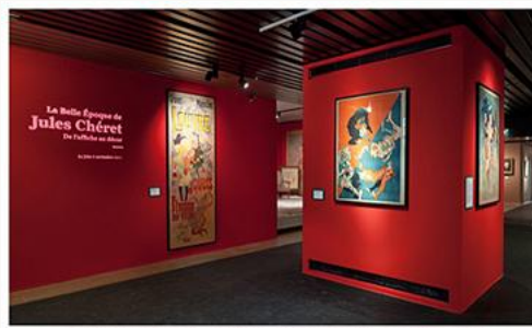
Fig. 1, Installation: Entrance to La Belle Epoque de Jules Chéret, de l’affiche au décor .

When Roger Marx, one of the leading art critics at the end of the nineteenth century, commented on the work of Jules Chéret he did so with full confidence that Chéret was the artist who had modernized posters, recognizing an artistic medium capable of reaching and educating the general public.[1] The importance of Chéret's use of color posters, as the extensive monographic exhibition at the Musée des Arts Décoratifs in Paris makes amply clear, demonstrates how artistic events—spectacles "en tout genre," new books and magazines, new products in commerce and industry—would reach an ever expanding public (fig. 1).