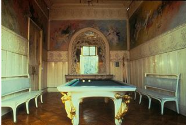
Fig. 5, Billiard Room at La Sapinière, villa of Baron Vitta, 1892, Evian, France. [return to text]