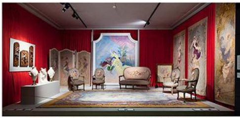
Fig. 2, Installation: Chéret's interior design. [view image & full caption]