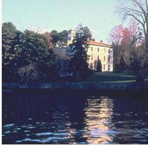
Fig. 3, Exterior view of La Sapinière, villa of Baron Vitta, 1892, Evian, France. [return to text]