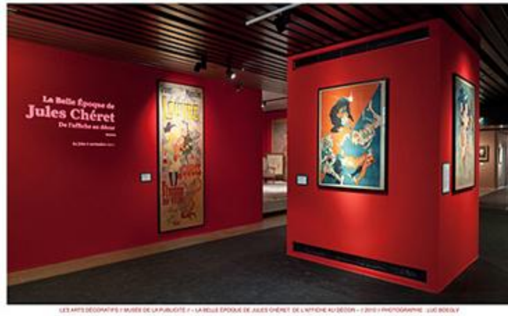
Fig. 1, Installation: Entrance to La Belle Epoque de Jules Chéret, de l’affiche au décor. [return to text]