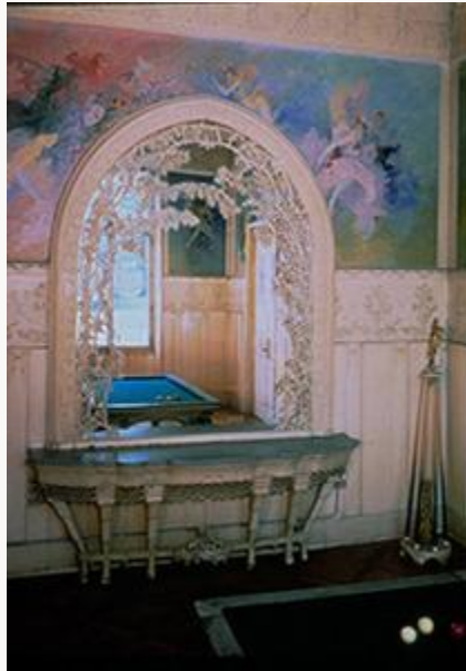
Fig. 7, Billiard Room at La Sapinière, villa of Baron Vitta, 1892, Evian, France. Detail of pier table and wall painting. [return to text]