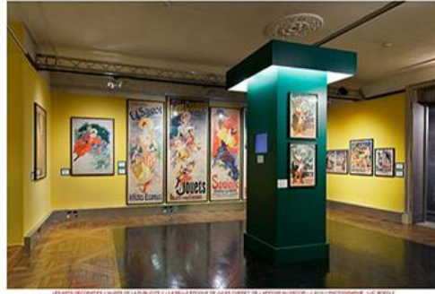
Fig. 8, Installation: Evolution of Chéret’s poster designs.