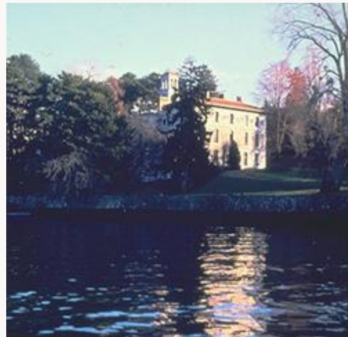
Fig. 3, Exterior view of La Sapinière, villa of Baron Vitta, 1892, Evian, France. [view image & full caption]