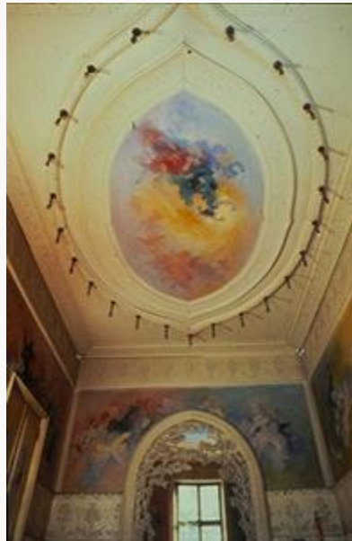
Fig. 4, Ceiling painting at La Sapinière, villa of Baron Vitta, 1892, Evian, France. Photograph by Yvonne Weisberg. [return to text]