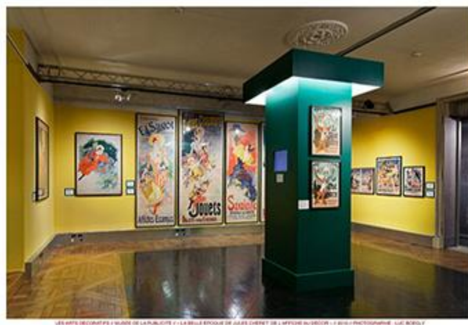
Fig. 8, Installation: Evolution of Chéret's poster designs. [return to text]