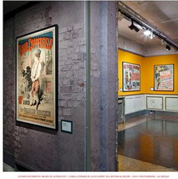
Fig. 9, Installation: Poster advertising Charles Dickens’ book, David Copperfield , n.d. [return to text]