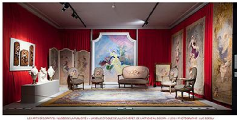
Fig. 2, Installation: Chéret’s interior design. [return to text]