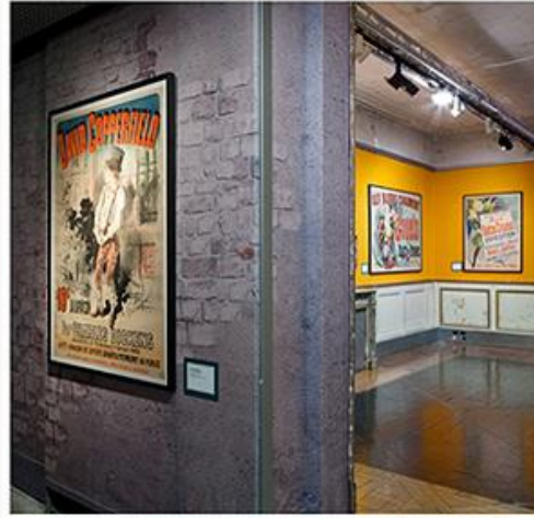
Fig. 9, Installation: Poster advertising Charles Dickens' book, David Copperfield , n.d.