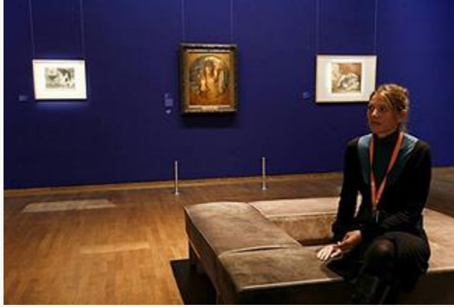
Fig. 9, Wall of the room "Dreams and Nightmares," with Gustave Moreau, Victim . Oil on canvas, Musée Gustave Moreau, Paris (center); Fuseli's The Incubus Leaving Two Sleeping Women , 1810. Pencil and watercolor (left); and The Changeling , 1780. Black chalk, watercolor, heightened with white, both in the Kunsthau Zurich, Grafische Sammlung. [return to text]