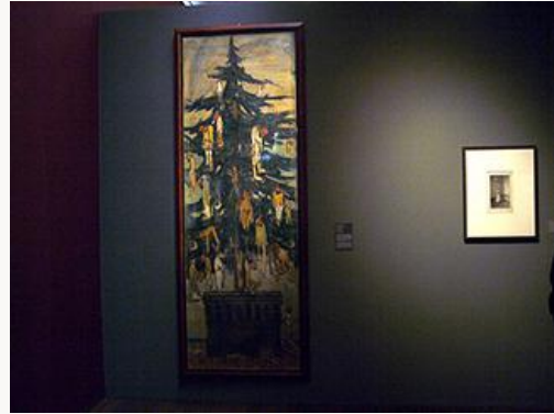
Fig. 15, Bonzagni, The Hanging Tree and Kubin, Madame , 1900/01. [view image & full caption]