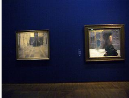
Fig. 19, Fernand Khnopff, In Bruges, A Church , 1904.