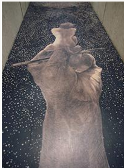
Fig. 6, Floor with a reproduction of Klemens Brosch, First Draft of the Artist's Exlibris , c. 1916. Pen and ink. Oberösterreichische Landesmuseen, Linz. [return to text]