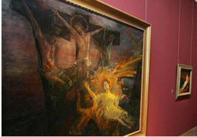
Fig. 11, Albert von Keller, Vision of the Crucifixion II , c.1913. Oil on canvas. Kunsthhaus Zurich, and Gabriel von Max, Clairvoyant Truth , c. 1895. Oil on canvas. Kunstforum Ostdeutsche Galerie Regensburg. [return to text]