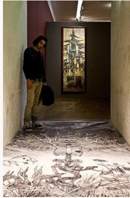
Fig. 14, Passageway floor with a reproduction of Félicien Rops, The Scraps , 1868. [view image & full caption]