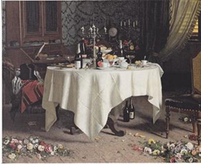
Fig. 17, Angelo Morbelli, Asphyxia I , 1884. Oil on canvas. Fondazione Guido ed Ettore de Fornaris, Galleria d'Arte Moderna e Contemporanea di Torino. [return to text]