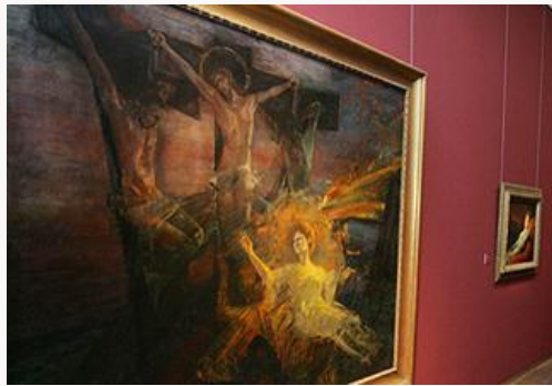
Fig. 11, Albert von Keller, Vision of the Crucifixion II , c.1913.