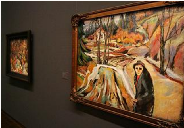
Fig. 10, Aksei Waldemar Johannessen, Break of Spring , 1918-20. Oil on canvas. Private collection. [return to text]