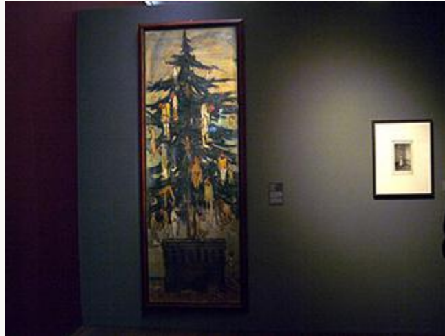
Fig. 15, Bonzagni, The Hanging Tree and Kubin, Madame , 1900/01. Pen, ink, watercolor, and spray technique. Galleria Antologia Monza. [return to text]