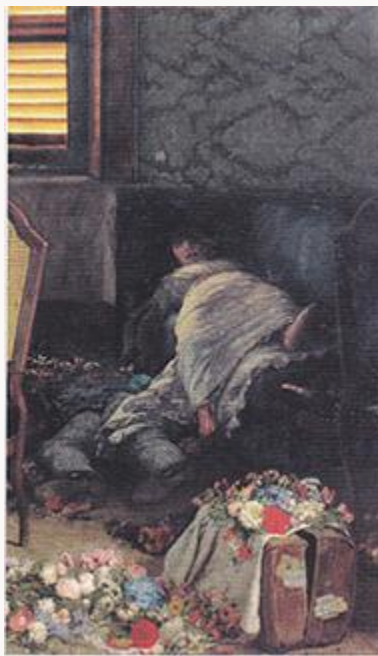
Fig. 18, Angelo Morbelli, Asphyxia II , 1884. Oil on canvas. Private collection. [return to text]