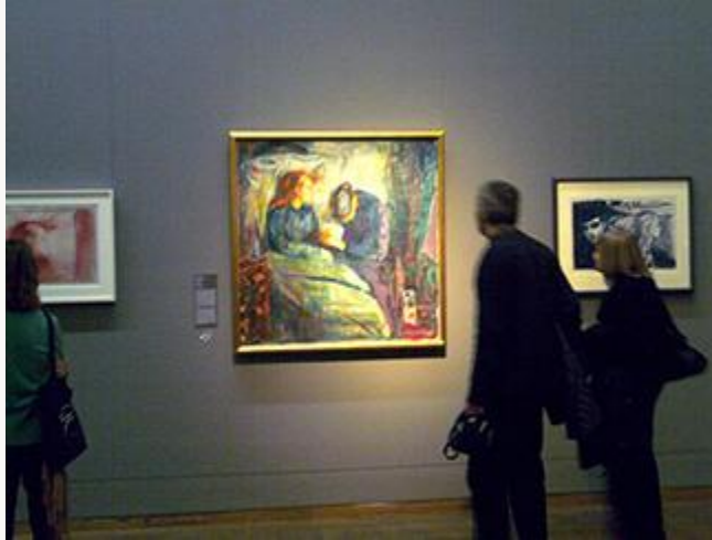
Fig. 3, Installation photograph with Munch, The Sick Child , 1925. Oil on canvas. Munch-museet, Oslo (center); The Sick Child , 1896. Lithograph in two colors. Munch-museet, Oslo; and Separation II , 1896. Lithograph. Munch-museet, Oslo ( return to text )