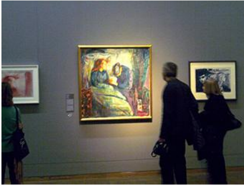
Fig. 3, Installation photograph with Munch, The Sick Child , 1925.