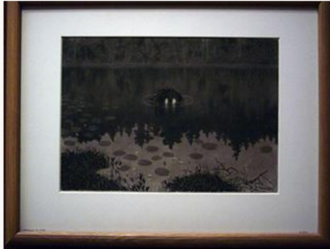
Fig. 7, Theodor Kittelsen, Water Sprite , 1887. Graphite, pen and wash. The National Museum of Art, Architecture and Design, Oslo. [return to text]