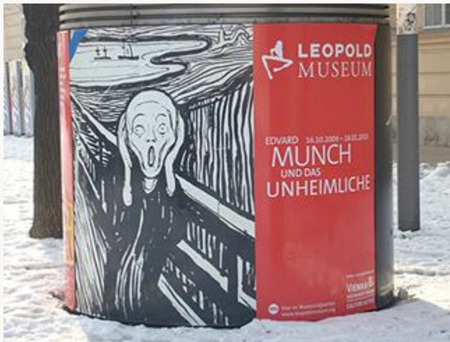
Fig. 2, Exhibition Poster for "Munch und das Unheimliche." [return to text]