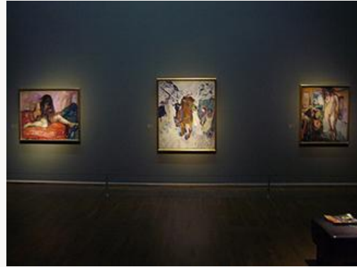
Fig. 4, Installation view of second room with Munch paintings: Weeping Nude , 1913-1914 (left), Galloping Horse , 1910-1912.