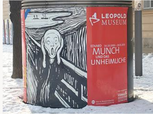
Fig. 2, Exhibition Poster for "Munch und das Unheimliche."