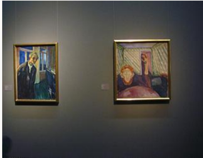
Fig. 5, Munch, The Night Wanderer , 1923-24. Oil on canvas. Munch-museet, Oslo (left); and Jealousy , 1907. Oil on canvas. Munch-museet, Oslo (right). [return to text]