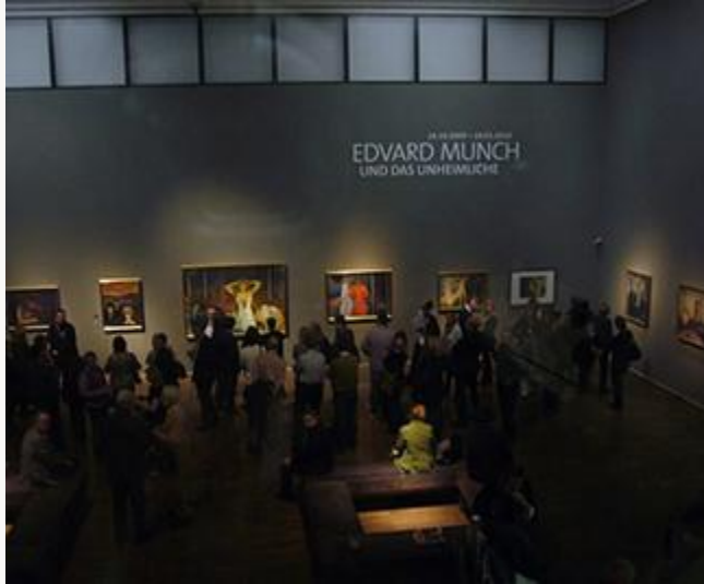
Fig. 1, First room in the exhibition "Munch und das Unheimliche." [return to text]

All photographs by the author unless otherwise indicated