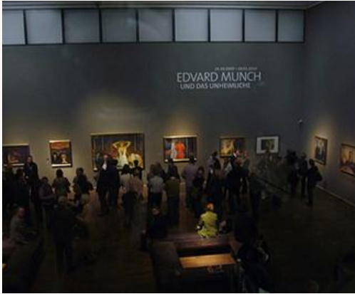
Fig. 1, First room in the exhibition "Munch und das Unheimliche."

a capstone and reinterpretation of prevailing themes (272). Judging from the crowds who flocked to the museum, the number of posters of The Scream that dotted the city, and the amount of online response, the exhibition was a popular success (figs. 1 and 2). Opening as it did in time for Halloween, and capitalizing on the recent fascination with vampires, it also benefited from coordinated literary events, such as readings from stories by Edgar Allen Poe and E.T.A. Hoffmann at a local theater.