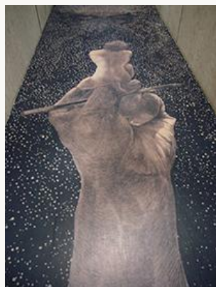
Fig. 6, Floor with a reproduction of Klemens Brosch, First Draft of the Artist's Exlibris , c. 1916. [view image & full caption]