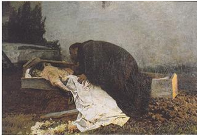
Fig. 12, Pietro Pajetta, Hatred , 1896. Oil on canvas. Museo del Cenedese, Vittorio Veneto. [return to text]