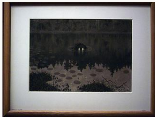
Fig. 7, Theodor Kittelsen, Water Sprite , 1887. [view image & full caption]