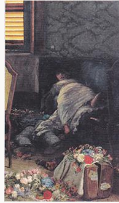
Fig. 18, Angelo Morbelli, Asphyxia II , 1884. [view image & full caption]