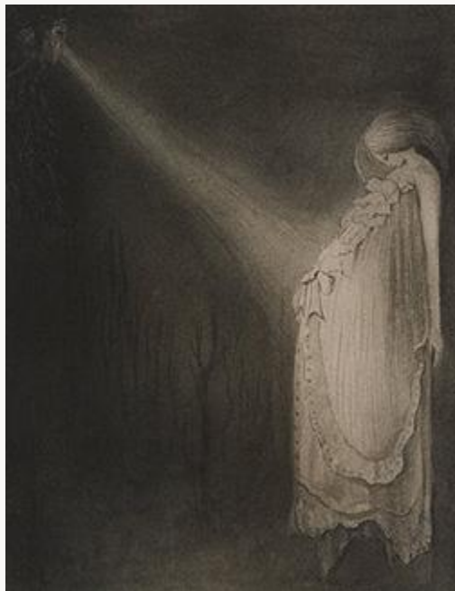
Fig. 16, Kubin, The Blessed , 1902. Ink, pen, watercolor and spray technique. The Leopold Museum, Leopold Museum, Vienna. [return to text]