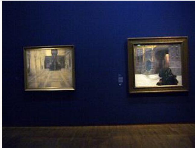
Fig. 19, Fernand Khnopff, In Bruges, A Church , 1904. Crayon and pastel. Musées communaux, Verviers (left), and Frantz Charlet, The Griffe at the Burg in Bruges , n.d. Oil on canvas. Museum voor Schone Kunsten, Gent (right). [return to text]