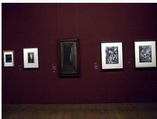
Fig. 8, Wall of third room (left to right): Theodor Kittelsen, The Plague on the Stairs , 1896.