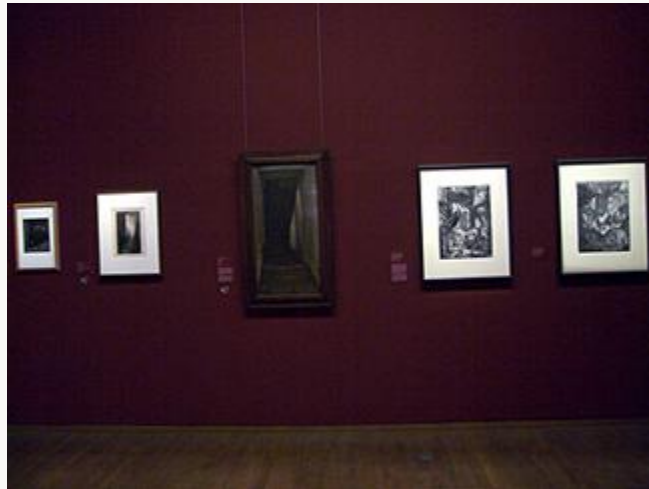
Fig. 8, Wall of third room (left to right): Theodor Kittelsen, The Plague on the Stairs , 1896. Pen and crayon. The National Museum of Art, Architecture and Design, Oslo; Alfred Kubin, The Staircase 1902/03. Pen, ink, and spray technique. Leopold Museum, Vienna; Eugène Laermans, The Staircase , 1896. Oil on canvas. Museum voor Schone Kunsten, Gent; and Giovanni Battista Piranesi, Plates 3 and 4 of Carceri d'Invenzione , engravings. Private collection. [return to text]