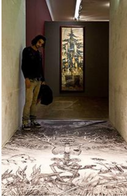
Fig. 14, Passageway floor with a reproduction of Félicien Rops, The Scraps , 1868. Etching. Musée provincial Félicien Rops, Namur, and view of Arnold Bonzagni, The Hanging Tree , 1911. Tempera on cardboard. Galleria Antologia Monza. [return to text]