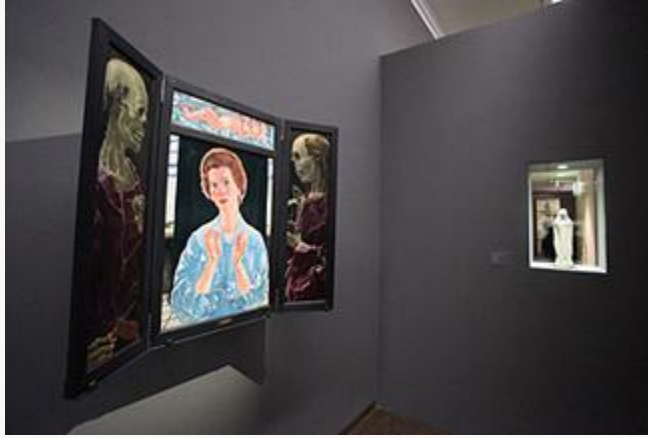
Fig. 13, Cuno Amiet, Hope-Transitoriness , 1902. Tempera on cardboard and particle board. Kunstmuseum Olten, and Zsolnay Porzellan, Death with Urn , c.1900. Porcelain sculpture. Collection Schmutz, Vienna. [return to text]