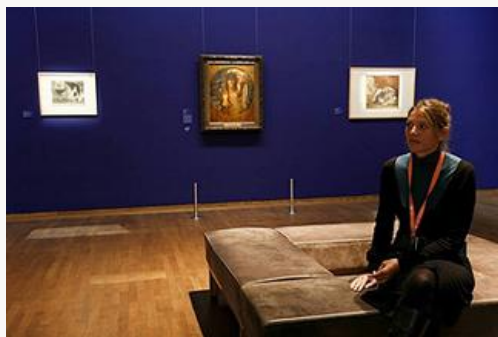
Fig. 9, Wall of the room "Dreams and Nightmares," with Gustave Moreau, Victim .

other print, A Strike of Phantasy , had only tangential connections to the room's theme of nocturnal terrors.