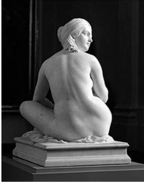
Fig. 7, Pradier, Odalisque , 1841. Marble. Musée des Beaux-Arts, Lyon. © Claude Lapaire, Geneva. © Claude Lapaire, Geneva [return to text]