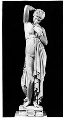
Fig. 8, Pradier, Phryne , 1844-45. Marble. Musée des Beaux-Arts, Grenoble. [larger image]