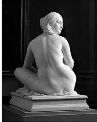
Fig. 7, Pradier, Odalisque , 1841. Marble. Musée des Beaux-Arts, Lyon. © Claude Lapaire, Geneva. © Claude Lapaire, Geneva [larger image]