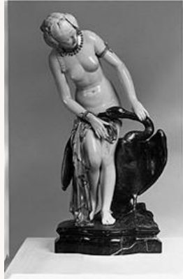
Fig. 10, Pradier, Léda , 1850-51. Ivory and bronze, gold and turquoise. Musée d'Art et d'Histoire, Geneva. [larger image]