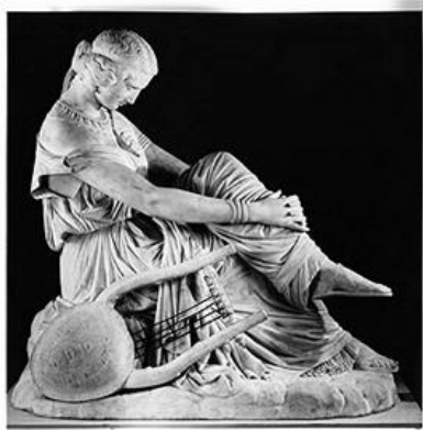
Fig. 11, Pradier, Sappho, 1851-52. Marble. Musée d'Orsay, Paris. [larger image]

Throughout his career, Pradier was showered with professional honors and prestigious posts. He was elected professor of sculpture at the Académie des Beaux-Arts in 1827, made Chevalier de la Légion d'Honneur in 1828, and Officier de la Légion d'Honneur in 1834. He sold more Salon entries to the French government between 1819 and 1852 than any other sculptor at that time, and his work was distributed throughout the national museums in France. In contrast to this, he received fewer public commissions than his competitors: he was given none of the large reliefs for the Arc de Triomphe, only the smaller figures of Fame (cat. 58-61), nor did he get a commission for the tympanum of La Madeleine or any other major architectural sculpture (80-81). By the time of his death in 1852, however, he was considered one of the leaders of modern French sculpture and along with Jean-Pierre Cortot, David d'Angers, and François Rude, a favourite of the July Monarchy (81).