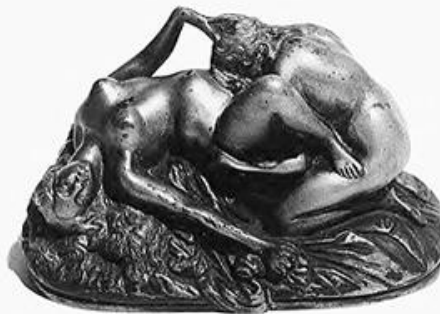
Fig. 9, Pradier, Women Doomed , 1841? Bronze. [larger image]