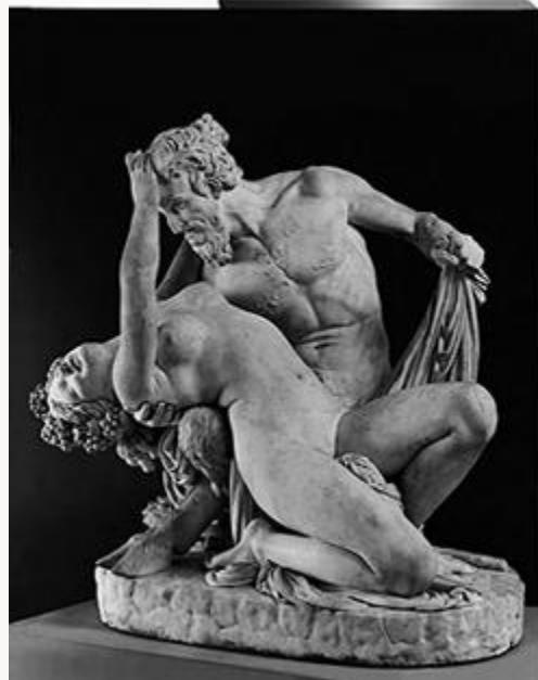
Fig. 6, Pradier, Satyr and Bacchante , 1830-34. Marble. Musée du Louvre, Paris © Yves Siza, Geneva. [return to text]