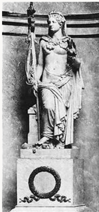
Fig. 4, Pradier, Liberty , 1830–32. Marble. Assemblée Nationale, Paris. [return to text]