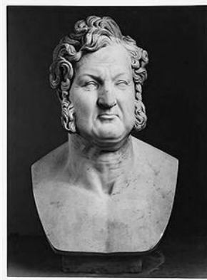
Fig. 5, Pradier, Third Bust of Louis-Philippe , 1833. Marble. Musée du Louvre, Paris. [larger image]

Apart from such prestigious commissions, Pradier is today remembered for his female nudes and erotic groups that were largely designed as objects of desire for male spectators. A long series of endlessly bending and stretching sensuous female figures camouflaged as classical heroines commences with the early Nymph that Pradier had brought back from Rome (cat. 10). This is followed by the robust sensuousness of the Three Graces of 1825-31 (cat. 32), an ambitious articulation that in the words of Horst W. Janson "would have embarrassed Thorvaldsen and would have been unthinkable for Canova," [4] to be outdone by the sensationalism of his Satyr and Bacchante at the Salon of 1834 (cat. 62, fig. 6). The piece caused a scandal: some claimed to recognize the features of the sculptor and his former mistress, Juliette Drouet, who by then had begun an affair with Victor Hugo (34-35). Others like Gustave Thore excoriated its exhibition of "dirty thoughts and disgusting action" (267). Nevertheless, a lucrative flow of female nudes – "statues de chaire" – continued in the 1840s, with Odalisque (cat. 161, fig. 7), Cassandra (cat. 207), Phryne (cat. 232, fig. 8), Pandora (cat. 263), Nyssia (cat. 307) and Danaïde (cat. 358), among others, all alluding in one way or another to famous courtesans or women of some reputation, and therefore offering an erotic spectacle to male voyeurism.