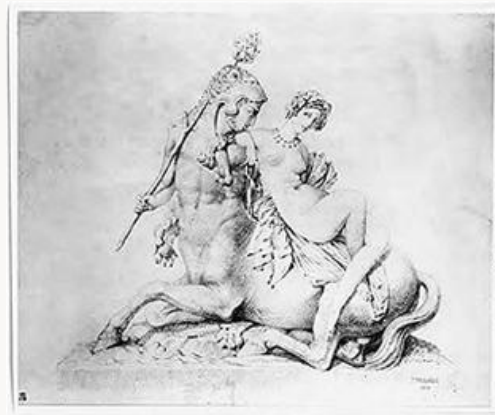
Fig. 3, Pradier, Bacchante and Centaur . Drawing by Pradier after the lost plaster. Pencil on paper. Kunstmuseum, St. Gallen (Switzerland). [larger image]