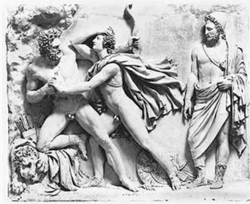
Fig. 2, Pradier, Neoptolemus Prevents Philoctetes from Loosing His Arrows Against Ulysses, 1813. Plaster. Musée d'Art et d'Histoire, Geneva. [larger image]

contemporary luminaries in the political and cultural arenas, of which his Third Bust of Louis-Philippe (cat. 84), and the Memorial to the Count of Beaujolais of 1835-39 (cat. 97) arguably show him at his best (fig. 5).