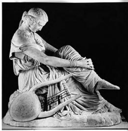
Fig. 11, Pradier, Sappho , 1851-52. Marble. Musée d'Orsay, Paris. [return to text]