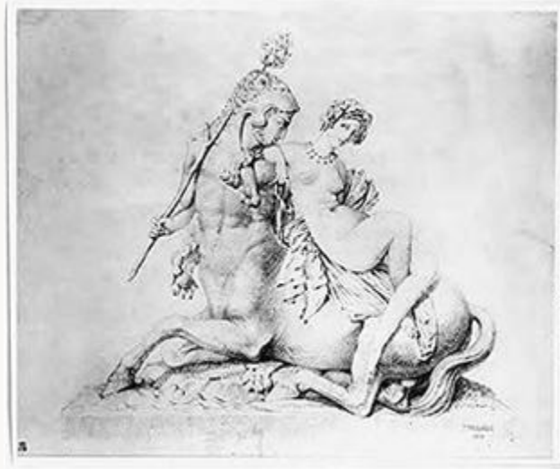
Fig. 3, Pradier, Bacchante and Centaur . Drawing by Pradier after the lost plaster. Pencil on paper. Kunstmuseum, St. Gallen (Switzerland). [return to text]