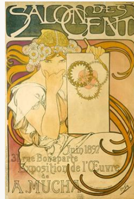
Fig. 6, Salon des Cent , Juin 1897. [view image & full caption]