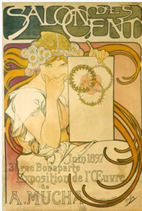
Fig. 6, Salon des Cent, Juin 1897 . Color lithograph. Moravská Galerie, Brno. [return to text]