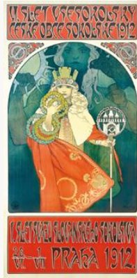
Fig. 7, Sixth Sokol Festival , 1912.