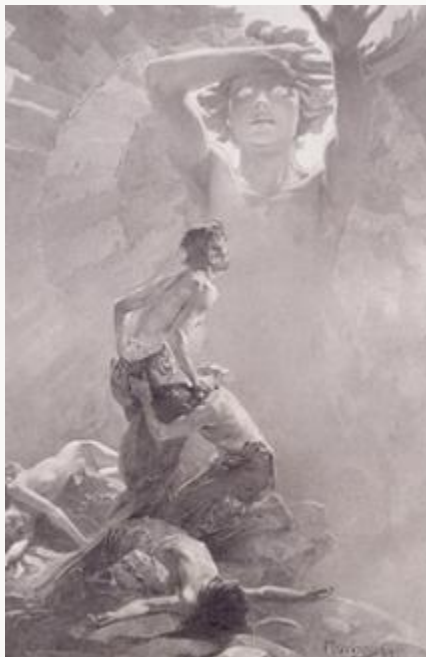
Fig. 14, Le Pater , Final sketch for sixth allegorical plate, Forgive us our trespasses, as we forgive those who trespass against us , 1899. India ink, black pencil, gouache. Private collection, Switzerland. [return to text]