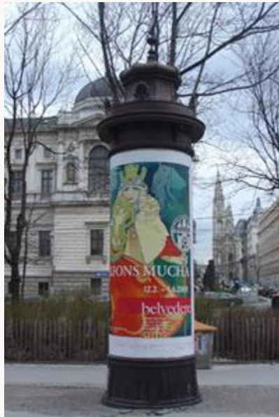
Fig. 2, Exhibition poster (detail of Sixth Sokol Festival , 1912). [return to text]