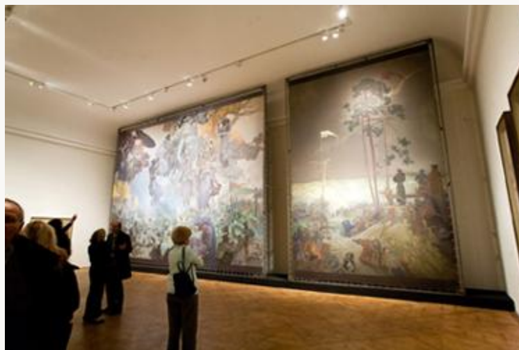
Fig. 16, Installation view, Room 4, from The Slav Epic , left: The Svantovit Festival on the Island of Rügen , 1912; right: The Meeting at Křížky: Sub utraque (right panel of the triptych The Magic of the Word ), 1916. Egg tempera on canvas. Galerie hlavního města Prahy, Prague.