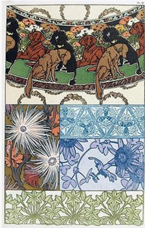
Fig. 13, Documents décoratifs , Pl. 42, 1902. Color lithograph. [return to text]