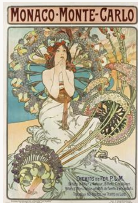
Fig. 9, Monaco-Monte-Carlo , 1897. Color lithograph. MAK – Österreichisches Museum für angewandte Kunst / Gegenwartskunst, Vienna. [return to text]