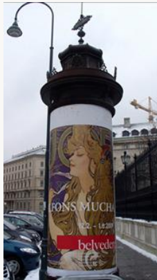
Fig. 1, Exhibition poster (detail of JOB , 1896). [view image & full caption]