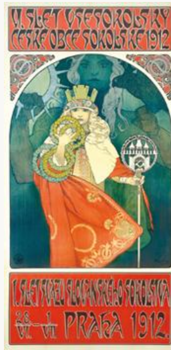
Fig. 7, Sixth Sokol Festival , 1912. Color lithograph. Moravská Galerie, Brno. © Mucha Trust 2009.