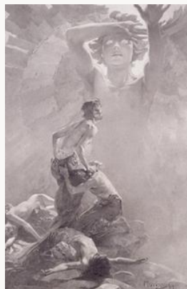
Fig. 14, Le Pater , Final sketch for sixth allegorical plate, Forgive us our trespasses, as we forgive those who trespass against us , 1899. [view image & full caption]

Small adjoining rooms housed works related to two earlier masterpieces of illustration. Both enchanting books were published by Henri Piazza and printed by the firm of Ferdinand Champenois, to whom Mucha was under contract. The first room included final sketches for Le Pater (1899), a volume Mucha ranked among his most important accomplishments.[7] In this theosophical meditation on evolution, Mucha gave each of the seven lines of the Lord's Prayer a three-page 'chapter' (reproductions at http://richet.christian.free.fr/pater/pater.html ). Two pages were color lithographs: the first framed the verse in Latin and French within complex geometrical shapes, and the second presented a textual interpretation by Mucha as an illuminated manuscript. The third page was a symbolic drawing in black and brown hand photogravure (fig. 14).[8] These full-page drawings show human beings striving toward the light, where Nature takes the shape of a woman and God that of a youth, a vision that would clearly not receive an imprimatur from the traditional church. The other small room contained selected studies, trial proofs, and pages from Ilsee, Princesse de Tripoli (1897), a tale commissioned by Piazza from the aristocratic playwright Robert de Flers (1872–1927) and illustrated with 132 splendidly complex lithographs ( see http://richet.christian.free.fr/ilsee/ilsee.html ).[9]