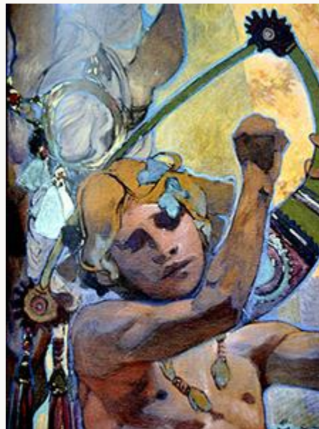
Fig. 18, The Svantovit Festival on the Island of Rügen (detail of musician). [return to text]