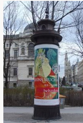
Fig. 2, Exhibition poster (detail of Sixth Sokol Festival , 1912). [view image & full caption]