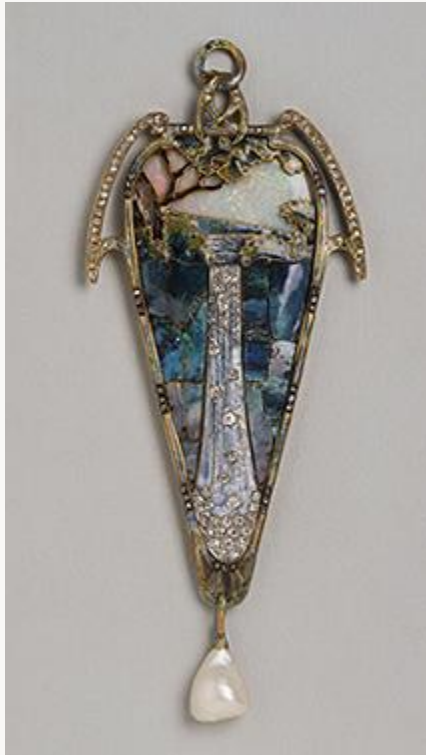
Fig. 15, Mucha (design) and Georges Fouquet (execution), Cascade pendant, c. 1900. Gold, enamel, opal, diamonds, and baroque pearl. Petit Palais, Musée des Beaux-Arts de la Ville de Paris. Photo: Petit Palais / Roger-Viollet © Mucha Trust 2009. [return to text]