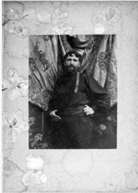
Fig. 3, Alphonse Mucha, c. 1897. Photograph in a passepartout with dried flowers. [return to text]