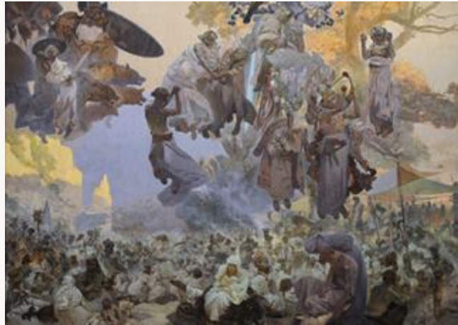
Fig. 17, The Svantovit Festival on the Island of Rügen: The Conflict of the Gods Finds Redemption in Art , 1912. Egg tempera on canvas. Galerie hlavního města Prahy, Prague. © Mucha Trust 2009. [return to text]