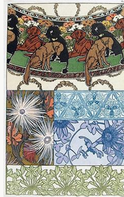
Fig. 13, Documents décoratifs , Pl. 42, 1902. [view image & full caption]

Small adjoining rooms housed works related to two earlier masterpieces of illustration. Both enchanting books were published by Henri Piazza and printed by the firm of Ferdinand Champenois, to whom Mucha was under contract. The first room included final sketches for Le Pater (1899), a volume Mucha ranked among his most important accomplishments.[7] In this theosophical meditation on evolution, Mucha gave each of the seven lines of the Lord's Prayer a three-page 'chapter' (reproductions at http://richet.christian.free.fr/pater/pater.html ). Two pages were color lithographs: the first framed the verse in Latin and French within complex geometrical shapes, and the second presented a textual interpretation by Mucha as an illuminated manuscript. The third page was a symbolic drawing in black and brown hand photogravure (fig. 14).[8] These full-page drawings show human beings striving toward the light, where Nature takes the shape of a woman and God that of a youth, a vision that would clearly not receive an imprimatur from the traditional church. The other small room contained selected studies, trial proofs, and pages from Ilsee, Princesse de Tripoli (1897), a tale commissioned by Piazza from the aristocratic playwright Robert de Flers (1872–1927) and illustrated with 132 splendidly complex lithographs ( see http://richet.christian.free.fr/ilsee/ilsee.html ).[9]