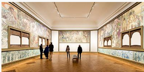
Fig. 19, Installation view, Room 6, Reconstruction of decorations for Bosnia- Herzegovina Pavilion, Exposition Universelle, Paris, 1900.

Balkan history, the Czech artist in 1900 might have been expected to sculpt La Parisienne , the ephemeral woman atop the exposition's entry gate executed instead by Paul Moreau-Vauthier; Mucha had, in fact, planned such a figure for his Pavillon de l'Homme . But inspired by the suffering of the southern Slavs as he worked on the murals, Mucha, who turned forty that summer of the fair, took a new path in mid-life that led him to the Slav Epic and the wish to "talk in my own way to the soul of the nation." [13]