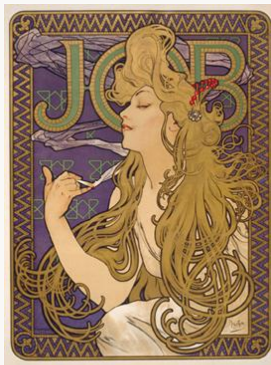
Fig. 8, JOB , 1896. Color lithograph. MAK – Österreichisches Museum für angewandte Kunst/ Gegenwartskunst, Vienna. [return to text]