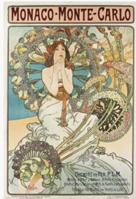
Fig. 9, Monaco-Monte-Carlo , 1897.

and recall the queen's Diamond Jubilee on the throne, and those who did not could relish the exuberant pasta manes of the heraldic lion and unicorn.