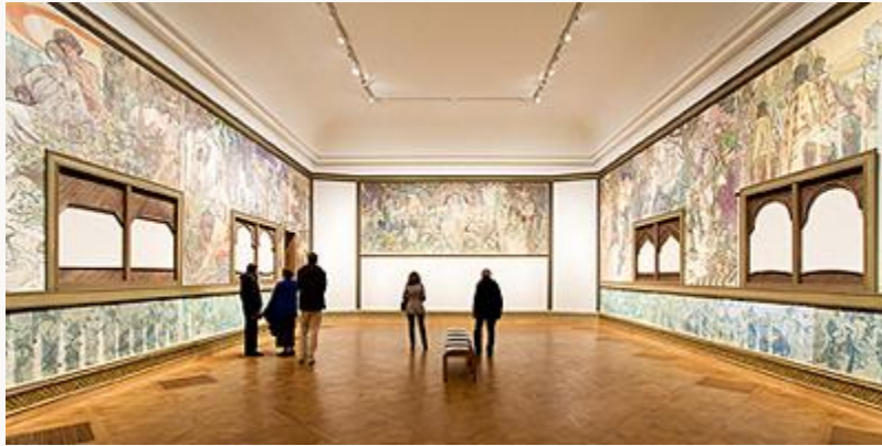
Fig. 19, Installation view, Room 6, Reconstruction of decorations for Bosnia-Herzegovina Pavilion, Exposition Universelle, Paris, 1900. [return to text]