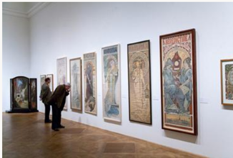
Fig. 4, Installation view, Room 1, poster wall, illuminated for opening. [return to text]