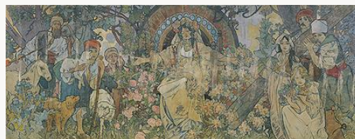
Fig. 20, The Allegory of Bosnia-Herzegovina , 1900.