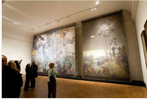
Fig. 16, Installation view, Room 4, from The Slav Epic , left: The Svantovit Festival on the Island of Rügen , 1912; right: The Meeting at Křižky: Sub utraque (right panel of the triptych The Magic of the Word ), 1916. [view image & full caption]

Mucha's Svantovit Festival depicts a gathering of the Baltic Slavs before their temple at Cape Arkona on the island of Rügen (fig. 17). The chalk cliffs in the background (familiar from works by Caspar David Friedrich and other painters) are lit by a setting sun. The faces of the four-headed solar deity Svantovit, shown at the top with his linden branch and cornucopia, are cropped in all color photographs in the Mucha literature, including the present catalogue. Unaware of the future, the revelers below do not see the German god Thor with his wolf pack (upper left) invading the sanctuary. The last Slav warrior is dying, mourned by three musicians (fig. 18). Mucha knew that the Arkona temple had been razed by a Danish king in 1168, but his intuition of a menace from Germany was prophetic.