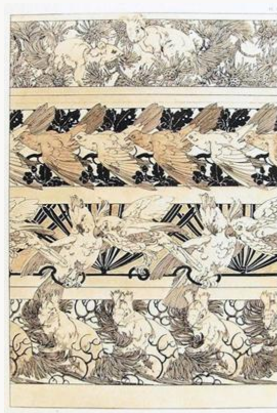
Fig. 12, Documents décoratifs , Pl. 35, 1902. Color lithograph. [return to text]