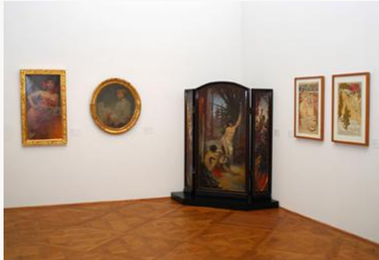
Fig. 5, Installation view, Room 1, corner, Paravent , 1882–1883. Oil on canvas. Moravská Galerie, Brno; right poster wall, Salon des Cent, Juin 1897 (see fig. 6); Salon des Cent, XX me Exposition (mars-avril 1896) , Color lithograph, Albertina, Vienna. [return to text]