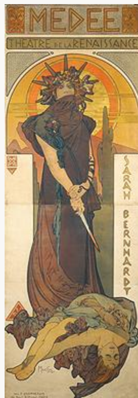
Fig. 10, Médée , 1898. Color lithograph. Moravská Galerie, Brno. © Mucha Trust 2009. [return to text]