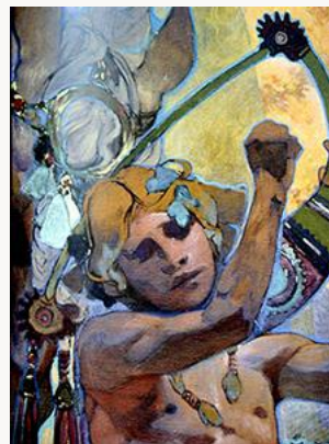
Fig. 18, The Svantovit Festival on the Island of Rügen (detail of musician). [view image & full caption]

A very late work was documented in Room 5, a narrow corridor with watercolor cartoons for a stained-glass window in St. Vitus Cathedral in Prague. Commissioned by the Slavia Bank in 1931, the window shows a narrative style similar to Mucha's wall decorations in Room 6, painted three decades earlier in Paris for the Bosnia-Herzegovina Pavilion at the Exposition Universelle of 1900 (figs. 19, 20). A partial reconstruction of the dismantled murals, this room is the most original of the exhibition. [12] Alfred Weidinger explains in his catalogue essay the political constraints imposed on the painter by the Austro-Hungarian government, which had occupied the two provinces since 1878 (48–55). Rather than paint a historical panorama of