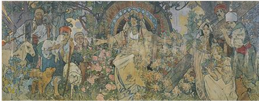
Fig. 20, The Allegory of Bosnia-Herzegovina , 1900. Tempera on canvas. Museum of Decorative Arts, Prague. © Mucha Trust 2009. [return to text]