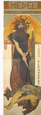
Fig. 10, Médée , 1898.