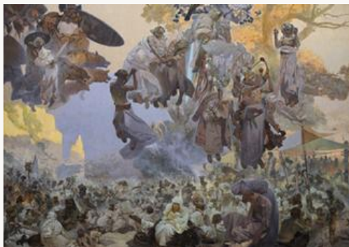
Fig. 17, The Svantovit Festival on the Island of Rügen: The Conflict of the Gods Finds Redemption in Art , 1912. [view image & full caption]

Mucha's Svantovit Festival depicts a gathering of the Baltic Slavs before their temple at Cape Arkona on the island of Rügen (fig. 17). The chalk cliffs in the background (familiar from works by Caspar David Friedrich and other painters) are lit by a setting sun. The faces of the four-headed solar deity Svantovit, shown at the top with his linden branch and cornucopia, are cropped in all color photographs in the Mucha literature, including the present catalogue. Unaware of the future, the revelers below do not see the German god Thor with his wolf pack (upper left) invading the sanctuary. The last Slav warrior is dying, mourned by three musicians (fig. 18). Mucha knew that the Arkona temple had been razed by a Danish king in 1168, but his intuition of a menace from Germany was prophetic.