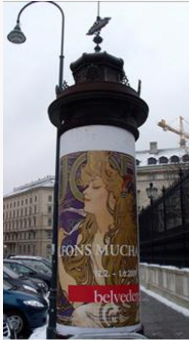
Fig. 1, Exhibition poster (detail of JOB , 1896). [return to text]