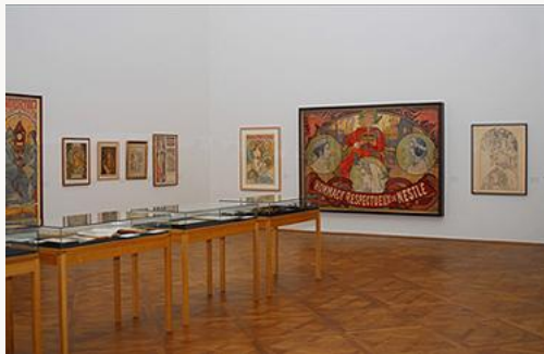
Fig. 11, Installation view, Room 1, Right wall:

left, Monaco-Monte-Carlo , 1897 (see fig. 9); center, Hommage Respectueux de Nestlé , 1897,