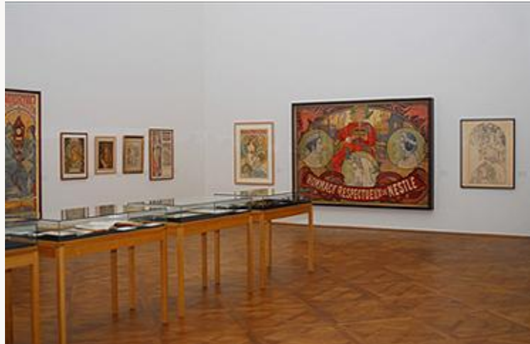
Fig. 11, Installation view, Room 1, Right wall: left, Monaco-Monte-Carlo , 1897 (see fig. 9); center, Hommage Respectueux de Nestlé , 1897, Color lithograph, Mucha Trust. [return to text]