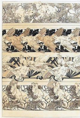
Fig. 12, Documents décoratifs , Pl. 35, 1902. [view image & full caption]