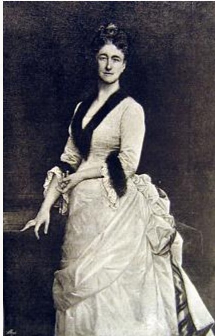
Fig. 7, Alexandre Cabanel, Catharine Lorillard Wolfe , 1876. Oil on canvas. New York, Metropolitan Museum of Art. Reproduced in Rowlands 1889, p. 12. [return to text]