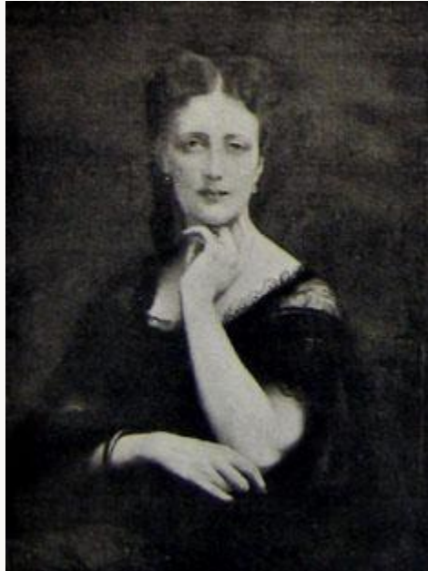
Fig. 2, Alexandre Cabanel, Duchess of Vallombrosa , 1869. Oil on canvas. Private collection. Reproduced in Moreau 1907, p. 143. [return to text]