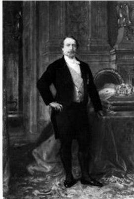
Fig. 1, Alexandre Cabanel, Emperor Napoleon III , 1865. Oil on canvas. Baltimore, Walters Art Museum [larger image]

Cabanel's portrait of Napoleon III won the artist a Medal of Honor at the Salon of 1865 [7] and was praised on both sides of the Atlantic for its simplicity and sophistication. Roger Riordan, writing for the Art Amateur , claimed that it was Cabanel's best portrait. [8] French writer Henry de Chennevières praised Cabanel's modest representation of the emperor as a bold, modern, and original conception. [9] Rather than portray the Emperor in his imperial finery, Cabanel depicted him wearing a simple black evening suit; the imperial robes lay on a chair behind him. The combination of modesty with an aristocratic air impressed the Americans as well as the French and may well have been an impetus for wealthy Americans to choose Cabanel for their likenesses. The artist's reputation, no doubt, was an even greater draw. Who would be a better choice for the American nouveaux-riches, those aspiring "aristocrats," than the man who had painted an emperor?