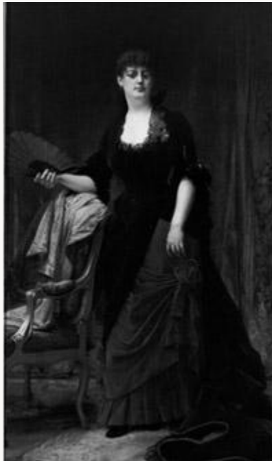
Fig. 6, Alexandre Cabanel, French, 1823-1889, Mrs. Collis Huntington , 1882. Oil on canvas, 85 1/4 x 50 1/2 in. Fine Arts Museums of San Francisco, Gift of Archer M. Huntington, 40.3.11 [return to text]