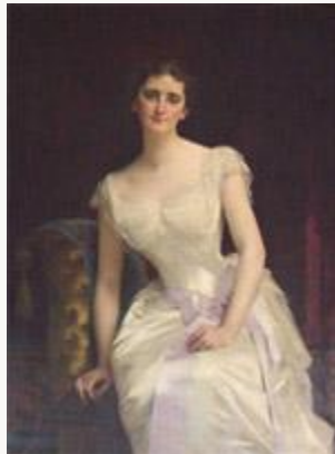
Fig. 3, Alexandre Cabanel, Mary Leiter , 1887. Oil on canvas. Derbyshire, England, Kedleston Hall; National Trust for Places of Historic Interest, United Kingdom [larger image]