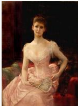
Fig. 8, Alexandre Cabanel, Olivia Peyton Murray Cutting , 1887. Oil on canvas. New York, Museum of the City of New York. [return to text]