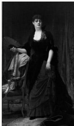
Fig. 6, Alexandre Cabanel, French, 1823-1889, Mrs. Collis Huntington , 1882. Oil on canvas, 85 1/4 x 50 1/2 in. Fine Arts Museums of San Francisco, Gift of Archer M. Huntington, 40.3.11 [larger image]