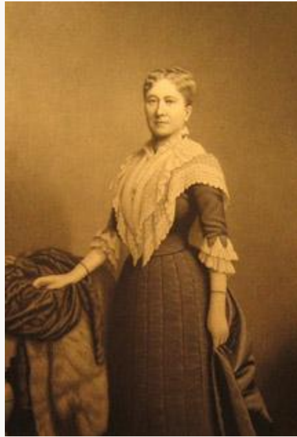
Fig. 9, Catharine Lorillard Wolfe , undated. Engraving. Reproduced in Spooner 1907, pp. 282-283. [return to text]