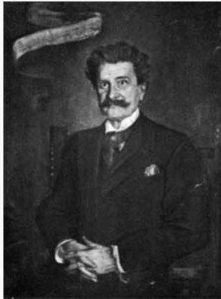
Fig. 4, Franz von Lenbach, Johann Strauss , ca. 1895. Oil on canvas. Location unknown [return to text]