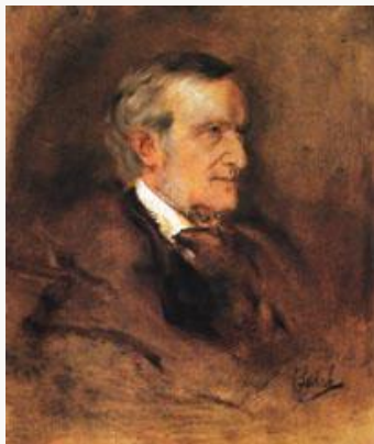
Fig. 5, Franz von Lenbach, Richard Wagner , 1881/82. Oil and graphite on cardboard. Städtische Galerie im Lenbachhaus, Munich [larger image]

None of Lenbach's clients seemed to have welcomed this new technique as enthusiastically as Richard Wagner did. The composer and his wife carefully cultivated his reputation, working to popularize a quite specific public image. [16] Lenbach clearly played a role in this process, painting no less than four images of Wagner. One of these, a half-length portrait in false profile from 1881–82 (fig. 5), merits closer consideration.