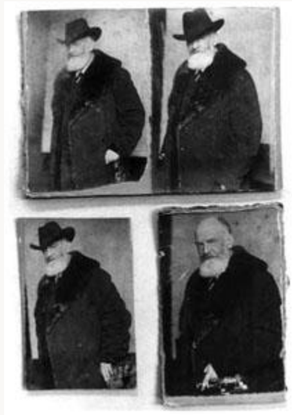
Fig. 2, Karl Hahn, Four Portrait Studies of Georg Ebers , ca. 1895. Photographs. Lenbacharchiv Neven-Dumont, Cologne [return to text]