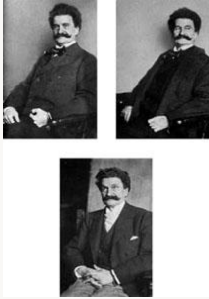
Fig. 3, Unknown photographer, Three Portrait Studies of Johann Strauss , ca. 1895. Lenbacharchiv Neven-Dumont, Cologne [return to text]