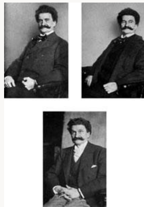
Fig. 3, Unknown photographer, Three Portrait Studies of Johann Strauss, ca. 1895. [larger image]

Lenbach's portrait of Johann Strauss serves to illustrate this method. The composer commissioned a portrait in 1895. Photographs were taken, then sketches were made, and then, in the absence of the client, the final picture was produced. The photographs (fig. 3) show the sitter looking in different directions—directly at the viewer, to the right, and toward the ceiling. They also record different hand positions. In one the left hand is drawn into a fist on the arm of the chair; in another his hands rest lightly on his thighs; in a third they are folded together in his lap. The artist appears to have been concerned with the creation of a harmonious distribution of light and dark areas, for he first had Strauss photographed in a black suit with dark tie, then in light trousers, dark jacket, and white cravat.