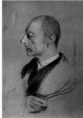
Fig. 1, Franz von Lenbach, Giapello , ca. 1865/66. Pastel on cardboard. Städtische Galerie im Lenbachhaus, Munich [larger image]

telling detail: from the narrowed eyes, parted lips, and slightly protruding lower jaw, we get the impression that the actor is speaking, probably reciting a dramatic line.