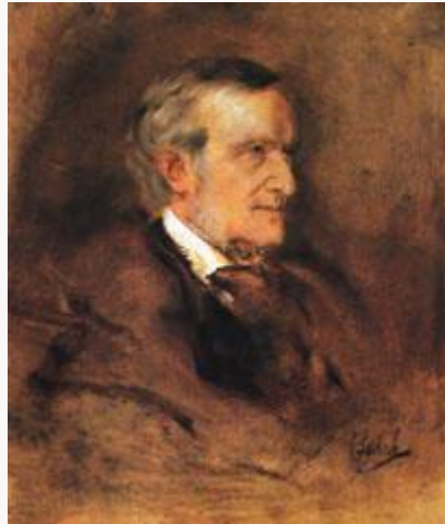
Fig. 5, Franz von Lenbach, Richard Wagner , 1881/82. Oil and graphite on cardboard. Städtische Galerie im Lenbachhaus, Munich [return to text]