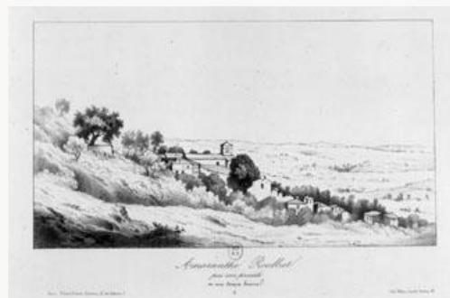
Fig. 5, Landscape . The inscription below reads "Amaranthe Rouillet, done in half an hour with the help of his process." Lithograph in Rouillet's 1843 album. [larger image]