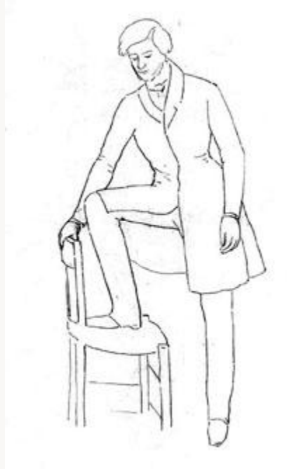
Fig. 1, Portrait of a man standing with his right foot placed on a chair. Charcoal drawing [return to text]