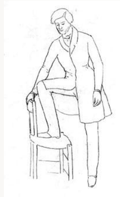
Fig. 1, Portrait of a man standing with his right foot placed on a chair . Charcoal drawing [larger image]