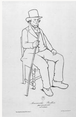
Fig. 4, Portrait of seated man . The inscription below reads "Amaranthe Rouillet, done in two minutes with the help of his process." Lithograph in Rouillet's 1843 album. [larger image]