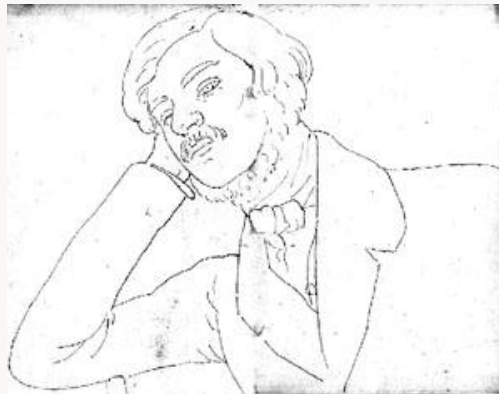
Fig. 2, Shoulder-length portrait of the same model as in fig. 1 . Charcoal drawing [larger image]

Once the experiments had been corrected, repeated several times, and studied again, the Rouillet Process was approved by the government. The final report appeared in Le Moniteur on 22 January 1844. There was no longer a preoccupation with the "mechanization" of observation that had been opposed so strongly by Raoul-Rochette: "As for now, it seems to us that the apparatus of M. Rouillet is particularly useful to artists; no shortcut process is easier or yields more good results. We do not think that it discourages one from learning how to draw. On the contrary, we believe it serves draftsmen well by saving them time, and painful trials and errors." [30]