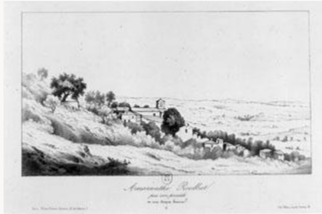
Fig. 5, Landscape . The inscription below reads "Aramanthe Rouillet, done in half an hour with the help of his process." Lithograph in Rouillet's 1843 album. [return to text]