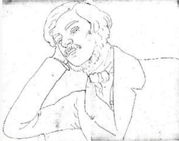
Fig. 2, Shoulder-length portrait of the same model as in fig. 1. Charcoal drawing [return to text]