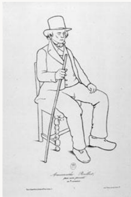
Fig. 4, Portrait of seated man . The inscription below reads "Aramanthe Rouillet, done in two minutes with the help of his process." Lithograph in Rouillet's 1843 album. [return to text]