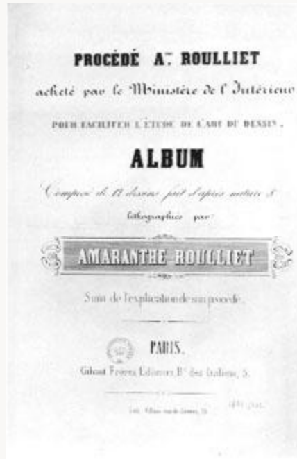
Fig. 3, Title page and cover of Rouillet's 1843 album.. Charcoal drawing [return to text]