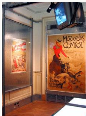
Fig. 4, Théophile Steinlen, Motocycles Comiot , 1899. [view image & full caption]

Another area of the show focused on the aggressiveness of the press. As dailies and weeklies increased in number, publishers struggled to attract new readers and to keep the old ones. They began to actively solicit advertisements for the pages of their publications; likewise, an aggressive publicity campaign was launched, via posters, to advertise the existence of new publications. Publishers also intensified the rhetoric of their visual style. One ominous image dominated this section of the show. The poster for La Lanterne , a republican periodical opposed to the clerical domination of French society, represented a frightening figure of a vampire-like priest hovering over the newly constructed church of the Sacré Coeur in Montmartre (fig. 5). Contemporary Parisians would have understood that, in the battle between church and state, La Lanterne clearly opposed the control of the former over the latter, since this section of the city was considered the freest in the city.