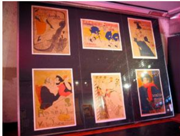
Fig. 2, Installation view of "La Belle Époque de la pub," with Pierre Bonnard's poster, La Revue Blanche , 1894. [return to text]