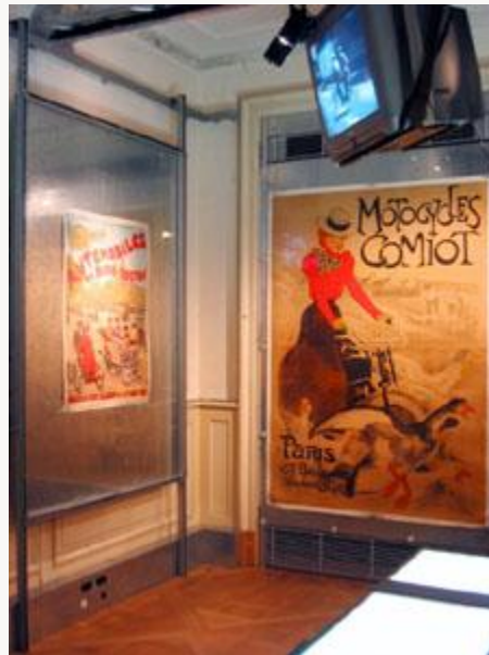
Fig. 4, Théophile Steinlen, Motocycles Comiot , 1899. [return to text]