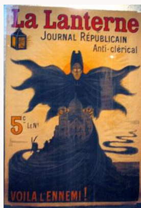
Fig. 5, Eugène Oge, La Lanterne , 1902. [view image & full caption]

Another area of the show focused on the aggressiveness of the press. As dailies and weeklies increased in number, publishers struggled to attract new readers and to keep the old ones. They began to actively solicit advertisements for the pages of their publications; likewise, an aggressive publicity campaign was launched, via posters, to advertise the existence of new publications. Publishers also intensified the rhetoric of their visual style. One ominous image dominated this section of the show. The poster for La Lanterne , a republican periodical opposed to the clerical domination of French society, represented a frightening figure of a vampire-like priest hovering over the newly constructed church of the Sacré Coeur in Montmartre (fig. 5). Contemporary Parisians would have understood that, in the battle between church and state, La Lanterne clearly opposed the control of the former over the latter, since this section of the city was considered the freest in the city.