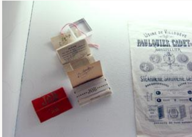
Fig. 7, Installation view of "La Belle Époque de la pub," with Job cigarette papers in display case. [return to text]