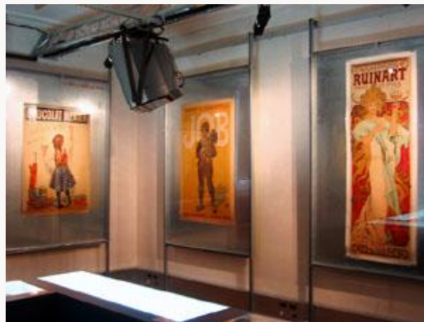
Fig. 8, Installation view of "La Belle Époque de la pub," with Job poster, 1889, and other posters. [return to text]