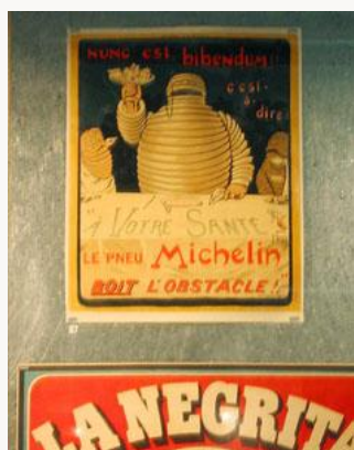
Fig. 6, Le Pneu Michelin . [view image & full caption]

markings to represent tire treads. The first advertisements for Michelin tires were indeed comical (fig. 6). A second, and equally important consumer product was cigarette paper. Since one of the most famous advertising images of the turn of the century—Alfons Mucha's poster of a femme fatale smoking a cigarette—was produced in this era, the organizers of the exhibition went to some lengths to elaborate on this product, and even arranged some of the original Job papers in a glass case (fig. 7). The Mucha poster was not included in the show, but the first poster designed for Job was on display; this featured a chimney sweep rather than a beautiful woman (fig. 8). During the 1890s, as the company tried to expand its audience, it targeted women and a more fashionable, international crowd by exchanging the early male icon for the female one. In the end, it was Mucha's image that became forever linked with Job in the mind of consumers from this era and beyond.