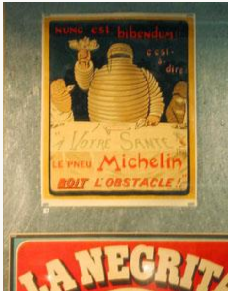
Fig. 6, Le Pneu Michelin . [return to text]