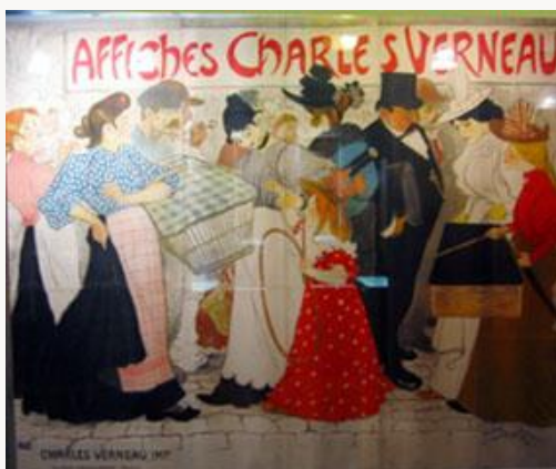
Fig. 3, Théophile Steinlen, La Rue, Affiches Charles Verneau , 1900.