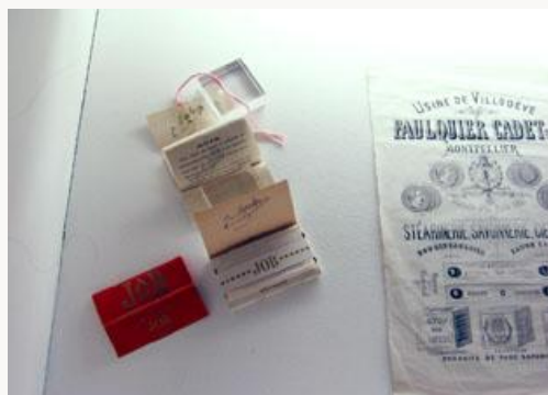
Fig. 7, Installation view of "La Belle Époque de la pub," with Job cigarette papers in display case. [view image & full caption]