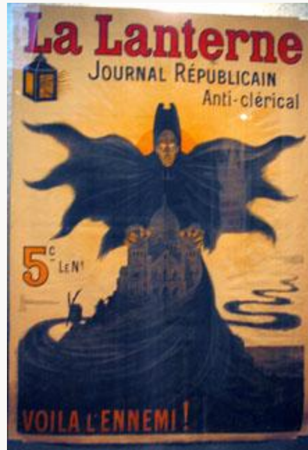
Fig. 5, Eugène Oge, La Lanterne , 1902. [return to text]