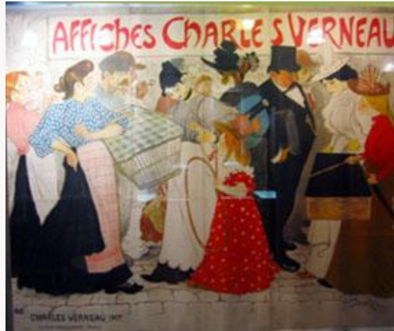
Fig. 3, Théophile Steinlen, La Rue, Affiches Charles Verneau , 1900. [return to text]