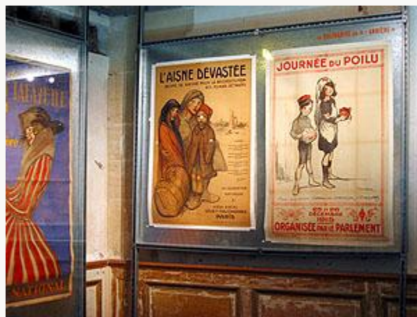
Fig. 9, Installation view of "La Belle Époque de la pub," with Théophile Steinlen's L'Aisne dévastée , 1918, and Francisque Poulbot's Journée du Poilu , 1915. [return to text]