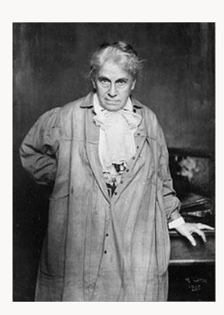
Fig. 2, Madame d'Ora, Photograph of Tina Blau, 1915. Bildarchiv, Österreichishe Nationalbibliothek. [larger image]

Her story offers ample documentation through which to examine the silencings of a modern woman artist's life—one who was omitted from the Secession's selective ancestor cult and from modern histories of Austrian art, and literally erased from public spaces through institutionalized anti-Semitism in the late 1930s. Instead of being celebrated as a precursor to the modern values of the fin-de-siècle, Blau was mistakenly called a student of her male peer, Emil Jakob Schindler, which placed her in the role of follower rather than independent discoverer. Blau had a significant public exhibition record and was critically successful and financially independent early on, drawing considerable envy from her male peers and even her teacher August Schaeffer when she had a series of one-person shows and