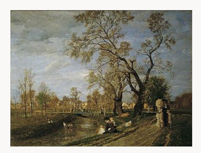
Fig. 3, Tina Blau, Spring at the Prater [Frühling im Prater] , 1882. Oil on canvas. Vienna, Österreichishe Galerie [return to text]