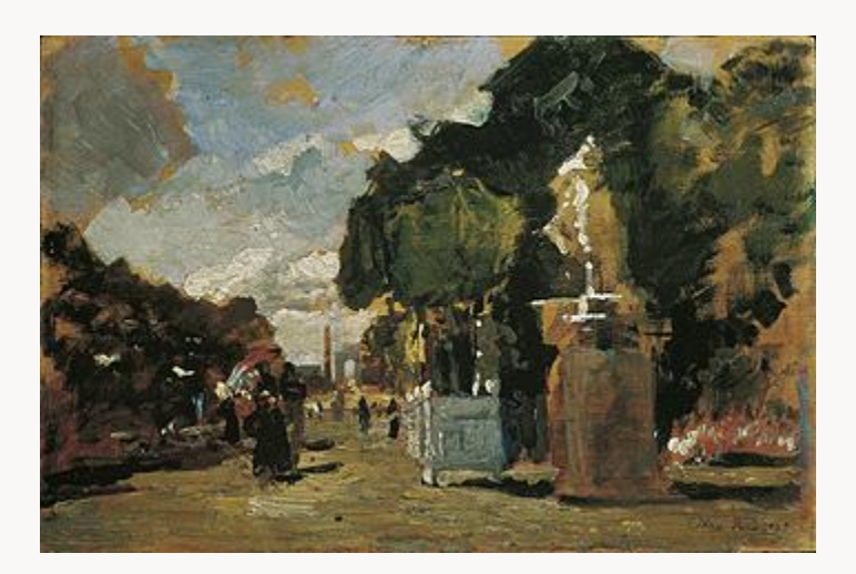
Fig. 1, Tina Blau, In the Tuileries Gardens (Sunny Day) , 1883. Oil on canvas. Vienna, Österreichishe Galerie [return to text]