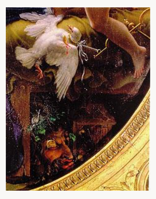
Fig. 12, Danaë, Daughter of Acrisius (detail), 1799. [return to text]