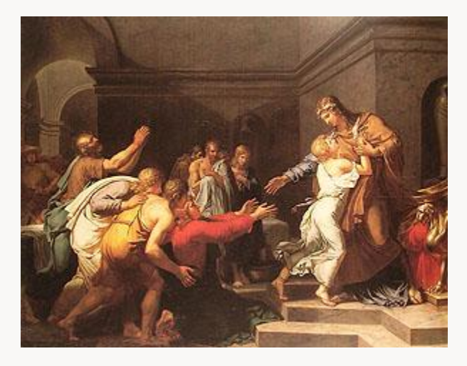
Fig. 3, Joseph Recognized by his Brothers, 1789. [return to text]