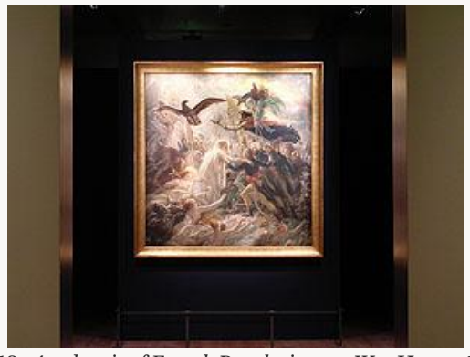
Fig. 13, Apotheosis of French Revolutionary War Heroes, 1801. [view image & full caption]

kind of overall visual unity that is perhaps unique to this composition. Finally Girodet's Apotheosis both captures and anticipates something of the madness and unreality of the whole Napoleonic venture—a fitting tribute, not without irony, to that most extravagant dreamer of all.[4]