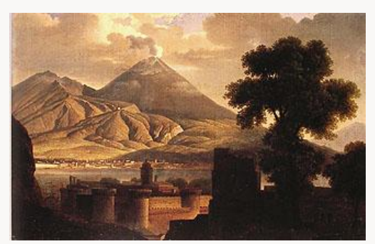
Fig. 7, View of Vesuvius , 1793-94. [view image & full caption]