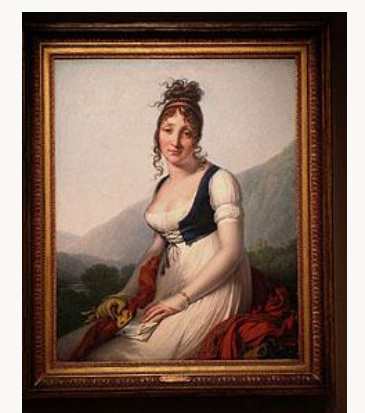
Fig. 26, Comtesse de Bonneval , 1800. [view image & full caption]