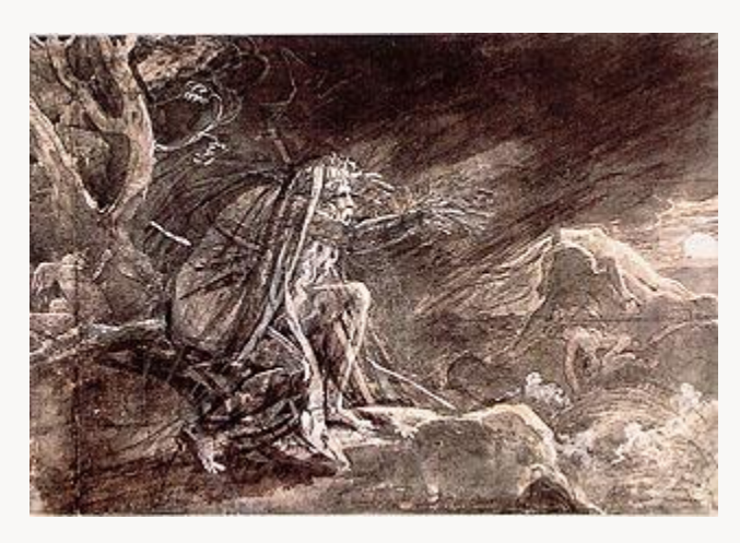
Fig. 14, The Song of Armin. [return to text]