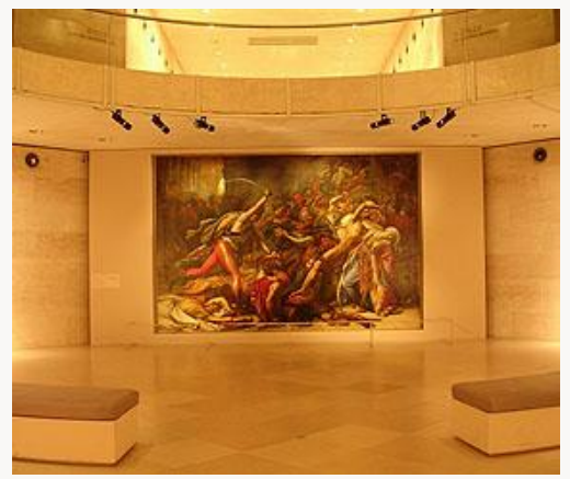
Fig. 1, Entrance to the Girodet exhibition with Revolt in Cairo . [view image & full caption]