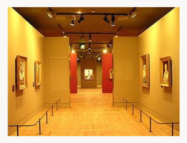
Fig. 21, Corridor of Portraits. [return to text]