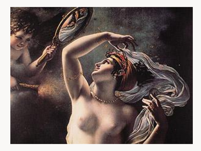
Fig. 9, Danaë (detail), 1798. [return to text]