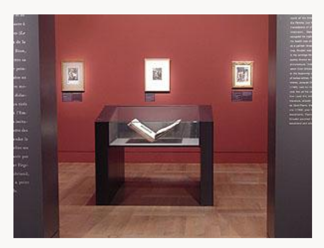
Fig. 17, Exhibition Room of Drawings for Illustrated Books. [return to text]