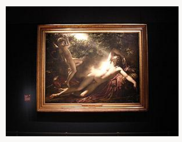
Fig. 5, The Sleep of Endymion, 1790. [return to text]