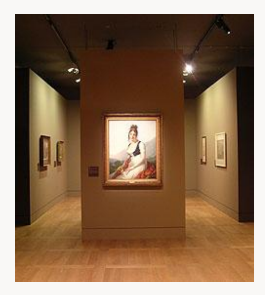
Fig. 25, Gallery with Comtesse de Bonneval, 1800. [return to text]