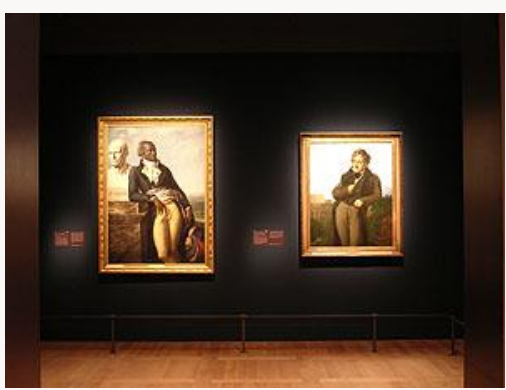
Fig. 19, Exhibition Room with Portraits of Chateaubriand and Citizen Belley . [view image & full caption]