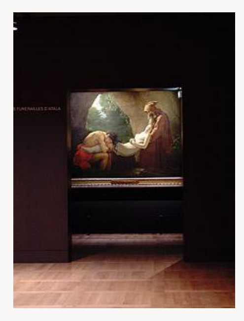
Fig. 16, Entrance to the room with The Funeral of Atala , 1808. [return to text]