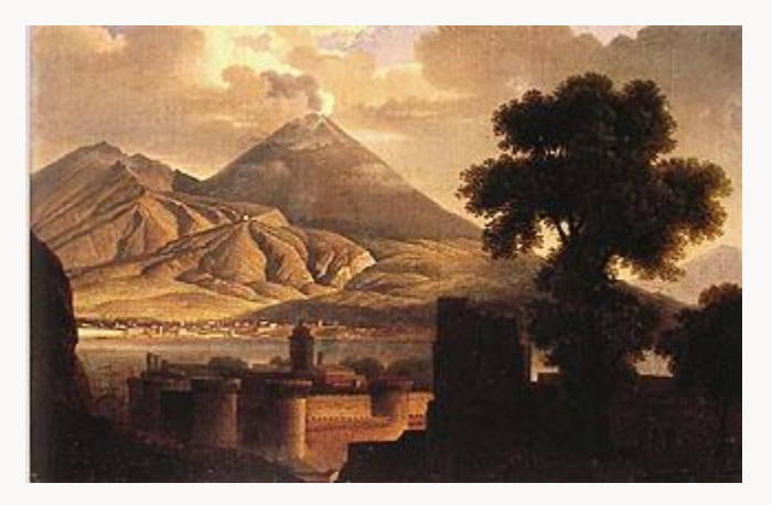
Fig. 7, View of Vesuvius, 1793-94. [return to text]