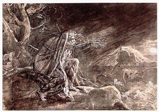
Fig. 14, The Song of Armin . [view image & full caption]

In the next room of the Louvre exhibition the visitor finds a selection of ten of Girodet's Ossianic drawings. There is an obvious debt in these drawings to both Fuseli and Flaxman, whose work Girodet knew well from his Roman sojourn. The real innovation of these drawings may well be, as the cataloguer Carter Foster suggests, a technical one, the pervasive heightening with white gouache that imparts such a strange, disembodied quality to these works (fig. 14).