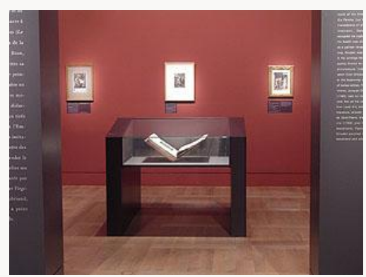
Fig. 17, Exhibition Room of Drawings for Illustrated Books. [view image & full caption]

In what is by far his most imposing history painting, The Revolt in Cairo (1810, fig. 1), Girodet demonstrates that even a modern historic event has the capacity to fire his quirky imagination. Commissioned in 1809 by Napoleon, through Vivant Denon, to decorate the galerie de Diane in the Tuileries Palace, The Revolt in Cairo reenacts a minor, but especially bloody episode of the Egyptian campaign: the 1798 uprising in Cairo of indigenous Mamelukes against their French occupants. The revolt was swiftly repressed, and it is the brutal crushing of the insurrection by French Revolutionary soldiers, rather than the uprising itself, that is the proper subject of Girodet's painting. Girodet's assigned military theme, however, posed an exceptional challenge: the 1798 revolt in Cairo was a poorly documented event with few eye witness accounts, and there were neither celebrated French officers, nor daring heroic feats associated with the incident. But as we shall see, Girodet managed to capitalize on what would have been a severe handicap for most of his contemporaries, and turn the limitations of the commission to his distinct advantage.