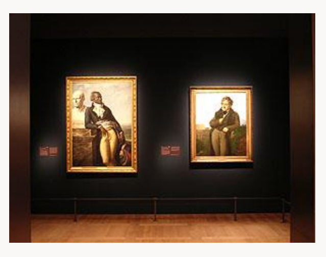
Fig. 19, Exhibition Room with Portraits of Chateaubriand and Citizen Belley. [return to text]