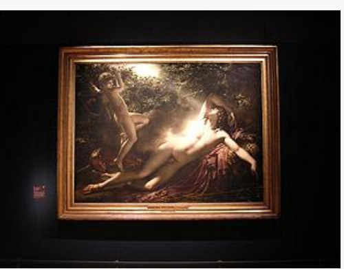
Fig. 5, The Sleep of Endymion , 1790. [view image & full caption]