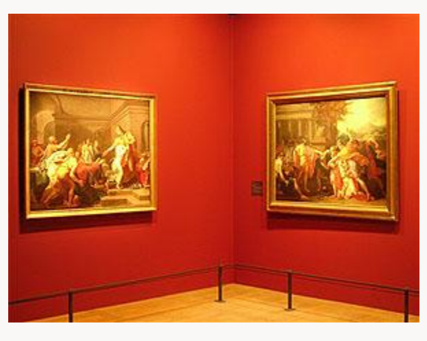
Fig 2, First room of exhibition with Joseph Recognized by his Brothers (left) and The Assassination of Tatius (right). [return to text]