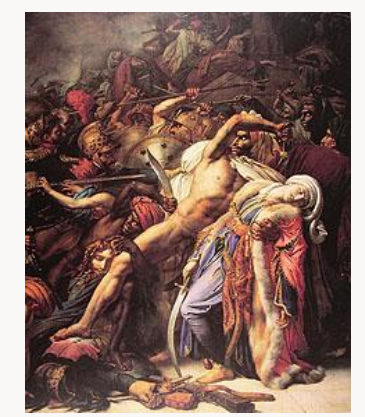
Fig. 18, Revolt in Cairo (detail), 1810. [view image & full caption]