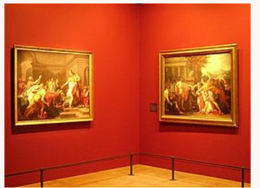
Fig 2, First room of exhibition with Joseph Recognized by his Brothers (left) and The Assassination of Tatius (right). [view image & full caption]