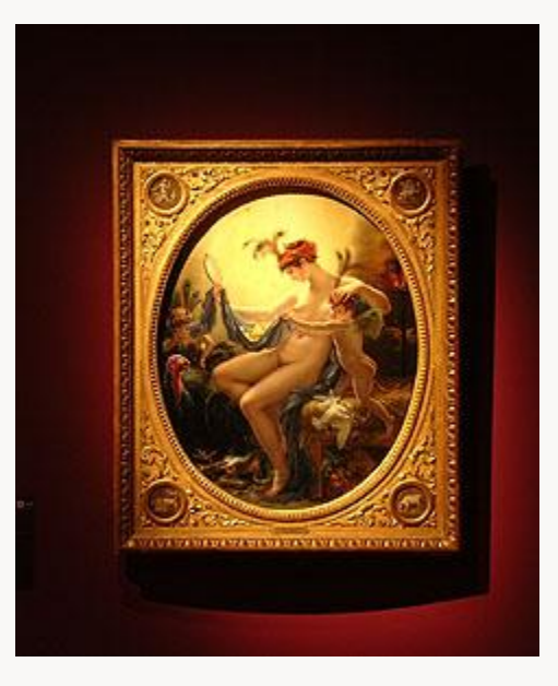
Fig. 11, Danaë, Daughter of Acrisius, 1799. [return to text]