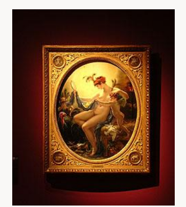
Fig. 11, Danaë, Daughter of Acrisius, 1799. [view image & full caption]