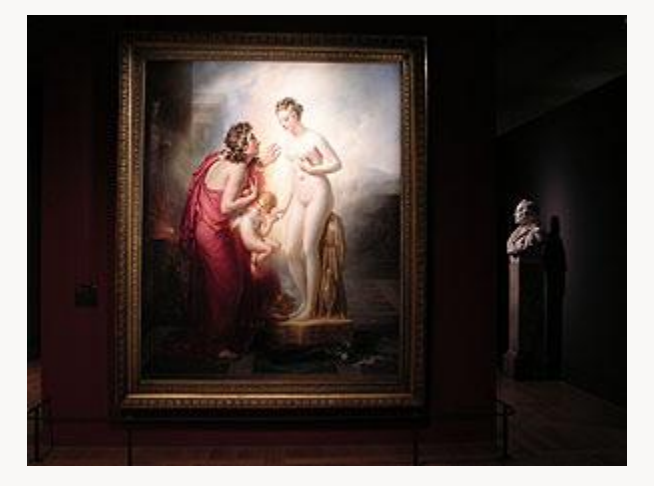
Fig. 24, Pygmalion and Galatea, 1813-19. [return to text]