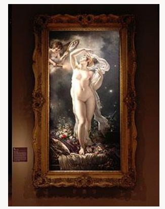
Fig. 8, Danaë , 1798. [view image & full caption]

pair of butterflies hovering behind the strings of the lyre, and a pair of doves partially enveloped by drapery, court under the spell of the music.