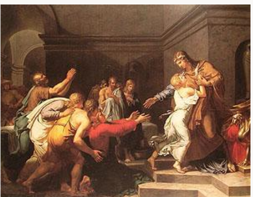
Fig. 3, Joseph Recognized by his Brothers, 1789. [view image & full caption]