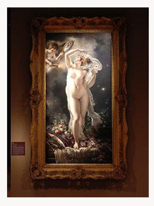
Fig. 8, Danaë, 1798. [return to text]