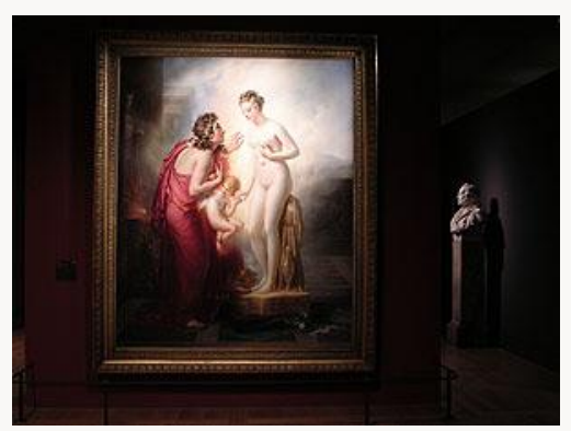
Fig. 24, Pygmalion and Galatea , 1813-19. [view image & full caption]

There are a few deceptions in the Louvre exhibition. Both the room of Oriental studies entitled "Heads and Turbans, Amazons and Odalisques," and the room of commissioned portraits that follows are rather disappointing. Many of these otherwise attractive pictures sorely lack the mind-stretching, intellectual dimension of Girodet's more ambitious paintings. On the other hand, for sheer eye-ravishing beauty few paintings of the period surpass Girodet's voluptuous portrait of the Comtesse de Bonneval (figs. 25 and 26), formerly in the collection of Mario Praz. Girodet's early Death of Camilla of 1785, his first important Davidian exercise, is curiously absent from the retrospective. The painting would have served as an instructive foil for the more experimental history pictures that immediately followed it. In addition, two essential drawings, which were both in the 1967 retrospective, were not borrowed for the present exhibition: the self-portrait of 1824 (Musée des Beaux-Arts, Orleans) and the moving deathbed scene of his beloved adoptive father Dr. Trioson (Musée Girodet, Montargis)—one of the very few works in which the pathologically secretive Girodet confides deep, private emotion. But these criticisms are minor. This exemplary exhibition is a revelation and it is certain to elevate Girodet to the more prominent position in the history of French painting he deserves.