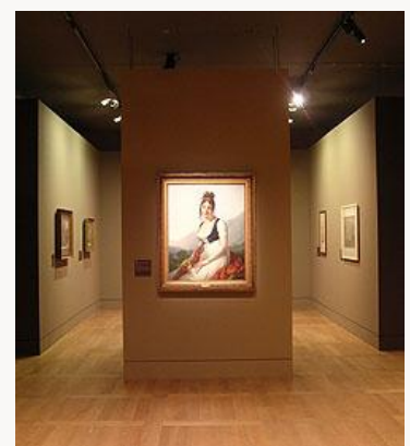
Fig. 25, Gallery with Comtesse de Bonneval , 1800. [view image & full caption]

There are a few deceptions in the Louvre exhibition. Both the room of Oriental studies entitled "Heads and Turbans, Amazons and Odalisques," and the room of commissioned portraits that follows are rather disappointing. Many of these otherwise attractive pictures sorely lack the mind-stretching, intellectual dimension of Girodet's more ambitious paintings. On the other hand, for sheer eye-ravishing beauty few paintings of the period surpass Girodet's voluptuous portrait of the Comtesse de Bonneval (figs. 25 and 26), formerly in the collection of Mario Praz. Girodet's early Death of Camilla of 1785, his first important Davidian exercise, is curiously absent from the retrospective. The painting would have served as an instructive foil for the more experimental history pictures that immediately followed it. In addition, two essential drawings, which were both in the 1967 retrospective, were not borrowed for the present exhibition: the self-portrait of 1824 (Musée des Beaux-Arts, Orleans) and the moving deathbed scene of his beloved adoptive father Dr. Trioson (Musée Girodet, Montargis)—one of the very few works in which the pathologically secretive Girodet confides deep, private emotion. But these criticisms are minor. This exemplary exhibition is a revelation and it is certain to elevate Girodet to the more prominent position in the history of French painting he deserves.