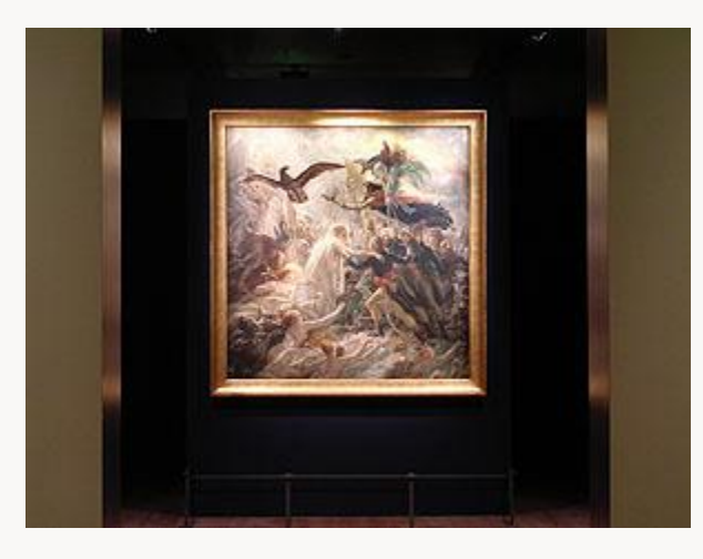
Fig. 13, Apotheosis of French Revolutionary War Heroes, 1801. [return to text]