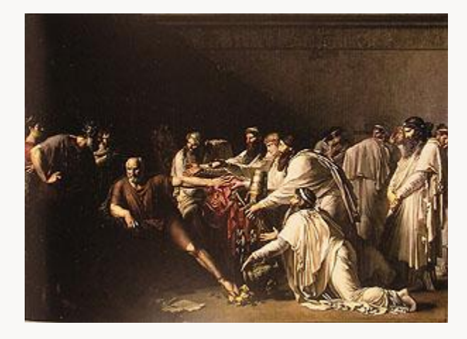
Fig. 6, Hippocrates Refusing the Gifts of Artaxerxes, 1792. [return to text]