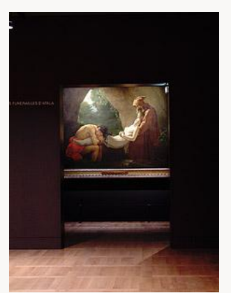
Fig. 16, Entrance to the room with The Funeral of Atala , 1808. [view image & full caption]