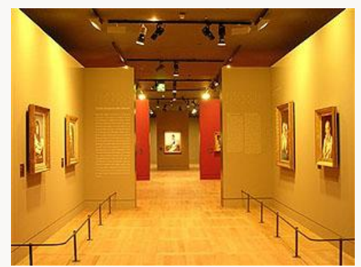
Fig. 21, Corridor of Portraits. [view image & full caption]