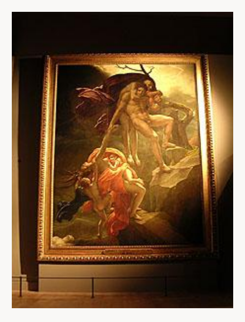
Fig. 15, Scene from a Deluge, 1806. [return to text]