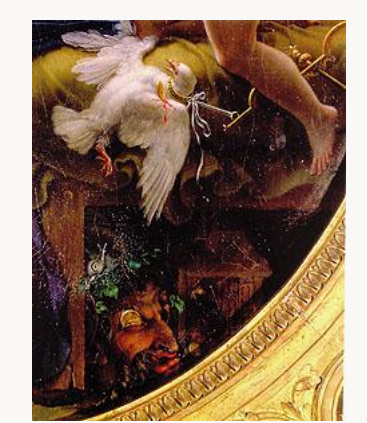
Fig. 12, Danaë, Daughter of Acrisius (detail), 1799. [view image & full caption]