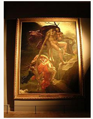
Fig. 15, Scene from a Deluge , 1806. [view image & full caption]

There is important evidence that Girodet intended his Deluge to be comprehended on another level, as a modern allegory of political deception and betrayal. In September 1806 Girodet wrote of his Salon painting for the Journal de Paris : "How many people, set upon the reefs of the world and in the midst of social tempests, entrust, like this family, their health