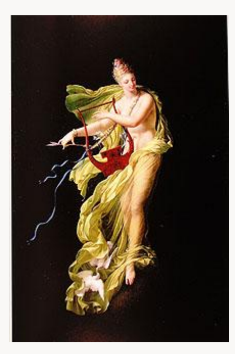
Fig. 10, Summer, 1800-2. [return to text]