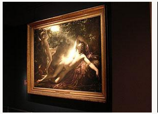
Fig. 4, Entrance to the room with The Sleep of Endymion , 1790. [view image & full caption]