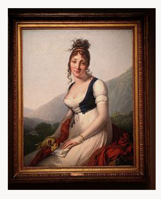
Fig. 26, Comtesse de Bonneval, 1800. [return to text]