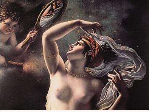
Fig. 9, Danaë (detail), 1798. [view image & full caption]