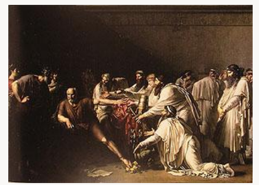
Fig. 6, Hippocrates Refusing the Gifts of Artaxerxes , 1792. [view image & full caption]