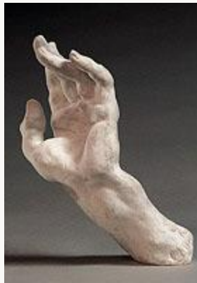
Fig. 5, Auguste Rodin, Left Hand (no. 26), ca. 1890? Plaster. Paris, Musée Rodin. [larger image]

many directions, upright on molded bases or prone on the glass shelf, the sculptures testified to the intensity of Rodin's fascination. They also demonstrated the range of his production, his self-proclaimed role as nature's "sublime copyist," and his unconventional belief that every part of the body—perhaps the hand most of all—was at least as expressive as the face.[7] The most interesting labels included unexpected descriptions of the works. Visitors were informed, for example, that Left Hand (no. 26) (fig. 5) was already considered a work unto itself by 1901 when a terracotta version was mounted and sold, and that Right Hand (no. 12) (fig. 6) suffers from a contraction of "intrinsic muscles" that forces the fingers to bend at right angles.[8] The sculptures were displayed alongside an ancient fragment, a bizarre arrangement of a female figure straddling a hand, and poignant agglomerations of hands and faces, such as Assemblage: Head of the Shade and Two Hands (dated by Marraud as probably being after 1900).[9] These juxtapositions reveal simultaneously the precedents for and the prescience of Rodin's work, which presaged the sculpture of the twentieth century.