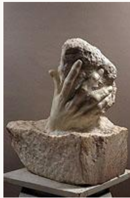
Fig. 1, Auguste Rodin, Hand of God, 1902. Marble. Paris, Musée Rodin. [larger image]