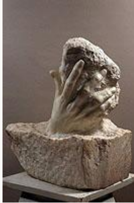
Fig. 1, Auguste Rodin, Hand of God, 1902. Marble. Paris, Musée Rodin. [return to text]