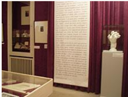
Fig. 3, View of installation. [return to text]