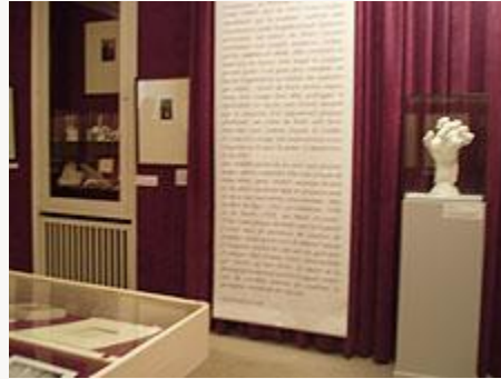
Fig. 3, View of installation. [larger image]