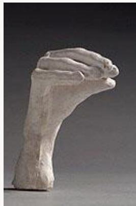
Fig. 6, Auguste Rodin, Right Hand (no. 12), ca. 1890? Plaster. Paris, Musée Rodin. [larger image]

Rodin was notorious during his lifetime for severing, re-working, and then re-attaching the body parts of his sculptures—although not necessarily to their "original" bodies. Decades