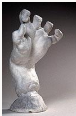
Fig. 4, Auguste Rodin, Large Clenched Left Hand . Plaster. Paris, Musée Rodin. [larger image]

The photographs that lined the walls on the right as one entered effectively established the intellectual conceit of the exhibition. [3] Period photographs of Rodin's first celebrated Salon works, The Age of Bronze , 1877, and Saint John the Baptist Preaching , and the important commission, The Burghers of Calais , 1889, seemed—at first glance—out of place. But the labels tied these sculptures to the larger theme of the show, emphasizing the importance of the "liberated gesture" in Rodin's oeuvre and setting the stage for the presentation of the hand as a legitimately autonomous subject. [4] Rodin's obsession with the hand seems to have begun in the last decades of the nineteenth century—although even his early Salon works bespeak a fascination with its expressive potential—and later visitors to his studio commented on his loving manipulation of these small works. An English sculptor noted that Rodin would "pick them up tenderly one by one and then turn them about" in the palm of his hand, [5] and the painter Gerald Kelly remembered the sculptor proudly showing them to anyone who asked to see them, turning the works in the light to reveal their contours. [6]