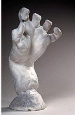
Fig. 4, Auguste Rodin, Large Clenched Left Hand . Plaster. Paris, Musée Rodin. [return to text]