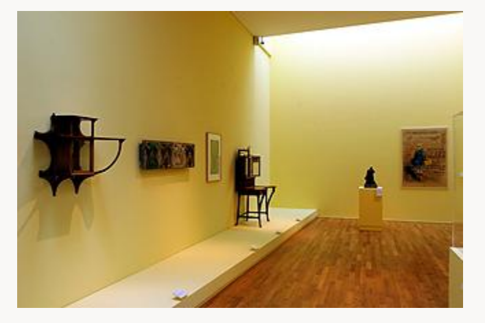
Fig. 18, Installation. [return to text]