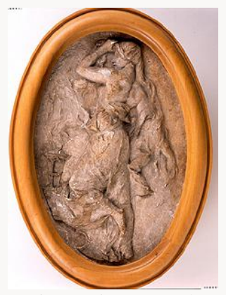
Fig. 29, Victor Prouvé. [view image & full caption]