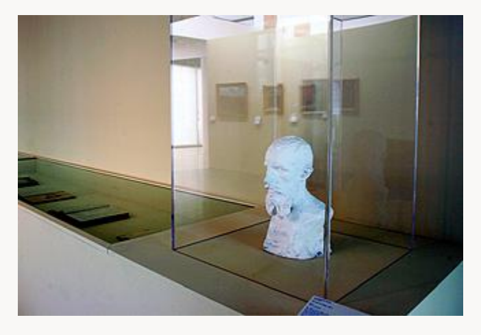
Fig. 10, Installation. [return to text]