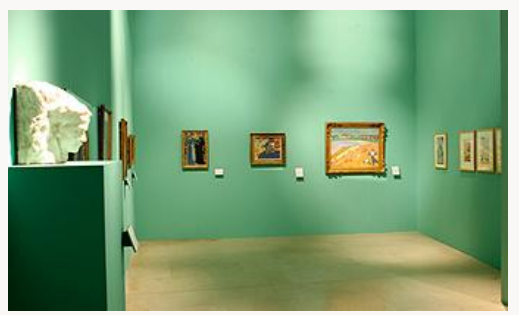
Fig. 12, Installation. [view image & full caption]

Curiously, the critic was also interested in other painters who were not linked with the avant garde during this era. In referencing Alfred Roll, Jean-Charles Cazin or P.A.J. Dagnan-Bouveret, Marx was judged a notable independent voice, one that didn't hold the party line (fig. 13 and fig. 14). He found originality amidst those painters with a decidedly more conservative bent, placing the importance on the finished art work and its symbolic message, above any particular political inference or position that an artist might hold. In this regard, Marx's advocacy comes through passionately in the show; it reveals him as a devotée of diversity even though he was fervently interested in the progress of the avant garde. After leaving the first floor of the exhibition, visitors were confronted with a fuller range of Marx's interests reflective of the varied artistic approaches at work during the Third Republic, one that had as its main tenet the unification of the arts.