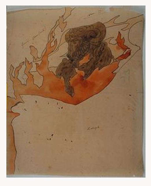
Fig. 25, Victor Prouvé, Watercolor for Salammbô. [return to text]