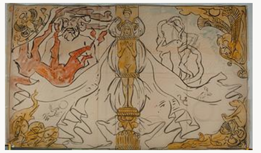
Fig. 26, Victor Prouvé, Watercolor for Salammbô. [view image & full caption]