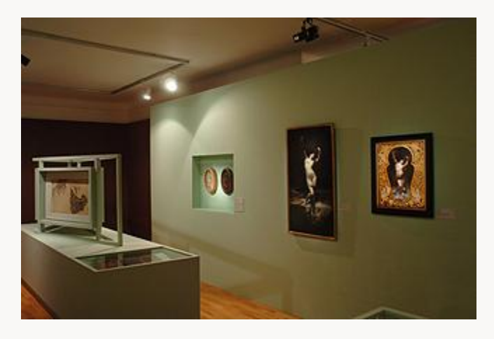
Fig. 21, Installation. [return to text]