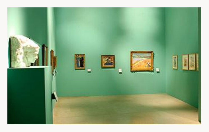
Fig. 12, Installation. [return to text]