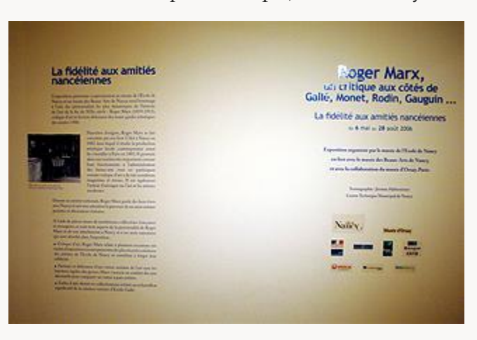
Fig. 1, Installation. [return to text]

All illustrations, except numbers 2, 8, 9, 16, 17, 20, which are taken from the catalogue of the exhibition, were obtained Courtesy of the Musée des Beaux-Arts, Nancy and the Musée de l'École de Nancy. Exhibition Installation: Jérôme Habersetzer, architect and Realisation: Centre technique municipal, Ville de Nancy.