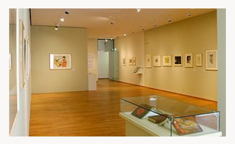
Fig. 4, Installation. [return to text]