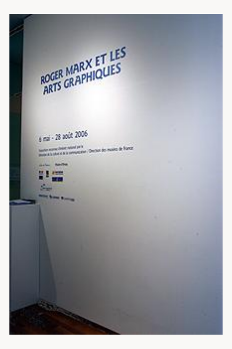
Fig. 3, Installation. [return to text]