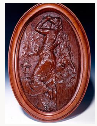
Fig. 30, Victor Prouvé. [view image & full caption]