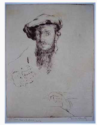
Fig. 9, Norbert Goeneutte. [view image & full caption]