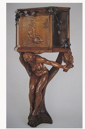
Fig. 16, Rupert Carabin. [view image & full caption]