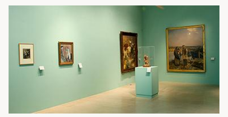
Fig. 13, Installation. [return to text]