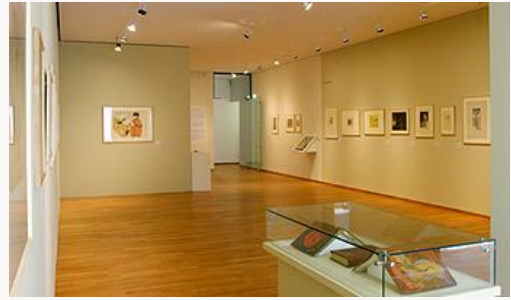
Fig. 4, Installation. [view image & full caption]