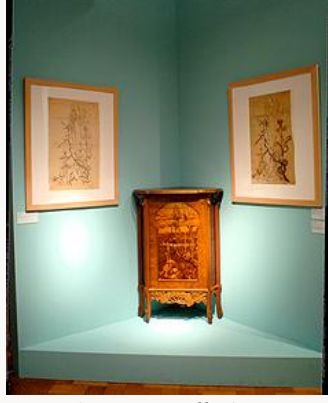
Fig. 19, Installation. [view image & full caption]

The complexity of the various artistic approaches of the time made it difficult for any one critic to be attuned to all the rapidly changing approaches. As a man of the nineteenth century, and as a figure deeply committed to the proposition that all the arts be united, Marx was seemingly less interested in the changes in painting that occurred after 1905. The exhibition bravely and quite successfully manages to deal with these issues, although it is often easier to address them in a catalogue than on the walls of an exhibition.