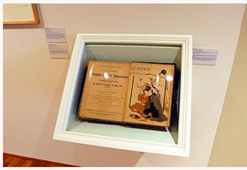
Fig. 7, Installation. [view image & full caption]