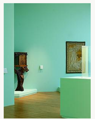
Fig. 15, Installation. [view image & full caption]

example (fig. 17). Since Marx was deeply committed to the beautification of French stamps, and to the designs used on the face and back of French bank-notes, objects of everyday use, he was interested in seeing that art was everywhere, and that the most mundane type of object was beautifully crafted. The exhibition makes this point absolutely clear, becoming in the process one of the first shows to demonstrate how art, ideology and practicality were melded during the Third Republic as many artists went to work for the government to make sure that controversial ideas were given visible form.