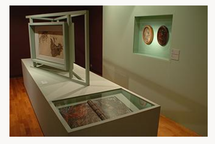
Fig. 28, Installation. [return to text]