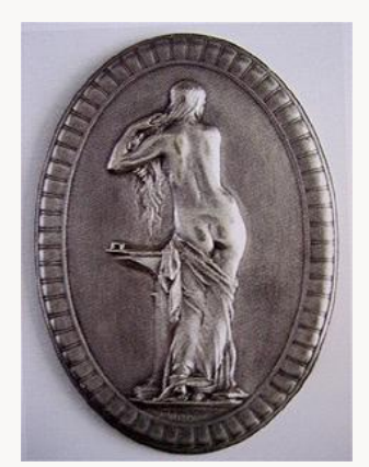
Fig. 17, Oscar Roty. [view image & full caption]

As the exhibition progressed, considerable attention was given to the ways in which a new art, an art nouveau style, was united with art with a social message. In the period between 1898-1913, the admiration that Marx held for the work of Charles Plumet—an architect—or René Lalique—a jeweler—suggested that art could exist in many spheres and that there could be many aspects of society that could be touched by various creators (fig. 18 and fig. 19). Deeply involved with the Paris World's Fair of 1900, Marx saw that this was a moment when modernity was apparent and historical styles were in full retreat. No matter which artists were shown, Marx came to their aid in numerous articles in the press seeing that the works of Félix Vallotton, Henri-Gabriel Ibels, Paul-Élie Ranson and others were among