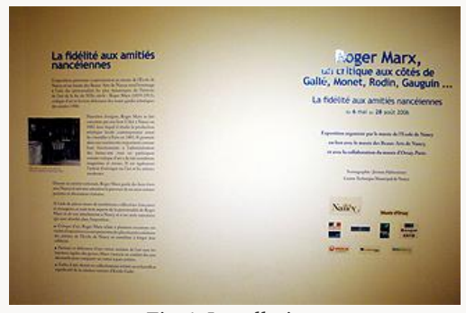
Fig. 1, Installation. [view image & full caption]

An awareness of creative Republicanism at the service of the visual arts has become strikingly apparent in the recent exhibition at the Musée des Beaux-Arts and the Musée de l'École de Nancy dedicated to the career, ideas and collecting of Roger Marx, one of the most enlightened supporters of the visual arts during the Third Republic. Roger Marx spent his entire career as a fervent promoter of "new" art; he was also a major proponent of the idea that all the arts should be regarded as equal—one of the basic tenets of the art nouveau movement at the close of the century (fig. 1 and fig. 2). Whether he wrote for newspapers, completed essays for exhibition catalogues, supported group shows, collected works of art for himself or lobbied behind the scenes as an advocate for various artistic causes, Marx recognized that the art of his own native region—Alsace-Lorraine and specifically the city of Nancy—also needed a strong and enlightened sponsor. He wanted the artists of his region to compete with Paris and other artistic centers outside of France. Advocating these positions with amazing dexterity and clear insight, Marx developed an intimate awareness of artistic creativity from frequent discussions with regional artists such as Émile Gallé, Émile Friant, and many others who became his close friends.