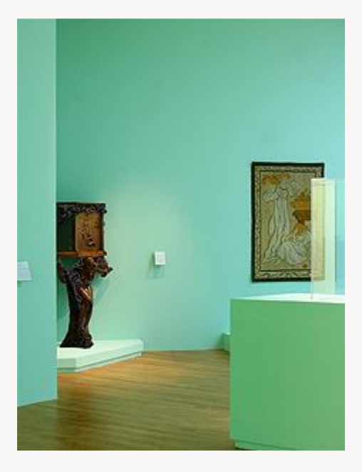
Fig. 15, Installation. [return to text]