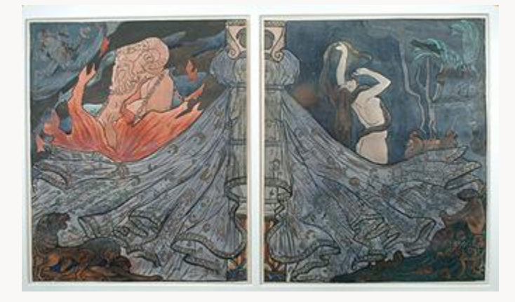
Fig. 27, Victor Prouvé, Watercolor for Salammbô. [return to text]