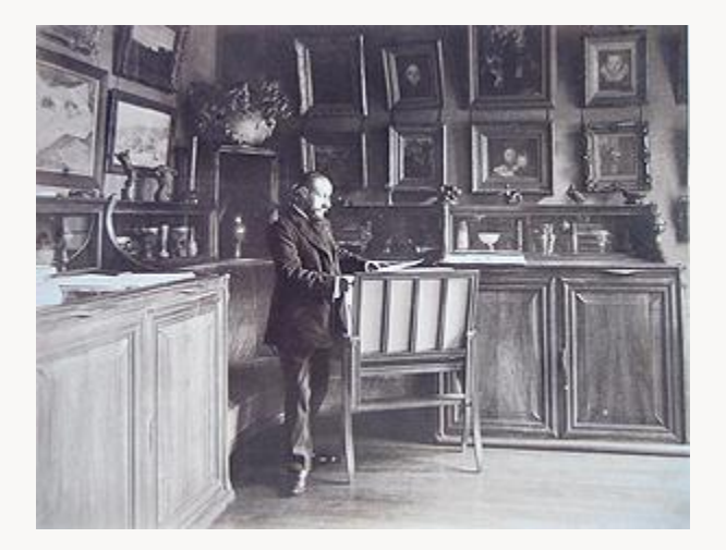
Fig. 8, Photograph. [return to text]