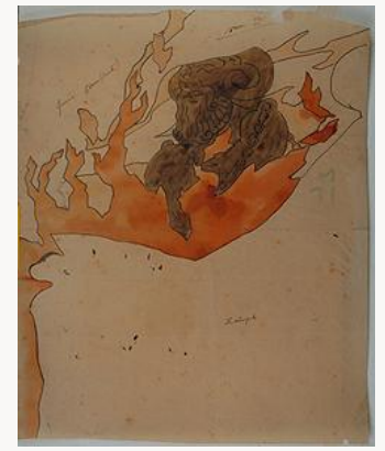
Fig. 25, Victor Prouvé, Watercolor for Salammbô. [view image & full caption]