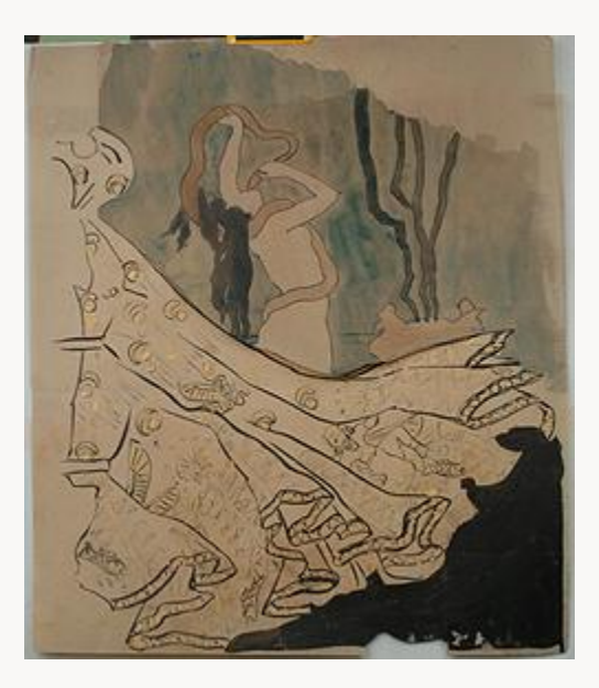
Fig. 24, Victor Prouvé, Watercolor for Salammbô. [return to text]