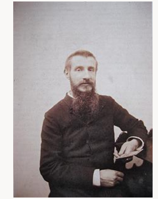
Fig. 2, Photograph. [view image & full caption]