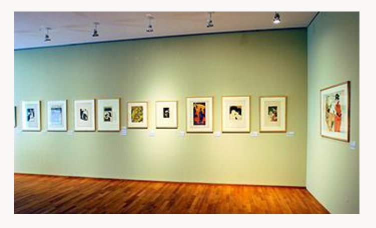
Fig. 6, Installation. [return to text]