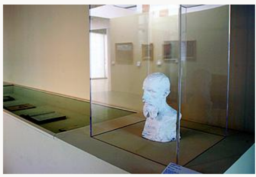
Fig. 10, Installation. [view image & full caption]

In the next section, "1882-1889: des Beaux-Arts à l'unité de l'art," Marx's interest in the applied arts emerged. His dedication to originality was objectified in works by Jules Chéret, vases by Emile Gallé and ceramics by Ernest Chaplet and Auguste Delaherche. The idea that historical styles should dominate creativity didn't hinder his thought process; instead he discovered what was unique in even the smallest object by individual creators (fig. 11). It is with this segment of the exhibition that Marx was shown to be much more than simply a chronicler of past accomplishments; he was opening art criticism to a more forceful probing of the decorative arts and the ways in which they could be enlisted to create a totally designed environment.