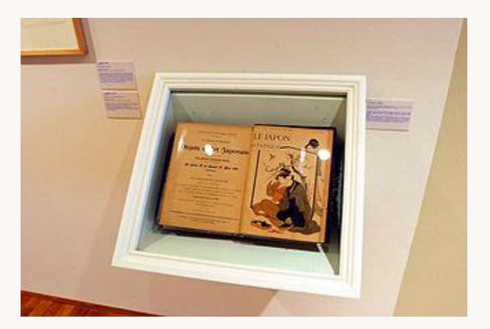
Fig. 7, Installation. [return to text]