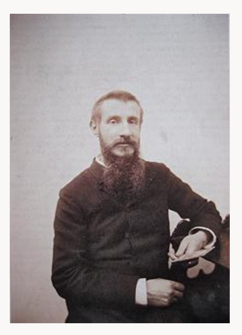
Fig. 2, Photograph. [return to text]