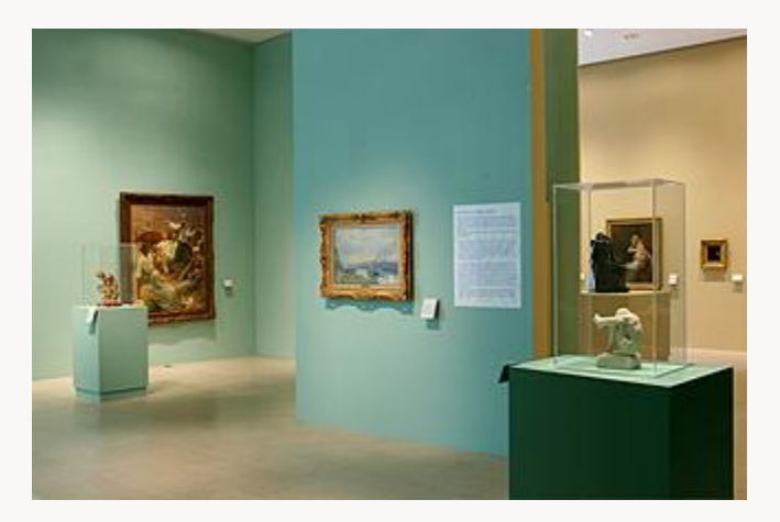
Fig. 14, Installation. [return to text]