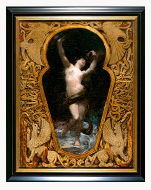
Fig. 22, Victor Prouvé, Salammbô, 1881. [return to text]