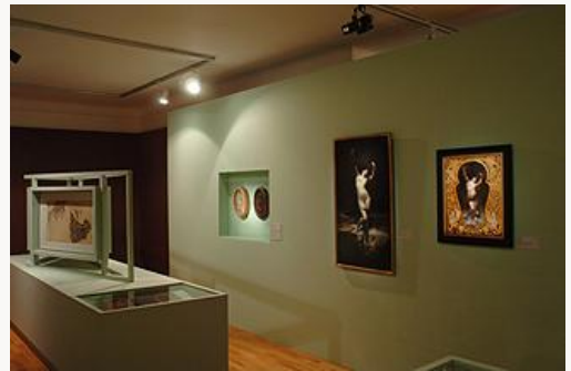
Fig. 21, Installation. [view image & full caption]

One of the major aspects of this exhibition, aside from the full integration of the graphic arts, was the way in which the decorative arts—especially objects produced in Nancy—were given their own space at the Musée de l'École de Nancy. The intellectual reason behind the shift had to do with the fact that the Nancy artists remained true to the ways in which Marx valued them, and were entitled to their own galleries. Here, Prouvé's works dedicated to the theme of Salammbô were given considerable attention; this image, one of the most supreme of the Symbolist conceits emanating out of Gustave Flaubert's construction of a femme fatale , was remarkably vivid. The Salammbô book cover, based on watercolors by Prouvé (fig. 21, figs. 22-27, fig. 28, fig. 29, fig. 30), made the case eminently clear that Symbolism and Art Nouveau were combined in a region that had as its major advocate one of the most sensitive and insightful writers of the nineteenth century.