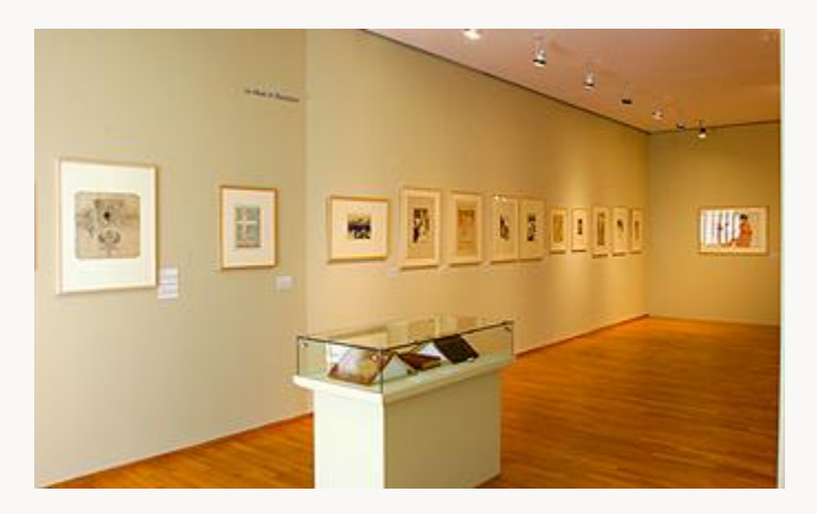
Fig. 5, Installation. [return to text]