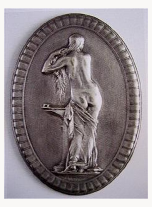
Fig. 17, Oscar Roty. [return to text]