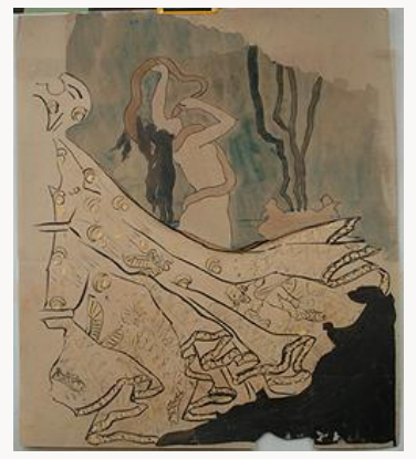
Fig. 24, Victor Prouvé, Watercolor for Salammbô. [view image & full caption]