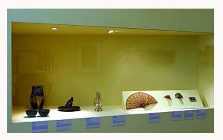
Fig. 11, Installation. [return to text]