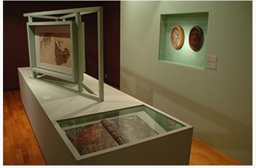
Fig. 28, Installation. [view image & full caption]