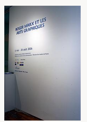
Fig. 3, Installation. [view image & full caption]