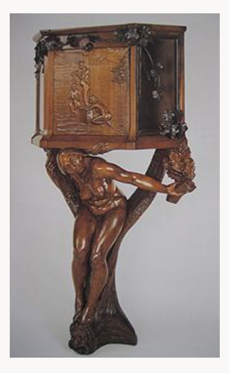
Fig. 16, Rupert Carabin. [return to text]