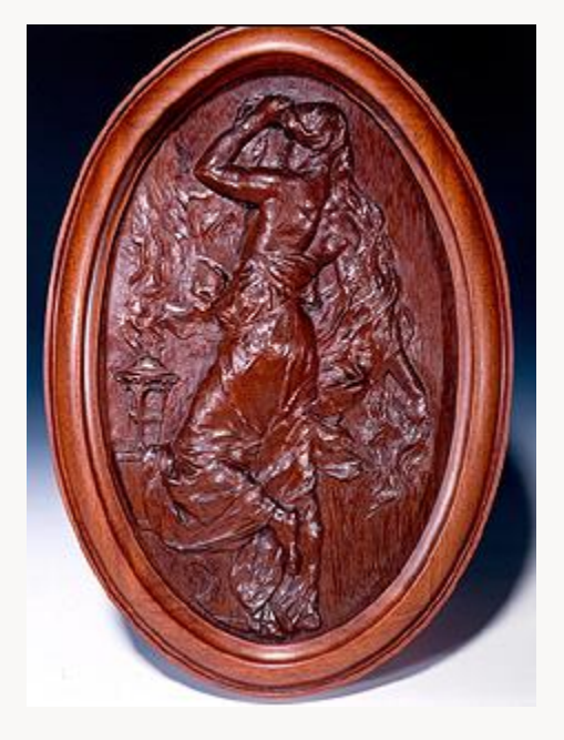
Fig. 30, Victor Prouvé. [return to text]