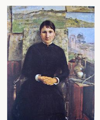
Fig. 20, Émile Friant, Portrait of Madame Petitjean, 1883. [view image & full caption]

One of the major aspects of this exhibition, aside from the full integration of the graphic arts, was the way in which the decorative arts—especially objects produced in Nancy—were given their own space at the Musée de l'École de Nancy. The intellectual reason behind the shift had to do with the fact that the Nancy artists remained true to the ways in which Marx valued them, and were entitled to their own galleries. Here, Prouvé's works dedicated to the theme of Salammbô were given considerable attention; this image, one of the most supreme of the Symbolist conceits emanating out of Gustave Flaubert's construction of a femme fatale , was remarkably vivid. The Salammbô book cover, based on watercolors by Prouvé (fig. 21, figs. 22-27, fig. 28, fig. 29, fig. 30), made the case eminently clear that Symbolism and Art Nouveau were combined in a region that had as its major advocate one of the most sensitive and insightful writers of the nineteenth century.