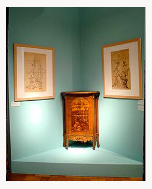
Fig. 19, Installation. [return to text]