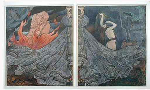
Fig. 27, Victor Prouvé, Watercolor for Salammbô. [view image & full caption]