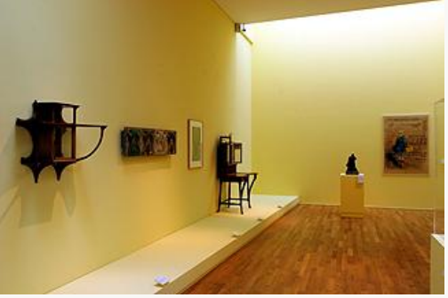
Fig. 18, Installation. [view image & full caption]

those that needed to be enthusiastically applauded for their originality. One issue emerges: since Marx was a devotée of the art of 1890s, it was only upon occasion that, after 1900, he was able to acknowledge the merit and contribution of any given artist. However, he singled out Paul Cézanne as a creator of exceptional merit and originality—a position with considerable perspicacity at the time.