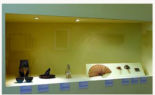
Fig. 11, Installation. [view image & full caption]

In the next section, "1882-1889: des Beaux-Arts à l'unité de l'art," Marx's interest in the applied arts emerged. His dedication to originality was objectified in works by Jules Chéret, vases by Emile Gallé and ceramics by Ernest Chaplet and Auguste Delaherche. The idea that historical styles should dominate creativity didn't hinder his thought process; instead he discovered what was unique in even the smallest object by individual creators (fig. 11). It is with this segment of the exhibition that Marx was shown to be much more than simply a chronicler of past accomplishments; he was opening art criticism to a more forceful probing of the decorative arts and the ways in which they could be enlisted to create a totally designed environment.