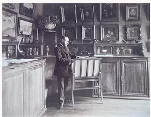
Fig. 8, Photograph. [view image & full caption]

wide range of artists involved in the printmaking movement sponsored by L'Estampe Originale . In order to highlight Marx's fascination with prints, the organizers cleverly placed photographs of the interior of his home showing his personal exhibition of the prints that reinforced the focus of his art criticism (fig. 8). This very convincing aspect of a show that aspired to demonstrate just how deeply committed Marx was to all areas of the visual arts even those not always considered as important as painting or sculpture—revealed that the graphic arts were central to his inclusive point of view (fig. 9). The only problem this reviewer can point to is the separation of the print section from the rest of the exhibition, most certainly due to the necessity of keeping the light in the galleries at a level suitable for the print medium. It might easily have been overlooked entirely by visitors, thereby vitiating one of the central tenets of the exhibition: Marx's dedication to prints in his writings.