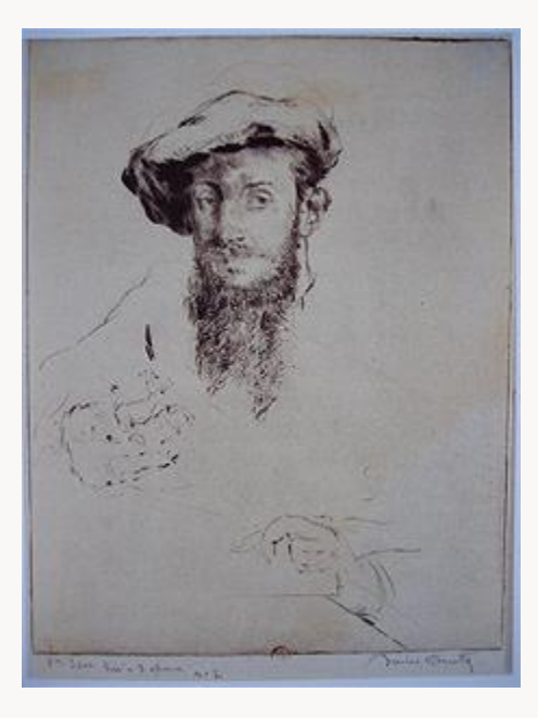
Fig. 9, Norbert Goeneutte. [return to text]