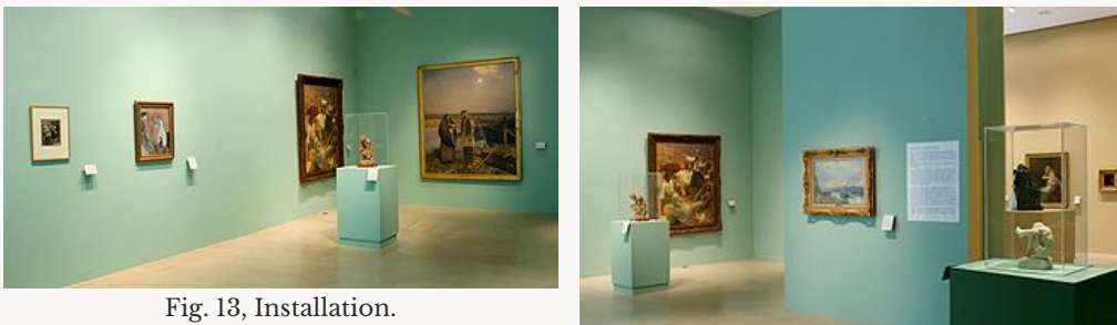
[view image & full caption]

Curiously, the critic was also interested in other painters who were not linked with the avant garde during this era. In referencing Alfred Roll, Jean-Charles Cazin or P.A.J. Dagnan-Bouveret, Marx was judged a notable independent voice, one that didn't hold the party line (fig. 13 and fig. 14). He found originality amidst those painters with a decidedly more conservative bent, placing the importance on the finished art work and its symbolic message, above any particular political inference or position that an artist might hold. In this regard, Marx's advocacy comes through passionately in the show; it reveals him as a devotée of diversity even though he was fervently interested in the progress of the avant garde. After leaving the first floor of the exhibition, visitors were confronted with a fuller range of Marx's interests reflective of the varied artistic approaches at work during the Third Republic, one that had as its main tenet the unification of the arts.