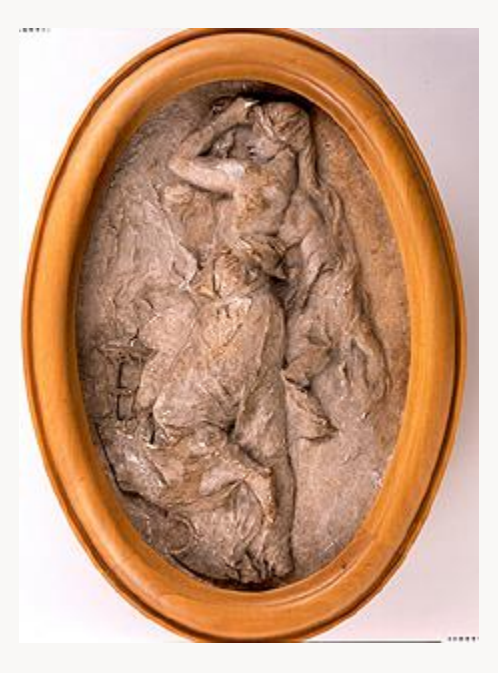
Fig. 29, Victor Prouvé. [return to text]