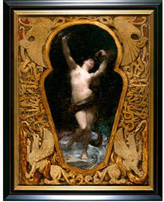
Fig. 22, Victor Prouvé, Salammbô , 1881. [view image & full caption]