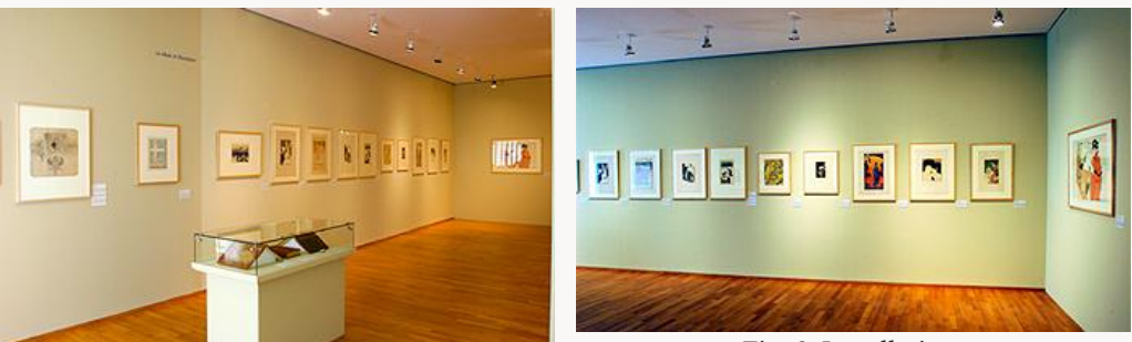
Fig. 5, Installation. [view image & full caption]