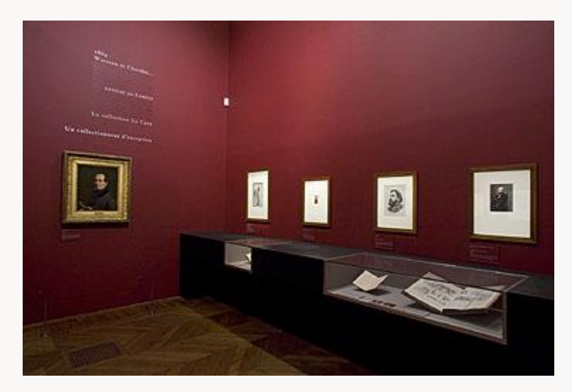
Fig. 2, Installation view of the La Caze exhibition at the Louvre, Paris. [return to text]

Fig. 1, Installation view of the La Caze exhibition at the Louvre, Paris. [return to text]