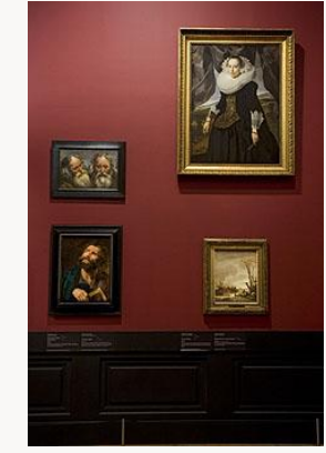
Fig. 16, Installation view of the La Caze exhibition at the Louvre, Paris. [view image & full caption]