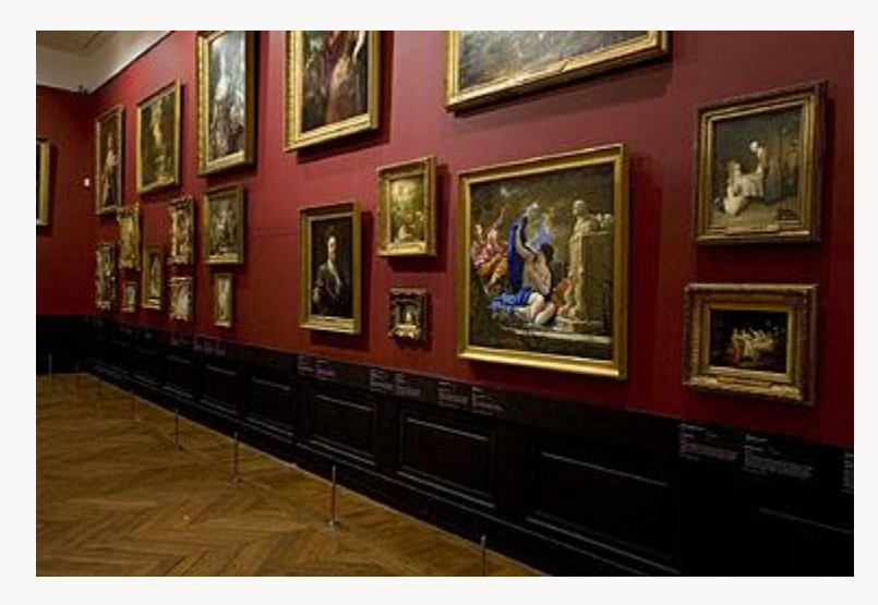
Fig. 9, Installation view of the La Caze exhibition at the Louvre, Paris. [return to text]