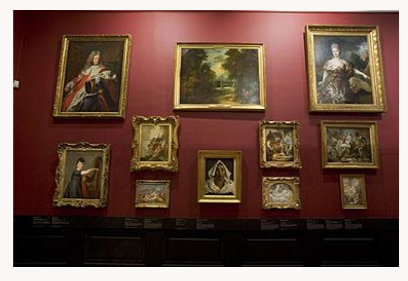
Fig. 11, Installation view of the La Caze exhibition at the Louvre, Paris. [return to text]