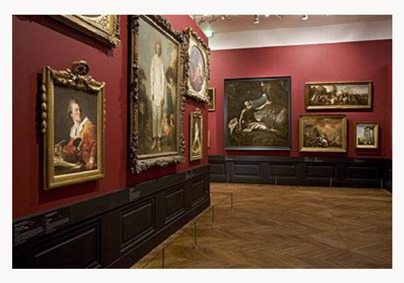
Fig. 8, Installation view of the La Caze exhibition at the Louvre, Paris. [return to text]