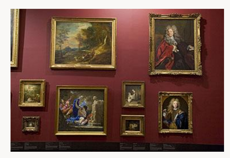
Fig. 12, Installation view of the La Caze exhibition at the Louvre, Paris. [return to text]