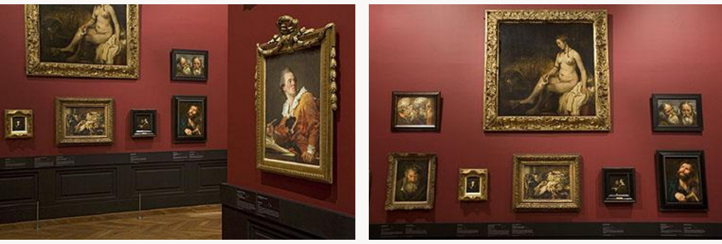
Fig. 13, Installation view of the La Caze exhibition at the Louvre, Paris. [view image & full caption]