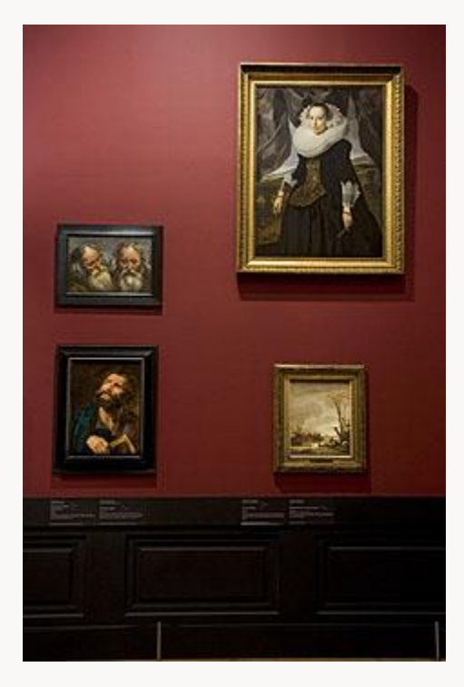
Fig. 16, Installation view of the La Caze exhibition at the Louvre, Paris. [return to text]