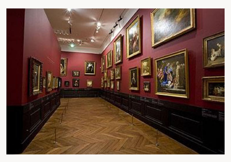
Fig. 5, Installation view of the La Caze exhibition at the Louvre, Paris. [return to text]