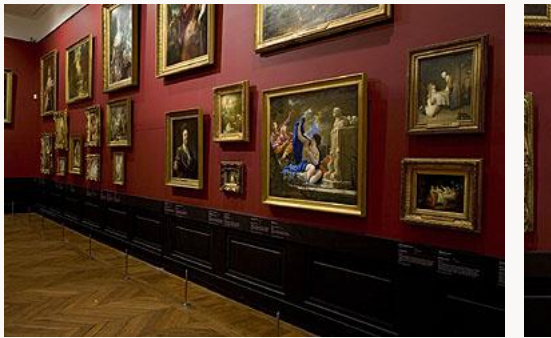
Fig. 9, Installation view of the La Caze exhibition at the Louvre, Paris. [view image & full caption]