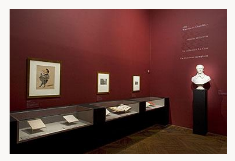
Fig. 3, Installation view of the La Caze exhibition at the Louvre, Paris. [return to text]