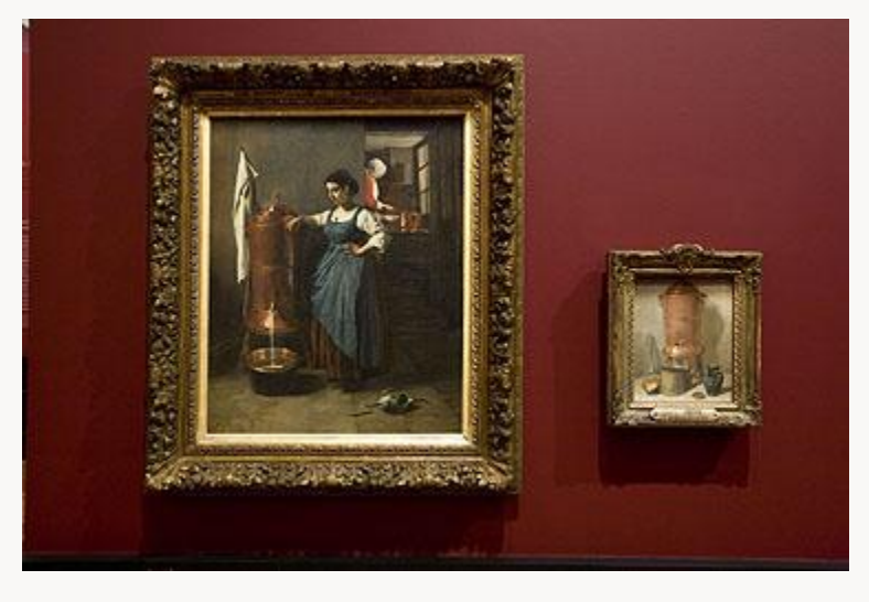
Fig. 21, Installation view of the La Caze exhibition at the Louvre, Paris. [return to text]

Fig. 20, Installation view of the La Caze exhibition at the Louvre, Paris. [return to text]