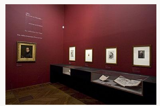
Fig. 2, Installation view of the La Caze exhibition at the Louvre, Paris. [view image & full caption]