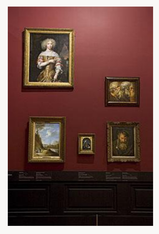
Fig. 15, Installation view of the La Caze exhibition at the Louvre, Paris. [return to text]