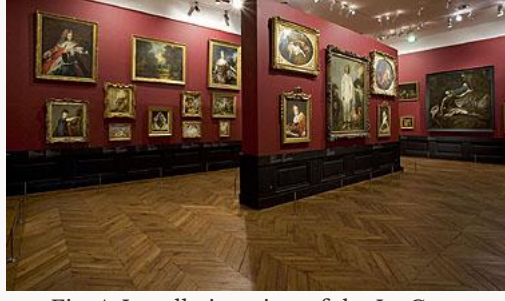
Fig. 4, Installation view of the La Caze exhibition at the Louvre, Paris. [view image & full caption]