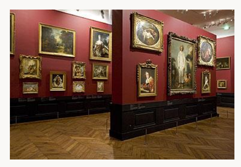
Fig. 6, Installation view of the La Caze exhibition at the Louvre, Paris. [return to text]