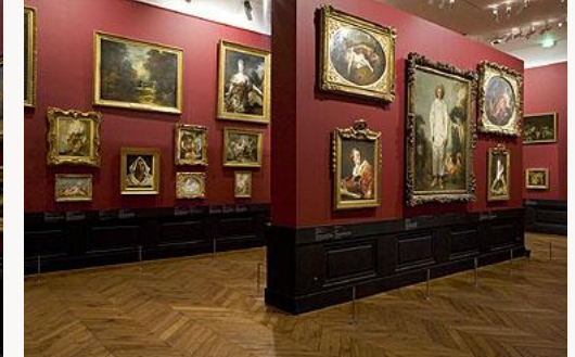
Fig. 6, Installation view of the La Caze exhibition at the Louvre, Paris. [view image & full caption]