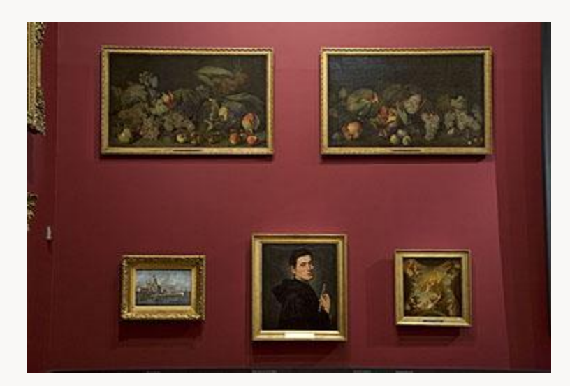
Fig. 17, Installation view of the La Caze exhibition at the Louvre, Paris. [return to text]