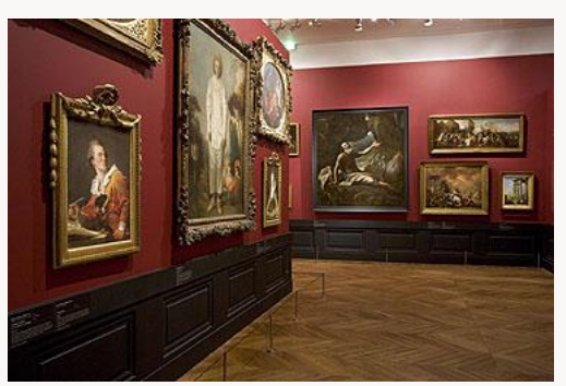
Fig. 8, Installation view of the La Caze exhibition at the Louvre, Paris. [view image & full caption]