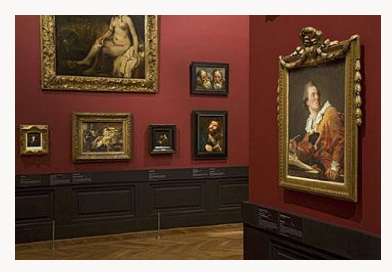
Fig. 13, Installation view of the La Caze exhibition at the Louvre, Paris. [return to text]