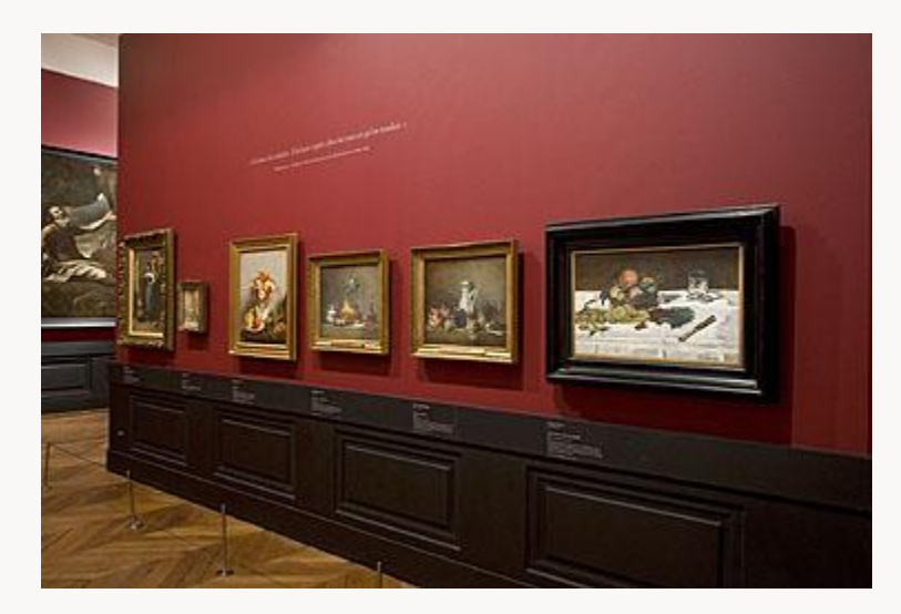
Fig. 19, Installation view of the La Caze exhibition at the Louvre, Paris. [return to text]