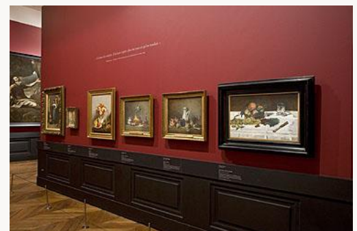
Fig. 19, Installation view of the La Caze exhibition at the Louvre, Paris. [view image & full caption]