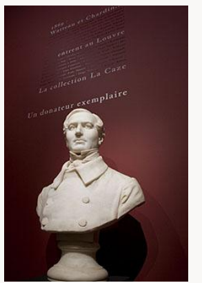
Fig. 1, Installation view of the La Caze exhibition at the Louvre, Paris. [view image & full caption]

When La Caze bequeathed his works to the Louvre and France's provincial museums, he offered a collection of 583 works, 275 of which remained at the Louvre and meant not only that French eighteenth-century painting was finally well represented at the country's leading museum, but that the national collection was significantly enriched with important Dutch, Flemish, Spanish, and Italian works. The estimated value of La Caze's donation in 1869 was 1.5 to 2 million francs, although Sophie Eloy suggests this figure was low. La Caze never married and, like Lord Hertford, referred to his paintings as his children. The breadth and quality of Lacaze's donation to the Louvre, along with the prizes he established at the École de Médicine de Paris and the Academy of Science, are the fruits of his life and demonstrate the passion, intelligence and generosity of one of the preeminent philanthropists in French history (figs. 1-21 for images of the exhibition installation).