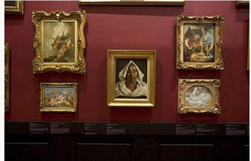
Fig. 10, Installation view of the La Caze exhibition at the Louvre, Paris. [view image & full caption]