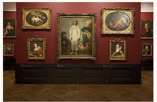
Fig. 7, Installation view of the La Caze exhibition at the Louvre, Paris. [view image & full caption]