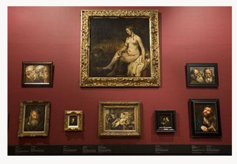
Fig. 14, Installation view of the La Caze exhibition at the Louvre, Paris. [return to text]