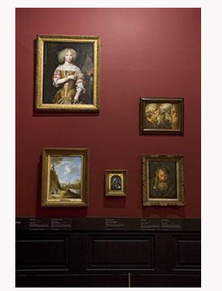
Fig. 15, Installation view of the La Caze exhibition at the Louvre, Paris. [view image & full caption]