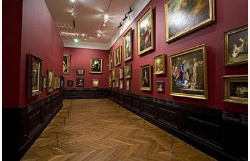
Fig. 5, Installation view of the La Caze exhibition at the Louvre, Paris. [view image & full caption]