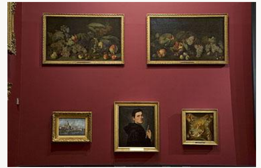
Fig. 17, Installation view of the La Caze exhibition at the Louvre, Paris. [view image & full caption]