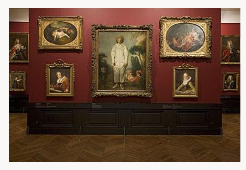
Fig. 7, Installation view of the La Caze exhibition at the Louvre, Paris. [return to text]