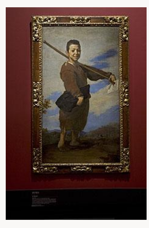
Fig. 18, Installation view of the La Caze exhibition at the Louvre, Paris. [return to text]