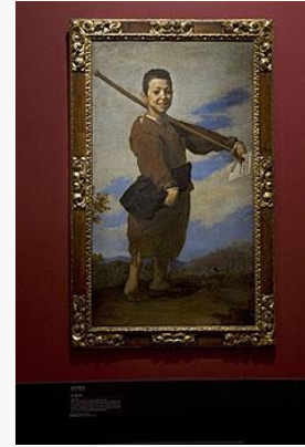
Fig. 18, Installation view of the La Caze exhibition at the Louvre, Paris. [view image & full caption]