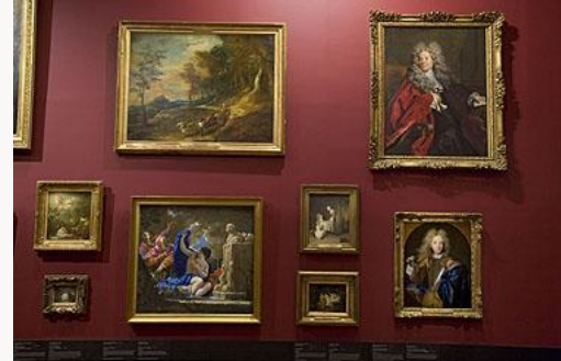
Fig. 12, Installation view of the La Caze exhibition at the Louvre, Paris. [view image & full caption]