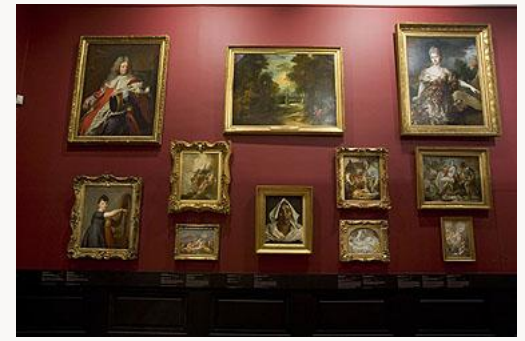
Fig. 11, Installation view of the La Caze exhibition at the Louvre, Paris. [view image & full caption]