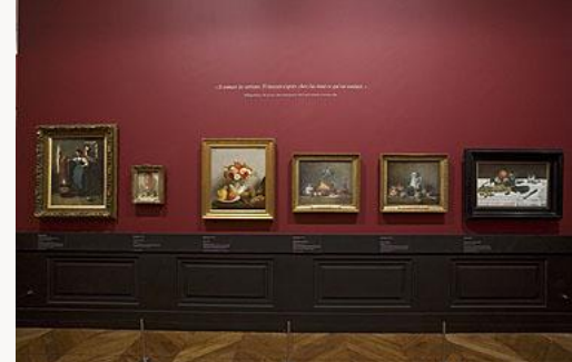
Fig. 20, Installation view of the La Caze exhibition at the Louvre, Paris. [view image & full caption]