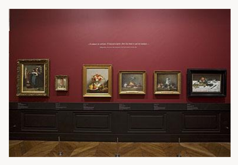
Fig. 20, Installation view of the La Caze exhibition at the Louvre, Paris. [return to text]