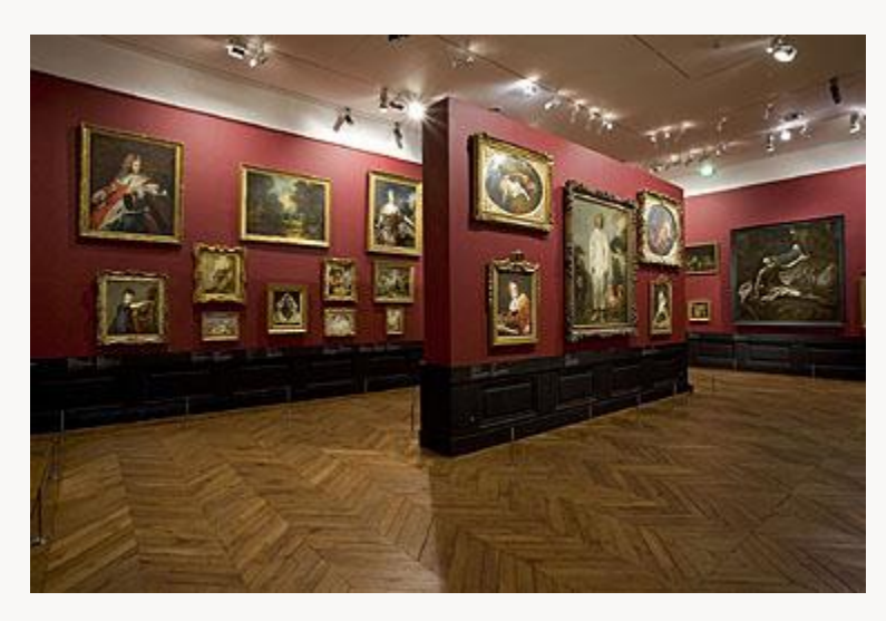
Fig. 4, Installation view of the La Caze exhibition at the Louvre, Paris. [return to text]