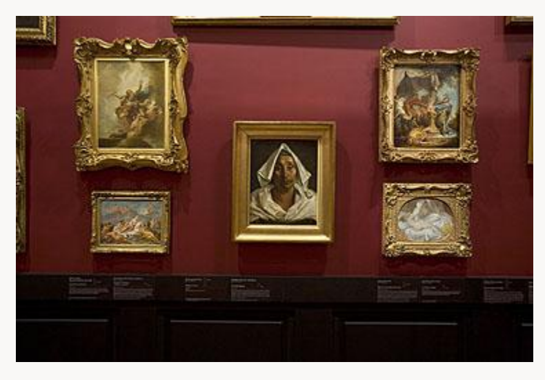
Fig. 10, Installation view of the La Caze exhibition at the Louvre, Paris. [return to text]