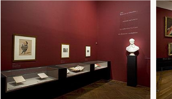
Fig. 3, Installation view of the La Caze exhibition at the Louvre, Paris. [view image & full caption]