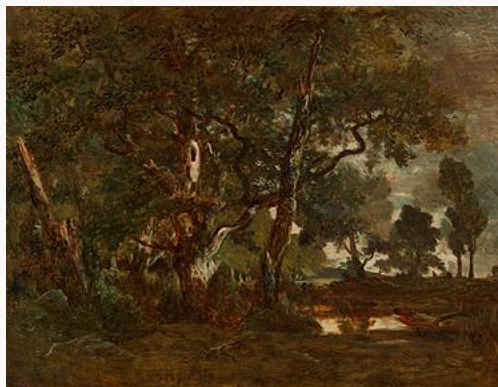
Fig. 1, Théodore Rousseau, Forest of Fontainebleau, Cluster of Tall Trees Overlooking the Plain of Clair-Bois at the Edge of Bas-Bréau , c.1849-55. Oil on canvas. Los Angeles, J. Paul Getty Museum. [larger image]