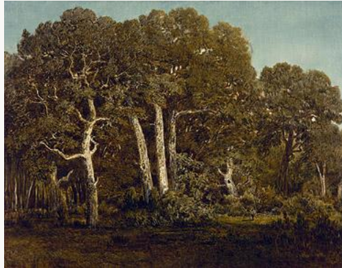
Fig. 2, Théodore Rousseau, Great Oaks of Old Bas-Bréau , 1864. Oil on canvas. Houston, Museum of Fine Arts. [larger image]

preparatory and finished work so clearly articulated by Valenciennes in the early 19th century?[5] Green defines this new kind of public painting: