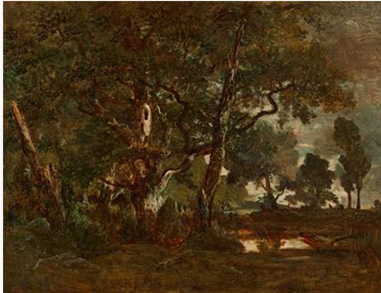
Fig. 1, Théodore Rousseau, Forest of Fontainebleau, Cluster of Tall Trees Overlooking the Plain of Clair-Bois at the Edge of Bas-Bréau , c.1849-55. Oil on canvas. Los Angeles, J. Paul Getty Museum. [return to text]